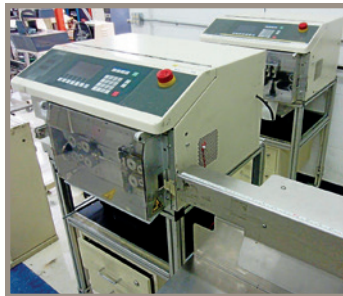
(2) SCHLEUNIGER PS9500 POWERSTRIP MACHINES