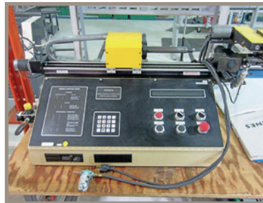
PINES CNC 10 COAXIAL CABLE BENDER