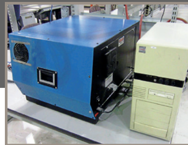
CABLETEST MPT5000 TESTER