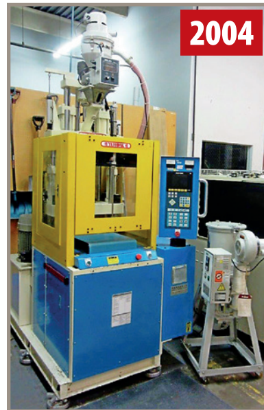
(1 OF 2) YUH-DAK 30 TON VERTICAL INJECTION MOLDERS

Sale Closing Date: Wednesday, November 20, 2013 at 12:00 Noon MST Inspection: Tuesday, November 19, 2013 From 9:00 AM to 4:00 PM MST Location: 2015 32nd Avenue, Unit 22, Calgary, Alberta T2E 6Z3