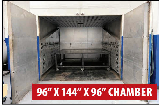
GRIEVE WRC8128-500 DOUBLE DOOR OVEN

GRIEVE NO 343 OVEN , s/n 313254, w/ 36"x 48"x 36" Chamber, 36 Cu. Ft. Volume, 400 deg. F