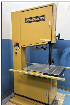
POWERMATIC 2415-3 VERTICAL BANDSAW