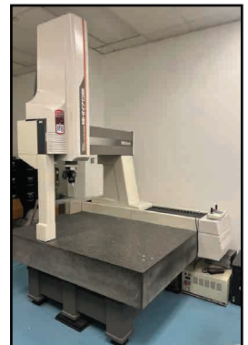
MITUTOYO BHN706 CMM