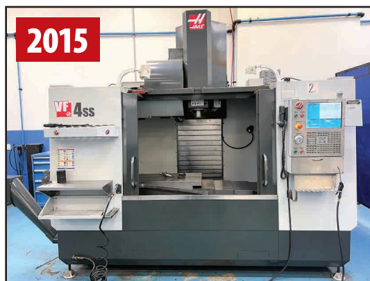
HAAS VF-4SS VERTICAL MACHINING CENTER

ALSO: Large Selection of Tool Room Related Support Assets Including CAT 40 Tool Holders, KURT Vises, Vacuum Plates, Angle Plates, Machine Attachments, Perishable Tooling, Etc.