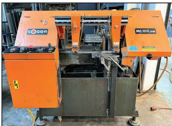
COSEN MH-1016 JAM HORIZONTAL BANDSAW