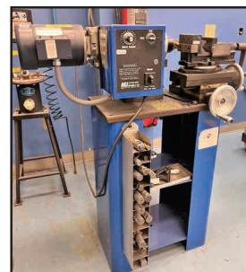
MITTLER BROS. 400-VSADJ TUBE NOTCHER