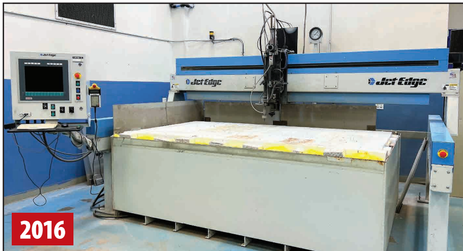
JET EDGE 5X8 MR CNC WATERJET CUTTING MACHINE