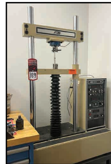
APPLIED TEST SYSTEMS SERIES 910 TENSILE TESTER