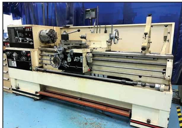
JET GH-1660ZX GAP BED ENGINE LATHE