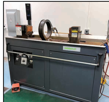
MAGNAFLUX AD-945 PARTICLE INSPECTION MACHINE

ALSO: Verniers, Micrometers, Gage Blocks, Pin Gages, Depth Gages, Hardness Testers, Calipers, Height Gages, Granite Surface Plates, Etc.