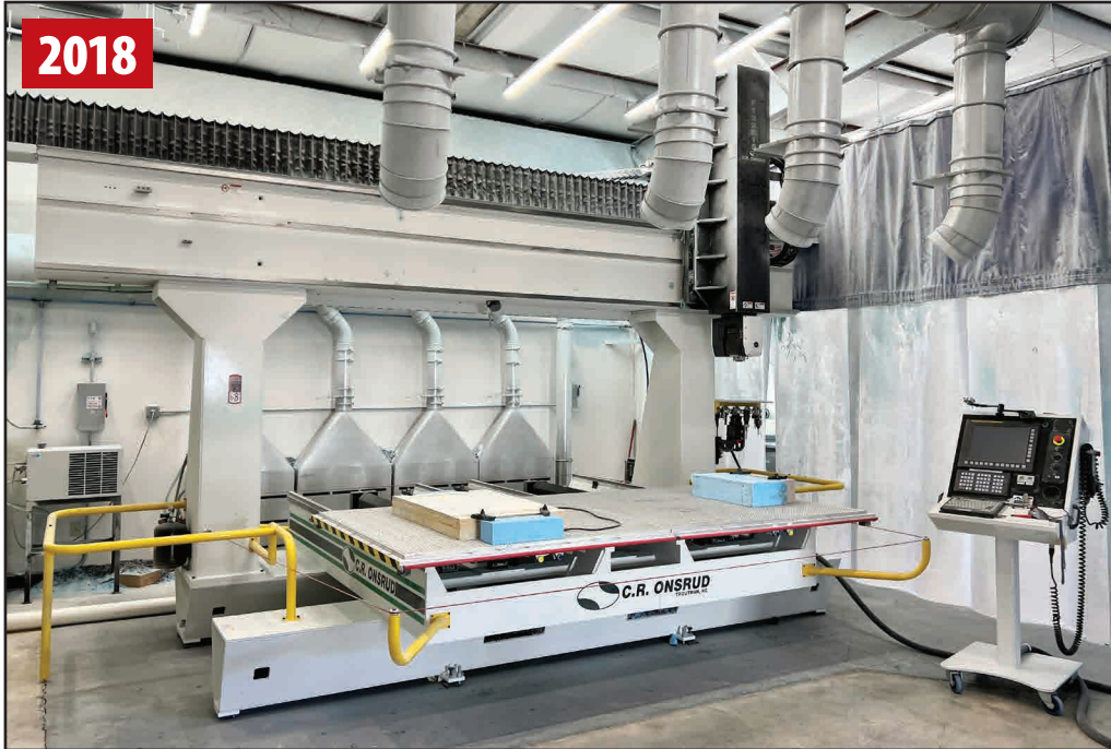
ONSRUD F122E15 5-AXIS CNC ROUTER