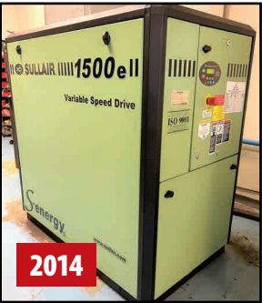
SULLAIR 1500E II 22 HP VARIABLE SPEED AIR COMPRESSOR