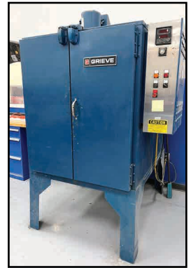
GRIEVE NO 343 OVEN