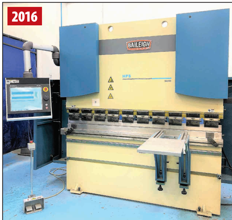
BAILEIGH HPS 50/20 CNC HYDRAULIC PRESS BRAKE

JET GH-1660ZX GAP BED ENGINE LATHE , s/n 9080001, w/ NEWALL DP700 2 Axis DRO, 16" Swing, 60" Between Centers, 10" 6-Jaw Chuck, Quick Change Tol Post, Tailstock, Steady Rest, 25-1800 RPM