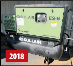
SULLAIR ES6 10 HP AIR SYSTEM