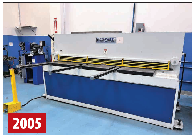
BIRMINGHAM H-0645 HYDRAULIC SQUARING SHEAR