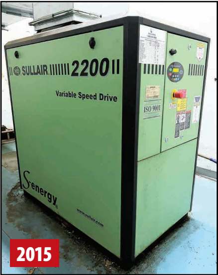
SULLAIR 2200 II 34 HP VARIABLE SPEED AIR COMPRESSOR