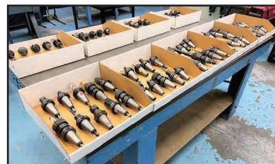
CAT 40 TOOL HOLDERS