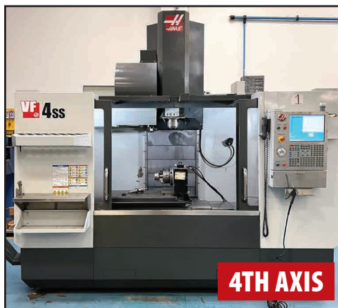
HAAS VF-4SS VERTICAL MACHINING CENTER