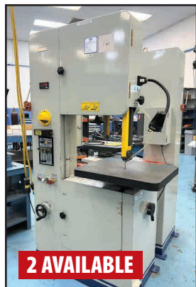
PRO CUT RF66KV50 VERTICAL BANDSAW