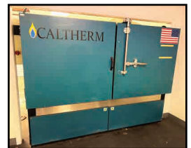
CALTHERM DOUBLE DOOR OVEN