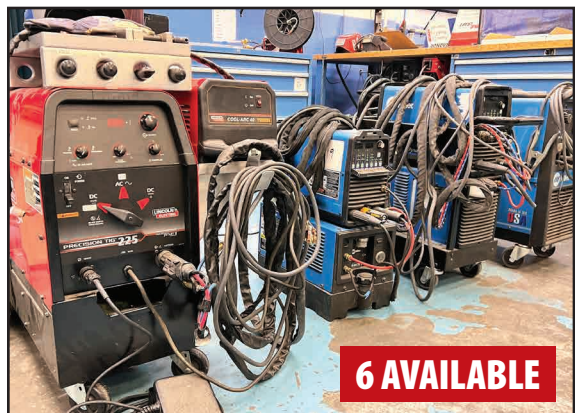
MILLER & LINCOLN TIG & MIG WELDERS