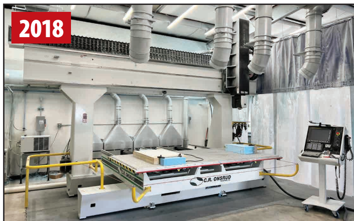
ONSRUD F122E15 5 AXIS CNC ROUTER

2018 ONSRUD F122E15 5-AXIS CNC ROUTER , s/n 122C181101, w/ FANUC SERIES 31i Model 5B Control, 120"x60" Vacuum Table, Travels: X-82", Y-186", Z-41", 15 hp Spindle, 24,000 RPM, HSK 63F, 12-ATC, DEKKER Vacuum System, CAMFIL GS8 Dust Collector, STINGER Explosion Isolation Valve (Dust Collector Offered Separately)