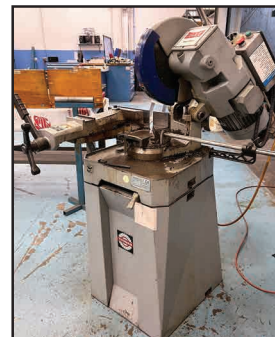
DAKE 350 MITERING COLD SAW