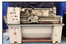
MSC 951735 GAP BED TOOL ROOM LATHE