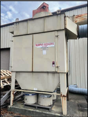
MURPHY ROGERS MRWS-24CT 12X2-4D DUST COLLECTOR