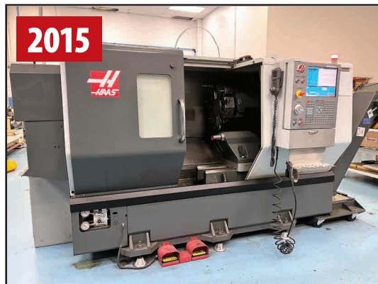
HAAS ST-20 TURNING CENTER