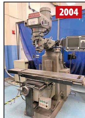
KING RICH KPV2000 MILLING MACHINE

ALSO: Shotblast Cabinets, Disc & Belt Sanders, Oscillating Spindle Sander, Drill Presses, Arbor Presses, Etc.