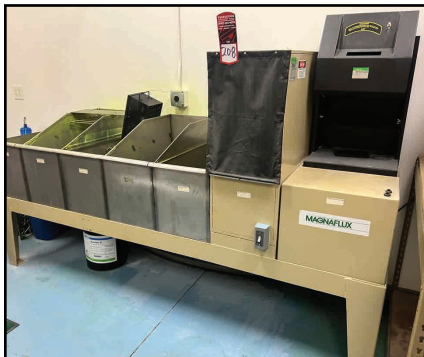
MAGNAFLUX ZYGLO ZD-37 FLUORESCENT PENETRANT INSPECTION SYSTEM