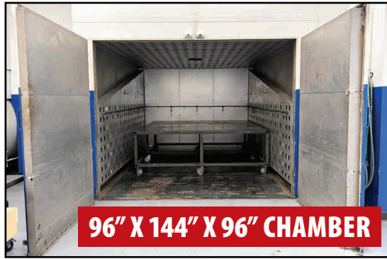
GRIEVE WRC8128-500 DOUBLE DOOR OVEN

GRIEVE NO 343 OVEN , s/n 313254, w/ 36"x 48"x 36" Chamber, 36 Cu. Ft. Volume, 400 deg. F