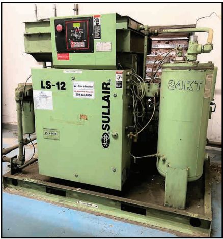
SULLAIR LS12 60 HP AIR COMPRESSOR

ALSO: LISTA & KENNEDY Modular Cabinets and Work Benches, Rolling Tool Chests, Tool Boxes, Gang Boxes, Steel Layout Tables, Welding Tables, Safety Storage Cabinets, Retractable Hose Reels, Pneumatic & Electric Power Tools, Hand Tools, Safety Ladders, Dumping Hoppers, Pallet Racking, Metal Shelving, Large Selection of Consumables Including Hardware, Electrical, Plumbing & Mechanical, Lockers