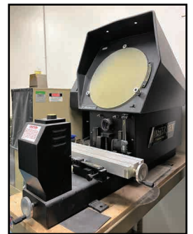
SUBURBAN TOOL MV-14 OPTICAL COMPARATOR