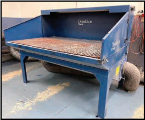
DONALDSON TORIT RBD-3000 DOWNDRAFT TABLE