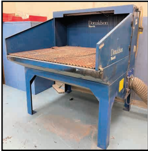
DONALDSON TORIT RBD-2000 DOWNDRAFT TABLE