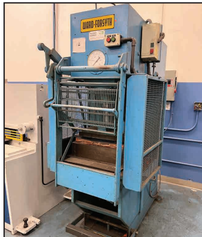
WARD-FORSYTH VO50 50 TO HYDRAULIC PRESS