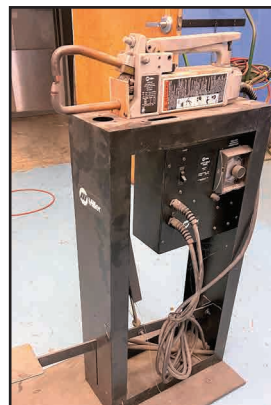
MILLER MSW-41T PORTABLE SPOT WELDER