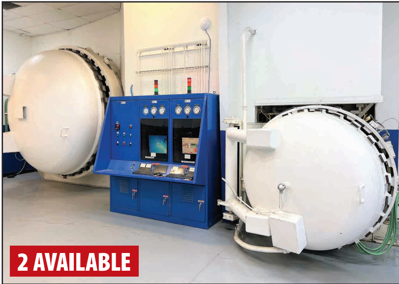
VIEW OF AUTOCLAVES

ASSETS OF THE FORMER PANOZ RACING MANUFACTURING FACILITY