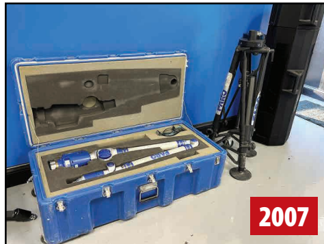
FARO PLATINUM ARM PORTABLE CMM