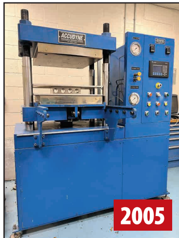
ACCUDYNE EMT-2048 HYDRAULIC HEATED PLATEN PRESS