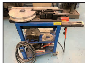
MITTLER BROS. HYDRAULIC TUBE BENDER