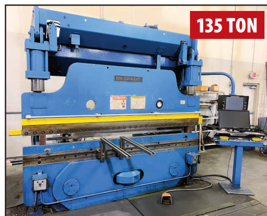
CINCINNATI 135 AS AUTOSHAPE CNC HYDRAULIC PRESS BRAKE