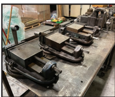
MACHINE & BENCH VISES