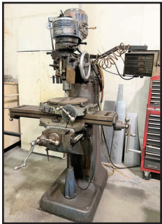
BRIDGEPORT 1 HP VERTICAL MILL