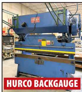
CHICAGO DREIS & KRUMP 68L PRESS BRAKE