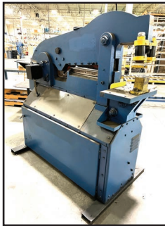
PIRANHA P3 IRONWORKER

H-FRAME PRESS , w/ DAYTON 3ZC62 12-Ton Hydraulic Jack