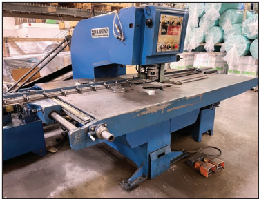
WA WHITNEY 635-A 30-TON HYD. PUNCH