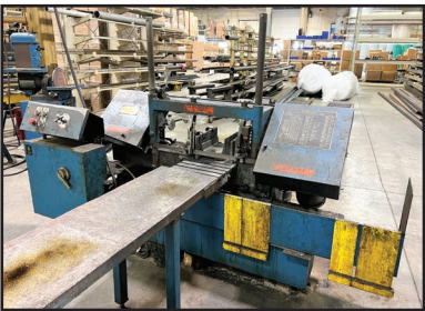
WF WELLS W-9-1 HORIZONTAL BANDSAW