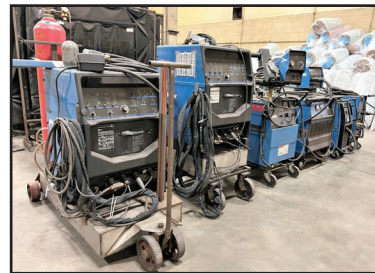
ASSORTED MILLER WELDERS