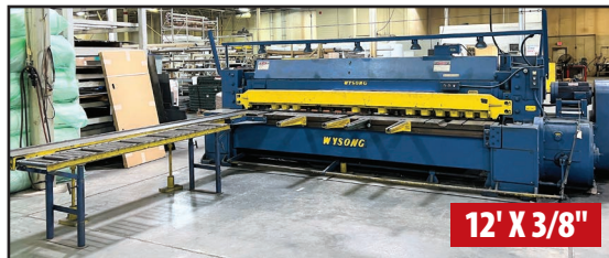
WYSONG 1238 POWER SQUARING SHEAR