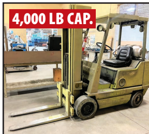
CLARK GCS25MC LP FORKLIFT

CLARK GCS25MC LP FORKLIFT , s/n C138MC-0422-6821FA, 4,000 Lb. Capacity, 3-Stage Mast, 188" Lift Height, 42" Fork Length CLARK C500-50 LP FORKLIFT , s/n 355-1156-4381, 4,500 Lb. Capacity, 3-Stage Mast, 188" Mast Height, 42" Fork Length, (Needs Brakes) ALSO: C-Clamps, Bar Clamps, Power Tools, Hand Tools, Pneumatic Tools, Steel Tables, Welding Tables, Sheet Stock, Bar Stock, Angle, Tube, Stock Racks, Shop Carts and More