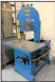
ROLL-IN EF-1459 ALL PURPOSE BANDSAW