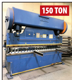
VERSION B-710-150 PRESS BRAKE

CHICAGO DREIS & KRUMP PB-10135 APRON BRAKE , s/n 120075, 120" OA, 10 Ga Capacity LARGE SELECTION OF PRESS BRAKE DIES