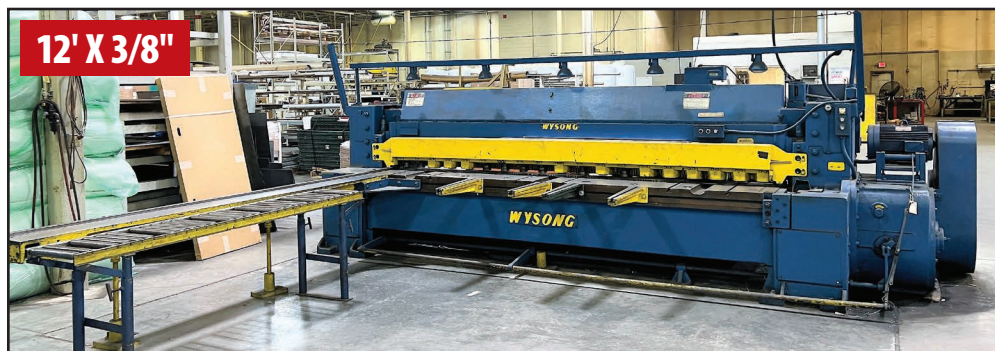
WYSONG 1238 POWER SQUARING SHEAR

BETENBENDER 4' X 1/4" HYDRAULIC SHEAR , s/n 128696, 4' Squaring Arm