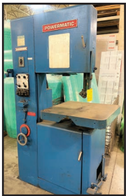
POWERMATIC VERTICAL BANDSAW