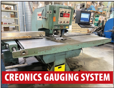
WA WHITNEY 635-A 30-TON HYD. PUNCH