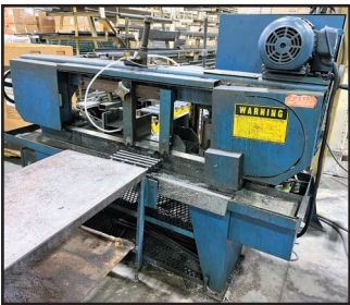
DOALL C-916 HORIZONTAL BANDSAW

POWERMATIC VERTICAL BANDSAW , s/n na, 24" x 24" Table, 20" Throat, w/ Blade Welder