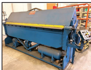
CHICAGO DREIS & KRUMP PB-10135 APRON BRAKE