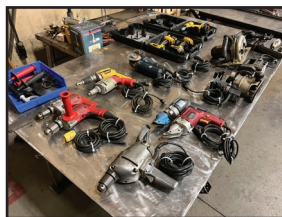
POWER & HAND TOOLS