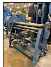
LOWN B300 INITIAL PINCH BENDING ROLL

For auction inquiries, please contact Jennifer Reiner at (847) 545-6374 or jennifer@perfectionindustrial.com