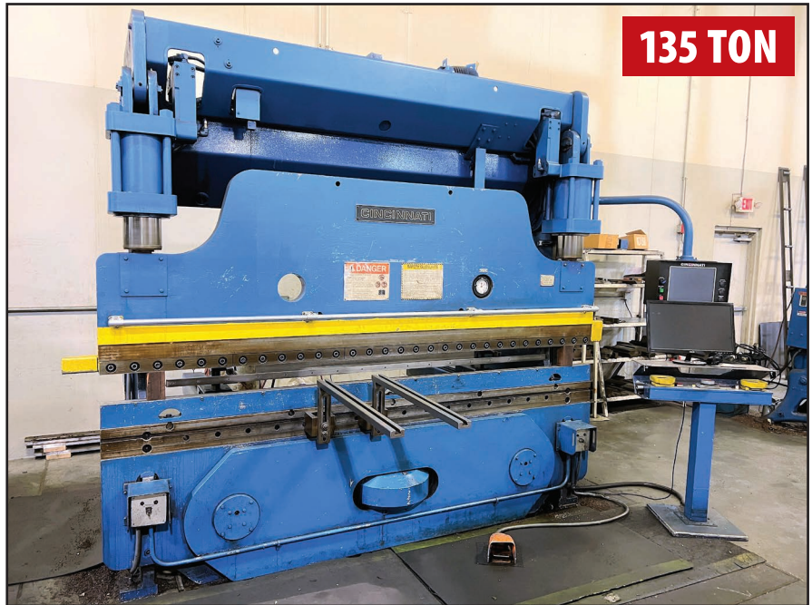
CINCINNATI 135 AS AUTOSHAPE CNC HYDRAULIC PRESS BRAKE