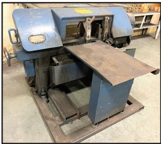
KALAMAZOO HORIZONTAL BANDSAW