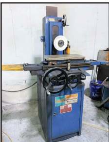
BOYAR SCHULTZ H618 SURFACE GRINDER