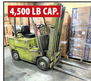
CLARK C500-50 LP FORKLIFT