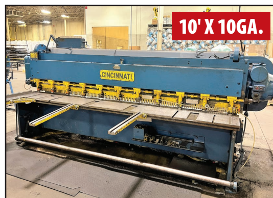
CINCINNATI 1010 SQUARING SHEAR