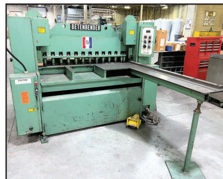
BETENBENDER 4' X 1/4" HYD. SHEAR