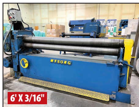
WYSONG D-72 INITIAL PINCH 3-ROLL BENDING ROLL

WYSONG 236-HR SLIP ROLL , s/n HR5-716, 22 Ga x 3' Capacity