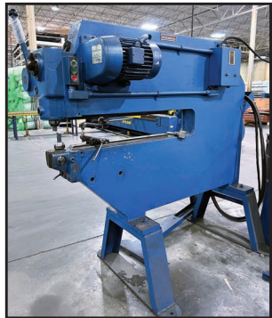
PULLMAX P-6 SHEET METAL NIBBLER