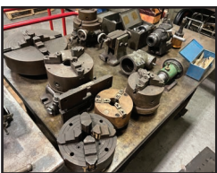
ASSORTED MACHINE CHUCKS