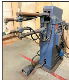
AP SEEDORFF 3466-50-F SPOT WELDER

AP SEEDORFF 3466-50-F SPOT WELDER , s/n 963, 50 KVA, 24" Throat (2) 2011/2014 MILLER SYNCROWAVE 250DX TIG WELDERS , s/n MB400312L & ME420440L MILLER DELTAWELD 300 MIG WELDER , s/n KD369140, w/ Miller 70 Series Wire Feed MILLER DELTAFAB MIG WELDER , s/n LH171213C, w/ Miller 24A Wire Feed MILLER MILLERMATIC 252 MIG WELDER , s/n MK440204N MILLER MILLERMATIC 200 MIG WELDER , s/n JJ388618 VICTOR CUTMASTER 102 PLASMA CUTTER , s/n MX1526058955 ASSORTED TORCH CARTS , w/ Hoses, Regulator and Torch