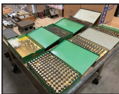
PIN GAUGE SETS