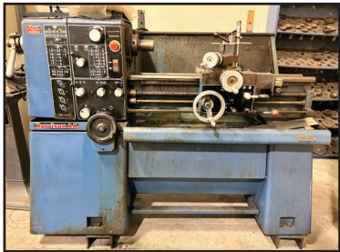
HARRISON AA 13" TOOLMAKERS LATHE