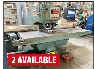
WA WHITNEY 635-A 30-TON HYD. DUPLICATOR/FABRICATOR PUNCH

FEATURING: CINCINNATI 135 AS CNC Press Brake, VERNON No. B-710-150 Press Brake, CHICAGO D&K Press Brake, BETENBENDER 4' x 1/4" Hydraulic Shear, CINCINNATI 1010 Mechanical Shear, CHICAGO D&K PB-10135 Apron Brake, WYSONG Plate Bending Roller, PIRANHA Ironworker, (2) W.A. WHITNEY 635-A Punch Presses, RYERSON PULLMAX Nibbler, MILLER Welders, Paint Line, Steel Inventory, (2) CLARK Forklifts, Plant Support Equipment and More