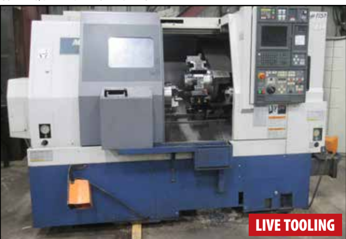
2000 MORI SEIKI SL-253BSMC/500 TURNING CENTER