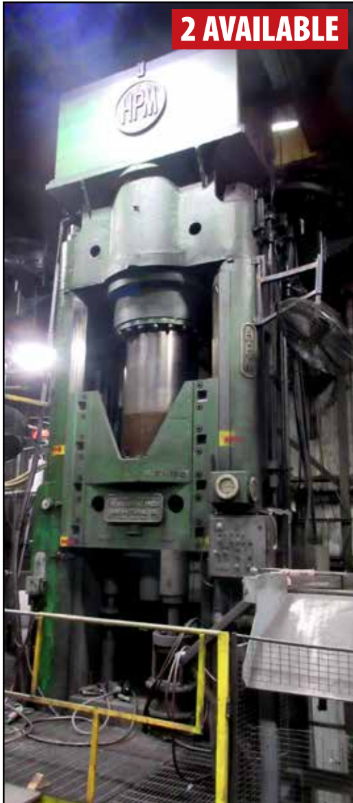
HPM 1000 TON HYDRAULIC HOT FORGING PRESS

Sale Closing From: Tuesday, February 11 at 10:00 AM ET Sale Location: 34 Belmont St, Richmond, QC J0B 2H0