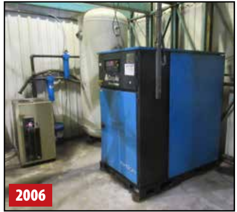
COMPAIR L55G-9A 75 HP AIR COMPRESSOR