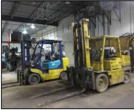
KOMATSU & CAT FORKLIFTS