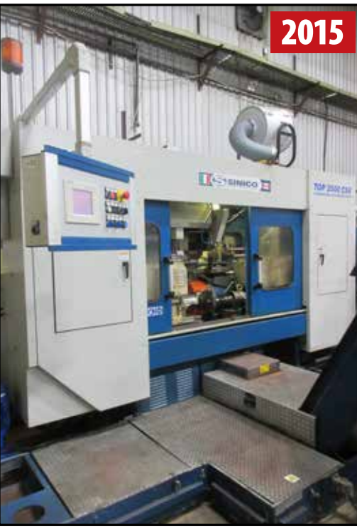
SINICO MOD TOP 2000 TYPE TR 60/4-350 CSV CNC CUTTING/BAR FND FINISHING MACHINF