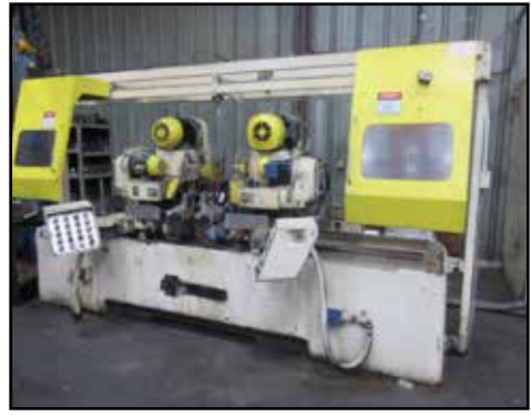
G&L FRASER MC CENTERING/FACING MILL