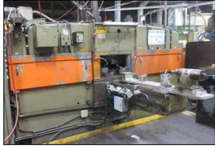
MARAND 48" SPLINE ROLLER