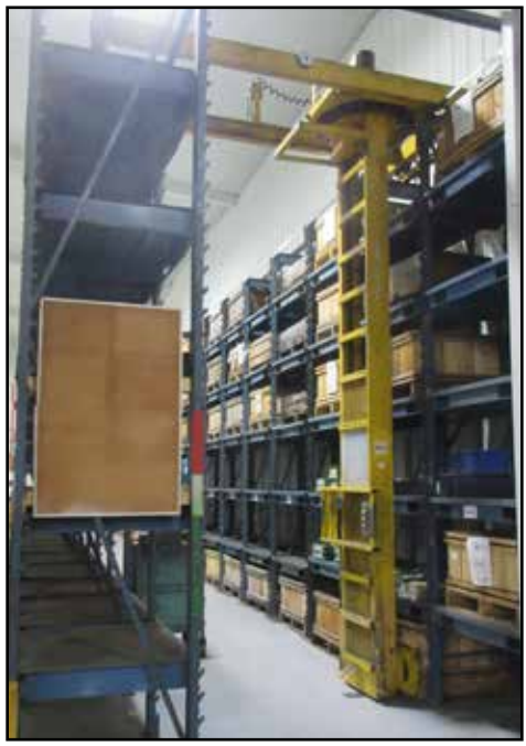
2,000 LB STORAGE/RETRIEVAL CRANE & RACKING SYSTEM

KOMATSU PG-35ST-7 7,340 LB. LPG FORKLIFT, s/n 1030564 HYSTER H60XM 5,500 LB. LPG FORKLIFT, s/n H1778496518 TOYOTA 7FB25 3600 LB. LPG FORKLIFT, s/n 25612 HYSTER H250E 25,000 LB. LPG FORKLIFT, s/n NA CAT 20,000 LB. LPG FORKLIFT