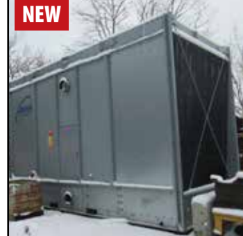
MARLEY 10020311-A1-C8403MF-10 NC COOLING TOWER - NEW, NEVER INSTALLED