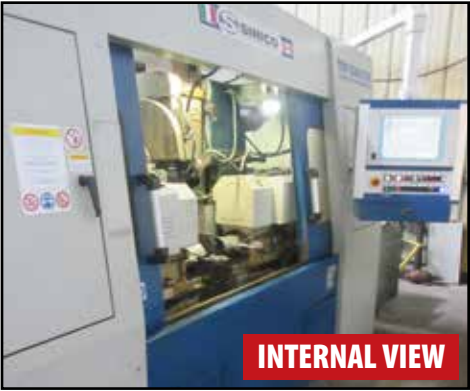
2015 SINICO TOP 2000