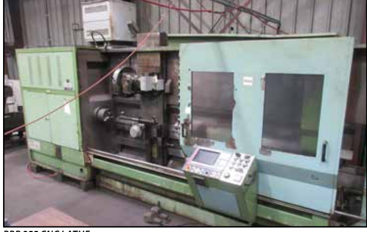
PBR 355 CNC LATHE

MORI SEIKI ZL-15 DUAL TURRET TURNING CENTER