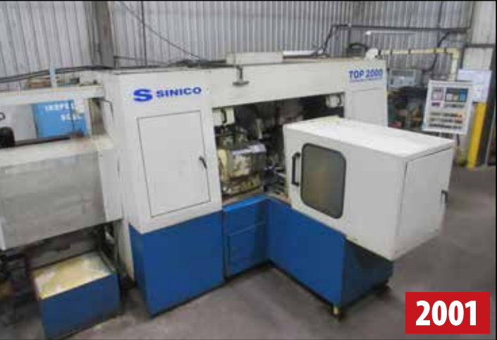
SINICO MOD TOP 2000 TYPE TR 60/4-350-1T-M AUTO CUTTING/BAR END FINISHING MACHINE