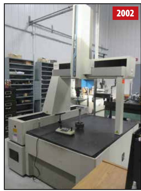
MITUTOYO BRT-A910 CMM

Auction will be conducted in Canadian (CAD) Funds.