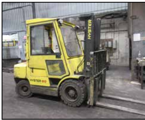
HYSTER H60XM 5,500 LB LPG FORKLIFT