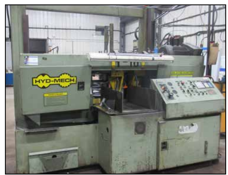
HYD-MECH H-16 AUTO-PROG BANDSAW