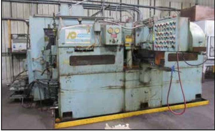
ANDERSON COOK MARAND NO 350 48" SPLINE ROLLER

ANDERSON COOK MARAND NO 350 48" SPLINE ROLLER, s/n 302 MARAND 48" SPLINE ROLLER, s/n NA (2) BARBER COLMAN 6-5 GEAR HOBBERS, s/n 197, NA (2) BARBER COLMAN 16-11 GEAR HOBBERS, s/n 185, 175 BARBER COLMAN 14-15 GEAR HOBBER FELLOWS NO. 12 GEAR SHAPER, s/n 30039 1991 REDIN DEBURRER, s/n 24E37 RED RING GEAR FINISHER BARBER COLMAN T HOBBER