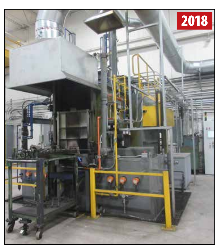
MIDLAND ROSS ALL-CASE 243624 LPG/METHANOL HEAT TREAT FURNACE