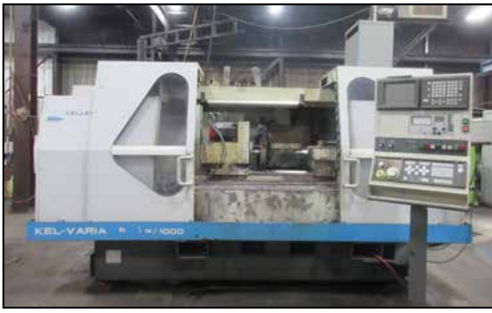
KELLENBERGER R175/1000 CNC CYLINDRICAL GRINDER

JACKMILL 10X26 CYLINDRICAL GRINDER, s/n NA