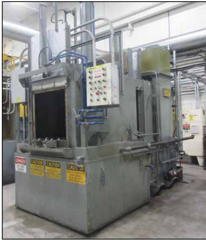
SURFACE COMBUSTION WILLIAMS PRE/POST CARBURIZING 2 STAGE WASH SYSTEM

MARLEY I00203II-A1-C8403MF-10 NC COOLING TOWER - New, Never Installed