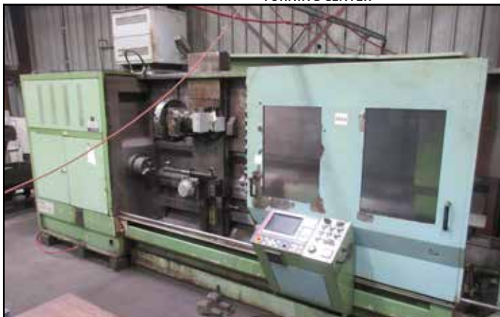
PBR 355 CNC LATHE