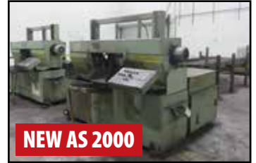
(2) HYD-MECH H-14 AUTO-PROG BANDSAWS

2001 FMB PHOENIX MITERING BANDSAW, s/n C01455