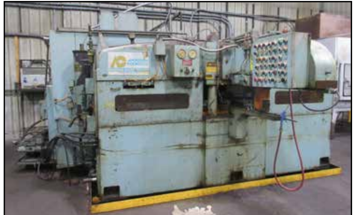
ANDERSON COOK MARAND NO 350 48" SPLINE ROLLER