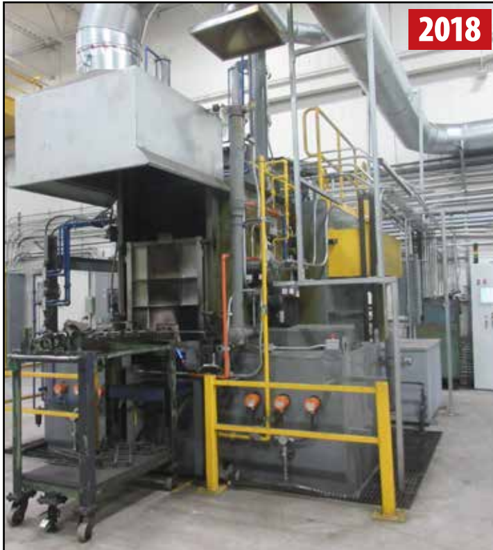
MIDLAND ROSS ALL-CASE 243624 LPG/METHANOL HEAT TREAT FURNACE