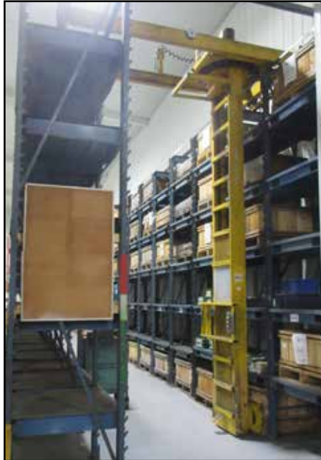
2,000 LB STORAGE/RETRIEVAL CRANE & RACKING SYSTEM