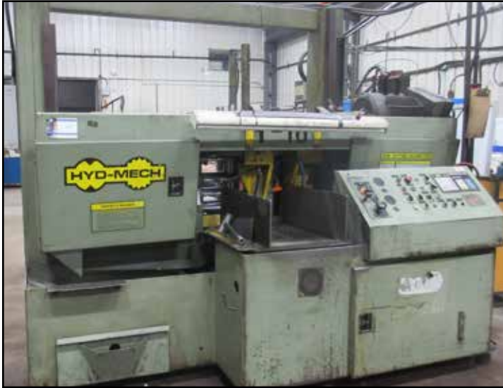
HYD-MECH H-16 AUTO-PROG BANDSAW