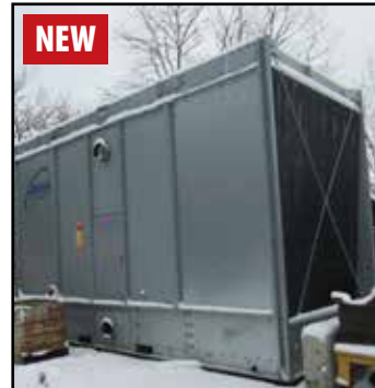
MARLEY 100203II-A1-C8403MF-10 NC COOLING TOWER - NEW, NEVER INSTALLED