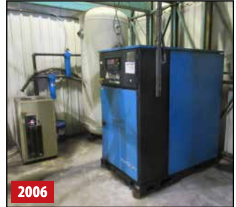
COMPAIR L55G-9A 75 HP AIR COMPRESSOR