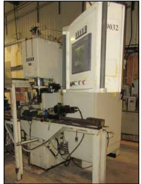
EITEL SRP-40 40 TON STRAIGHTENING PRESS