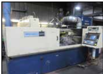
SHEFFIELD SCHAUDT STEP FORM 1030 CNC CYLINDRICAL GRINDER