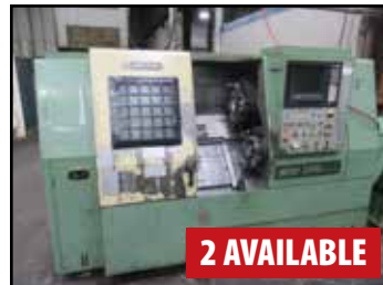
MORI SEIKI ZL-15 DUAL TURRET TURNING CENTER