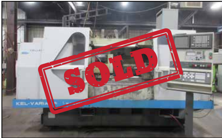
KELLENBERGER R175/1000 CNC CYLINDRICAL GRINDER

JACKMILL 10X26 CYLINDRICAL GRINDER, s/n NA