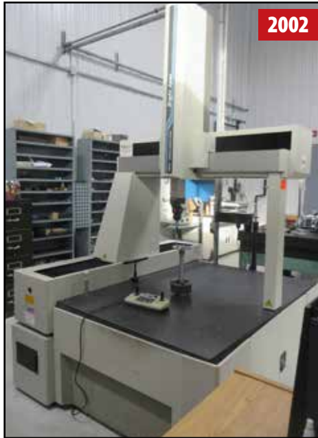
MITUTOYO BRT-A910 CMM

Rigging contact info available at: www.perfectionindustrial.com