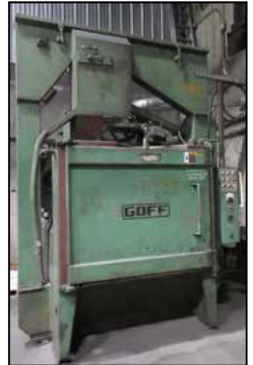
GOFF 48T8 48" SHOT BLAST MACHINE

Auction will be conducted in Canadian (CAD) Funds.