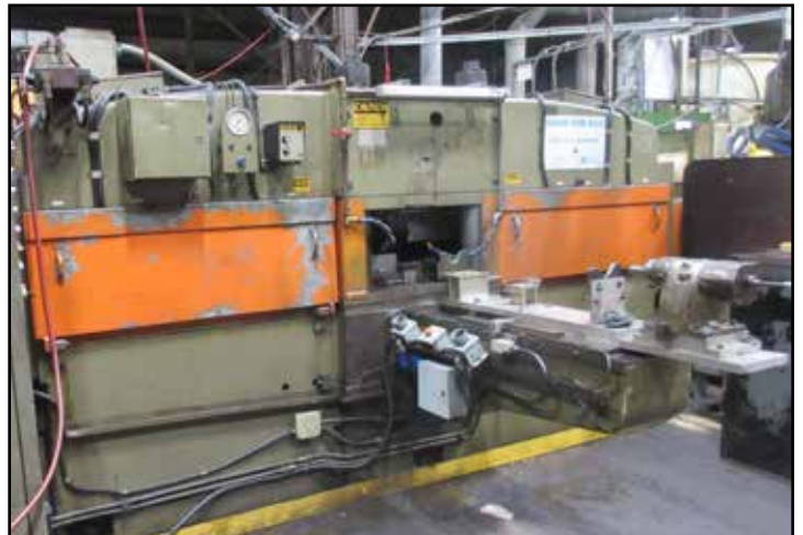
MARAND 48" SPLINE ROLLER

View our current auction schedule at www.perfectionindustrial.com