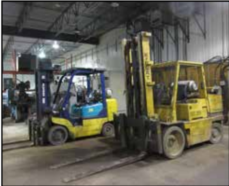
KOMATSU & CAT FORKLIFTS

Online Bidding at www.perfectionindustrial.com