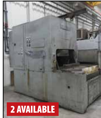
GLEASON NO 26 QUENCHING PRESSES