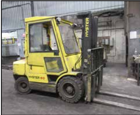
HYSTER H60XM 5,500 LB LPG FORKLIFT