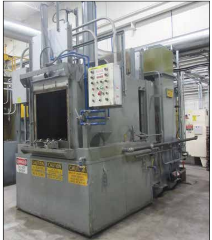
SURFACE COMBUSTION WILLIAMS PRE/POST CARBURIZING 2 STAGE WASH SYSTEM

MARLEY 100203II-A1-C8403MF-10 NC COOLING TOWER - New, Never Installed