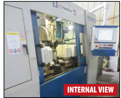
2015 SINICO TOP 2000

KINEFAC TWIN SPINDLE TURNING CENTER , s/n 1255, w/ GE Fanuc 18i-T Control