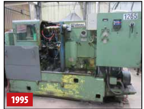
WICKMAN 1"-6S SPECIAL LONG BAR FEED BAR MACHINE