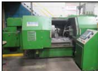
BRYANT LECTRALINE LL3 CNC INTERNAL GRINDER