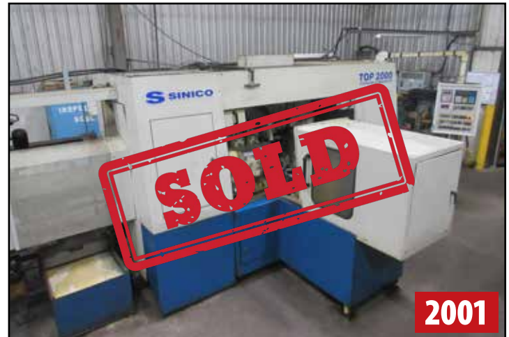
SINICO MOD TOP 2000 TYPE TR 60/4-350-1T-M AUTO CUTTING/BAR END FINISHING MACHINE