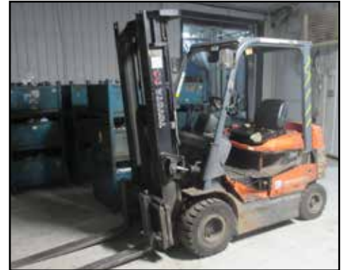
TOYOTA 7FB25 3,600 LB LPG FORKLIFT