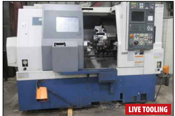
2000 MORI SEIKI SL-253BSMC/500 TURNING CENTER