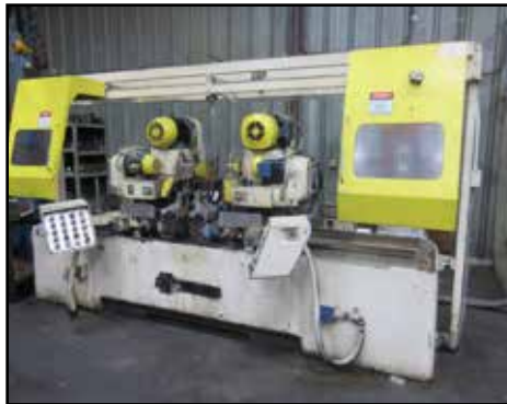
G&L FRASER MC CENTERING/FACING MILL