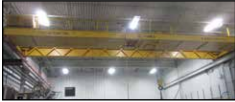
PRO-ACTION 5 TON BRIDGE CRANE