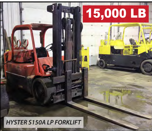
HYSTER S150A LP FORKLIFT

7,500 LB YALE L830-080-SBT-090 BOS , s/n P-319143, Side Shift, 3-Stage Mast, 89" Mast Height, 226" Lift Height, 60" Fork Length, Solid Tire