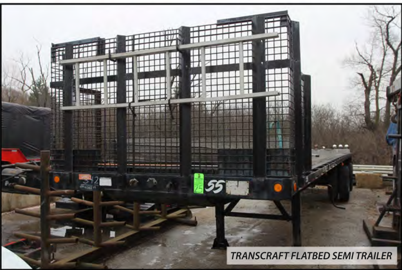
TRANSCRAFT FLATBED SEMI TRAILER

2000 PARKER/LANDOLL Enclosed Trailer , VIN 1LH317UH5Y1B11055, Dock Leveler, Winch, 119"H Inside Clearance, 37'L Lower Deck, 9'L Upper Deck, Ground Tilt Loadout