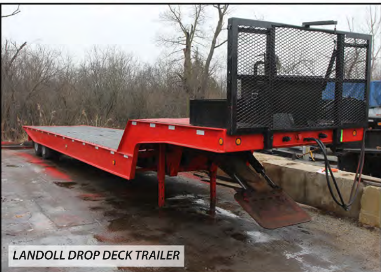
LANDOLL DROP DECK TRAILER