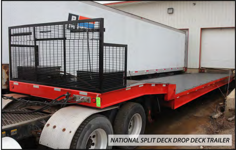
NATIONAL SPLIT DECK DROP DECK TRAILER