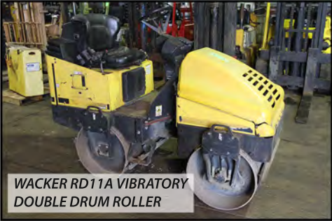
WACKER RD11A VIBRATORY DOUBLE DRUM ROLLER

Flat Bed, Drop Deck and Double Drop Trailers; Forklift Boom Attachments; Counterweights; Approx. (20) Sets of Forks; KNAACK Job Boxes; Rigging Skates, Chains and Straps; Jacks; Banding Carts; Hand Trucks; Air Compressors; Welders; Plasma Cutter; Torch Carts; Bandsaws; Shop Presses; Grinders; Power and Hand Tools; Battery Chargers; Storage Trailers; Gas and Poly Tanks; and more