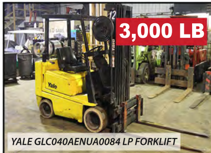
YALE GLC040AENUA0084 LP FORKLIFT

4,500 LB CLARK C500 Y50 LP Forklift , s/n Y3553964323, 2-Stage Mast, 85" Mast Height, 124" Lift Height, 41" Fork Length, Solid Tire, Forklift #12