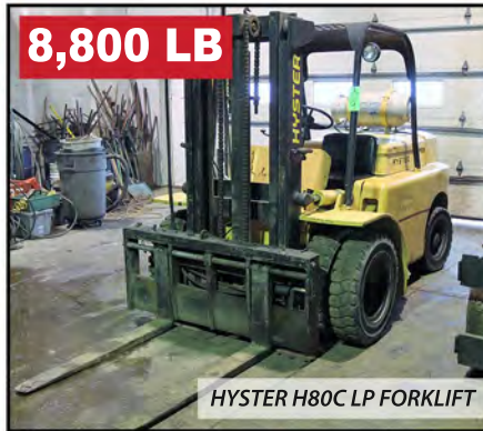
HYSTER H80C LP FORKLIFT