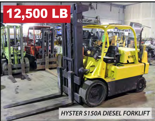
HYSTER S150A DIESEL FORKLIFT