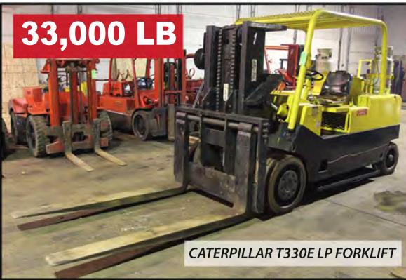
CATERPILLAR T330E LP FORKLIFT