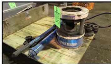
< DURA-KRIMP K20 HYDRAULIC CRIMPING TOOL

Online Bidding at www.perfectionindustrial.com