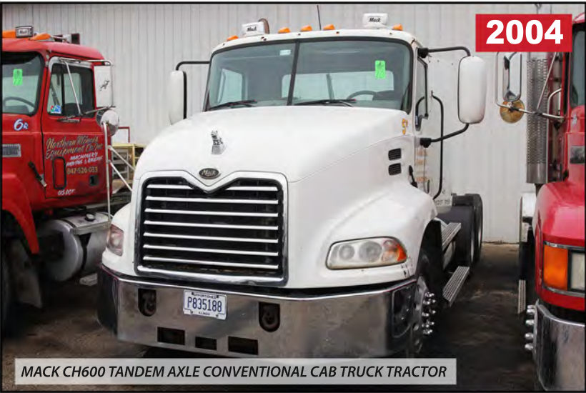
MACK CH600 TANDEM AXLE CONVENTIONAL CAB TRUCK TRACTOR

WACKER RD11A Vibratory Double Drum Roller , s/n 5325979, (2) 36"W Drum