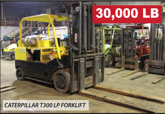
CATERPILLAR T300 LP FORKLIFT