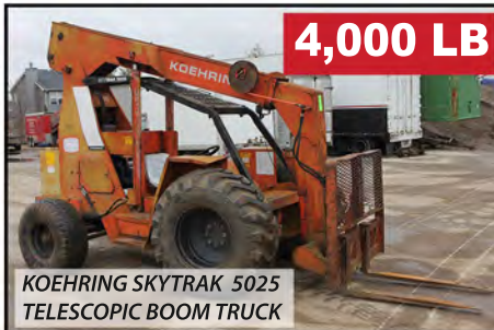
KOEHRING SKYTRAK 5025 TELESCOPIC BOOM TRUCK