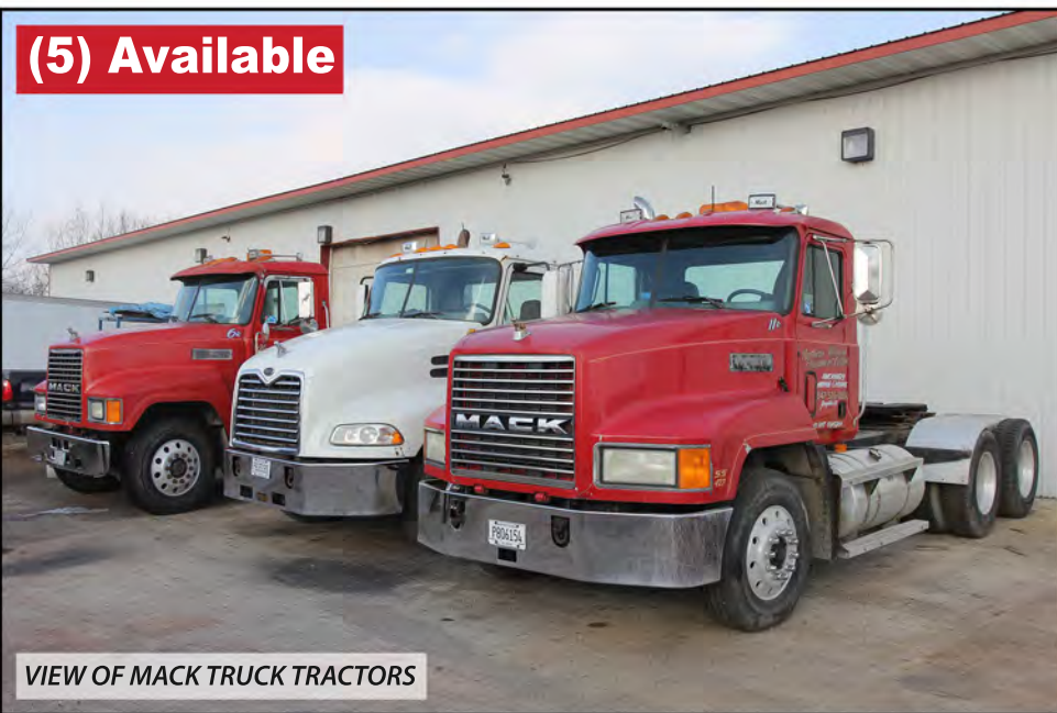
VIEW OF MACK TRUCK TRACTORS

(17) TAYLOR, CATERPILLAR, HYSTER, YALE, CLARK & CROWN LP AND DIESEL FORKLIFTS; (5) MACK TRUCK TRACTORS; ENCLOSED, DROP DECK, DOUBLE DROP & FLAT BED TRAILERS; SKID STEER; TELEHANDLER; FORKLIFT ATTACHMENTS; RIGGING EQUIPMENT; JOB BOXES; WELDERS; SAWS & MORE