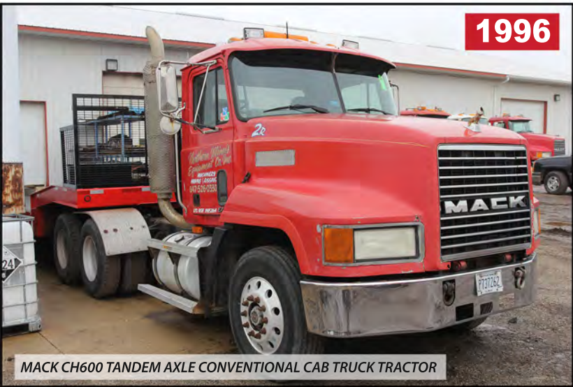
MACK CH600 TANDEM AXLE CONVENTIONAL CAB TRUCK TRACTOR