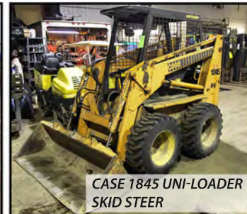
CASE 1845 UNI-LOADER SKID STEER

Sale Closing From: Thursday, March 2, 2017, 1PM CT