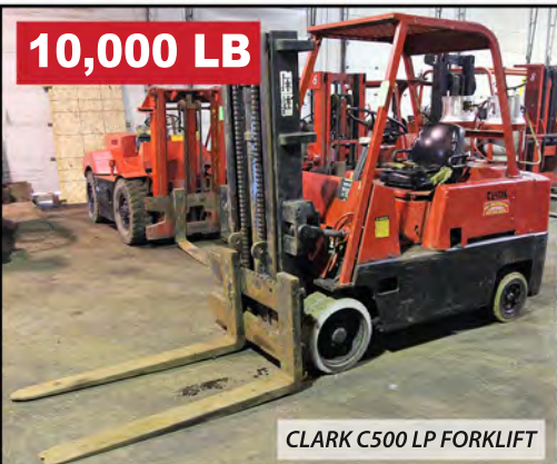
CLARK C500 LP FORKLIFT