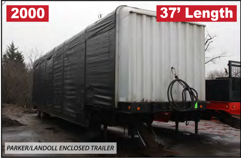
PARKER/LANDOLL ENCLOSED TRAILER