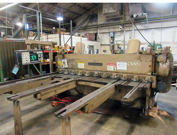
CINCINNATI 1/4" X 10' MECHANICAL SQUARING SHEAR

To discuss your requirements for an auction, please call Perfection Industrial 847.427.3333