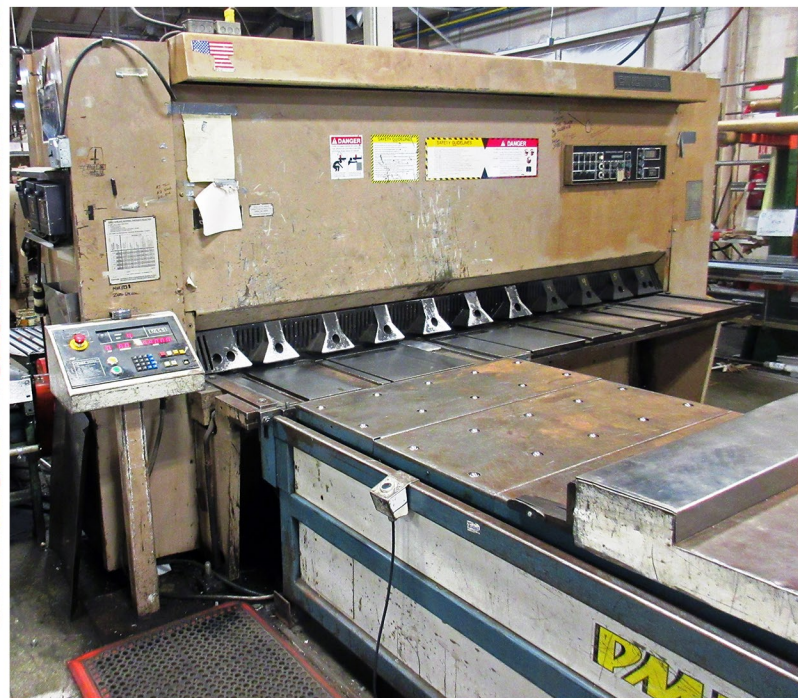
CINCINNATI 3/8" X 10' HYDRAULIC SQUARING SHEAR