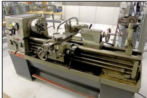
CLAUSING COLCHESTER 15" MARK II TOOL ROOM LATHE