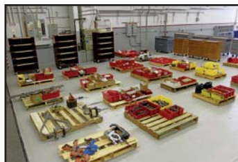
VIEW OF SHOP TOOLS