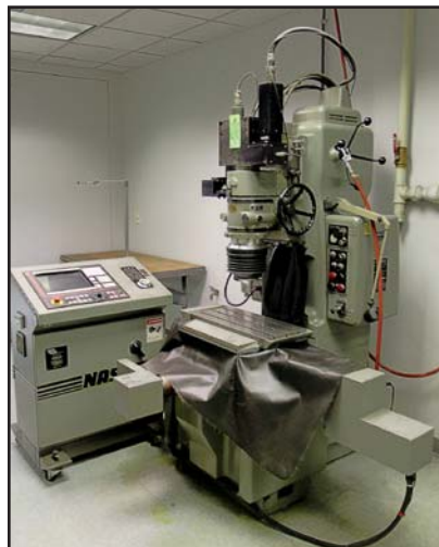
MOORE NO. 2 CNC JIG GRINDER