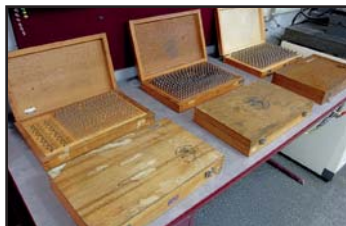
VIEW OF PLUG GAUGES