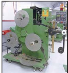
ACS WM300 3-REEL TAKE-UP