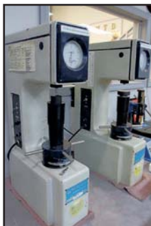
VIEW OF HARDNESS TESTERS