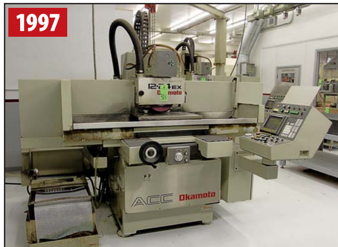
OKAMOTO ACC-1224EX AUTOMATIC SURFACE GRINDER

To discuss your requirements for an auction, please call Perfection Industrial 847.427.3333