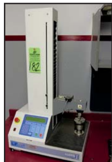
LLOYD LF PLUS UNIVERSAL TEST MACHINE