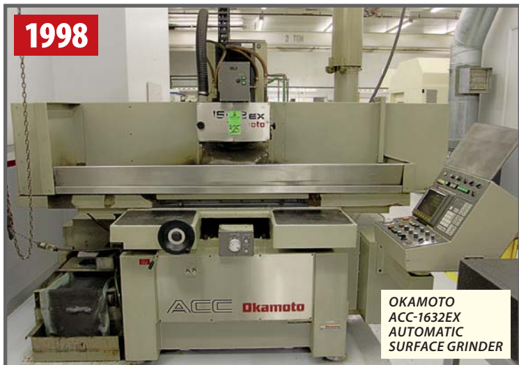
OKAMOTO ACC-1632EX AUTOMATIC SURFACE GRINDER