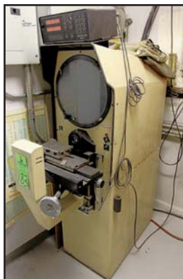
MICRO-VU 1104 OPTICAL COMPARATOR

1987 CHEVY BOX TRUCK , VIN 2BGHG31KXH4116065, Approx. 125,600 Miles, Auto. Transmission