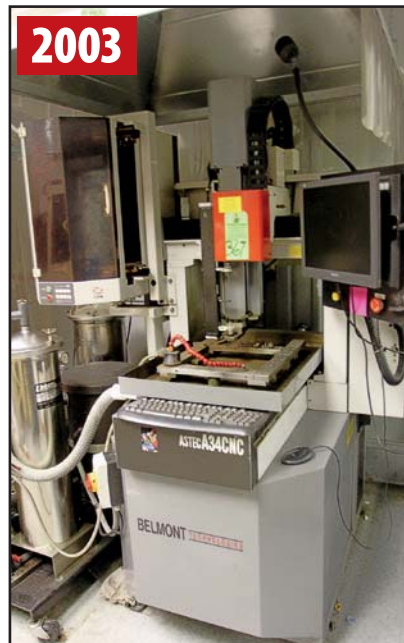
BELMONT ASTEC A34 CNC EDM DRILL

ACS WM100 SINGLE-REEL TAKE-UP (2) 88" X 58" X 124" NOISE TAMEER SOUND ENCLOSURES