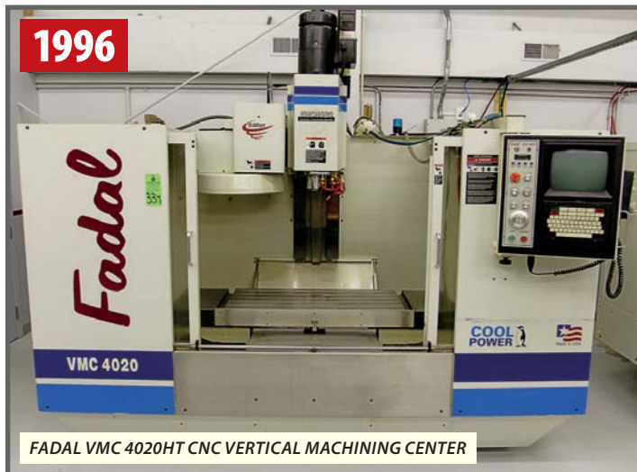
FADAL VMC 4020HT CNC VERTICAL MACHINING CENTER

Sale Date: Tuesday, July 22, 2014 at 10:00 AM EDT Location: 327 Ley Road, Fort Wayne, Indiana 46825 Inspection: Monday, July 21, 2014 from 8:00 AM to 4:00 PM EDT