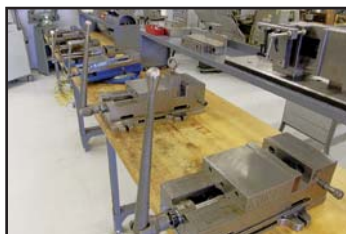
VIEW OF MACHINE VISES