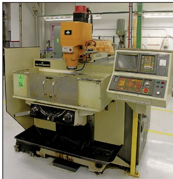
LEBLOND MAKINO RMC 55 CNC MILLING MACHINE