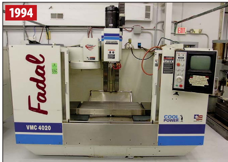
FADAL 4020HT CNC VERTICAL MACHINING CENTER