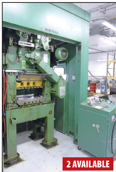
45 TON BRUDERER BSTA 40 STAMPING PRESS

Sale Date: Tuesday, July 22, 2014 10:00 AM EDT Inspection: Monday, July 21, 2014 from 8:00 AM to 4:00 PM EDT