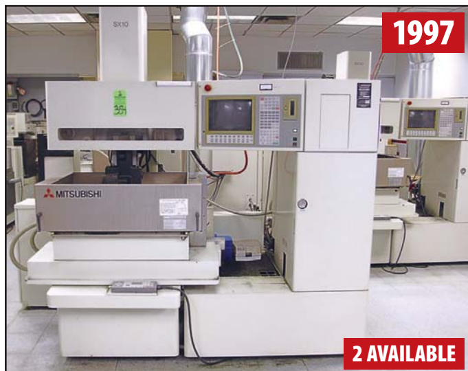
MITSUBISHI SX10 WIRE EDM