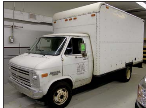
CHEVY BOX TRUCK