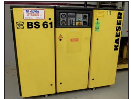
50 HP KAESER BS61 ROTARY SCREW AIR COMPRESSOR

Online Bidding Available Through BidSpotter.com