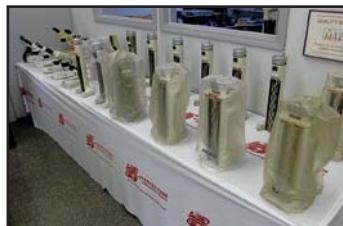
VIEW OF HEIGHT MASTERS

INSPECTION ALSO FEATURING: Large Assortment of MITUTOYO Absolute Digimatic Solar and Digital Calipers, MITUTOYO and STARRETT Micrometers, VERMONT, MEYER, and LINKS Plug and Block Gauge Sets, BROWN & SHARPE Test Dial Indicators, DELPHI and AMETEK Roughness Gauges, Hardness Testers, Large Quantity of MITUTOYO 515-319, 515-311, 515-322 and 515-534 Height Masters, FISCHER, FOWLER and AMTOS Microscopes, Large Quantity of STARRETT, RAHN, BROWN & SHARPE, Black and Pink Granite Surface Plates and More.