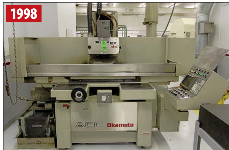
OKAMOTO ACC-1632EX AUTOMATIC SURFACE GRINDER