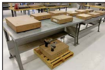
VIEW OF SURFACE PLATES