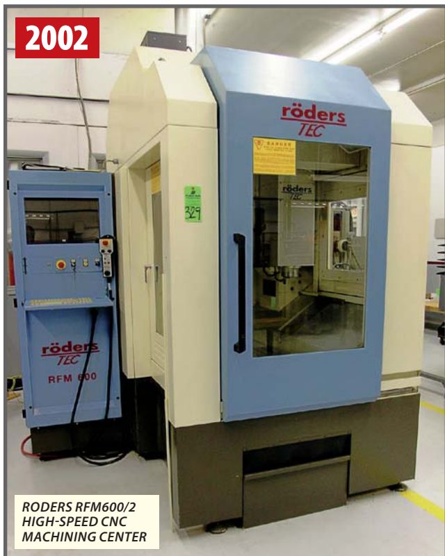
RODERS RFM600/2 HIGH-SPEED CNC MACHINING CENTER