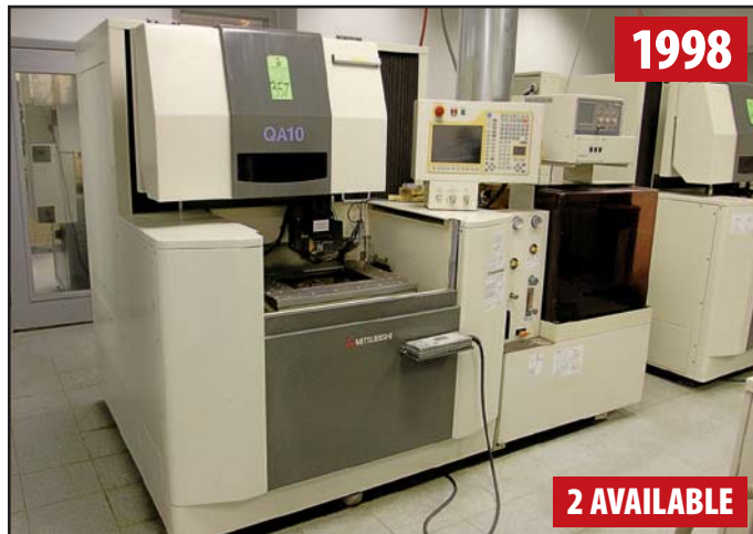
MITSUBISHI QA10 WIRE EDM

Sale Date: Tuesday, July 22, 2014 10:00 AM EDT Inspection: Monday, July 21, 2014 from 8:00 AM to 4:00 PM EDT