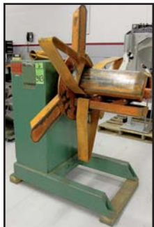
AMERICAN STEEL CO. 60 VERTICAL PAYOUT/ UNCOILER