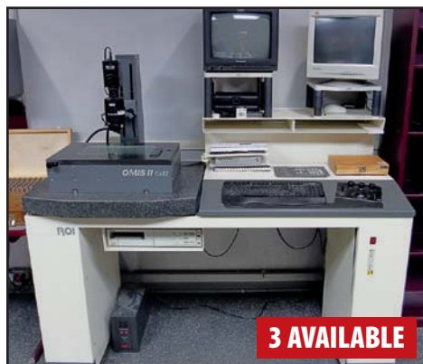
ROI OMIS II 6 X 12 RAM OPTICAL MEASUREMENT ANALYST MACHINE