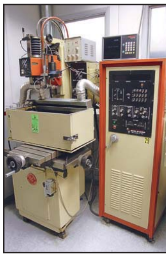
ELTEE TRM31-A PRECISION SINKER EDM