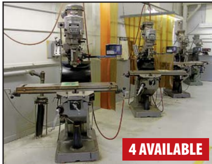
BRIDGEPORT MILLING MACHINES