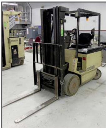
4,500 LB CROWN ELECTRIC FORKLIFT

3,500 LB CROWN 35RRTT STAND-UP ELECTRIC FORKLIFT , S/N W-89024, Solid Tire, Triple-Mast, 210" Lift Height, 42" Fork Length, 10332 Hours Indicated on Meter