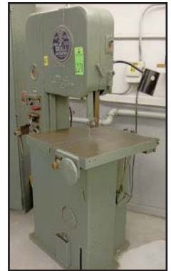
DOALL DWA-1A METALMASTER VERTICAL BANDSAW