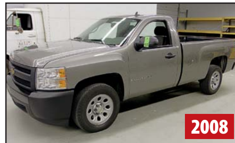
CHEVY SILVERADO PICKUP