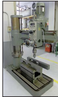
OOYA RE 1225H 12" X 5" RADIAL ARM DRILL