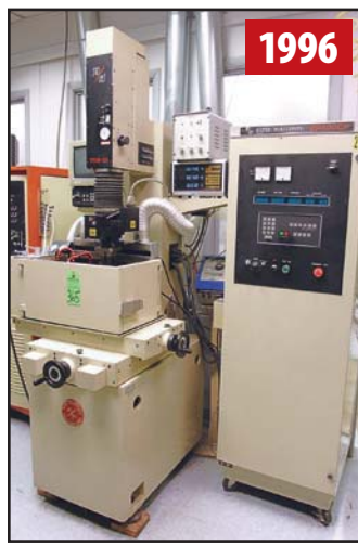
ELTEE PULSITRON TRM-21 PRECISION SINKER EDM