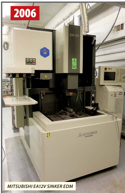
MITSUBISHI EA12V SINKER EDM