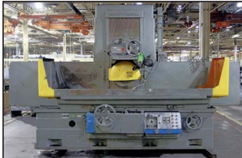
MATTISON 18" X 48" SURFACE GRINDER

HEALD 273A INTERNAL GRINDER , S/N 43135, 20" Swing, 16" Stroke, 1.5 HP Headstock Motor, 6,500 RPM Grinding Spindle Rating, 1.5" Cross Travel, 16" Chuck Size