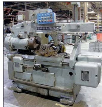
BARBER-COLMAN 16-16 GEAR HOBBER

BARBER-COLMAN 16-16 GEAR HOBBER , S/N 4185, 16" Max. Work Diameter, 16" Max Cutting Length, 6 DP Max. Diameter Pitch, 5" Max. Hob Diameter, 4.125" Work Spindle Bore, 75-445 RPM Hob Speeds, 45 Degrees L or R Hob Swivel Angle, Equipped w/Hob Shift, Double Thread Index