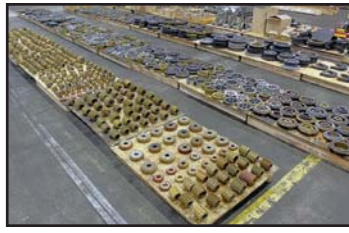
VIEW OF GEAR HOBBER