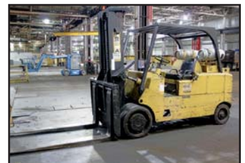
30,000 LB ROYAL T300B LP FORKLIFT