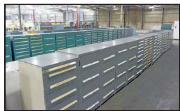
< (OVER 100) BALL BEARING TOOL CABINETS

View our current auction schedule at www.perfectionindustrial.com