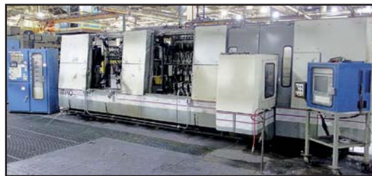
IMPCO 1500 HD CRANKSHAFT MICRO-POLISHER

WICKES CH10 CRANKSHAFT MILL , S/N 8179, 16" x 48" Work Area