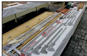
VIEW OF CALIPERS