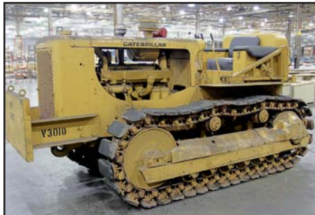
CATERPILLAR D6 B SERIES CRAWLER TRACK-TYPE TRACTOR