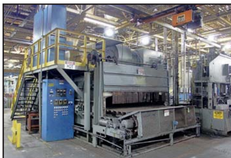
HOLCRAFT TEMPERING FURNACE

HELLER HCS 300 HORIZONTAL MACHINING CENTER , 15-43558 (1998), 24" x 43" Pallet Size, 39" X-Axis Travel, 31" Y-Axis Travel, 43" Z-Axis Travel, (12) Automatic Head Changer Positions, Equipped w/Heller UniPro 90 CNC Control