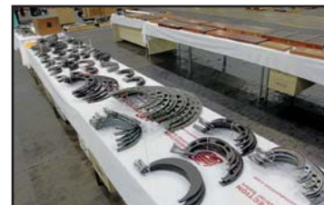
VIEW OF MICROMETERS