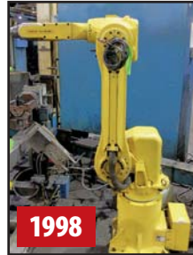
1998 FANUC M16i 6-AXIS CNC ROBOT

HELLER HCS 300 HORIZONTAL MACHINING CENTER , 15-43558 (1998), 24" x 43" Pallet Size, 39" X-Axis Travel, 31" Y-Axis Travel, 43" Z-Axis Travel, (12) Automatic Head Changer Positions, Equipped w/Heller UniPro 90 CNC Control