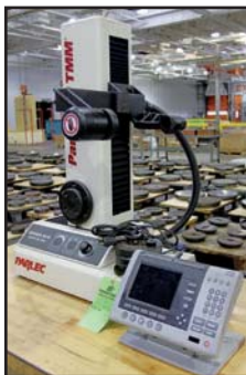
PARLEC TMM PRESETTER

HENRY 540SCX SELF CLEANING LIQUID FILTER SYSTEM, S/N 2101