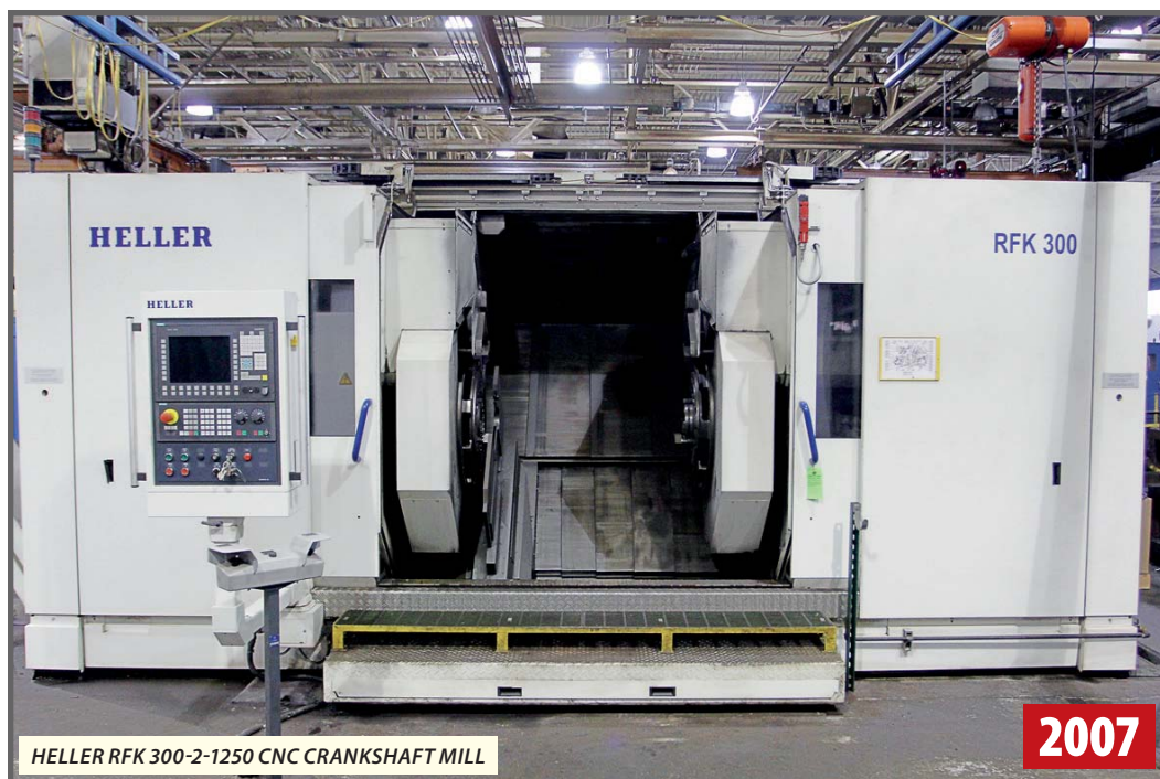
HELLER RFK 300-2-1250 CNC CRANKSHAFT MILL