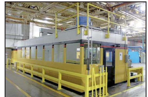
PORT-A-FAB MODULAR OFFICES

To discuss your requirements for an auction, please call Perfection Industrial 847.427.3333