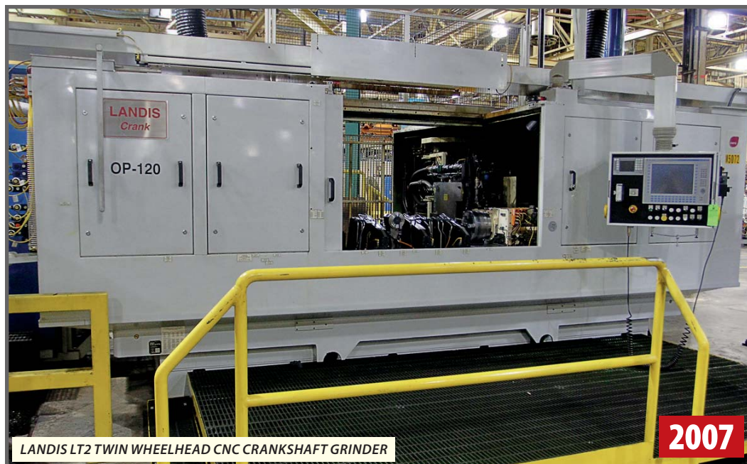
LANDIS LT2 TWIN WHEELHEAD CNC CRANKSHAFT GRINDER

INCLUDING: 1,200+ LOTS OF GEAR & CRANKSHAFT MACHINERY, TOOL ROOM MACHINERY, OVERHEAD CRANES, QUALITY ASSURANCE & INSPECTION EQUIPMENT, FORKLIFTS, MOBILE EQUIPMENT & MUCH MORE