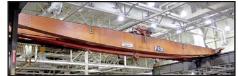
10 TON P & H BRIDGE CRANE