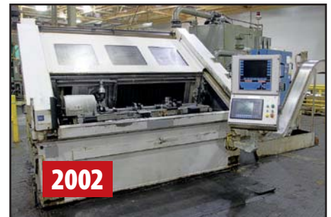
BALANCE ENGINEERING CRH-324 CRANKSHAFT BALANCER

BALANCE ENGINEERING CRANK BALANCER , S/N 3082, 12" x 50" Work Capacity, CBI-55 Control