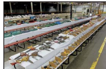
VIEW OF PNEUMATIC TOOLS