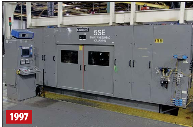
LANDIS 5SE TWIN WHEEL CNC CRANKPIN GRINDER