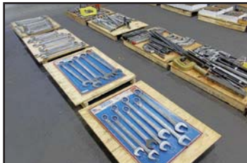
VIEW OF HAND TOOLS