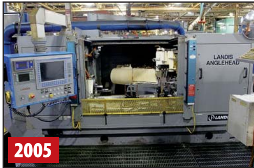
2005 LANDIS 55E CNC ANGLEHEAD GRINDER

LANDIS 55E CNC ANGLEHEAD GRINDER , S/N LT-9015 (2005), 16" x 60" Working Area, 36" Wheel Diameter, Allen Bradley VersaView 1500W CNC Control