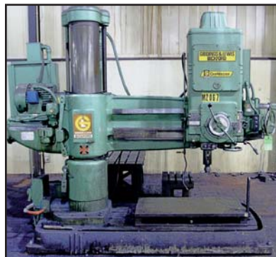
G & L BICKFORD CHIPMASTER RADIAL ARM DRILL

ROCKFORD VERTICAL SLOTTER , S/N 118-SA-76, 3-20" Stroke, 25-100 FPM Cutting Speed, 32"X, 24"Y Table Traverse, 44.5" Max. Table to Lower Face of Tool Head, 36" Tool Diameter, 54" Max. Swing, .875-2" Tool Post, 0-10 Degree Ram Adjustment Angular Forward