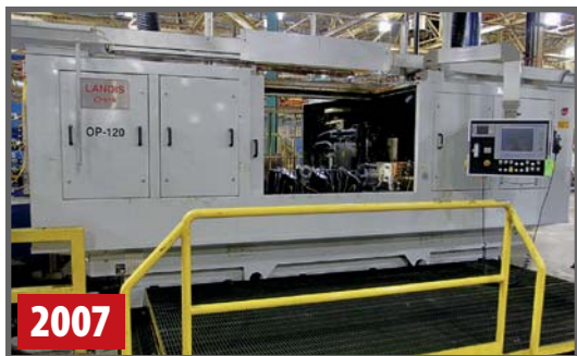
LANDIS LT2 TWIN WHEELHEAD CNC CRANKSHAFT GRINDER

INCLUDING: 1,200+ LOTS OF GEAR & CRANKSHAFT MACHINERY, TOOL ROOM MACHINERY, OVERHEAD CRANES, QUALITY ASSURANCE & INSPECTION EQUIPMENT, FORKLIFTS, MOBILE EQUIPMENT & MUCH MORE