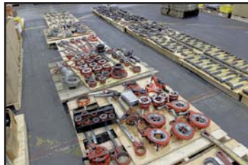
VIEW OF PIPE THREADING TOOLS