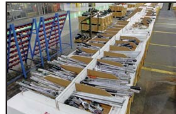
VIEW OF TORQUE WRENCHES