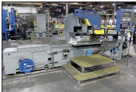
LANDIS 5R CNC GRINDING WHEEL DRESSER

BARBER-COLMAN 16-16 GEAR HOBBER , S/N 4185, 16" Max. Work Diameter, 16" Max Cutting Length, 6 DP Max. Diameter Pitch, 5" Max. Hob Diameter, 4.125" Work Spindle Bore, 75-445 RPM Hob Speeds, 45 Degrees L or R Hob Swivel Angle, Equipped w/Hob Shift, Double Thread Index