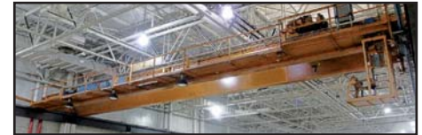
10 TON SHAW-BOX BRIDGE CRANE