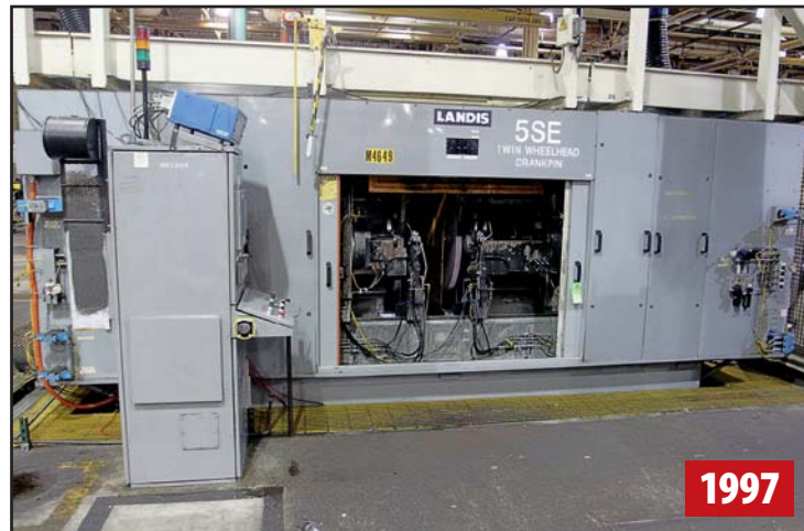
LANDIS 5SE TWIN WHEEL CNC CRANKPIN GRINDER