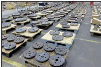
VIEW OF MILLING TOOLING

Motors and Gear Reducers; URESKO Magnetic Test Machines; BLUE M Electric Oven; AJAX Tocco 75 kW Welding Power Supply; SMOG HOG SHN-10; TORIT Dust Collection Systems; Ladders; Shop Fans; Cabinets; Work Benches and Much More