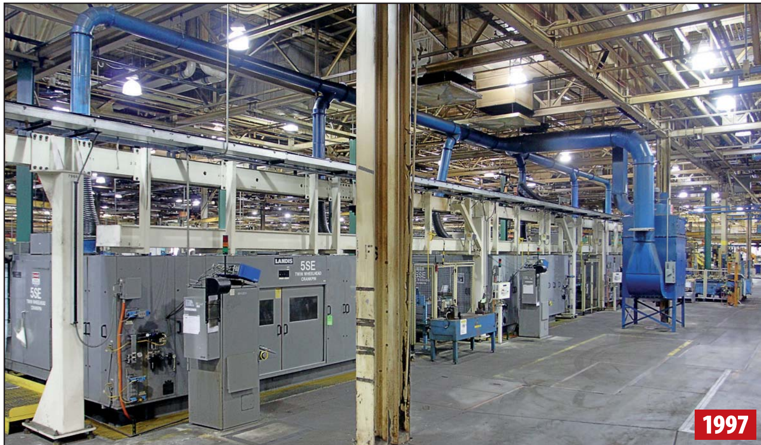
LANDIS 5SE COMPLETE GRINDING CELL