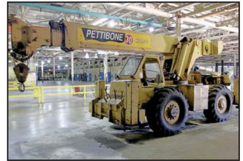
30 TON PETTIBONE 30 MOBILE CRANE

30 TON PETTIBONE 30 MOBILE CRANE , S/N 97-7-A1-7028