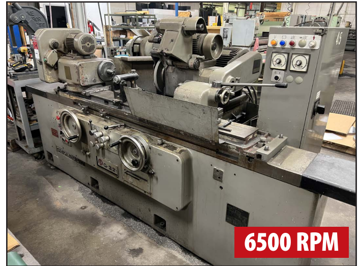
SHIGIYA SEIKI GUA-32-100 UNIVERSAL CYLINDRICAL GRINDER

ALSO: REID SURFACE GRINDERS , BOYAR SCHULTZ Surface Grinder, Motorized Grinding Fixtures, Bench Grinders, Dual End Pedestal Grinder