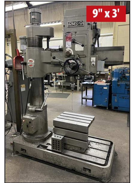
IKEDA RMS-9 RADIAL ARM DRILL