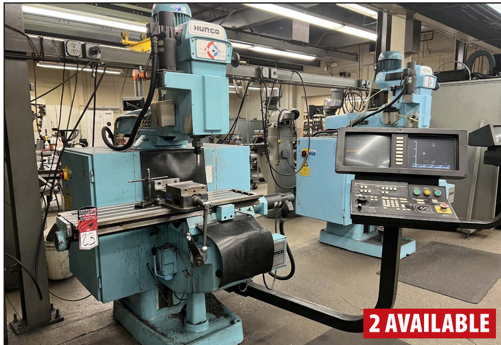
HURCO KM-3 CNC VERTICAL MILLING MACHINE

ALSO: SAMCHULLY S-650 4TH AXIS ROTARY TABLE , s/n 1507003, Servo w/ Fanuc Drive, YUASA & MOORE Indexing Tables