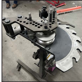
JD SQUARES PIPE BENDER