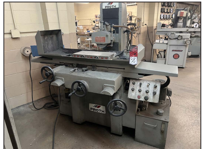
PROTH PSG-3060AH AUTOMATIC HYDRAULIC WET SURFACE GRINDER