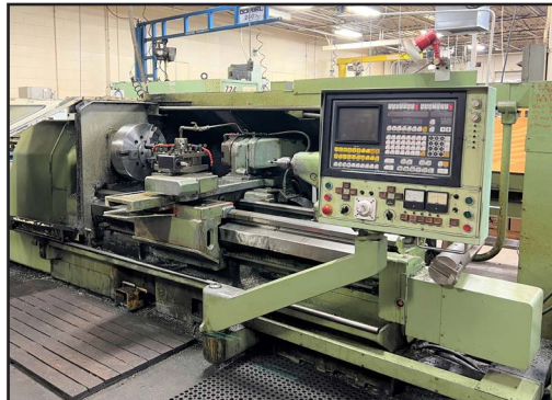
OKUMA LH35-N CNC TURNING CENTER