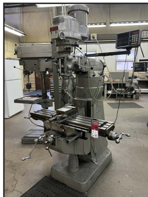
(1 OF 2) BRIDGEPORT SERIES I VERTICAL MILLING MACHINE

BRIDGEPORT VERTICAL MILLING MACHINE , s/n 124044, 9" x 32" Power Feed Table, 60-4200 RPM CINCINNATI NO. 3 VERTICAL KNEE MILLING MACHINE , s/n 4A3V1R-5, 10" x 54" Table, 18-1300 RPM