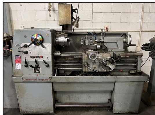
CLAUSING COLCHESTER TRIUMPH 2000 TR LATHE