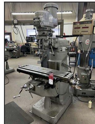
(1 OF 3) BRIDGEPORT VERTICAL MILLING MACHINE