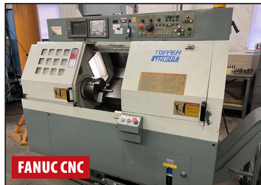
TONG-TAI TOPPER TNL-100A CNC TURNING CENTER