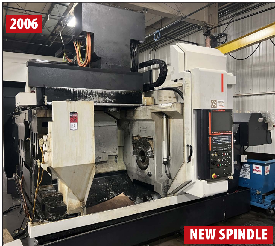
MAZAK VARIAXIS 730 II CNC VERTICAL MACHINING CENTER