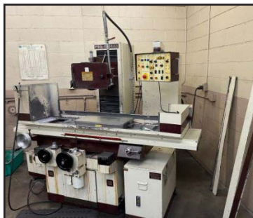
CHEVALIER FSG 1224 AD AUTOMATIC SURFACE GRINDER