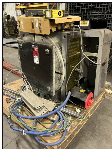
SAMCHULLY S-650 4TH-AXIS ROTARY TABLE