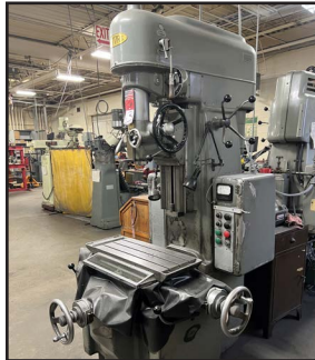
MOORE #3 JIG BORER