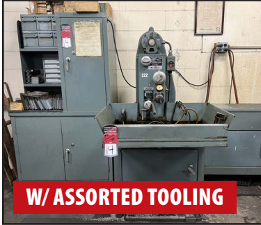
SUNNEN MBB-1660 PRECISION HONING MACHINE