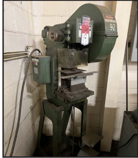
ROUSSELLE PUNCH PRESS

YALE NE040MAN24ST095 STAND UP ELECTRIC FORKLIFT , s/n 362471, 24V, 4000 lb Lift Capacity, w/ Yale 3YTF12-775 Battery Charger