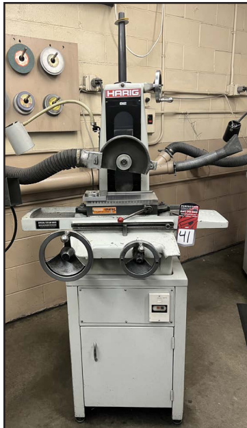
(1 OF 6) HARIG 612 SURFACE GRINDERS