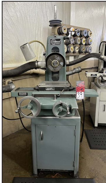
(1 OF 2) HARIG SUPER 612 SURFACE GRINDER