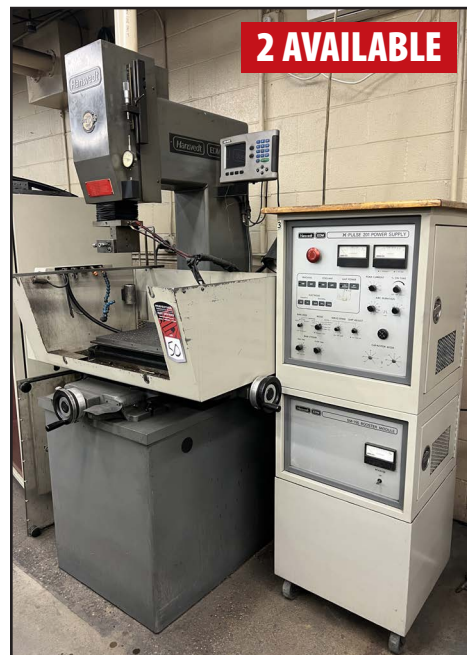
HANSVEDT 201 EDM