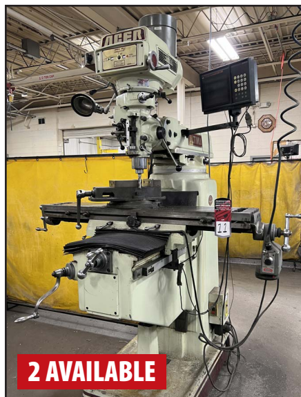
ACER 3VKH VERTICAL MILLING MACHINE

HANSVEDT SM-150B EDM , s/n AP17986, Magnetic Chuck, X-Pulse Power Supply, Anilam Mini-Wizard 2-Axis DRO