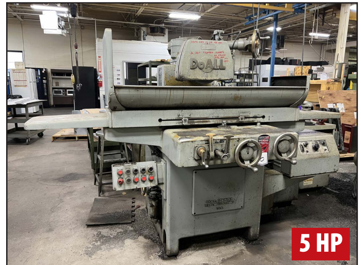
DOALL D1024-14 SURFACE GRINDER