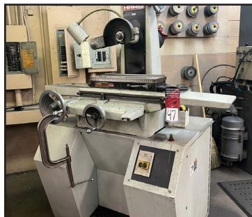
HARIG 618 SURFACE GRINDER