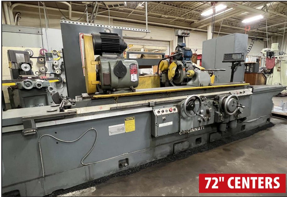
CINCINNATI 14H X 72 CYLINDRICAL GRINDER