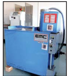
EMC WATER EATER