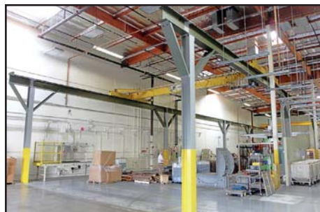
AMERICAN MONORAIL FREE-STANDING BRIDGE CRANE SYSTEM