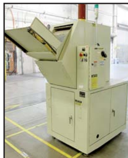
BALL & JEWELL CG-1216-SCSPFX 4.6 KW GRANULATOR