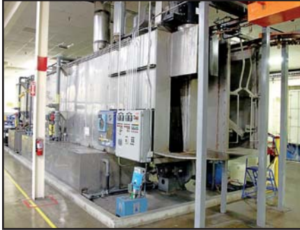
TELLKAMP SYSTEMS 4-STAGE STAINLESS STEEL WASHER