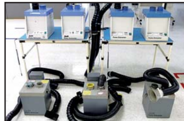
PACE FUME EXTRACTORS