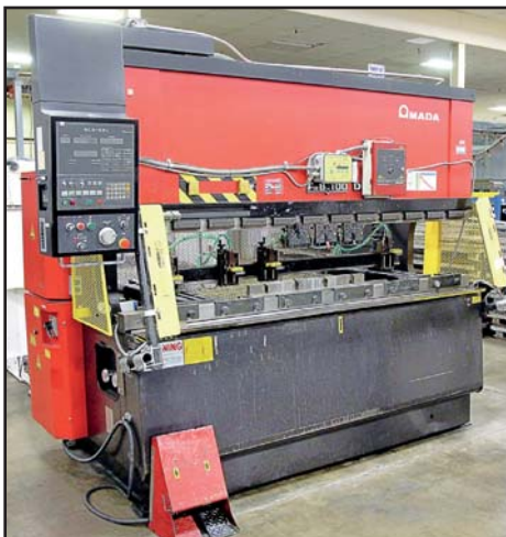
< AMADA FBD-1025E CNC PRESS BRAKE

ALSO: GOOD SELECTION OF PRESS BRAKE DIES