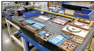
> INSPECTION ITEMS