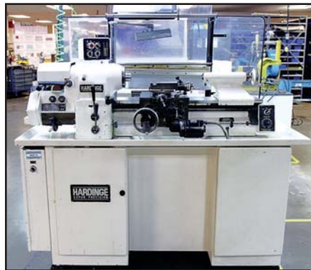
HARDINGE HLV-H SUPER PRECISION TOOL ROOM LATHE