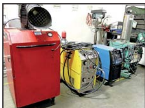
VIEW OF WELDERS

ALSO: ESAB MIGMASTER 250 MIG WELDER, s/n MA-1744146; MILLER SYNCROWAVE 210 MIG WELDER, s/n MG160089L; LINDE HELIARC 250HF MIG WELDER, s/n B83E, 32207; L-TEC PCM-VPI PLASMA CUTTER, s/n A92B-32331; KICE PORTABLE DUST COLLECTOR, s/n 209209, Receiving and Aspirator Hoppers, each w/Fan and Airlock; SMOG-HOG PORTA-CLEAN PORTABLE FUME EXTRACTOR, s/n 60032079-0298; MICRO-AIR PORTABLE FUME EXTRACTOR, s/n NA; HAKO HJ3100 FUME EXTRACTOR, s/n NA