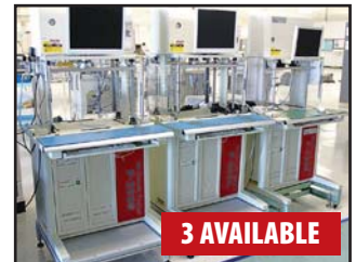
QUALETRON QS8200 IN-CIRCUIT TESTER