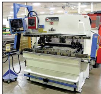
AMADA RG-50 CNC PRESS BRAKE

View our current auction schedule at www.perfectionindustrial.com