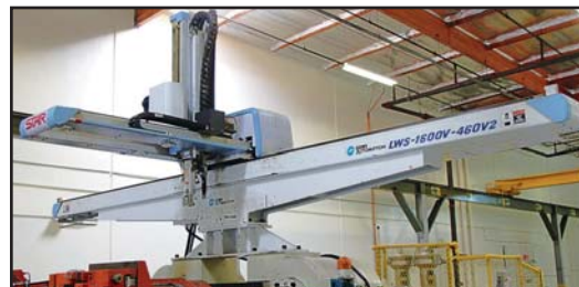
STAR AUTOMATION LWS-1600V-460V2 SERVO ROBOT