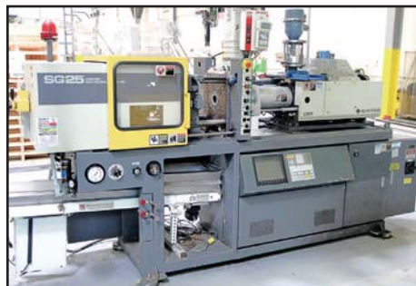
SUMITOMO SG25 INJECTION MOLDING MACHINE

STAR AUTOMATION F1 SPRUE PICKER , s/n 9507-0097, w/SP-450F Control