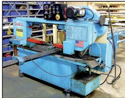
DOALL C-916 9" X 16" HORIZONTAL BANDSAW