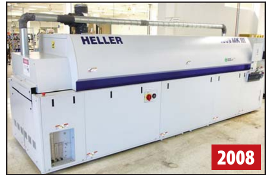
HELLER 1809 MKIII REFLOW OVEN

UNIVERSAL 5423K PCB UNLOADER , s/n 10087226