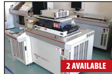
GENRAD IN-CIRCUIT TESTERS