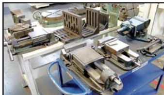
< TOOL ROOM ACCESSORIES