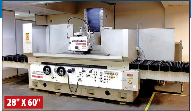
28" X 60" OKAMOTO ACC-28-60DX RECIPROCATING SURFACE