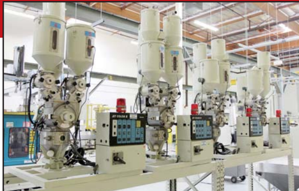
MATSUI COLOR BLENDING STANDS W/(2) JET COLOR II 102-BR COLORS BLENDERS