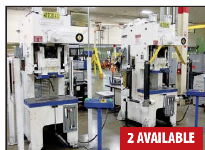
HIDAKA-SUTHERLAND 45-II GAP FRAME PRESSES