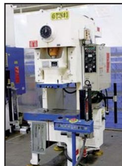
AIDA NC1-45 (2) GAP FRAME PRESS