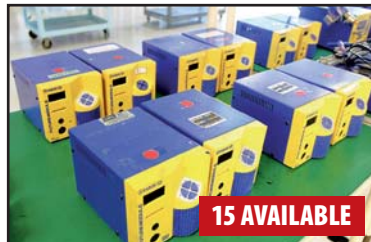
HAKKO SOLDERING AND REWORK STATIONS

SMARTSONIC 1550 STENCIL AND PALLET CLEANER , s/n C-0207-1510; SMARTSONIC 2000 SEMIAUTOMATIC STENCIL CLEANER , s/n AAA970-6101MB; GENRAD GR2287I ICT , Catalog Number 2287I-9783-00, s/n 361, 13 x Combo2 Cards, 1 x ICA card, CSA Certified; GENRAD 2287 ICT , s/n 2287I-450, 20 x Combo2 Cards, 1 x ICA, 1 x AFTM, CSA Certified, CE Certified; CENCORP 800 TR1000 STAND-ALONE ROUTING SYSTEM , Year: 1998, Assembly Number: 9400-0045-000, Vacuum System, Z-Axis Router 45mm, Vacuum Head 45mm, Bit Detection, Video Assist; DENON BGA REWORK SYSTEM RD-500II , s/n R58437311M, AC 200-240V, 4kW 50/60 Hz, CE Marked; EMC (EQUIPMENT MANUFACTURING CORPORATION) WATER EATER ; MANNCORP COU2000PC 2000 AUTOMATIC SMD COMPONENT COUNTER , s/n T014242, Year: 2014, 110V, 0.6A; (4) UNIVERSAL 5362I PCB CONVEYORS , 24"L, s/n 10087225, 10087224, 10087132, 10087223; UNIVERSAL PCB CONVEYOR , s/n 5365B08399-6-43363833, 110V, 7.5A, Single Phase; OLAMEF TP6/R-11/EC/M1 , s/n 1890, Year: 2002, Manual Cutting Machine for Taped Components; 1997 OLAMEF POWER LEAD CUTTER TP/LN-500 , s/n 061561; LARGE QUANTITY OF PCB MAGAZINE RACKS ; 1996 RADOLL 145 PANEL-MASTER DEPANELER , s/n 002; ROBOFLEX AUTOMATIC HANDLER ; DDR2 MEMORY TESTER ; HUGE SELECTION OF CREEFORM WORKSTATIONS ; FLOW RACKS, STAND AND RACKS