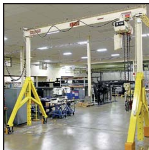
STRAD-L-LOAD 3-TON GANTRY

INSPECTION: Sale Preview Will Be Held on Monday, March 27 from 9:00 AM–4:00 PM PDT PLEASE NOTE: PLEASE REGISTER BY MARCH 23 TO BE APPROVED FOR THE INSPECTION DAY & ACCESS THE FACILITY