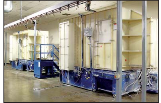
(2) NORDSON POLY PAINT BOOTHS