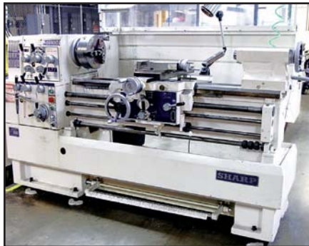
SHARP 1640C PRECISION GEARED HEAD LATHE