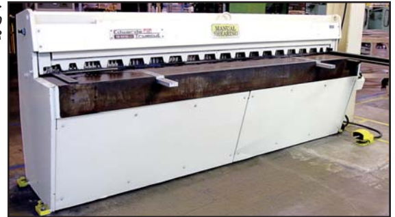
> EDWARDS 600 TRUECUT SHEAR