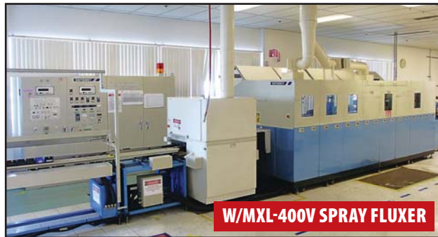
SENSBEY LGL-400CP WAVE SOLDERING MACHINE