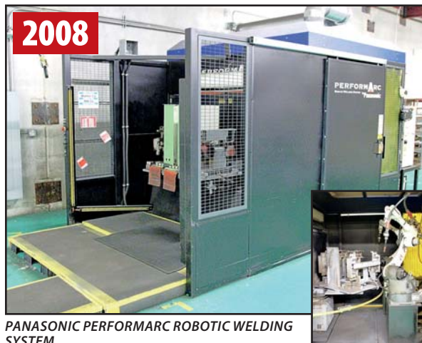
PANASONIC PERFORMARC ROBOTIC WELDING SYSTEM