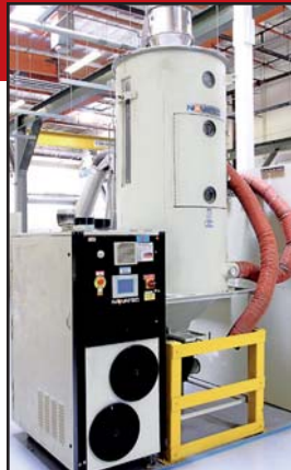
NOVATEC DRYER/HOPPER W/MW-400 DRYER