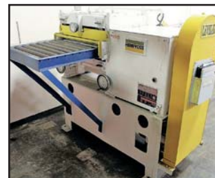
HERR-VOSS VMLD28/3RH MINI-LEVELER