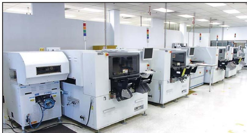
UNIVERSAL ADVANTIS TURN KEY SURFACE MOUNT LINE