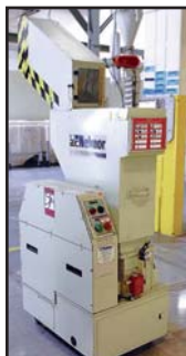
NELMOR G68 5 HP GRANULATOR