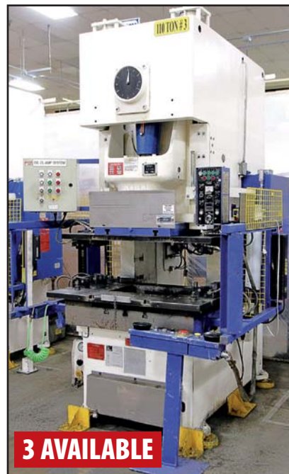
AIDA NC1-110 (2) GAP FRAME PRESS

BELMONT MAXICUT S-26 ZNC DRILL, s/n KB07Z26173, w/18" x 12" Work Table, 39.8" Floor to Work Table Height, 12" X-Axis, 10" Y-Axis, 990 Lb Max. Work Piece Weight, 12.7" Z-Axis Ram Servo Stroke, 12" Max. Work Piece Height From Worktable Top/13.75" From Tray