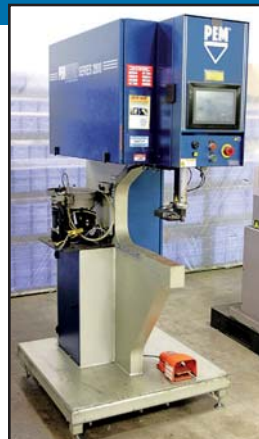
PEMSERTER SERIES 2000A INSERTION PRESS