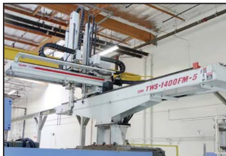
STAR AUTOMATION TWS-1400FM-5 SERVO ROBOT