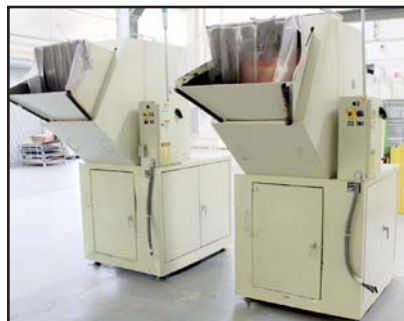
BALL & JEWELL CG-1620-SCSPF 25 HP GRANULATORS

ENGINEERING TDW-1NXQ CHILLER , s/n 95H5137, .75 kW; APPLICATION ENGINEERING PKW-SQ PORTABLE CHILLER , s/n 97J0385, 5/75 HP; APPLICATION ENGINEERING PSW5Q PORTABLE CHILLER , s/n 30L0492, 5/1 HP w/TCU-300 Temp. Control Unit, s/n 30L5542; APPLICATION ENGINEERING PKW-2-Q PORTABLE CHILLER , s/n 95H0579, 2/75 HP; (3) APPLICATION ENGINEERING TCU-300 TEMPERATURE CONTROLLERS , s/n 30L5544, 30H0324, 34H0325; (2) CITOPRODUCTS C50-PC05-15-03 PULSE COOLING VALVE KART ASSEMBLY , s/n 0100-0707, 0093-0611; CITO PRODUCTS PCV-VKA-09 03 PULSE COOLING VALVE KART ASSEMBLY , s/n NA; PASCAL SHR10 MOLD UPENDER , s/n MZIIA-016-7, 100 kN Max. Die Weight, 51" x 51"; ALSO: (9) IMS PORTABLE POLY MATERIAL BINS , 30" x 30" x 24", (5) Portable Poly Material Bins- (4) 36" x 36" x 30" and (1) 28" x 28" x 24"