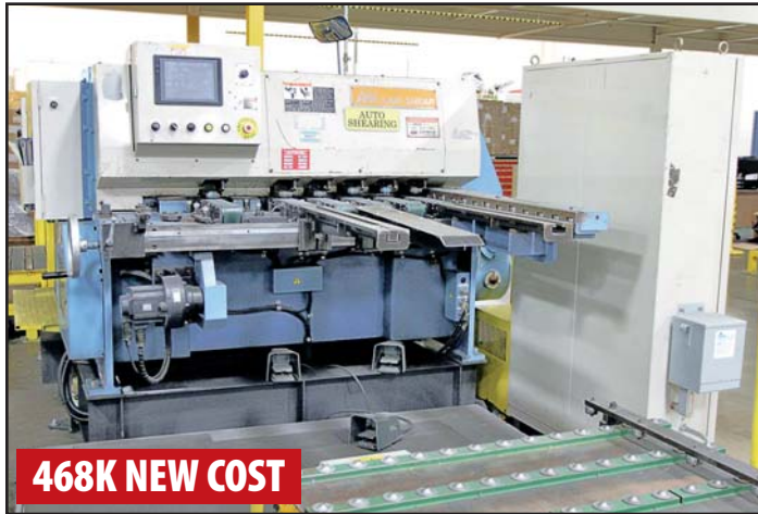
468K NEW COST AIZAWA SAR-312C AUTO SHEAR