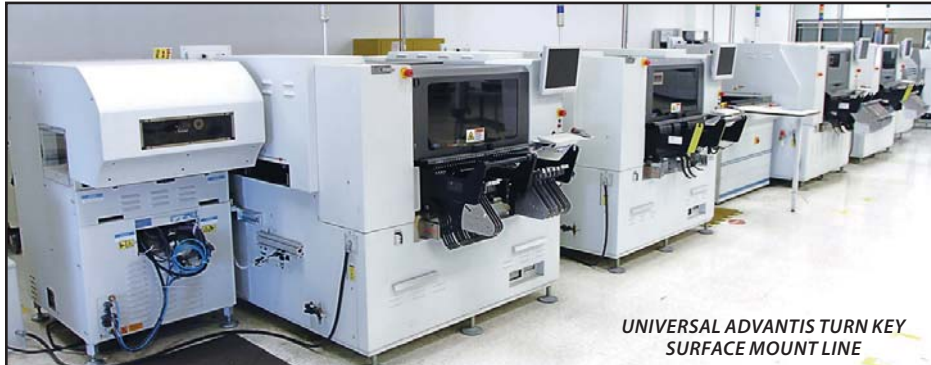
UNIVERSAL ADVANTIS TURN KEY SURFACE MOUNT LINE