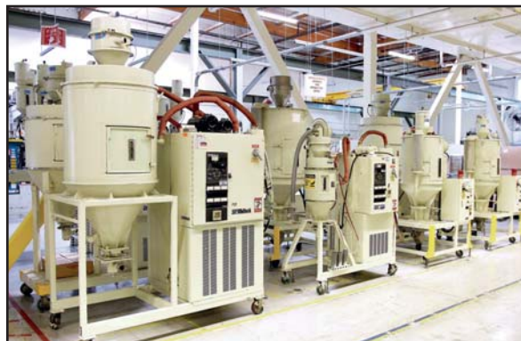
VIEW OF HOPPER DRYERS

To discuss your requirements for an auction, please call Perfection Industrial +1-847-545-6374 or sales@perfectionindustrial.com