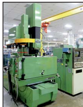
SODICK A6R RAM TYPE CNC EDM