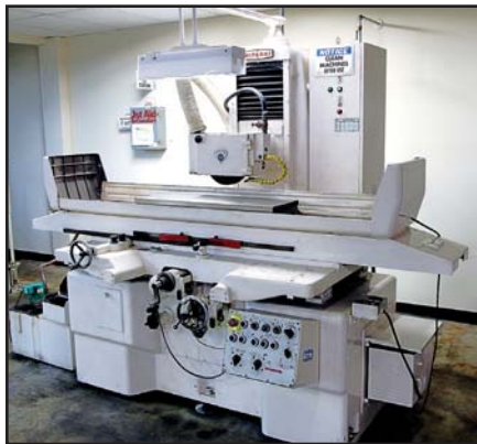
HITACHI GHL-300S SURFACE GRINDER