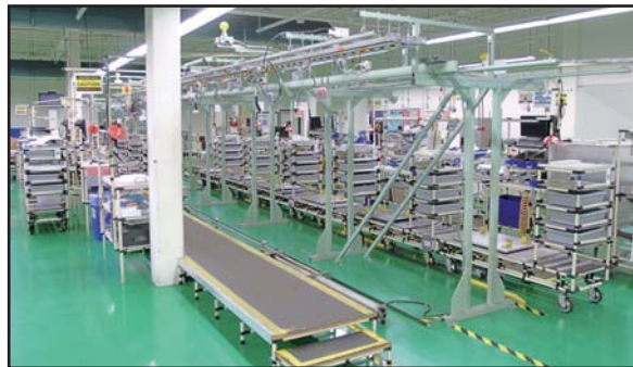
HUGE SELECTION OF CREEFORM WORKSTATIONS, FLOW RACKS, STAND AND RACKS