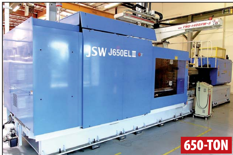
JSW J650ELIII-3100H ELECTRIC SERVO DRIVE INJECTION MOLDING MACHINE