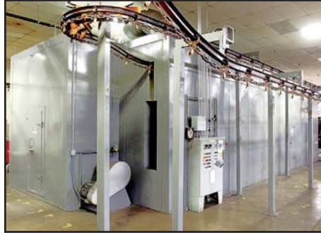
TELLKAMP SYSTEMS NO. 3699 CONVEYORIZED CONVENTIONAL CURE OVEN