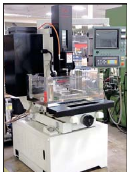
BELMONT MAXICUT S-26 ZNC DRILL