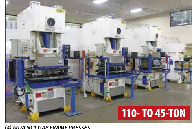
(4) AIDA NC1 GAP FRAME PRESSES

Sale Closing From: Tuesday, March 28, 2017 at 10:00 AM PDT