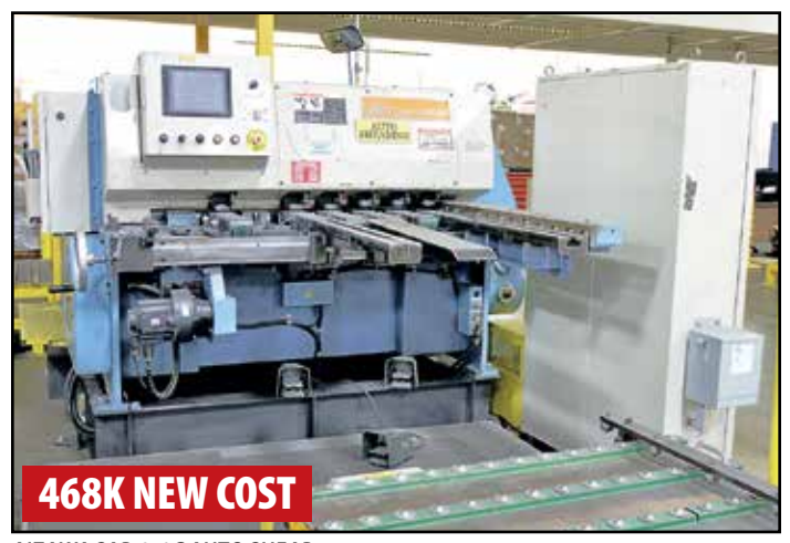
AIZAWA SAR-312C AUTO SHEAR