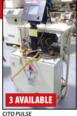
COOLING VALVE KARTS