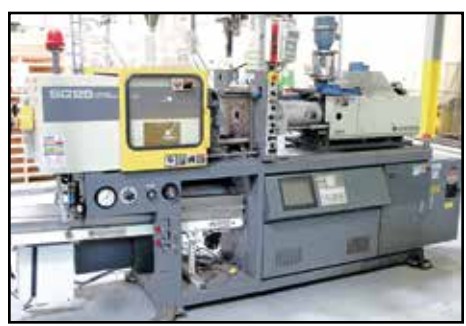
SUMITOMO SG25 INJECTION MOLDING MACHINE

STAR AUTOMATION LWS-1600V-460V2 SERVO ROBOT, s/n NA STAR AUTOMATION F1 SPRUE PICKER, s/n 9507-0097, w/SP-450F Control