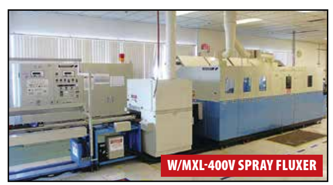
SENSBEY LGL-400CP WAVE SOLDERING MACHINE