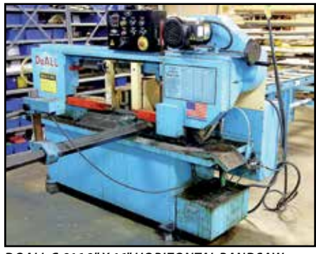
DOALL C-916 9" X 16" HORIZONTAL BANDSAW