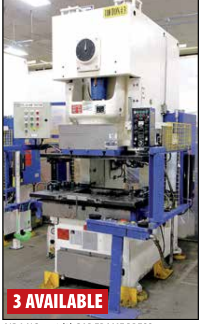
AIDA NC1-110 (2) GAP FRAME PRESS

BELMONT MAXICUT S-26 ZNC DRILL, s/n KB07Z26173, w/18" x 12" Work Table, 39.8" Floor to Work Table Height, 12" X-Axis, 10" Y-Axis, 990 Lb Max. Work Piece Weight, 12.7" Z-Axis Ram Servo Stroke, 12" Max. Work Piece Height From Worktable Top/13.75" From Tray