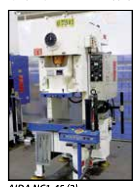
AIDA NC1-45 (2) GAP FRAME PRESS