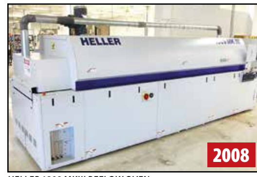
HELLER 1809 MKIII REFLOW OVEN

UNIVERSAL 5423K PCB UNLOADER, s/n 10087226