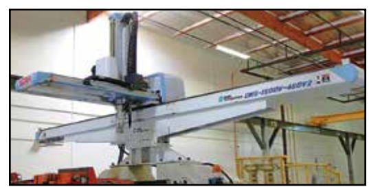
STAR AUTOMATION LWS-1600V-460V2 SERVO ROBOT