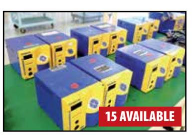
HAKKO SOLDERING AND REWORK STATIONS

HAKKO FR-870 DESOLDERING/REWORK STATION; HAKKO 850D SMD REWORK STATION, s/n NA; HAKKO FR-803B SMD REWORK STATION; HAKKO FM-205 SOLDER/DESOLDERING STATION; (10) HAKKO FM-202 SOLDERING STATIONS; VISION ENGINEERING MANTIS 10X MAGNIFYING ARM; OLYMPUS SZH MICROSCOPE; CYBEROPTICS LSM2 SOLDER PASTE MEASUREMENT SYSTEM, s/n 200215; (2) PACE ARM EVAC 200 FUME EXTRACTORS; (2) PACE EVAC 250 FUME EXTRACTORS; (3) PACE EVAC II FUME EXTRACTORS; MET HJ3100 FUME EXTRACTORS; DIO RP-500II REWORK SYSTEM, s/n R58437311M; TESCON POINT 70MB MANUFACTURING DEFECTS ANALYZER; TESCON POINT 88 SMT TESTER W/HP TESTJET TECHNOLOGY; HP 54610B OSCILLOSCOPE, s/n VS37340742, 500mhz; KEITHLEY 648T PICOAMMETER, s/n 4101651; METEX MXD-4660A DIGITAL MULTIMETER, s/n 937407: (2) HP 34401A MULTIMETERS, s/n US36088357. 314A62220; ELENCO PRECISION XP-85 VARIABLE REGULATED POWER SUPPLY; ELENCO XP-752A DC POWER SUPPLY, s/n 243283; BK PRECISION 1686A DC REGULATED POWER SUPPLY, s/n N99121911; HP 5315B UNIVERSAL COUNTER, 2538A04175: OUALECTRON OS8200 IN-CIRCUIT TESTER W/KPV-120: