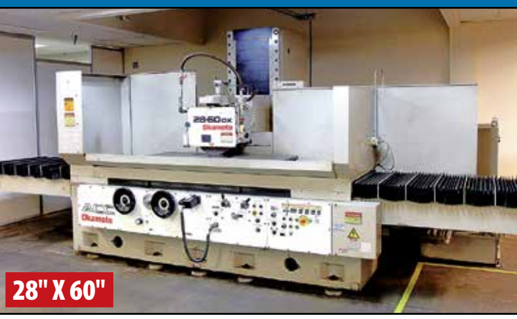
OKAMOTO ACC-28-60DX RECIPROCATING SURFACE