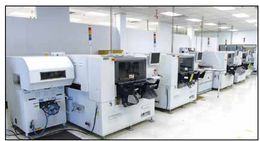
UNIVERSAL ADVANTIS TURN KEY SURFACE MOUNT LINE