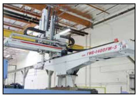
STAR AUTOMATION TWS-1400FM-5 SERVO ROBOT