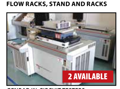
GENRAD IN-CIRCUIT TESTERS