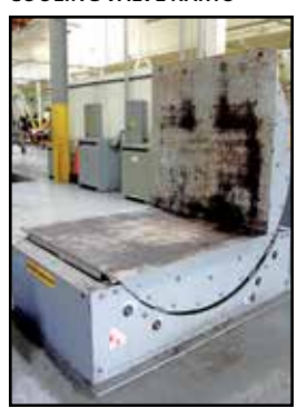
PASCAL SHR10 MOLD UPENDER