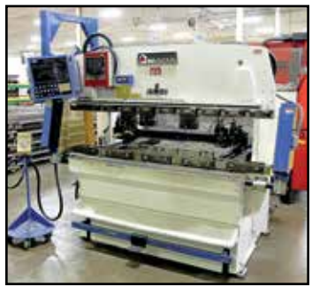
AMADA RG-50 CNC PRESS BRAKE

View our current auction schedule at www.perfectionindustrial.com