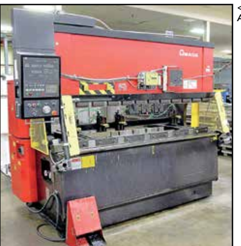
AMADA FBD-1025E CNC PRESS BRAKE

ALSO: GOOD SELECTION OF PRESS BRAKE DIES