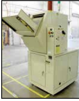
BALL & JEWELL CG-1216-SCSPFX 4.6 KW GRANULATOR