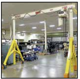
STRAD-L-LOAD 3-TON GANTRY

INSPECTION: Sale Preview Will Be Held on Monday, March 27 from 9:00 AM-4:00 PM PDT PLEASE NOTE: PLEASE REGISTER BY MARCH 23 TO BE APPROVED FOR THE INSPECTION DAY