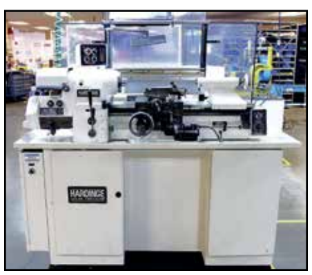
HARDINGE HLV-H SUPER PRECISION TOOL ROOM LATHE