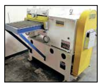
HERR-VOSS VMLD28/3RH MINI-LEVELER