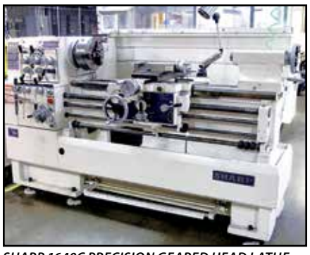
SHARP 1640C PRECISION GEARED HEAD LATHE