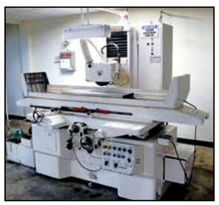
HITACHI GHL-300S SURFACE GRINDER