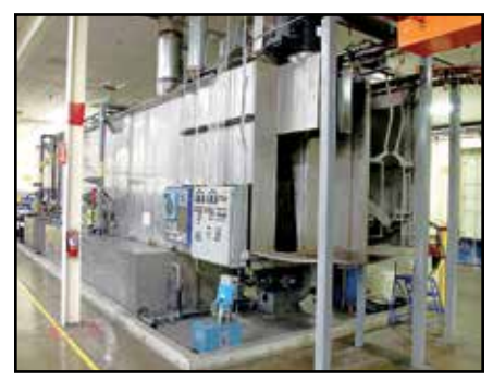
TELLKAMP SYSTEMS 4-STAGE STAINLESS STEEL WASHER