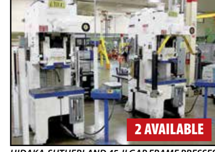
HIDAKA-SUTHERLAND 45-II GAP FRAME PRESSES