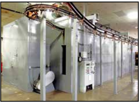
TELLKAMP SYSTEMS NO. 3699 CONVEYORIZED CONVENTIONAL CURE OVEN