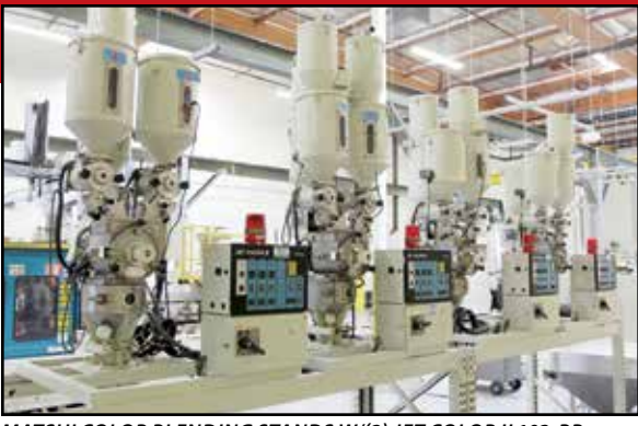
MATSUI COLOR BLENDING STANDS W/(2) JET COLOR II 102-BR COLORS BLENDERS