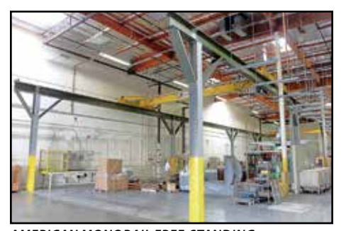
AMERICAN MONORAIL FREE-STANDING BRIDGE CRANE SYSTEM