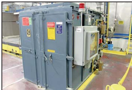
POLLUTION CONTROL PRODUCTS PRCIII5954 INDUSTRIAL BURN-OFF FURNACE