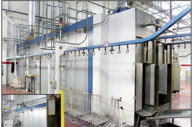
PRODUCTION SYSTEMS DRY-OFF OVEN AND CURE OVEN