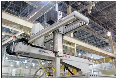
STAR AUTOMATION TW-1000FM-3 ROBOT