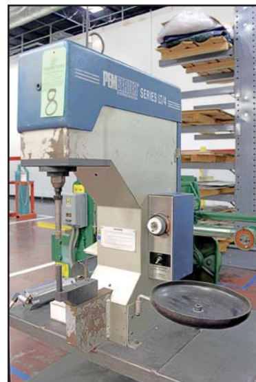
3-TON PEMSERTER LT/4 INSERTION MACHINE