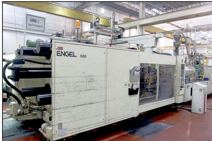
680-TON ENGEL ES4400/750 AH INJECTION MOLDER

225 TON ENGEL 700/250 INJECTION MOLDER , S/N 6394-250-94, 12 Oz. Shot Size, 22-1/2" Tie Bar Spacing