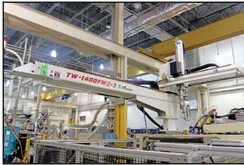
STAR AUTOMATION TW-1400FMII-3 ROBOT