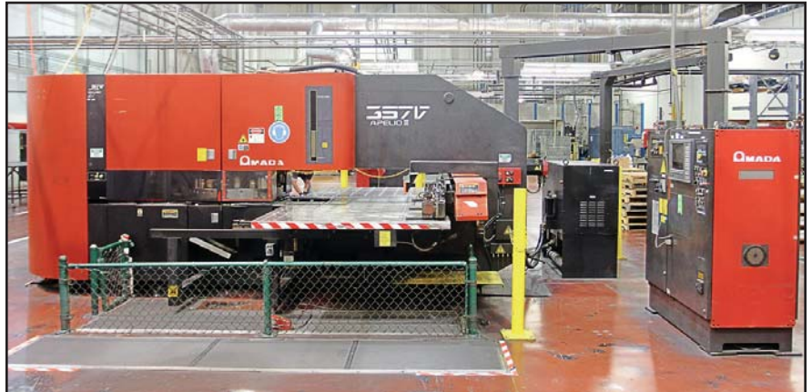
33-TON AMADA APELIO 357V CNC LASER PUNCH PRESS