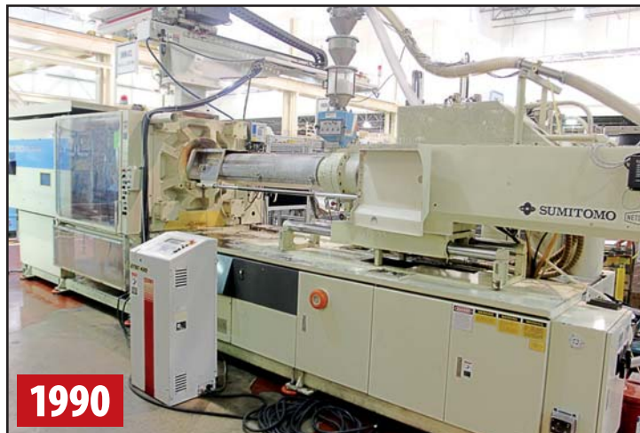
350-TON SUMITOMO SG350 INJECTION MOLDER