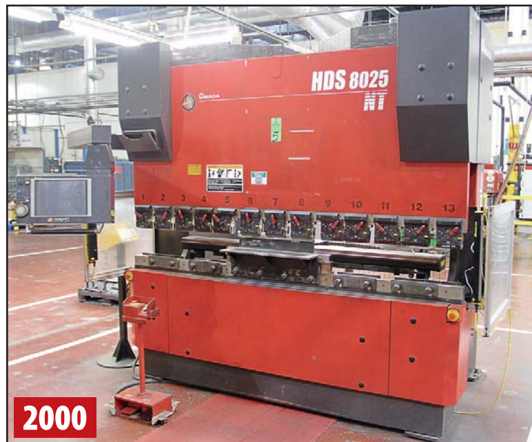
(3) 80-TON AMADA HDS-8025NT CNC PRESS BRAKE