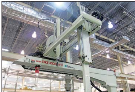
STAR AUTOMATION TWS-1000 FM-4 ROBOT