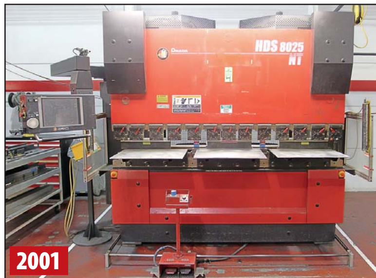
(3) 80-TON AMADA HDS-8025NT CNC PRESS BRAKE

LARGE ASSORTMENT OF AMADA PUNCH TOOLING AND CLAMPING