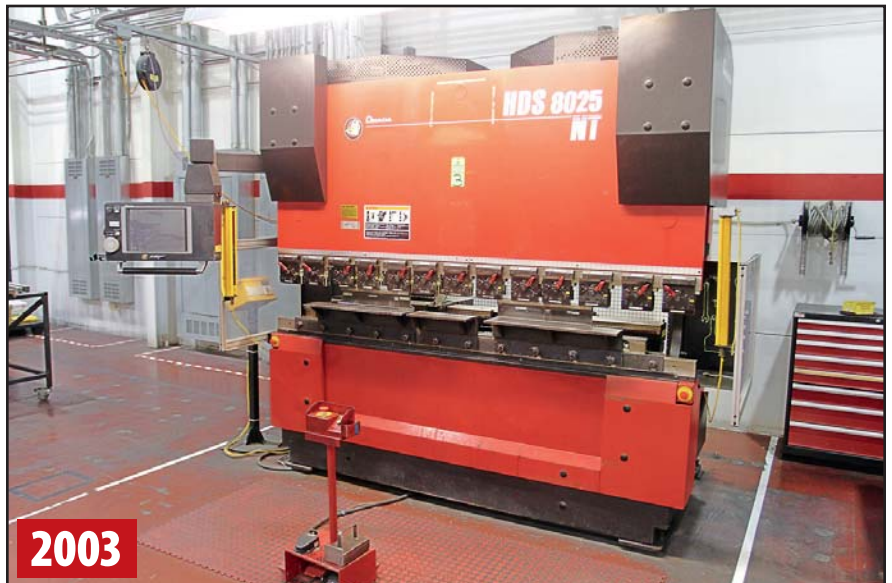
(3) 80-TON AMADA HDS-8025NT CNC PRESS BRAKE