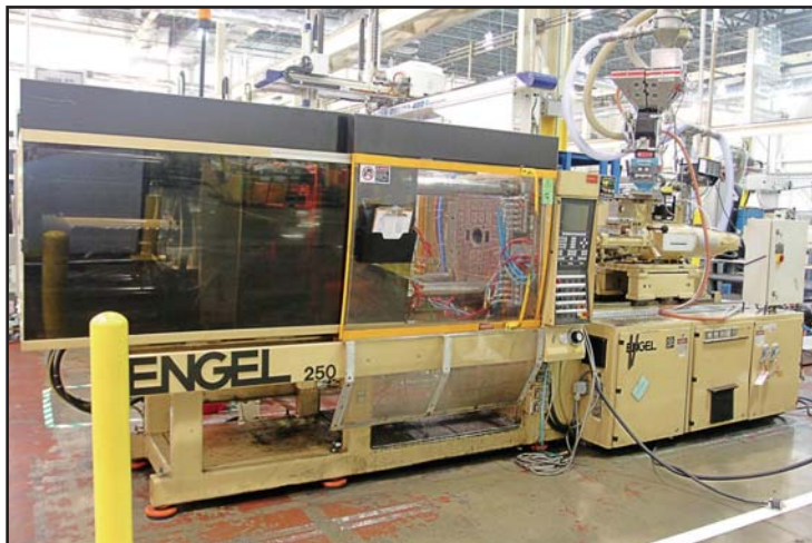
225-TON ENGEL 700/250 INJECTION MOLDER

View our current auction schedule at www.perfectionindustrial.com