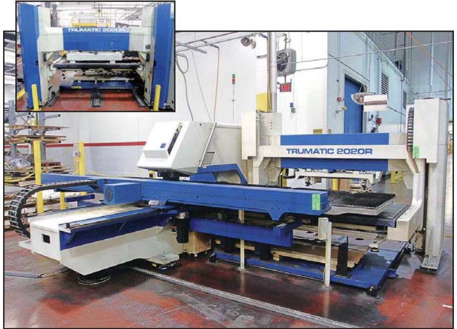
33-TON AMADA APELIO 357V CNC LASER PUNCH PRESS

Perfection Industrial Sales ph 847-427-3333 • fax 847-427-8884 www.perfectionindustrial.com