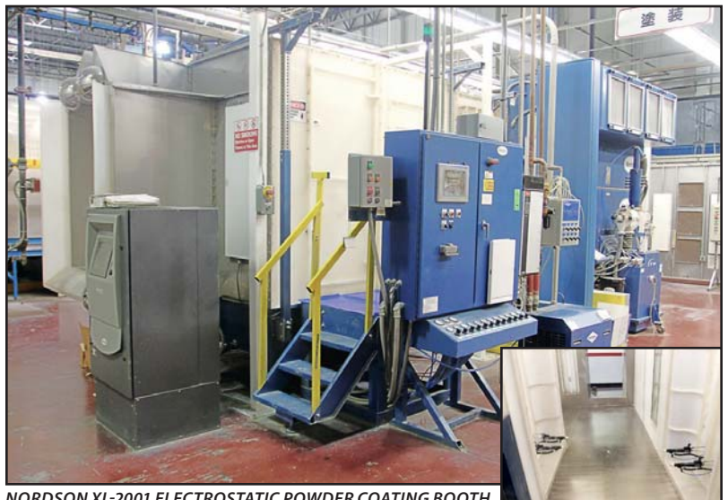
NORDSON XL-2001 ELECTROSTATIC POWDER COATING BOOTH