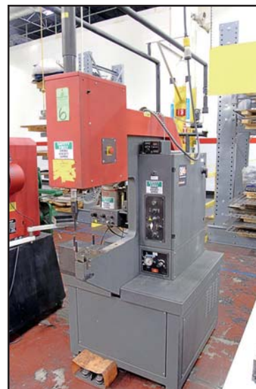
8-TON HAEGER 8249-PLUS-IL INSERTION MACHINE

To discuss your requirements for an auction, please call Perfection Industrial 847.427.3333