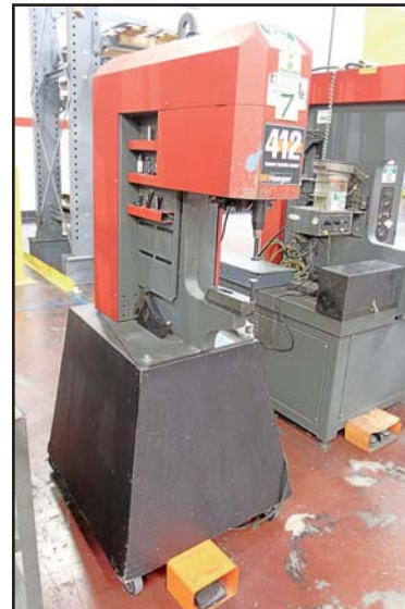
4-TON HAEGER 412-110 INSERTION MACHINE