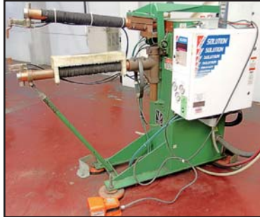
100 KVA LORS 1100AR-I-DV SPOT WELDER

By Appointment Only. See information on last page for details.