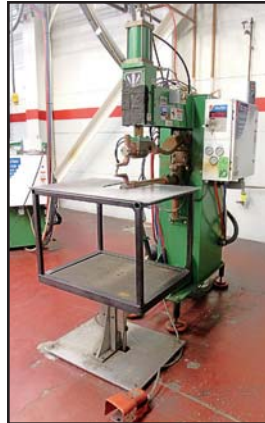
75 KVA LORS 175AP-DV-R S SPOT WELDER

75 KVA LORS 175AP-DV SPOT WELDER , S/N 1104-7393, 30" Throat, Unitrol 9180L-600E Welding Control