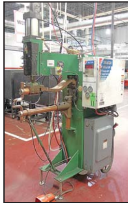
75 KVA LORS 175AP-DV SPOT WELDER