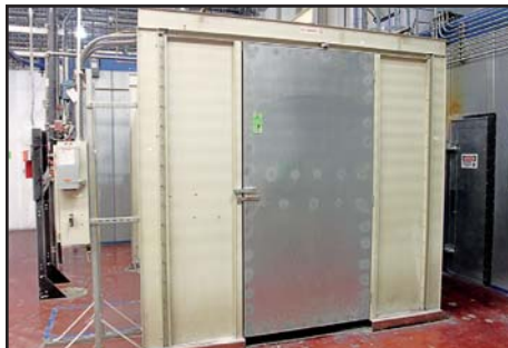
DEIMCO 9' X 8' X 101" SPRAY BOOTH

Inspection: By Appointment Only. See information on last page for details.