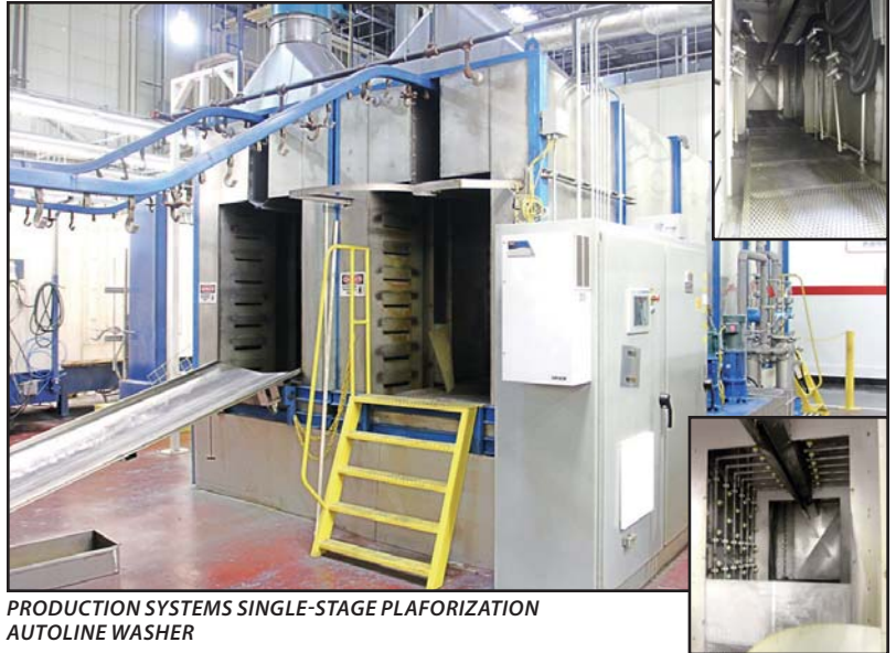
PRODUCTION SYSTEMS SINGLE-STAGE PLAFORIZATION AUTOLINE WASHER

View our current auction schedule at www.perfectionindustrial.com