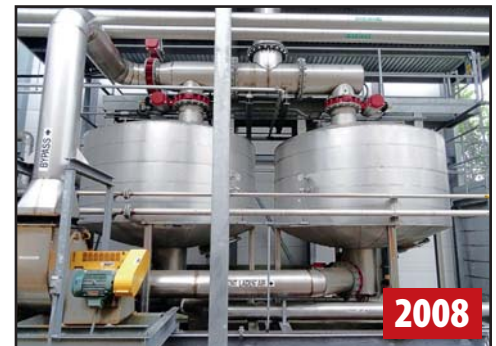
MEGTEC SOLVENT RECOVERY SYSTEM

STAR AUTOMATION TWS-1000 FM-4 ROBOT , S/N T10F-0216, w/STAR STEC-400M Control