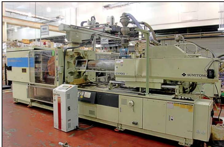
350-TON SUMITOMO SG350 INJECTION MOLDER