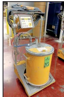
< (3) ITW GEMA AG MANUAL ELECTROSTATIC POWDER FINISHING SYSTEM W/EASY SELECT PAINT GUN AND EASTRONIC CONTROL