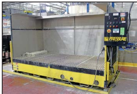
PRESSURE ISLAND 6' X 12' POWER WASHING STATION