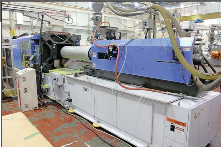
650-TON JSW J50EII INJECTION MOLDER

350 TON SUMITOMO SG350 INJECTION MOLDER , S/N 0037, (1990), 29 Oz. Shot Size, 28" Tie Bar Spacing, 2.5" Screw Diameter