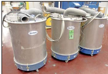
(3) NORDSON HR-16-150 POWDER FEED HOPPERS