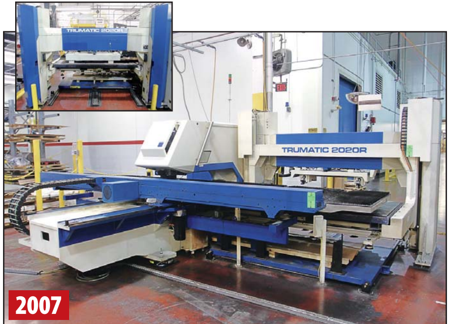
20-TON TRUMPF TRUMATIC 2020R CNC PUNCHING MACHINE

Perfection Industrial Sales ph 847-427-3333 • fax 847-427-8884 www.perfectionindustrial.com