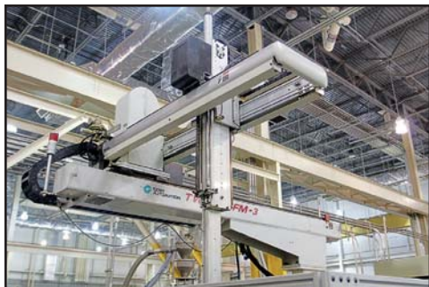
STAR AUTOMATION TW-1000FM-3 ROBOT