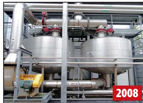
MEGTEC SOLVENT RECOVERY SYSTEM

STAR AUTOMATION TWS-1000 FM-4 ROBOT , S/N T10F-0216, w/STAR STEC-400M Control