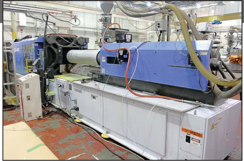
650-TON JSW J50EII INJECTION MOLDER

350 TON SUMITOMO SG350 INJECTION MOLDER , S/N 0037, (1990), 29 Oz. Shot Size, 28" Tie Bar Spacing, 2.5" Screw Diameter