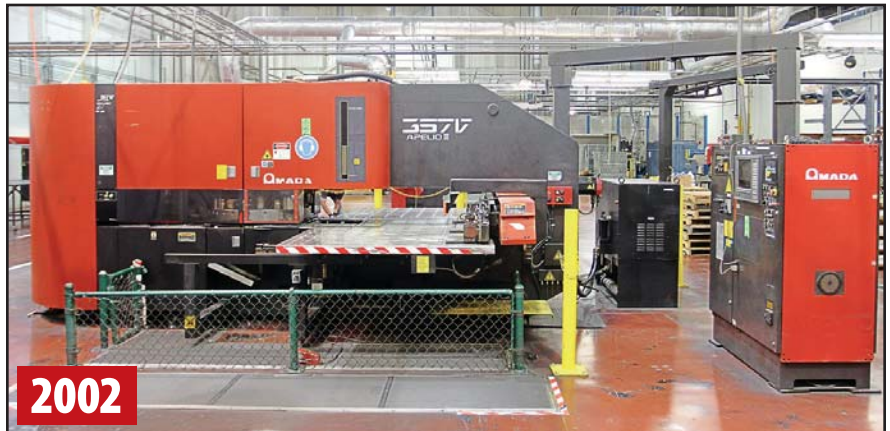
33-TON AMADA APELIO 357V CNC LASER PUNCH PRESS