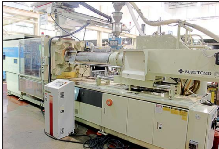
350-TON SUMITOMO SG350 INJECTION MOLDER