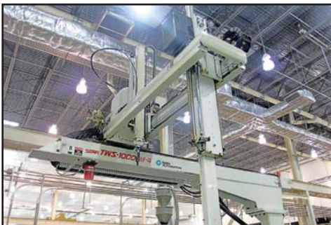
STAR AUTOMATION TWS-1000 FM-4 ROBOT