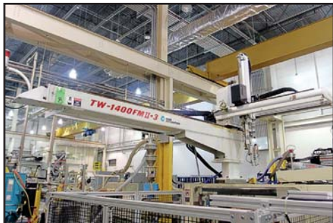
STAR AUTOMATION TW-1400FMII-3 ROBOT