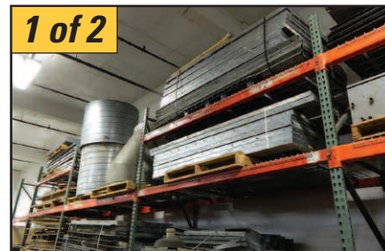
Spray Systems Down Draft Paint Booth