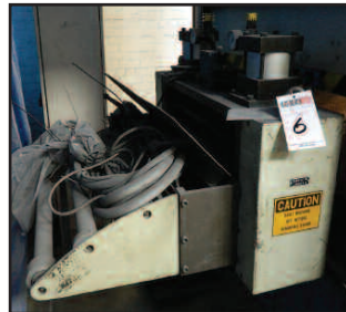
Electronic Roll Feed