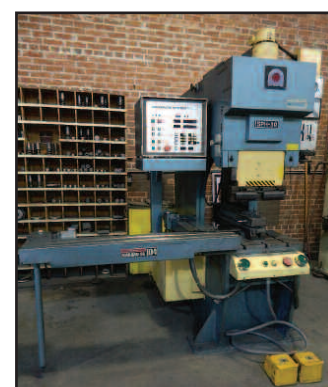
Amada Manual Hydraulic Punch Press