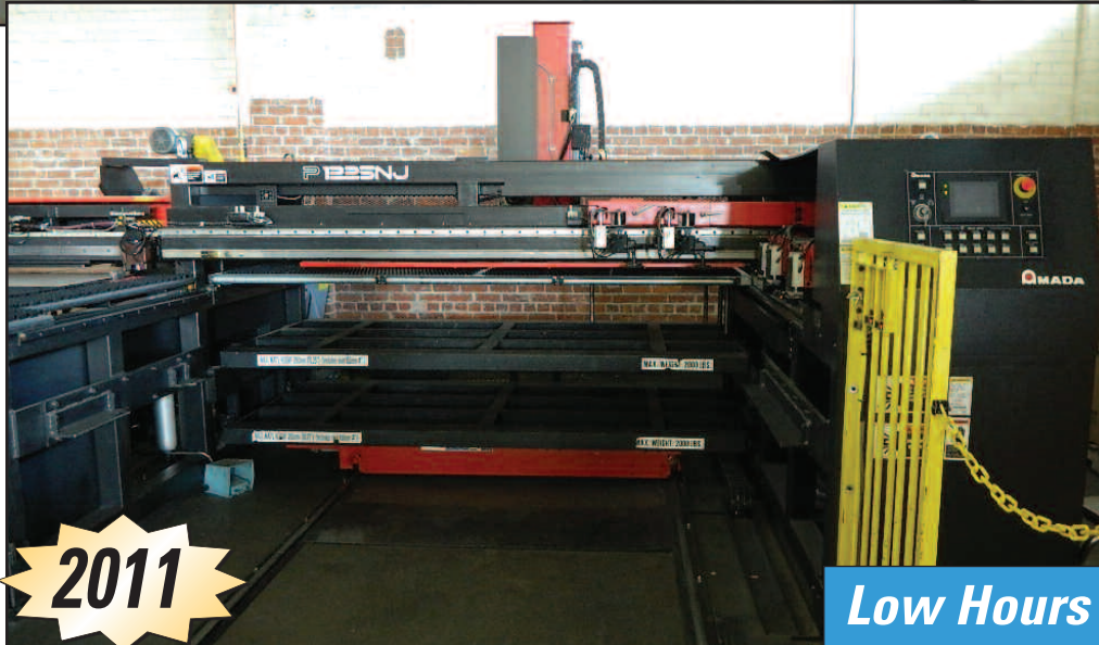
Amada CNC Load/Unload System