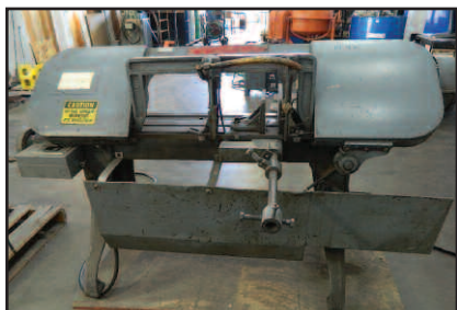
Kalamazoo Horizontal Bandsaw