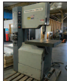
Rockwell Delta Vert. Bandsaw