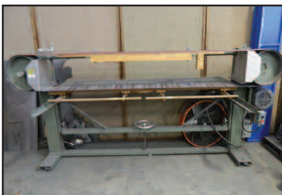
Rodger Long Belt Surface Sander