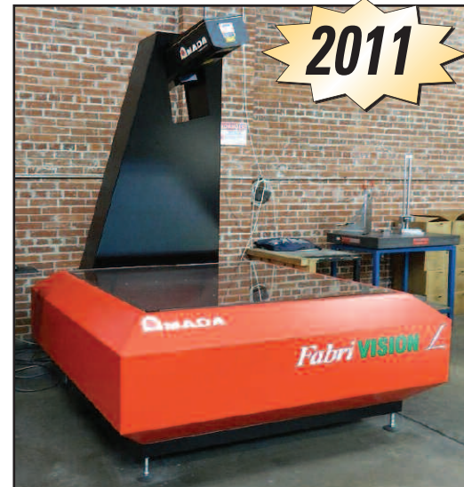
Amada FabriVISION Laser Inspections System