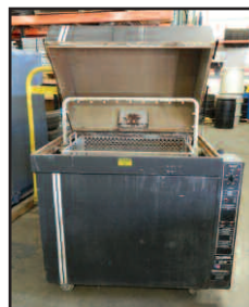
Landa Wash Tank