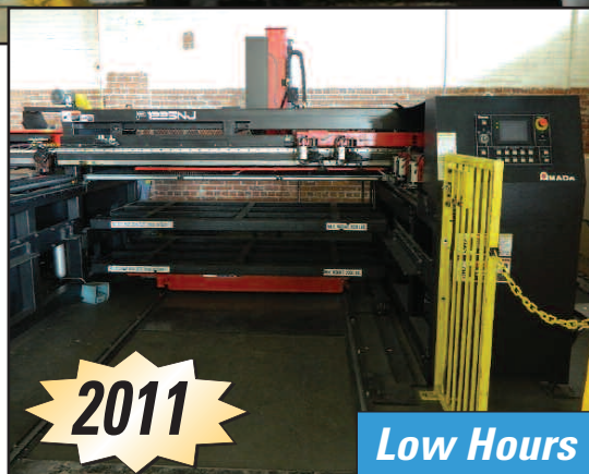
Amada CNC Load/Unload System