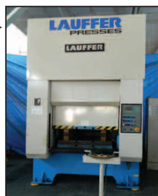
Lauffer RPS160 Hydraulic Press