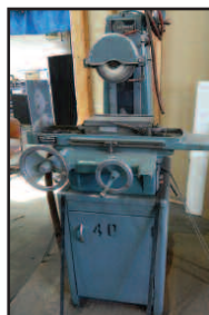
Harig Surface Grinder