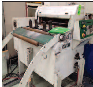
Orie Coil Feed Line