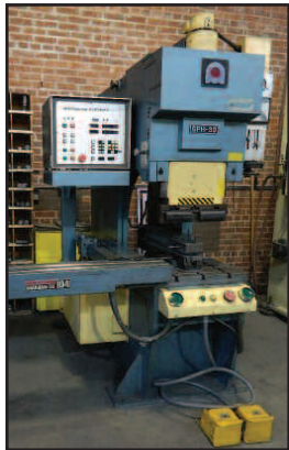
Amada Manual Hyd. Punch Press