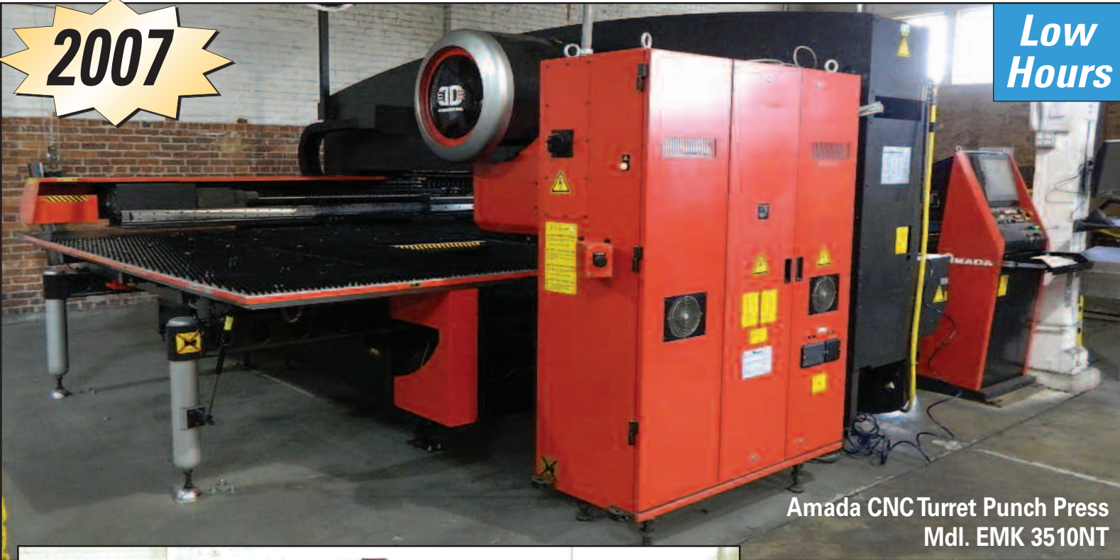
Amada CNC Turret Punch Press Mdl. EMK 3510NT