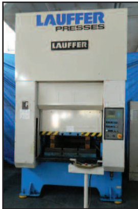
Laufer RPS160 Hydraulic Press