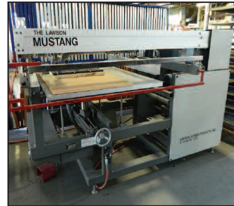
Lawson Mustang Flat Bed Silkscreen Printing Press