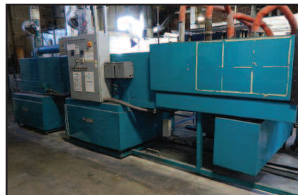
Landa Wash Line