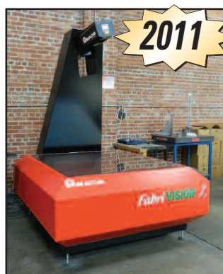
Amada FabriVISION Laser Inspections