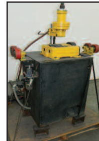
High Speed Pipe Cutter