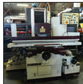
Chevalier Surface Grinder