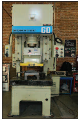
Komatsu Stamping Press