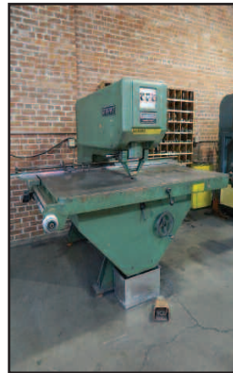
Strippit 30/30 Manual Punch