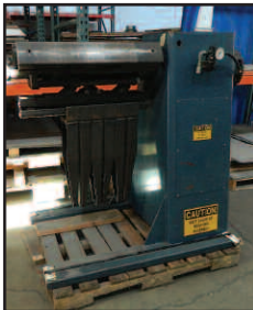
Rapid Air Slide Feeder