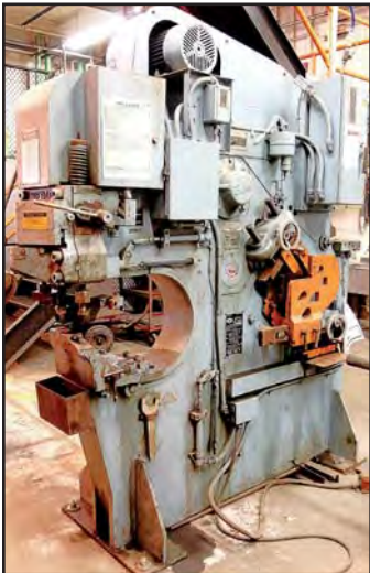
BUFFALO NO. 1-1/2D UNIVERSAL IRONWORKER