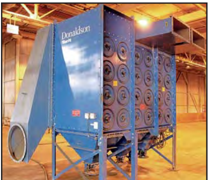
DONALDSON TORIT DFT4-48 24-CARTRIDGE DUST COLLECTOR

To discuss your requirements for an auction, please call Perfection Industrial 847-545-6374