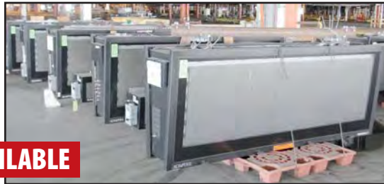
ADAPTIVE AND SCC PROGRAMMABLE ELECTRONIC DISPLAYS