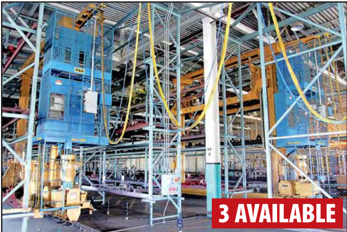
P&H LARGE PARTS STORAGE VEHICLE LIFT SYSTEMS