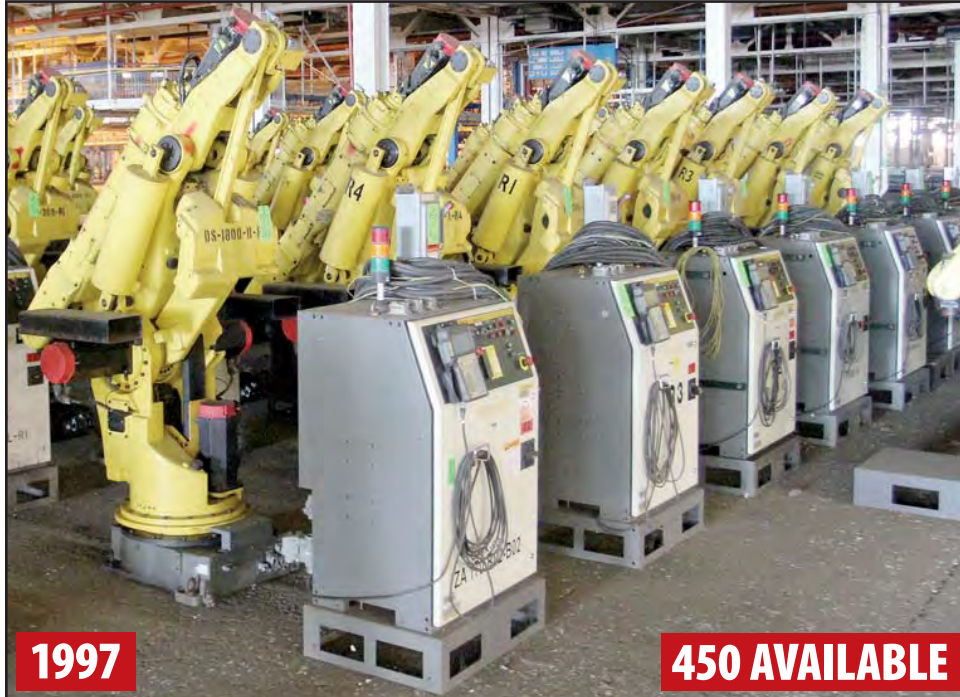
FANUC S-420I-W MULTI-AXIS ROBOTS W/FANUC R-J2 CONTROLS

Over 2,000 Lots Including: FANUC S-420iW, W2000-A, S-500 & GM FANUC P-155 Robots, Machinery & Equipment, Welding, Paint Booths & Ovens, Material Handling, Plant Support, Full Service Stainless Steel Kitchen & Scrap Opportunity