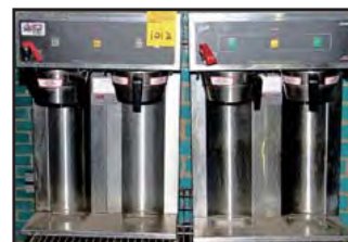
CURTIS COFFEE MAKERS