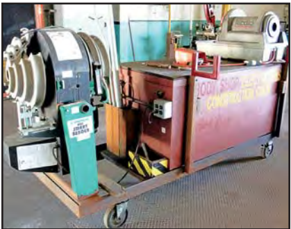
GREENLEE 855 SMART BEND W/RIDGID 300 PIPE THREADER