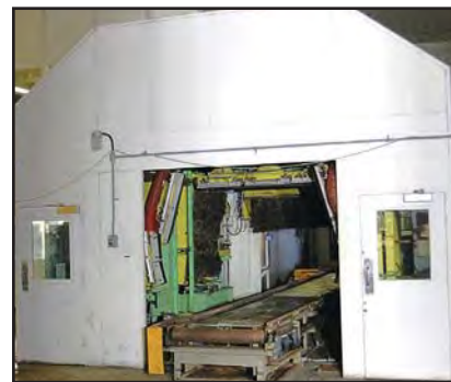
PRE-PAINT FEATHER ROLL SYSTEM