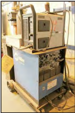
MILLER SYNCROWAVE 250 W/HYPERTHERM POWERMAX 1250