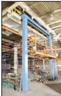
14' CENTER RIDING HYDRAULIC PLATFORM LIFT