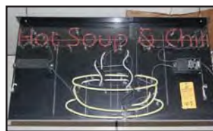
LIGHTED FOOD SIGNAGE