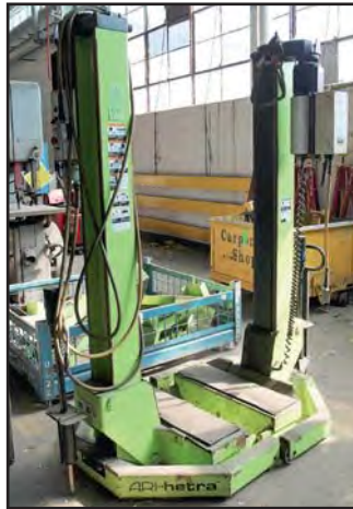
ARI-HETRA HDML-8-2 15,000 LB MOBILE VEHICLE LIFT

RITE-HITE HYDRAULIC DOCK LEVELERS W/VEHICLE RESTRAINT AND CONTROL PANEL