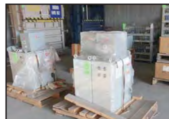
SQUARE D TRANSFORMERS AND SWITCHBOXES