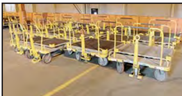
TOWABLE SHOP CARTS