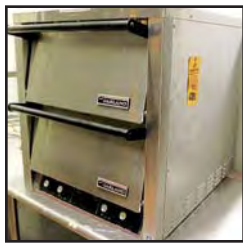
GARLAND CP0-ED-24H DOUBLE PIZZA OVEN