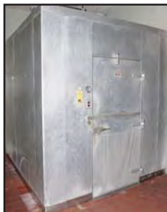
HARFORD WALK-IN COOLER