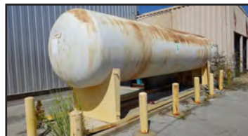
72" X 26' STEEL STORAGE TANK