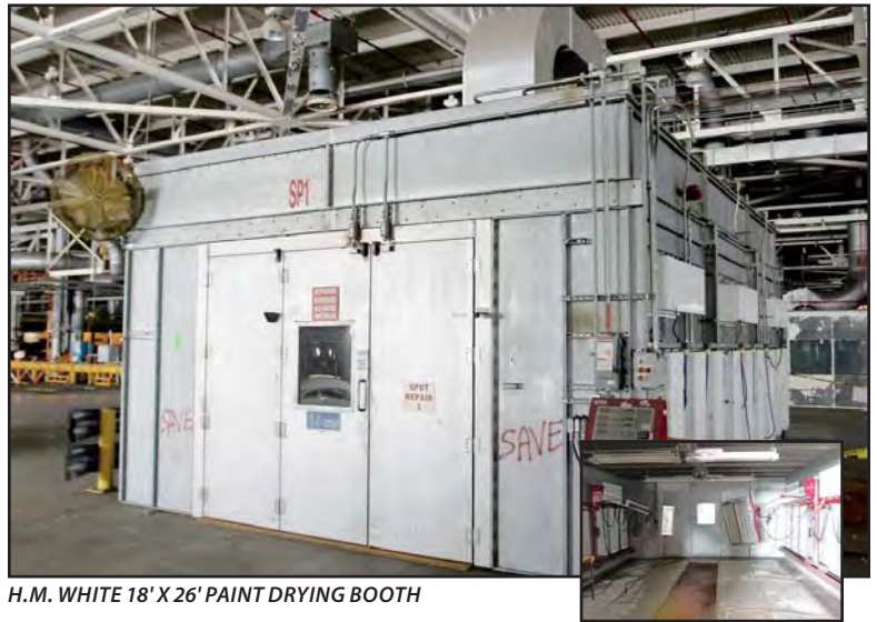
H.M. WHITE 18' X 26' PAINT DRYING BOOTH

ALSO AVAILABLE: PAINT DRYER HEATING UNITS, PAINT GUN WASHERS AND MORE