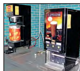
CAPPUCCINO AND ICED TEA MACHINES