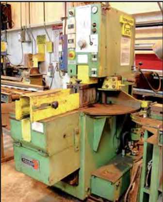
TRENNJAEGER LTS400 CIRCULAR COLD SAW