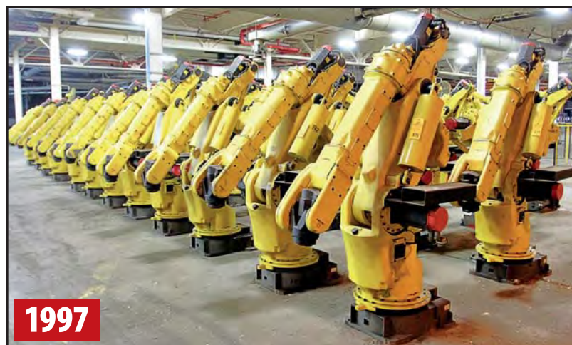
FANUC S-420I-W MULTI-AXIS ROBOTS W/FANUC R-J2 CONTROLS

RECONDITIONED BY FANUC FACTORY TRAINED TECHNICIAN