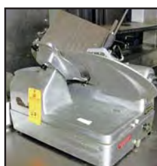
HOBART MEAT SLICER