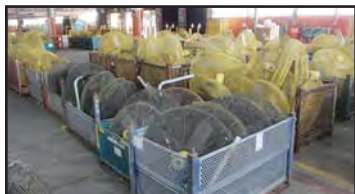
HUNDREDS OF SHOP FANS