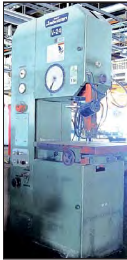
DAKE-JOHNSON V-24 24" VERTICAL BANDSAW