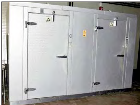
DURACOO 0W753A DOUBLE WALK-IN COOLER

Inspection: The inspection for assets located in all days of this sale will be held on Monday, October 17, 2016 from 8:00 AM to 4:00 PM EDT