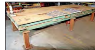
6' X 15' WELDING TABLE

(2) RIDGID 1224 PIPE THREADING MACHINE W/SET OF DIES