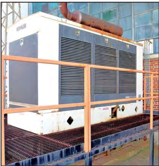
KOHLER 250RE0ZD GENERATOR W/ DETROIT DIESEL SERIES 60 ENGINE

(3) P&H LARGE PARTS STORAGE VEHICLE LIFT SYSTEMS