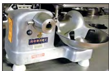
HOBART FOOD PROCESSOR