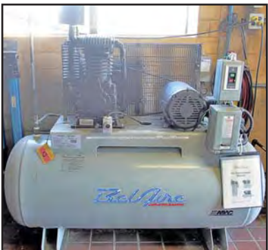
BELAIRE 5312HE AIR COMPRESSOR W/120 GALLON TANK