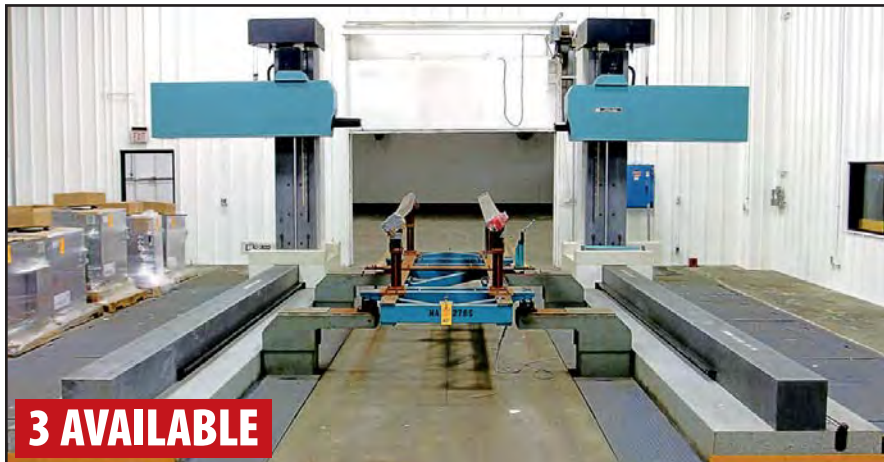
LK METRE FOUR COORDINATE MEASURING MACHINES

Sale Closing From: Thursday, October 20, 2016 at 11:00 AM EDT