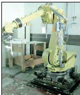
FANUC R-2000IA MULTI-AXIS ROBOT W/FANUC SYSTEM R-J3IB CONTROLS