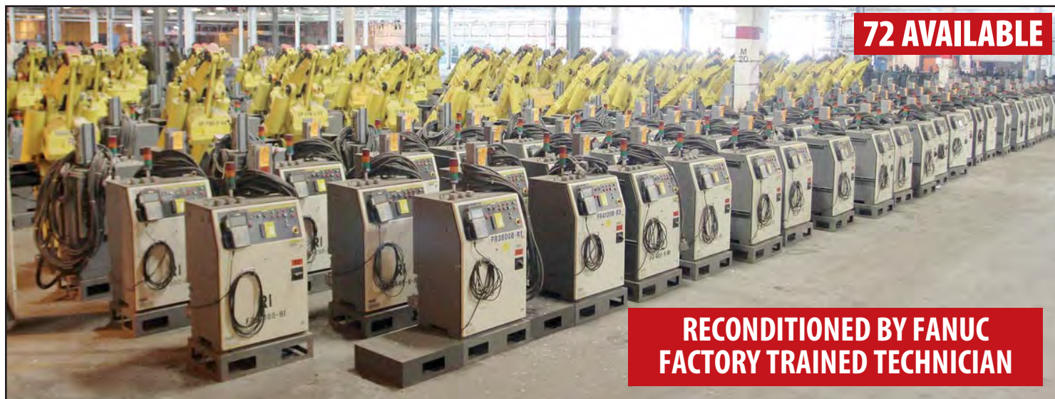
FANUC S-420I-W MULTI-AXIS ROBOT W/FANUC R-J2 CONTROLS

Inspection: The inspection for assets located in all days of this sale will be held on Monday, October 17, 2016 from 8:00 AM to 4:00 PM EDT