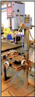
ARBOGA A 2608W DRILL PRESS

ALSO AVAILABLE: LARGE SELECTION OF GREENLEE PIPE BENDERS, PIPE THREADERS, PAINT POTS AND ACCESSORIES AND MUCH MORE