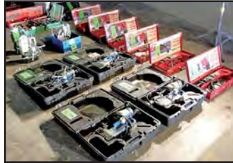
MAG DRILLS AND SAWZALLS

(15) HILTI CORDLESS DRILLS, Hammer Drills and Rotary Hammers