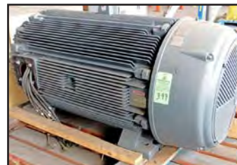
600 HP US ELECTRIC MOTOR