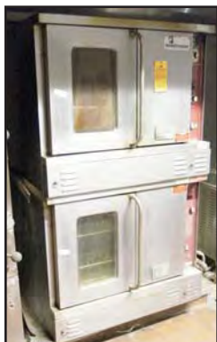
SOUTHBEND MARATHONER DOUBLE OVEN UNIT

Online Bidding at www.perfectionindustrial.com