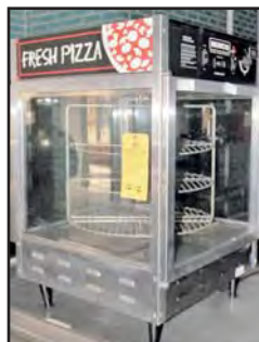
NEMCO PIZZA WARMER