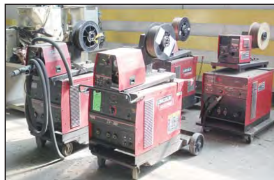
ASSORTMENT OF LINCOLN WELDERS

(2) MILLER AUTO INVISION II WELDING POWER SOURCES