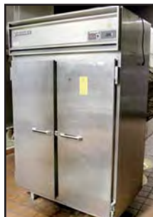
VICTORY 52" DOUBLE- DOOR REFRIGERATOR