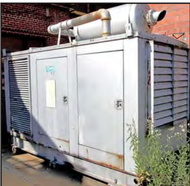
ONAN 230 0 DFP-17R-20074L ELECTRIC STAND-BY GENERATOR