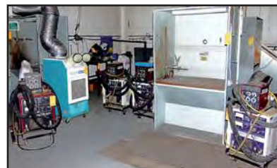
WELDING TRAINING LAB

Online Bidding at www.perfectionindustrial.com