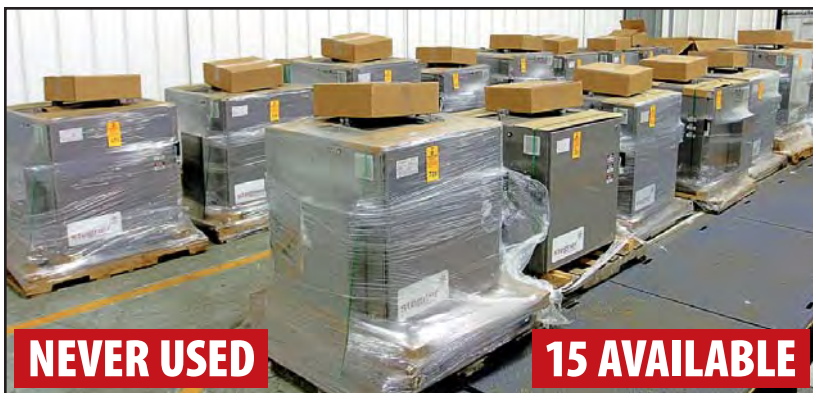
2011 STEGNER STG-800-M TYPE PS16300.105L1 ABSOLUTE PRESSURE TRANSMITTERS

To discuss your requirements for an auction, please call Perfection Industrial 847-545-6374