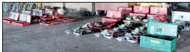
VIEW OF MILWAUKEE BANDSAWS AND JOB BOXES

ALSO AVAILABLE: SNAP-ON AND KENNEDY TOOL BOXES, LYON TOOL CABINETS, FLAMMABLE LIQUIDS CABINET AND MORE