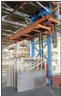
16' HYDRAULIC PLATFORM LIFT