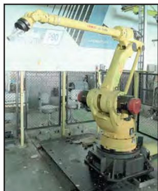
FANUC S-500 MULTI-AXIS ROBOT