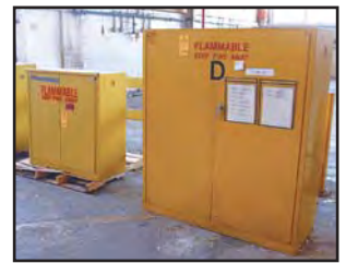
VIEW OF FLAMMABLE CABINETS