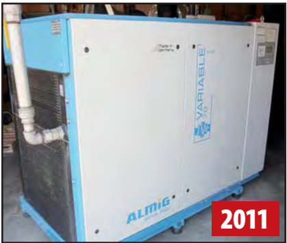
ALMIG VARIABLE 70/100 100 HP AIR COMPRESSOR