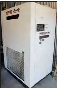
INGERSOLL RAND DXR800 REFRIGERATED AIR DRYER

DONALDSON TORIT DFT4-48 24-CARTRIDGE DUST COLLECTOR, s/n 1974997-1