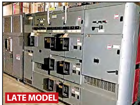
LATE MODEL SQUARE D HLV-LOAD INTERRUPTER SWITCH UNIT AND POWER ZONE SWITCHGEAR

Inspection: The inspection for assets located in all days of this sale will be held on Monday, October 17, 2016 from 8:00 AM to 4:00 PM EDT