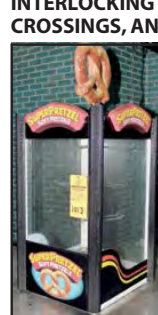
SUPER PRETZEL WARMING OVEN