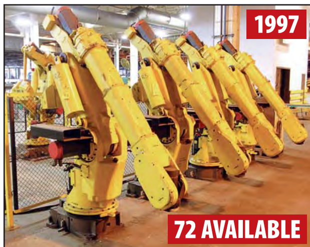
FANUC S-420I-W MULTI-AXIS ROBOT W/FANUC R-J2 CONTROLS