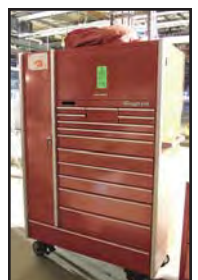
SNAP-ON MOBILE TOOL CHEST

View our current auction schedule at www.perfectionindustrial.com