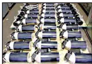
PAINT ROBOT HEADS AND SPARES