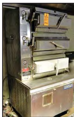
CLEVELAND TRIPLE OVEN