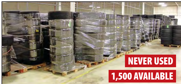
GOODYEAR EAGLE F1 LOW PROFILE 255/35R22 99A AND 285/35R22 102W "SUPER CAR" TIRES

Inspection: The inspection for assets located in all days of this sale will be held on Monday, October 17, 2016 from 8:00 AM to 4:00 PM EDT