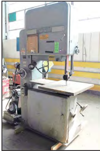
TANNEWITZ PV1N VERTICAL BANDSAW

Inspection: The inspection for assets located in all days of this sale will be held on Monday, October 17, 2016 from 8:00 AM to 4:00 PM EDT