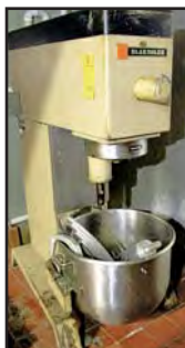
BLAKESLEE DD-801 HEAVY-DUTY MIXER