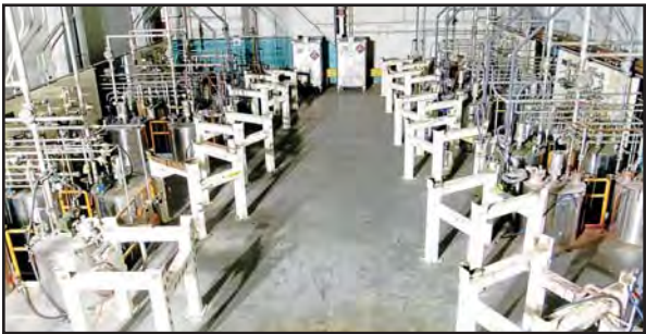
COMPLETE PAINT KITCHEN