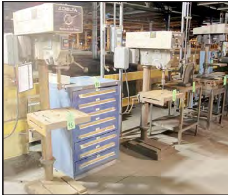
VIEW OF DRILL PRESSES

Online Bidding at www.perfectionindustrial.com