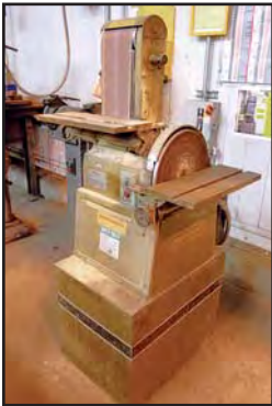
POWERMATIC 30B BELT SANDER