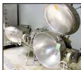
32" STEAM KETTLES