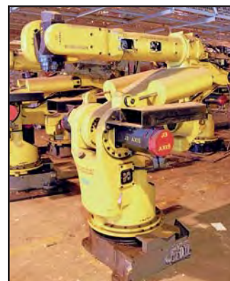
FANUC S-420I-W 6-AXIS ROBOTS W/FANUC R-J2 CONTROLS