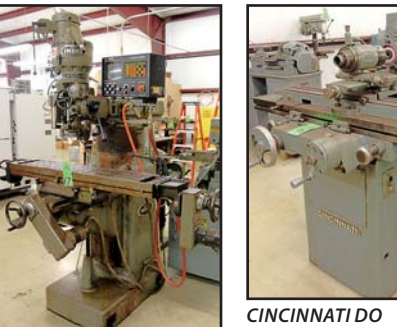
WELLS INDEX 847 KNEE MILL