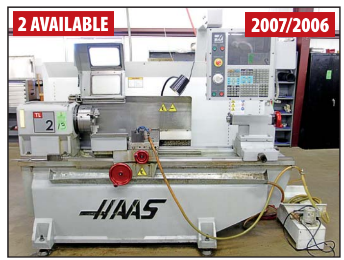
HAAS TL-2 CNC TOOL ROOM LATHE

Wednesday, September 16, 2015 from 9:00 AM-4:00 PM CDT