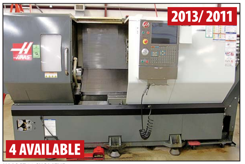
HAAS ST-30 CNC LATHE

< HAAS VF-2 4-AXIS CNC VERTICAL MACHINING CENTER