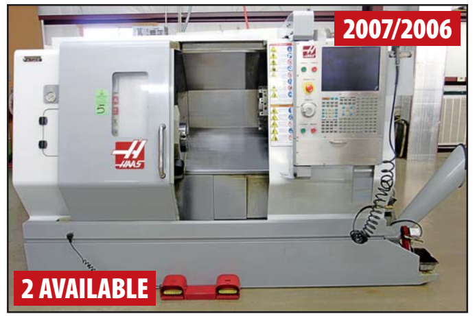
HAAS SL-20T CNC LATHE