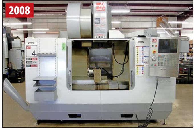
HAAS VF-4B 4-AXIS CNC VERTICAL MACHINING CENTER