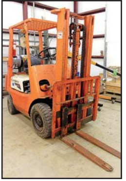
TOYOTA 3FG15 3,000-LB. LP FORKLIFT