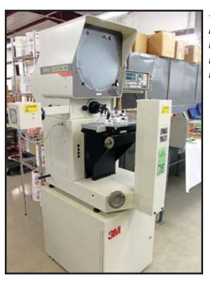
ΜΙΤυτογο PH-3500 PROFILE PROJECTOR

HANKISON HPRP100-115 COMPRESSED AIR DRYER. S/N H100A1151609909070, 100 SCFM @ 100 PSIG, 200 PSIG Max. Working Pressure