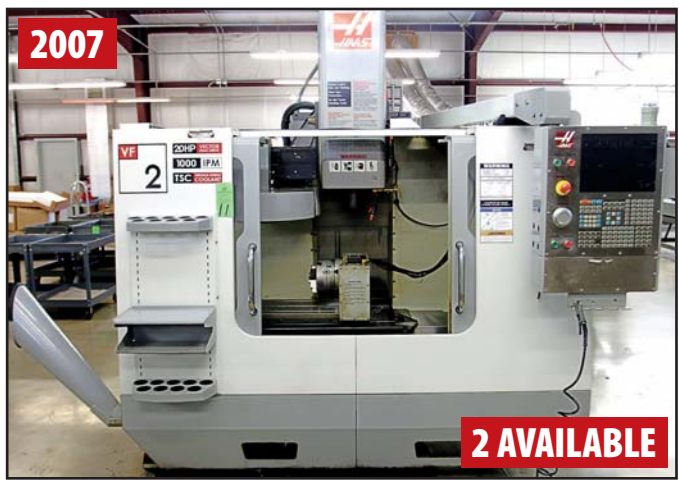
HAAS VF-2D 4-AXIS CNC VERTICAL MACHINING CENTER