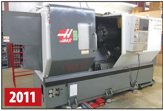
HAAS ST-30 CNC LATHE