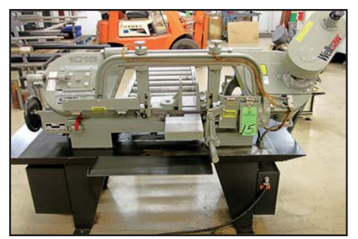
WELLSAW 1016 HORIZONTAL BANDSAW