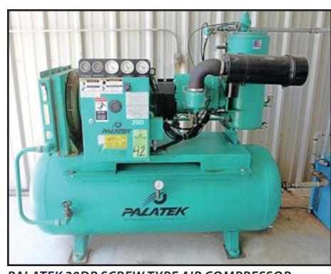
PALATEK 20DR SCREW TYPE AIR COMPRESSOR

MILLER MILLERMATIC 175 MIG WELDER, S/N LE428376, Single Phase