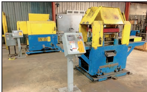
4-POST CUT-OFF CELL