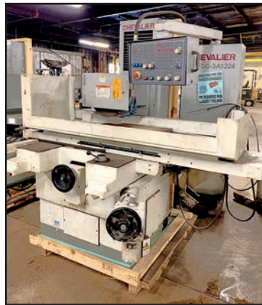
CHEVALIER FSG-3A1224 SURFACE GRINDER

(4) KENT, MHT AND REID SURFACE GRINDERS, (8) BRIDGEPORT, LAGUN AND ACRA VERTICAL MILLS, LEBLOND, AMERICAN AND SOUTH BEND LATHES, DRILL PRESSES, DO-ALL, GROB, JET, POWERMATIC, WF WELLS, KALAMAZOO AND ROCKWELL BANDSAWS AND MORE