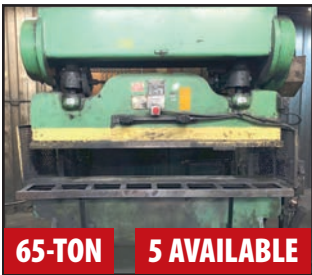
VERNON PRESS BRAKE

Sale Location: 3040 Junior Order Home Road, Lexington, North Carolina 27292