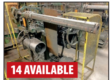
FABRIC/CHAIN LINK MAKING MACHINE

To discuss your requirements for an auction, please call Perfection Industrial +1-847-427-6374