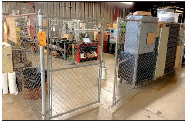
MAINTENANCE CAGE W/CONTENTS

ALSO: MAINTENANCE CAGE INCLUDING STORAGE AND CONTENTS, ELECTRICAL ROOM CONTENTS INCLUDING MOTORS, WIRE, CONDUIT, SWITCHES AND MORE, CUBBY RACKS W/LARGE ASSORTMENT OF PUNCHES, RIVETERS, SECTIONS OF ROACH ROLLER CONVEYOR, HUNDREDS OF ASSORTED STEEL TUBS, SMOG-HOG AIR CLEANERS, FLOOR SCALES, ELECTRIC PALLET TILTERS, STEEL TABLES, POWER AND HAND TOOLS, FLAMMABLE LIQUIDS CABINETS, SHOP LADDERS, ROLLING CARTS, BANDING CARTS, MATERIAL CARTS, COMPUTER KIOSKS, BREAK ROOM, OFFICE FURNITURE AND MUCH MORE!