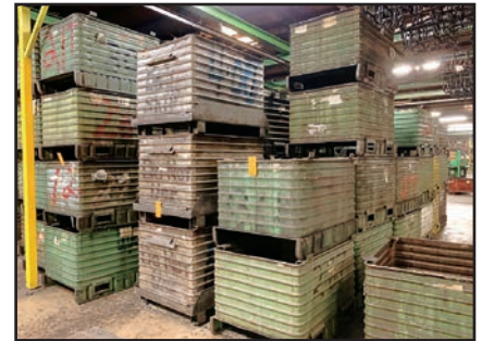
HUNDREDS OF STEEL TUBS