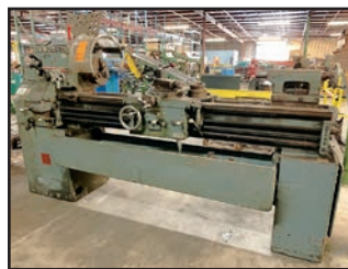
LEBLOND TOOL ROOM LATHE