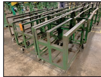
ASSORTED MATERIAL CARTS