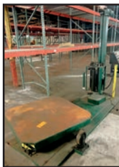
INFRAPAK EZ-DOES-IT POWER PLUS PALLET WRAPPING MACHINE