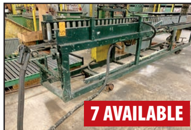
5-PANEL GLUE MACHINE LINE