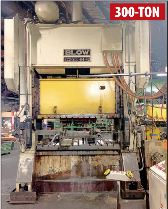
BLOW SC2-300-84-42 SSDC PRESS

250-TON STAMTEC S2-250 STRAIGHT SIDE DOUBLE CRANK PRESS , s/n S90928, 144.20" x 48.07" Bolster Area, 20–40 SPM, 15.75" Stroke, 30.14" Die Height, 9.85" Slide Adj.