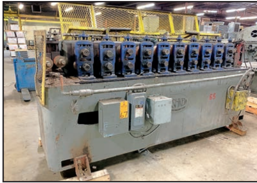
TISHKEN 10 HMW11 10-STAND ROLLFORMER