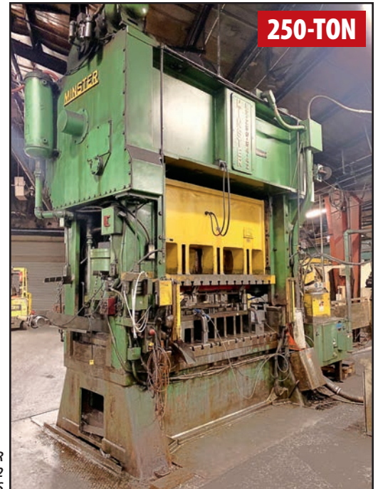
MINSTER E2-250-84-42 SSDC PRESS

FEATURING: Straight Side & Gap Frame Presses, Coil Feed Lines, Hydraulic & Mechanical Press Brakes, Tube Benders, Conventional Machine Tools, Burn-Off Oven, Air Compressors, Pallet Wrapper & More