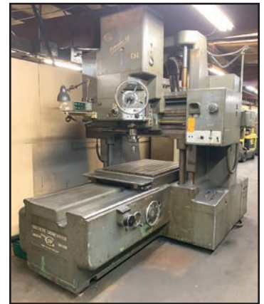
SIP HYDROPTIC-6A JIG BORER