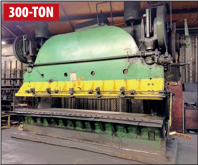
CINCINNATI PRESS BRAKE

Sale Closing From: Thursday, July 11 at 9:00 AM ET Inspection: Wednesday, July 10 from 8:00 AM to 4:00 PM ET or by Special Appointment