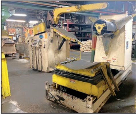
COE COIL LINE (WEAN UNITED SC2-300-72-36 FEED LINE)