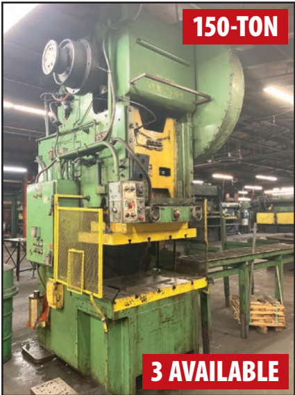
VERNON 150 OBG PRESS