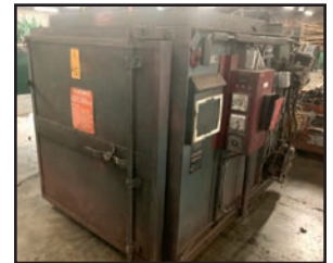
CONTROLLED PYROLYSIS PTR-52-112 BURN-OFF OVEN