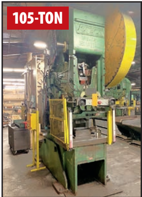
VERNON V-7 1/2 OBI PRESS