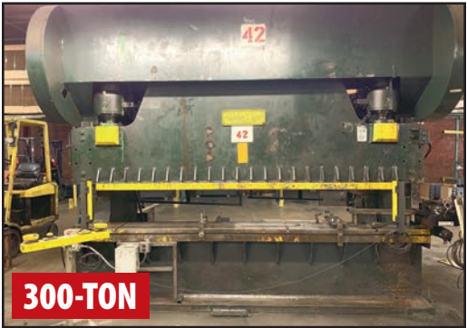
STEELWELD J4-1/2-10 PRESS BRAKE