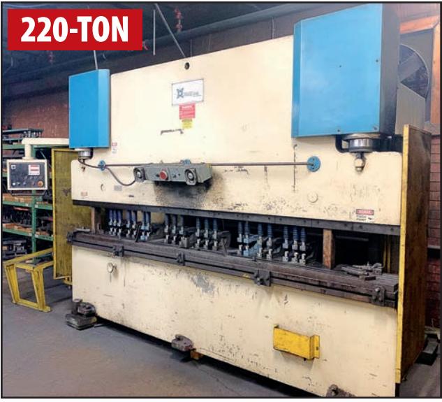
DURMAZLAR HAP 37200 PRESS BRAKE