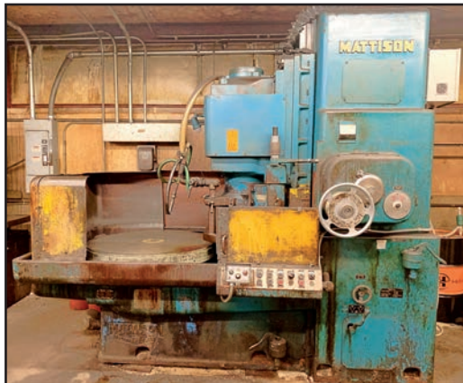
MATTISON #24 ROTARY SURFACE GRINDER