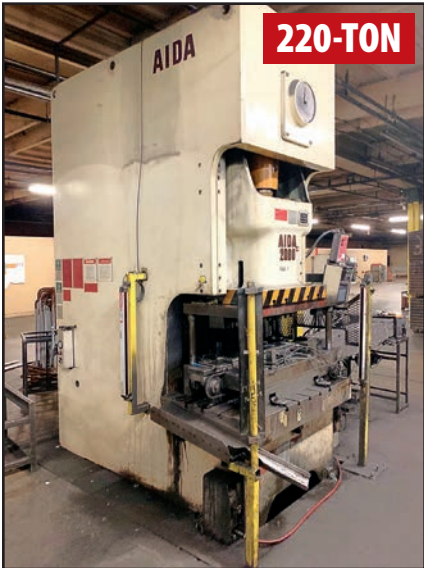
AIDA NC1-2000(2)E GAP FRAME PRESS