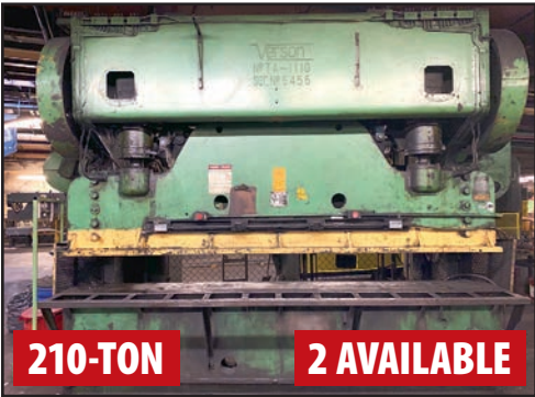
VERNON TA-1110 PRESS BRAKE

300-TON CINCINNATI PRESS BRAKE, 14'6" OA, 30" Bed Width, 12'6" Between Housings (Approx. Tonnage)