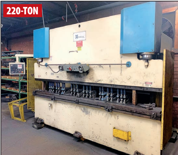
DURMAZLAR HAP 37200 PRESS BRAKE

Assets Surplus to the Ongoing Operations of