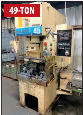
KOMATSU OBS 45-3 GAP FRAME PRESS