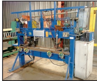
JENZANO & ASSOCIATES DUAL HEAD SPOT WELD SYSTEM