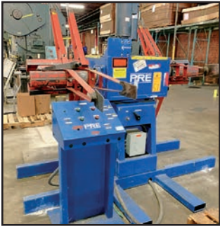
PRESS ROOM EQUIPMENT PRO-124000-DCS UNCOILER

ASSORTED UNCOILERS, STRAIGHTENERS AND SERVO FEEDS