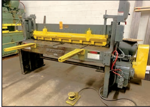
WYSONG 1472 SHEAR