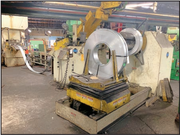
COE COIL LINE (BLOW SC2-300-84-42 FEED LINE)