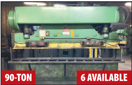
VERNON PRESS BRAKE

(15) VERNON AND CHICAGO DREIS & KRUMP PRESS BRAKES, from 90–60-Ton Capacity, Various Configurations