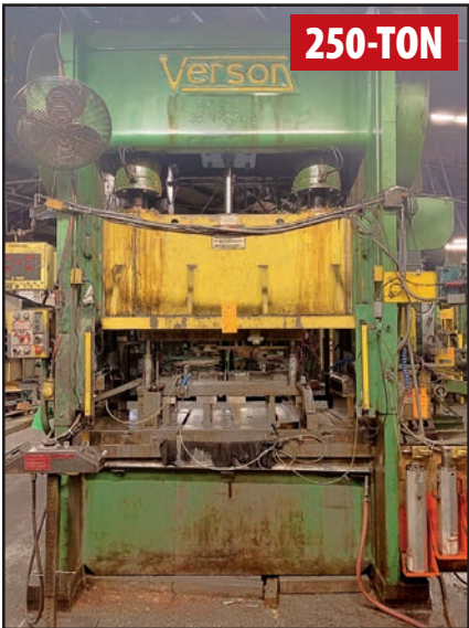
VERNON 250-B2-72 SSDC PRESS