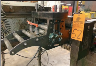
PA INDUSTRIES SRF-55-5A SERVO FEED