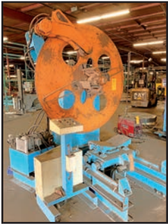
FREEDOM MILL UCS-4HC-250 UNCOILER