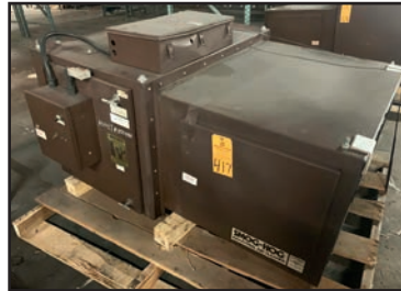
SMOG-HOG AIR CLEANERS