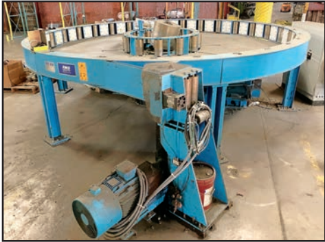
FREEDOM MILL HAC-D-6-3 COILING MILL

Sale Closing From: Thursday, July 11 at 9:00 AM ET Inspection: Wednesday, July 10 from 8:00 AM to 4:00 PM ET or by Special Appointment