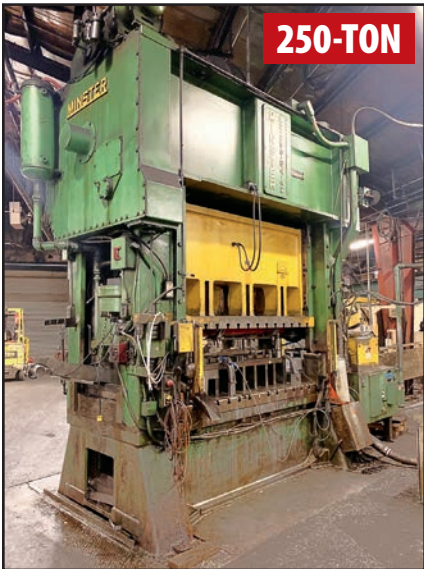
MINSTER E2-250-84-42 SSDC PRESS