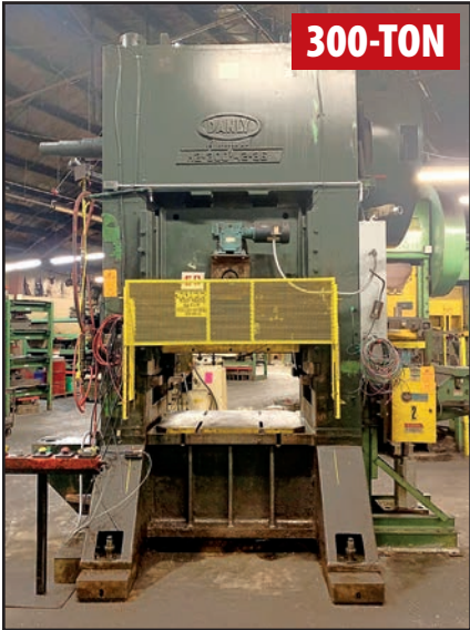
DANLY H2-300-42-36 SSDC PRESS

FEDERAL F3 PUNCH PRESS , s/n 3-2670, 125 SPM