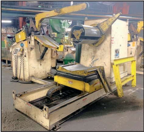
COE COIL LINE (MINSTER E2-250-84-42 FEED LINE)

COE COIL LINE COMPRISING, COE CPR-PO-15024 Series 32983-3 Coil Cradle/Uncoiler, COE CPPS-350-24 Series 32983-2 Coil Feed Straightener, and COE Feeder (Originally Equipped on Lot #2: Minster E2-250-84-42)