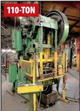
DANLY OBI PRESS