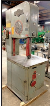
DO-ALL VERTICAL SAW