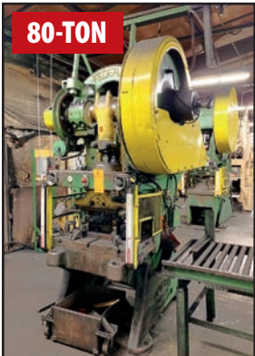
FEDERAL NO. 7 OBI PUNCH PRESS