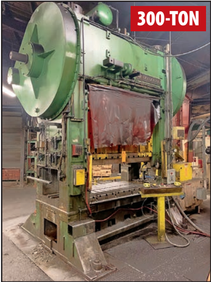
WEAN UNITED SC2-300-72-36 SSDC PRESS