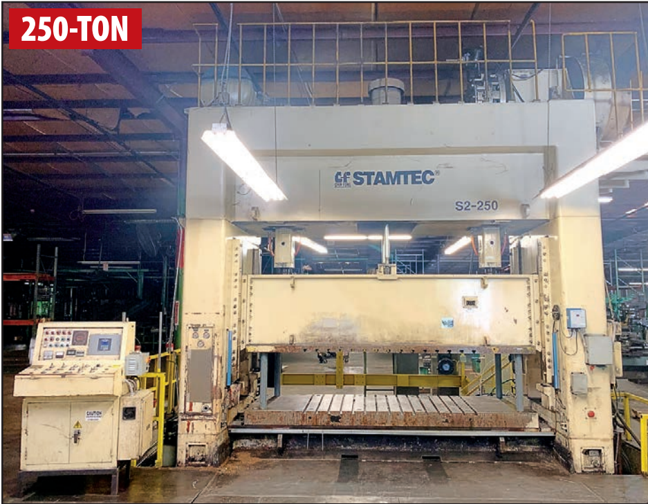
STAMTEC S2-250 SSDC PRESS