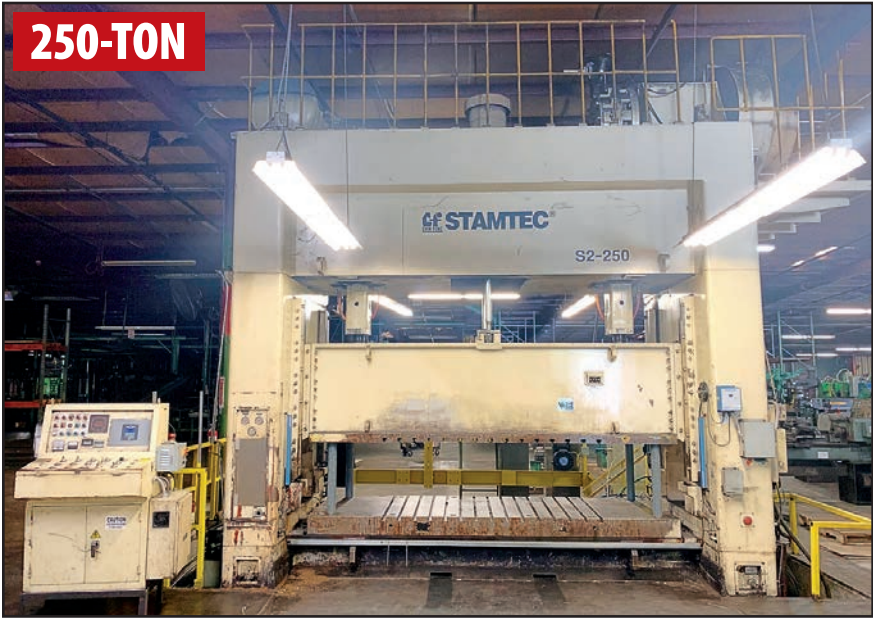
STAMTEC S2-250 SSDC PRESS

300-TON BLOW SC2-300-84-42 STRAIGHT SIDE DOUBLE CRANK PRESS , s/n SDG-300-547-01, 84" x 42" Bed 10" Stroke, 30–70 SPM, 25" SH, 10" Slide Adj.