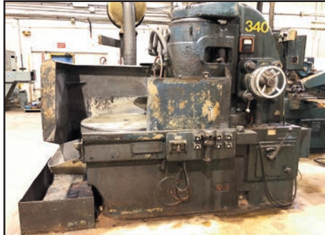
BLANCHARD NO 18 ROTARY SURFACE GRINDER