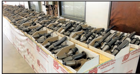
CAT 50 AND 40 TOOL HOLDERS