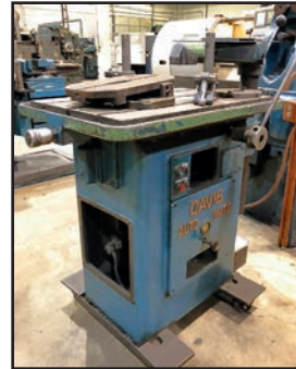
DAVIS 15 KEYSEATER