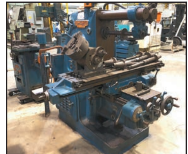
KEARNEY & TRECKER 2CH HORIZONTAL MILL