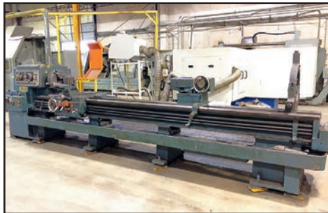
LODGE & SHIPLEY 24" X 120" GEARED HEAD LATHE