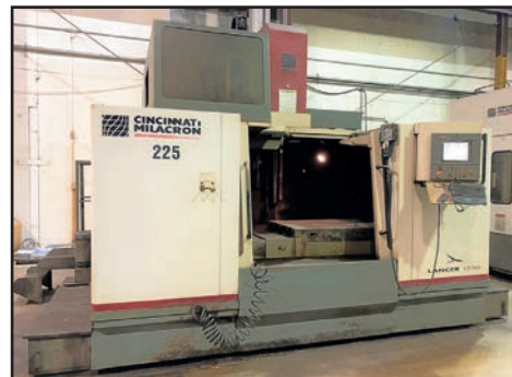
CINCINNATI MILACRON LANCER 1250 VERTICAL MACHINING CENTER