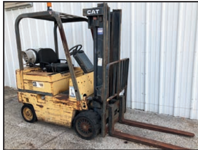
CATERPILLAR T40D LP FORKLIFT