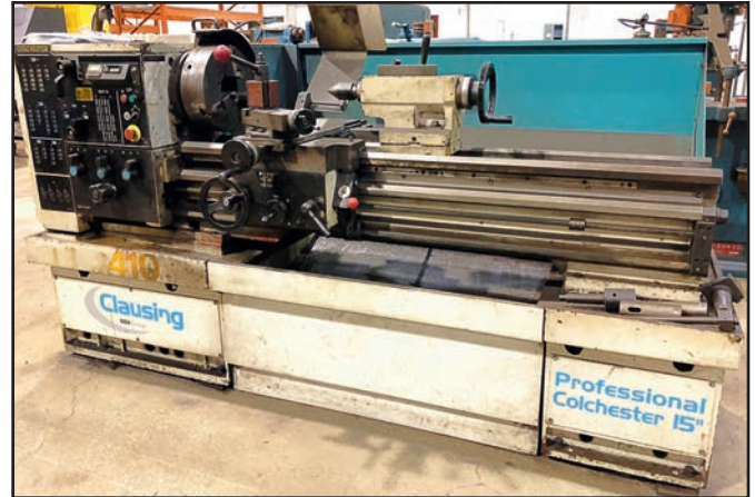
CLAUSING COLCHESTER 690 TRIUMPH/15VS GEARED HEAD LATHE