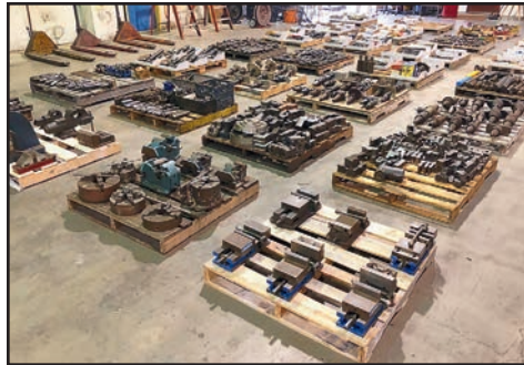
LARGE ASSORTMENT OF TOOLING