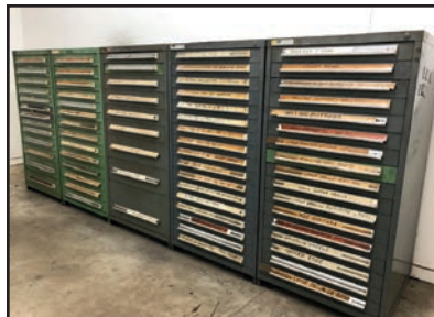
VIDMAR BALL BEARING TOOL CABINETS

LARGE ASSORTMENT OF CAT 50 AND CAT 40 TOOL HOLDERS , 4th Axis Rotary Tables, End Mills, Carbide Inserts, Tooling, Vidmar Ball Bearing Tool Cabinets, Machine Parts, Electronics, Drives, Boards, Monitors, and Much More