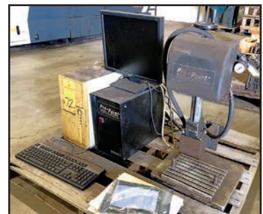
MATTHEWS PRO-POINT 2324 INDENTING SYSTEM

To discuss your requirements for an auction, please call Perfection Industrial +1-847-545-6374