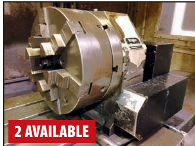
TROYKE DL-12-B 4TH AXIS ROTARY TABLE