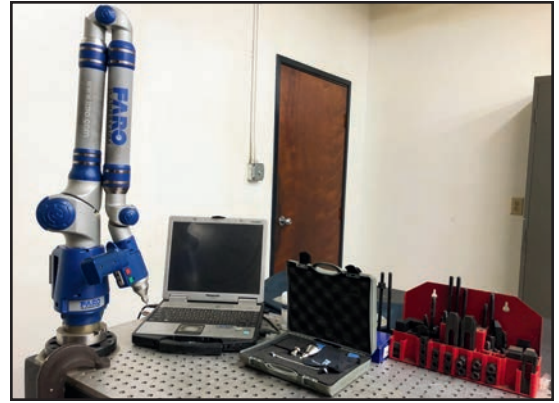
FARO PLATINUM SERIES 3D MEASUREMENT SYSTEM