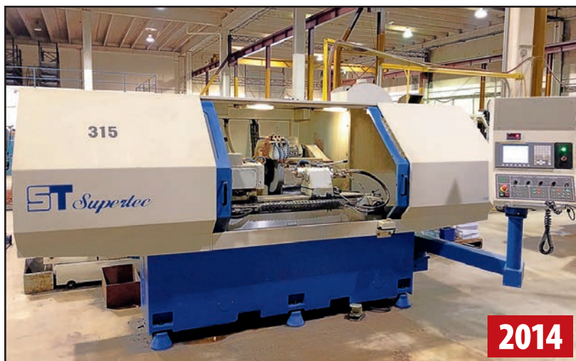
SUPERTEC G38P-60CNC CYLINDRICAL CNC GRINDER

Sale Closing From: Tuesday, November 12th at 1:00 PM CT