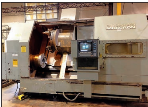
CINCINNATI MILACRON CINTURN 2220U-80 CNC LATHE