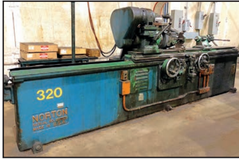
NORTON 261 UNIVERSAL OD GRINDER