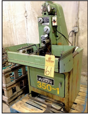
SUNNEN MBB1660 PRECISION HONE