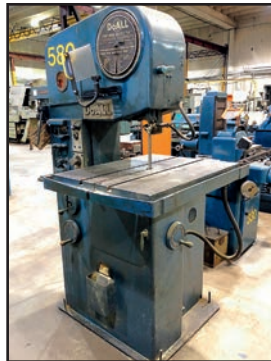
DOALL 16-3 VERTICAL BANDSAW