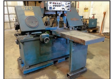
DOALL 1216-A HORIZONTAL BANDSAW