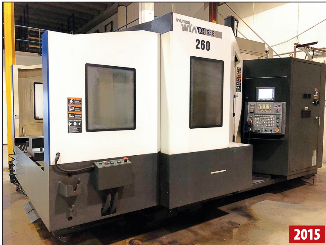
HYUNDAI WIA KH63G HORIZONTAL MACHINING CENTER

FACILITY CLOSURE – LEADING MANUFACTURER OF NEW PARTS FOR ENGINES & COMPRESSORS