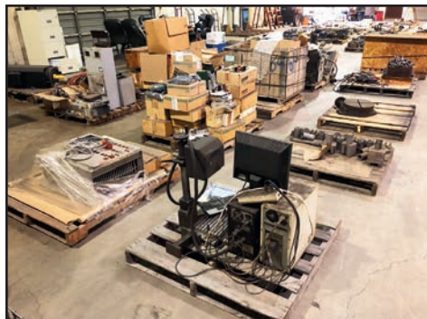
ASSORTED MACHINE PARTS, ELECTRONICS AND MORE

Online Bidding at www.perfectionindustrial.com