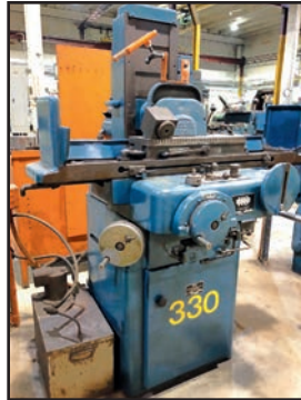
KO LEE S618H SURFACE GRINDER

DOALL 16-3 VERTICAL BANDSAW, s/n 50-58848, 3 HP, 16" Capacity, 1-1/4" x 13'5" Blade, Power Feed Table