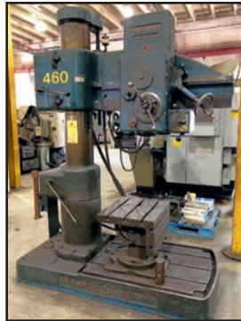
AMERICAN HOLE WIZARD 4' X 11" RADIAL ARM DRILL