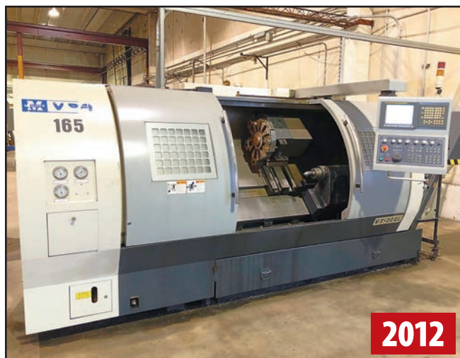
MIGHTY VIPER VT-30GL CNC TURNING CENTER

FEATURING: CNC VERTICAL & HORIZONTAL MACHINING CENTERS, CNC TURNING, CNC GRINDING, CONVENTIONAL MACHINE TOOLS, TOOL ROOM, FABRICATION, WELDING, INSPECTION & FACILITY SUPPORT