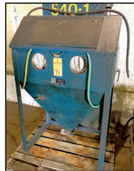
TRINCO 36-BP2 BLAST CABINET