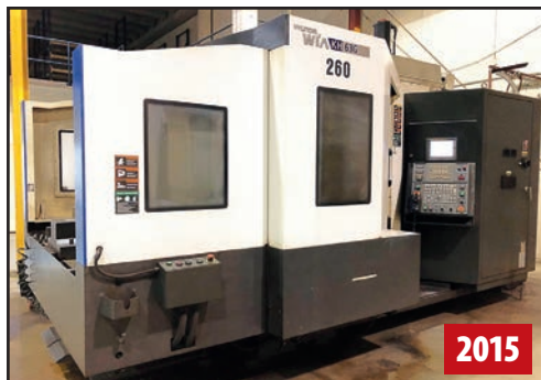
HYUNDAI WIA KH63G HORIZONTAL MACHINING CENTER

FACILITY CLOSURE – LEADING MFR. OF NEW PARTS FOR ENGINES & COMPRESSORS