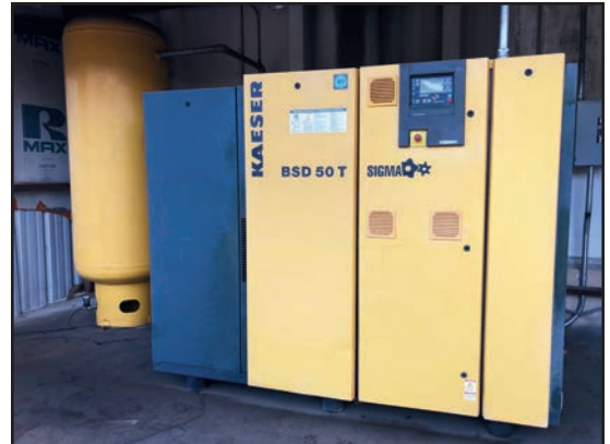
KAESER BSD 50T AIR COMPRESSOR