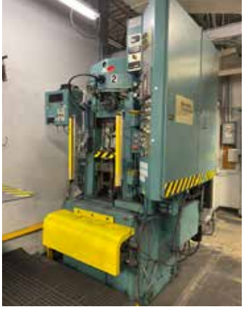
MANNESMANN MPM 15 16 TON POWDER COMPACTING PRESS