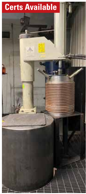
AVURE 20" COLD ISOSTATIC PRESS