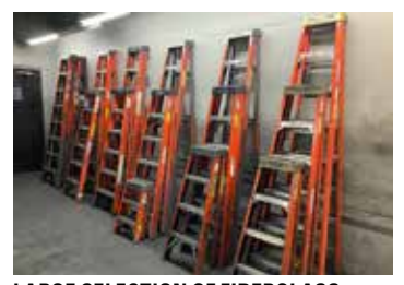
LARGE SELECTION OF FIBERGLASS LADDERS