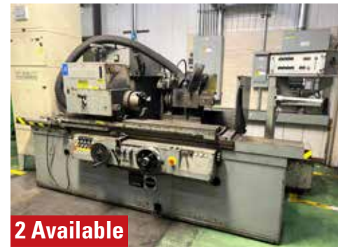
KARSTENS K11 OD GRINDER

Unknown Make Lathe w/ ANILAM 4200T CNC Control, 6" 6-Jaw Chuck, 10" Swing, 30" Centers