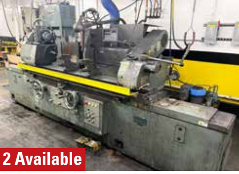
OKUMA GP30 CNC PLAIN CYLINDRICAL GRINDER

KARSTENS K 20-22 OD Grinder, s/n 82 053 10 22 1, w/ 12" 6-Jaw Chuck, 22" Swing Over Table, UNITRONICS PLC, NEWALL DP700 DRO