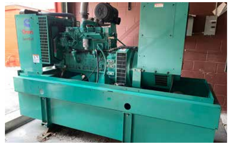
CUMMINS 80DGDA GENERATOR