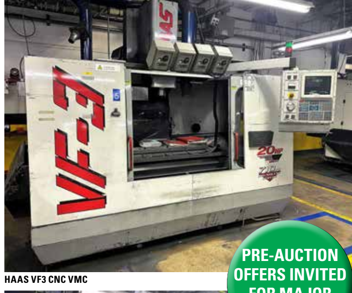
FOR MAJOR ASSETS BMC 30/D 2