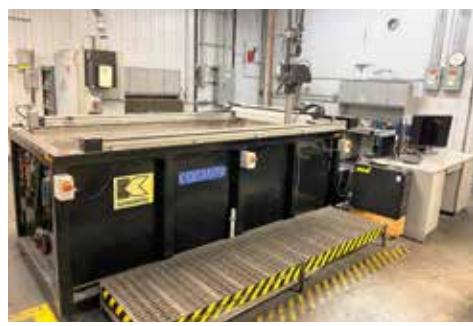
ULTRASONIC WASH TANK SYSTEM