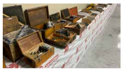
VIEW OF OUTSIDE MICROMETERS