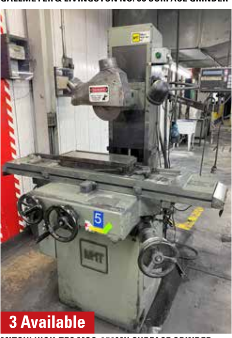
MITSUI HIGH-TEC MSG-250MH SURFACE GRINDER