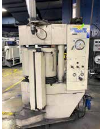
SMITHS MONOSTATIC 200E POWDER PRESS