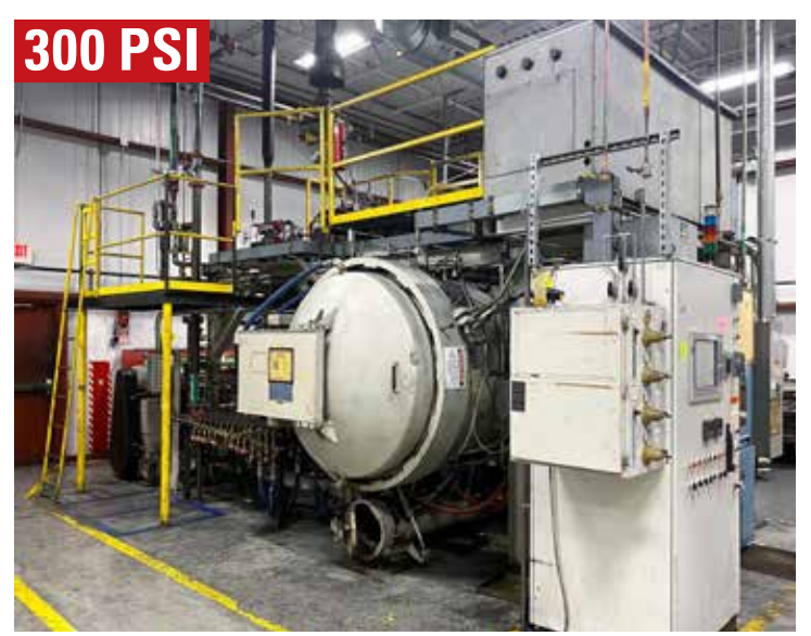
ULTRA TEMP SINTER HIP FURNACE