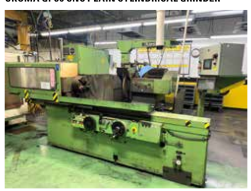
KARSTENS K 20-22 OD GRINDER