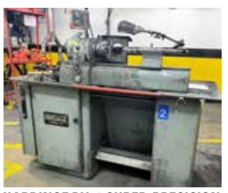
HARDINGE DV59 SUPER-PRECISION LATHE