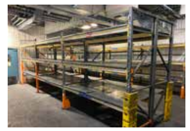
LARGE SELECTION OF PALLET RACKING

QUINCY 350 10 HP Air Compressor, s/n 403376