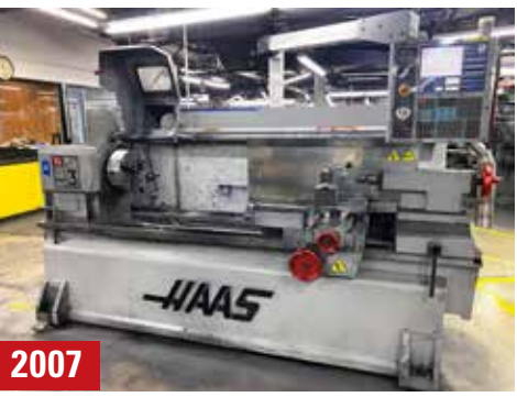
HAAS TL-3 CNC TURNING CENTER

(2) KARSTENS K11 OD Grinders, s/n 84 006 10 11 1, 83 051 10 11 1, w/ 8.25" 6-Jaw Chuck, 16" Swing Over Table, Sony LH51 DRO