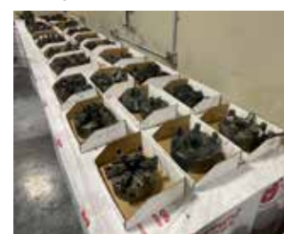
LARGE SELECTION OF CHUCKS