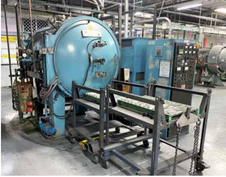
CENTORR 18X24X36 3700 SERIES VACUUM FURNACE