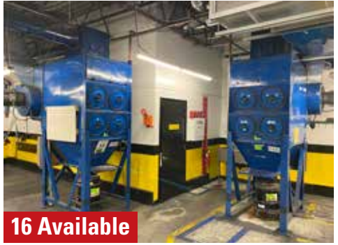
DONALDSON TORIT 2DF8 DUST COLLECTION SYSTEMS