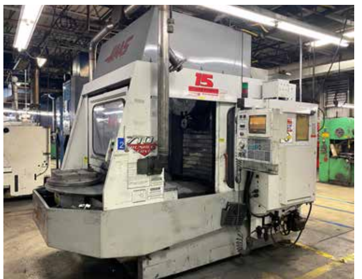
HAAS HS-1 CNC HMC