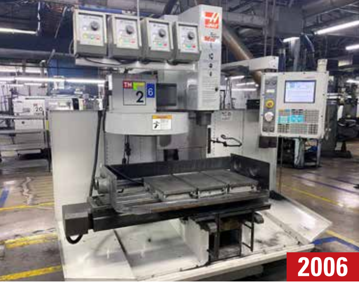
HAAS TM-2 CNC TOOLROOM MILL