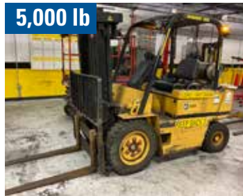
CATERPILLAR V50F LPG FORKLIFT