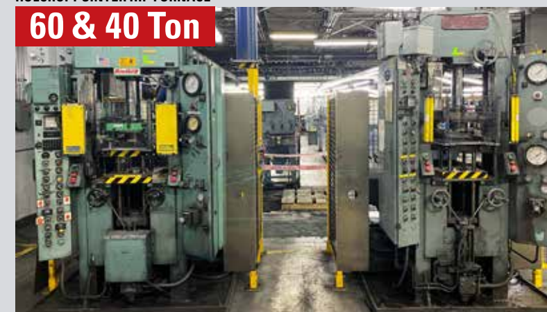
(2) ALPHA COMPACTING PRESSES