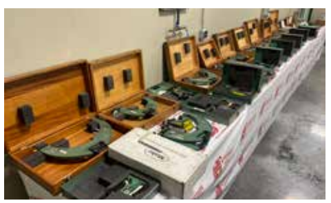
LARGE SELECTION OF SNAP GAGES