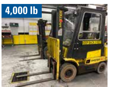
HYSTER H40XMS LPG FORKLIFT