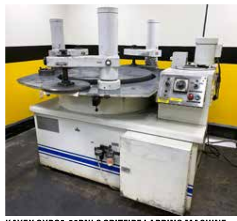
KAYEX GYRO3-36PNLC SPITFIRE LAPPING MACHINE