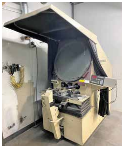
ST INDUSTRIES 22-2601 OPTICAL COMPARATOR