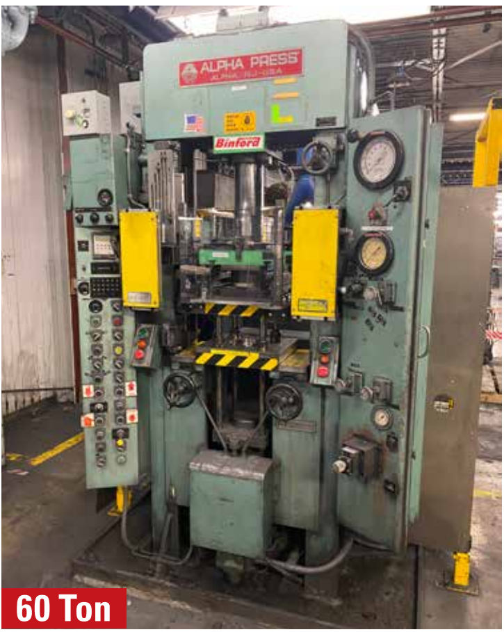
ALPHA APC 64D-15L POWDER COMPACTING PRESS