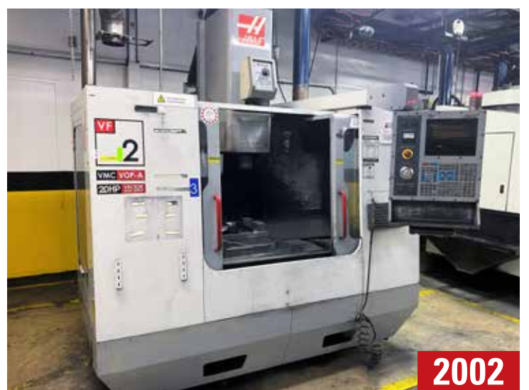
HAAS VF-2D VMC