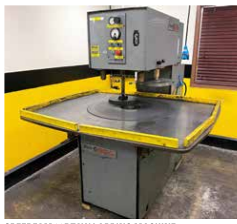
SPEEDFAM 32BTAW LAPPING MACHINE