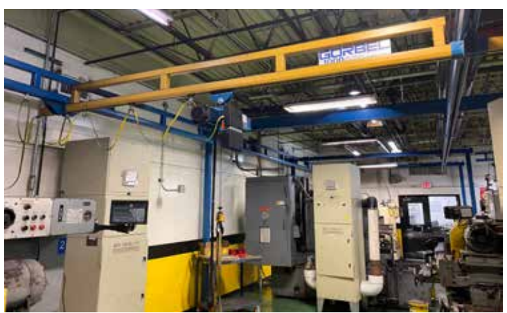
GORBEL CRANE SYSTEM