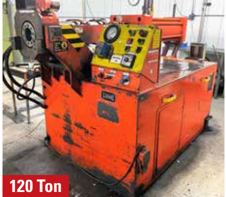
available at bit.ly/perfection-kennametal