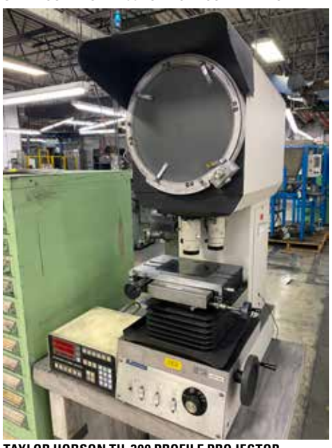
TAYLOR HOBSON TH-300 PROFILE PROJECTOR