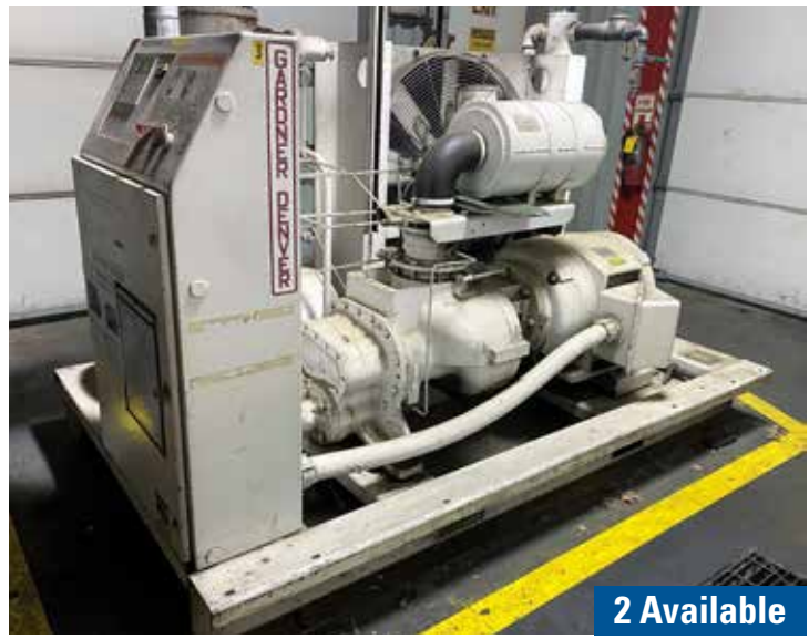
GARDNER DENVER EDHOMB 100 HP AIR COMPRESSOR