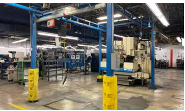
GORBEL 1-TON FREE STANDING CRANE SYSTEM

CM LODESTAR ½ Ton Hoist, w/ Approx. 15' Monorail