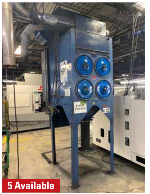
DONALDSON TORIT 2DF4 DUST COLLECTION SYSTEMS