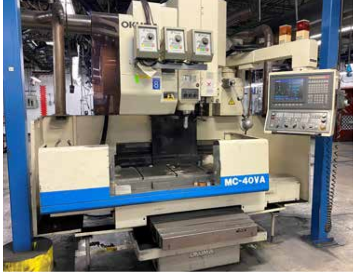
OKUMA MC-40VA CNC VMC