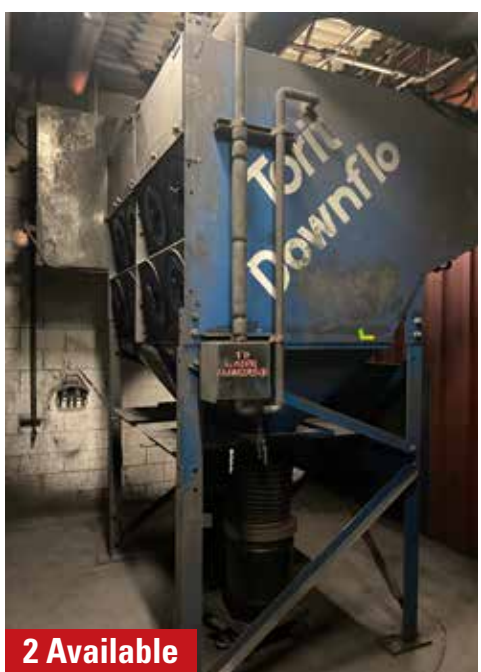
DONALDSON TORIT DFT2-16 DUST COLLECTION SYSTEMS