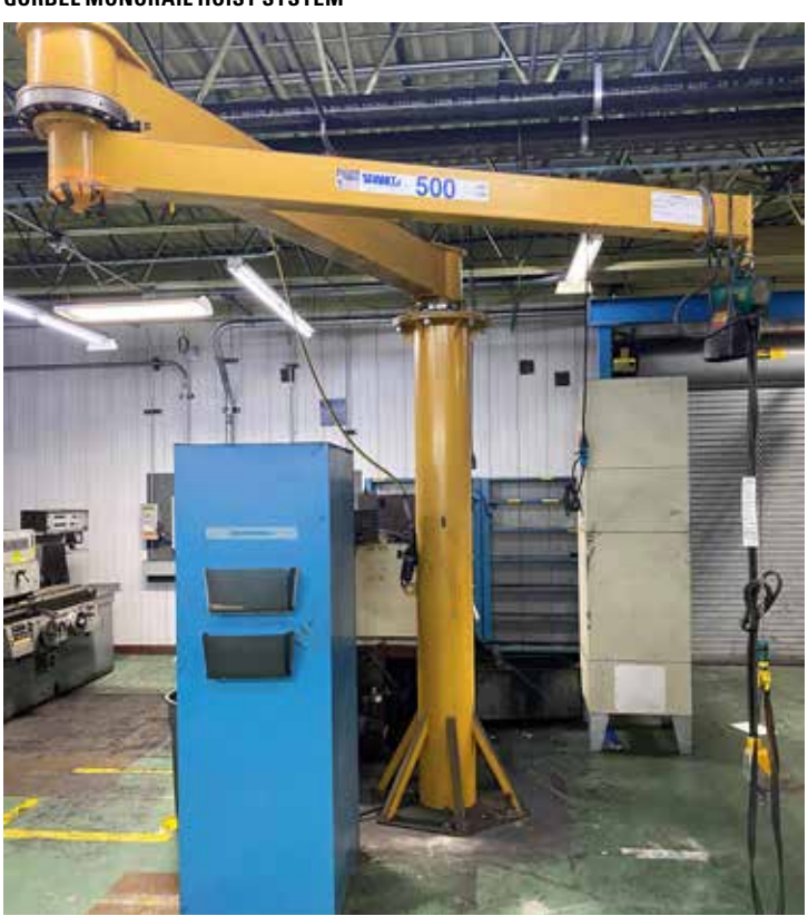
SPANCO SWIVEL ARM FREE STANDING JIB CRANE