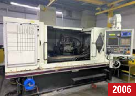
WELDON 720S MIDAS CNC GRINDER

FRYER MB-14 CNC Mill, s/n 14114, w/ ANILAM 1400M Control, 40"X, 18"Y, 21.75"Z, 14" x 48" Table, CT40 Taper, (3) 12" x 18" Mag Chucks ea. w/ OS WALKER Chuck Control (sold separately)