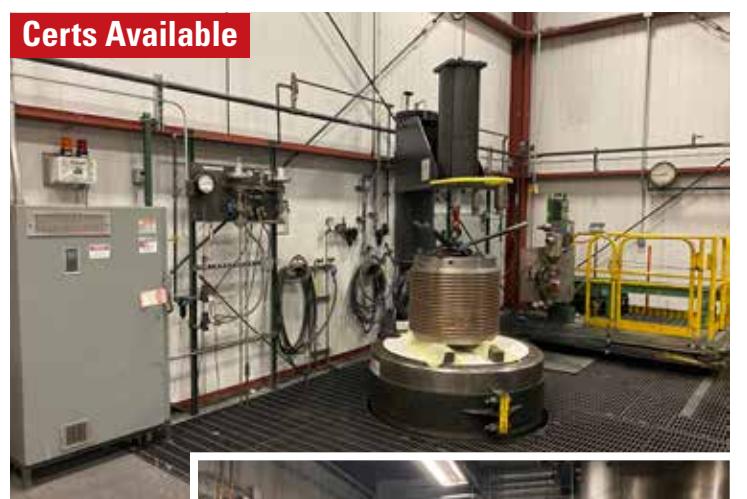
AVURE 23" COLD ISOSTATIC PRESS