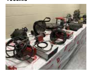
4TH AXIS, ROTARY TABLES AND