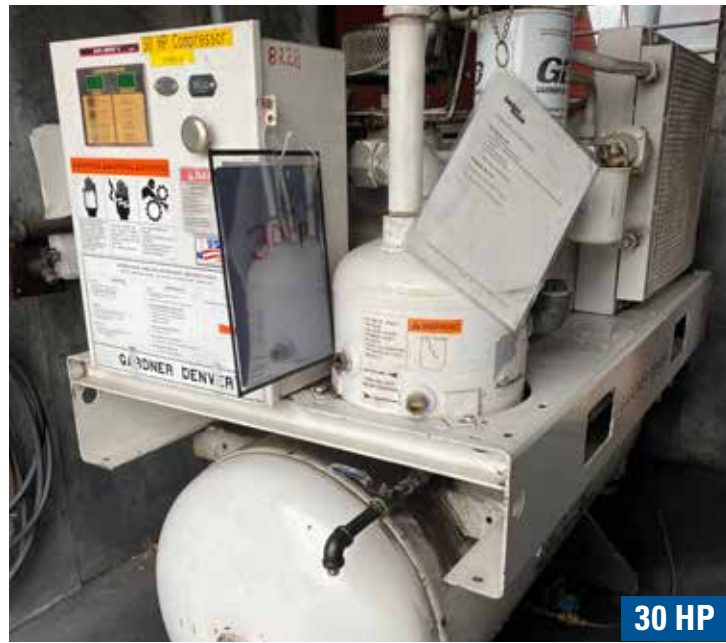
GARDNER DENVER EBE99K13 AUTO-SENTRY AIR COMPRESSOR

Also Available: Pallet Racking, Ladders, Lift Carts, Shop Carts, Pallet Jacks, Safety Ladders, Maintenance Department, Welding, Torch, Industrial Vacs, Shop Vacs, Die Carts, Office, Flat Screen TV's, Cafeteria and Much More