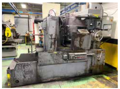
BLANCHARD NO. 20 ROTARY SURFACE GRINDER