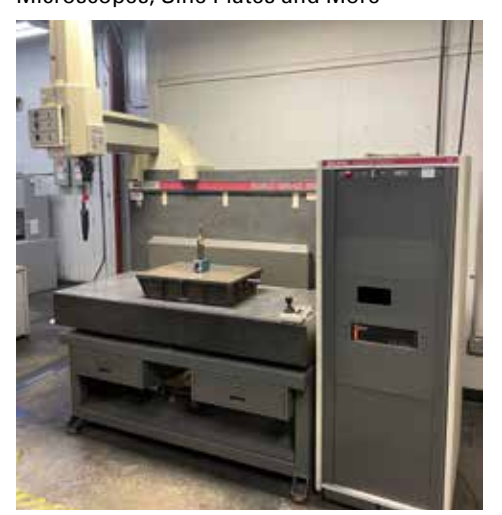
SHEFFIELD CORDAX 1808-MZ DCC MEA CMM

Huge Selection of Inspection Equipment Including Height Gages, Calipers, Outside Micrometers, Inside Micrometers, Snap Gages, Bore Gages, Light Sources, Microscopes, Sine Plates and More