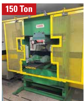
DAKE 5-150 HYDRAULIC PRESS