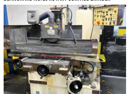
CHEVALIER FSG-3A1020 SURFACE GRINDER