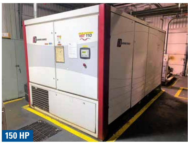
GARDNER DENVER VST 110 AIR COMPRESSOR

GARDNER DENVER EBE99K13 30 HP Auto-Sentry Air Compressor, s/n S013722, 125 PSIG