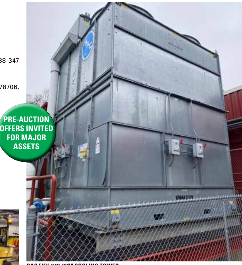
BAC FXV-643-20M COOLING TOWER