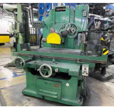
GALLMEYER & LIVINGSTON NO. 55 SURFACE GRINDER