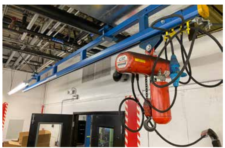
GORBEL MONORALL HOIST SYSTEM

ALL PURCHASES MUST BE PAID WITHIN 48 HOURS OF THE CLOSE OF SALE. Contact our Accounting team for wire instructions. Only wire transfer or certified check, payable to Perfection Industrial Sales will be accepted. Company checks payable to Perfection Industrial Sales will be accepted only if accompanied by a bank letter of guarantee. All sales are subject to sales tax. Purchasers claiming Sales Tax exemptions must provide proof satisfactory to the Perfection Accounting team to claim such exemptions.