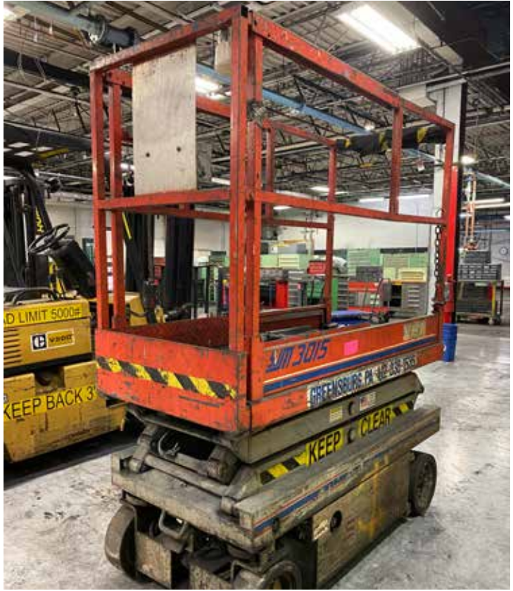
SKYJACK SJM 3015 SCISSOR MAN LIFT