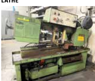
DOALL C-912M HORIZONTAL BANDSAW