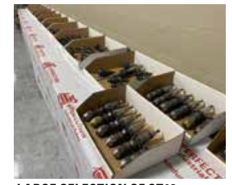
LARGE SELECTION OF CT40 TOOLING