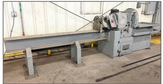
OSTER 716 6" THREADER