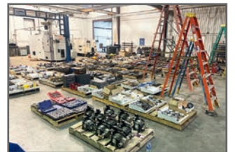
VIEW OF MISCELLANEOUS ITEMS