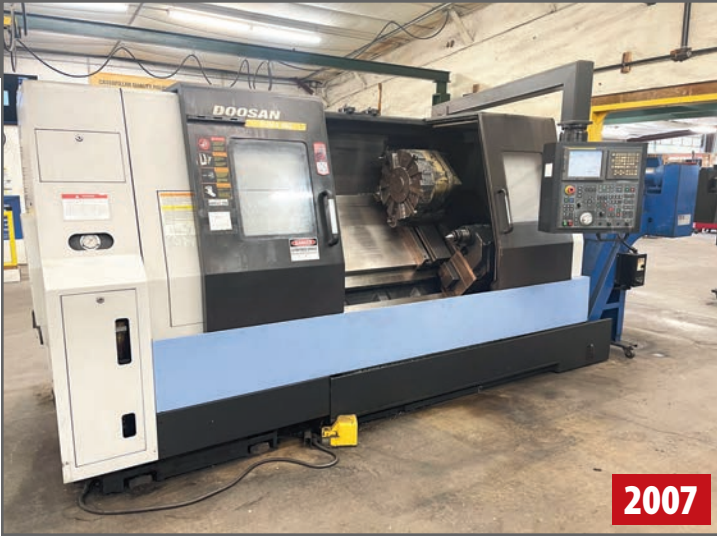
(1 OF 5) DOOSAN PUMA 400B CNC TURNING CENTERS