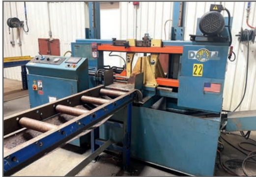
DOALL C310 DUAL COLUMN HORIZONTAL BANDSAW