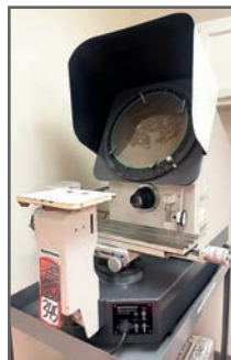
MITUTOYO PH-350 PROFILE PROJECTOR