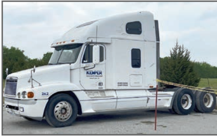
FREIGHTLINER SLEEPER CAB HIGHWAY TRACTOR