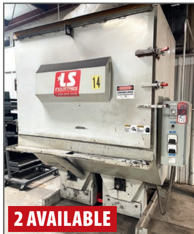
LS INDUSTRIES DUAL WHEEL TUMBLE BLAST SYSTEMS