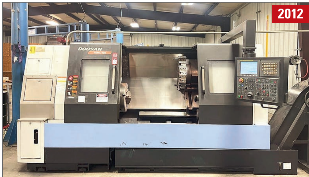
(1 OF 5) DOOSAN PUMA 400B CNC TURNING CENTERS