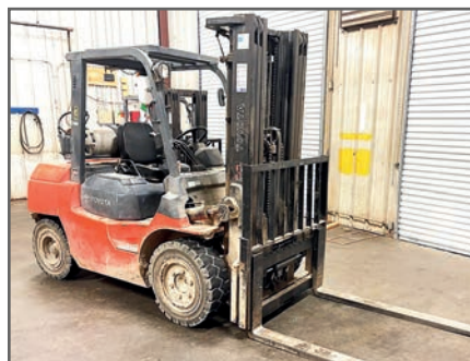
TOYOTA 7FGU35 8,000 LB LP FORKLIFT