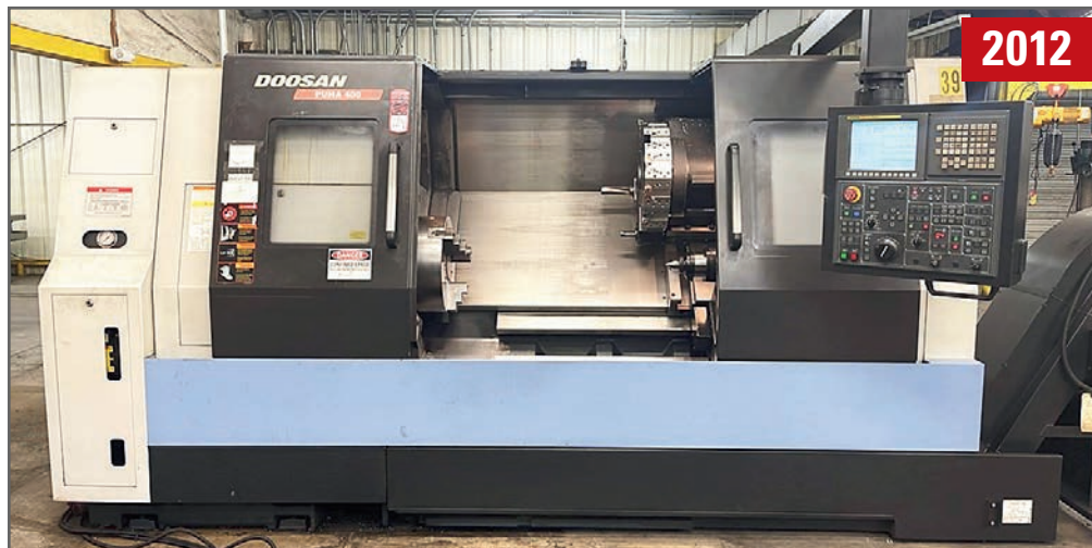
(1 OF 5) DOOSAN PUMA 400B CNC TURNING CENTERS