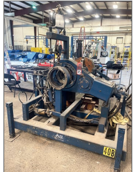
GILL 500 7" BUCKING MACHINE