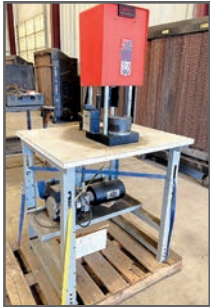
GATES POWER CRIMP 707 HOSE CRIMPING MACHINE