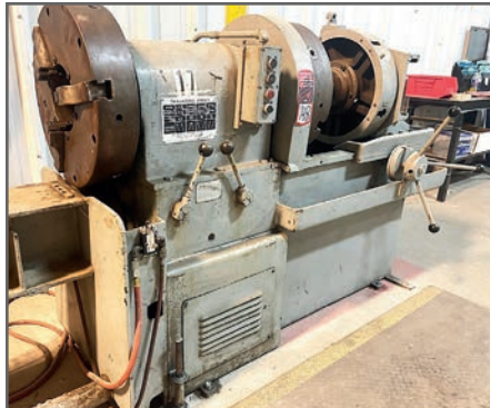
OSTER 716 6" THREADER