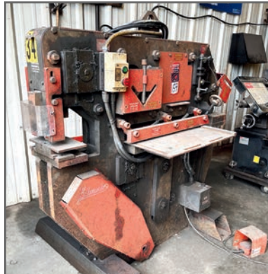
EDWARDS 65-TON IRONWORKER