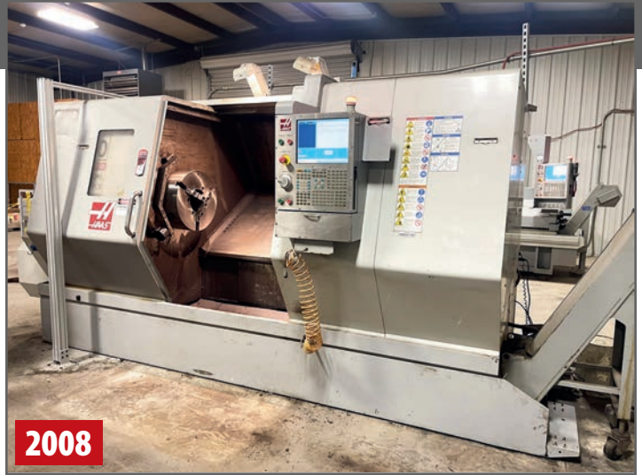
(1 OF 4) HAAS SL-40 CNC TURNING CENTERS