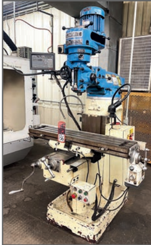
SUMMIT V-242B VERTICAL MILL