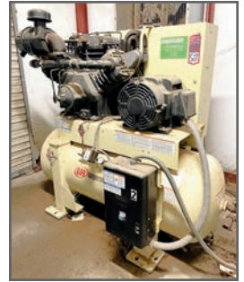
INGERSOLL RAND 2000E25 25 HP TANK MOUNT AIR COMPRESSOR