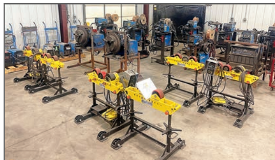
WELDING SUPPORT EQUIPMENT