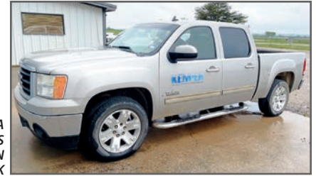
GMC SIERRA TEXAS EDITION PICKUP TRUCK