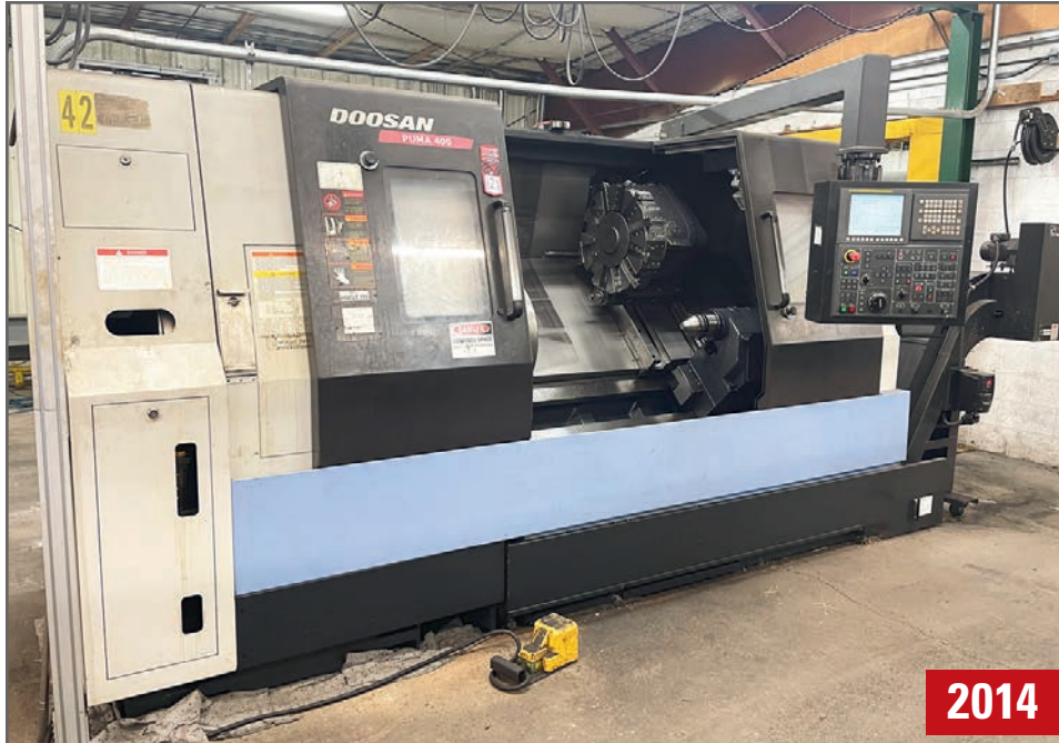
DOOSAN PUMA 400C CNC TURNING CENTER

FEATURING: (1,000 LOTS) Including (14) DOOSAN & HAAS Turning Centers as Late as 2014, Machine Tools, Bucking Machines, Welding, Metrology Lab, 2018 CAT Telehandler, (20+) Forklifts, Vehicles, Racking, Ball Bearing Cabinets, Tools, Paint Booths, Packaging, Material Handling, Sea Containers & Plant Support