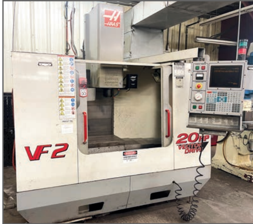
HAAS VF2 VERTICAL MACHINING CENTER