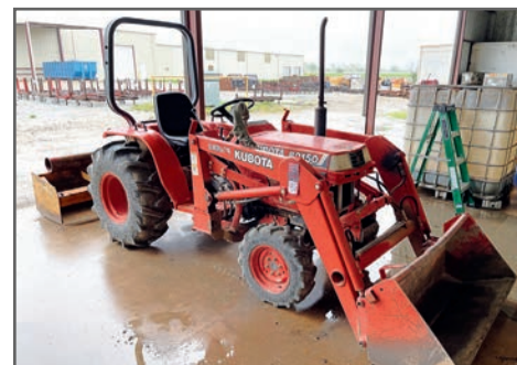
KUBOTA B2150/LA350A 4X4 LOADER TRACTOR