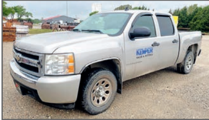
CHEVROLET SILVERADO LS CREW CAB PICKUP TRUCK