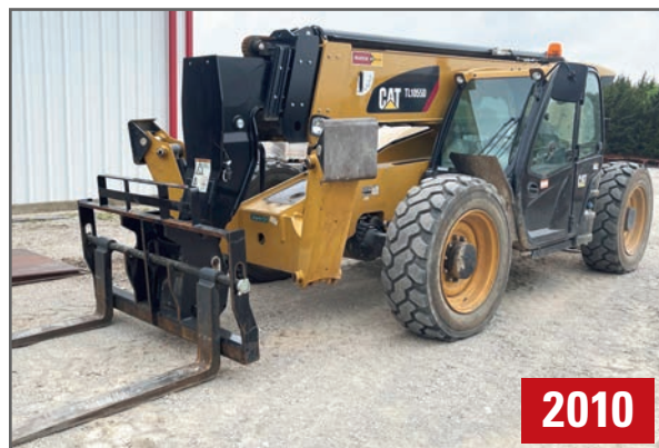
CATERPILLAR TL1055D TELEHANDLER