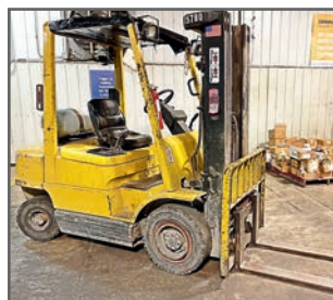
HYSTER H50XM 5,000 LB LP FORKLIFT

ALSO: BEETLE TRACK TORCHES, ELECTRODE OVENS, OXY/ACE TORCH SETS, PIPE STANDS, (50+) HD WELDING TABLES, PROTECTIVE CLOTHING, WELDING CONSUMABLE SUPPLIES, ETC.