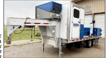
FEATHERLITE T/A GOOSENECK VALVE REPAIR TRAILER

Pre-Auction Offers Invited on Major Assets