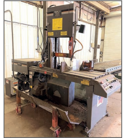
HEM V100LM3 VERTICAL BANDSAW