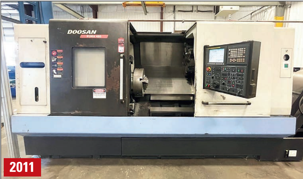
DOOSAN PUMA 480 CNC TURNING CENTER