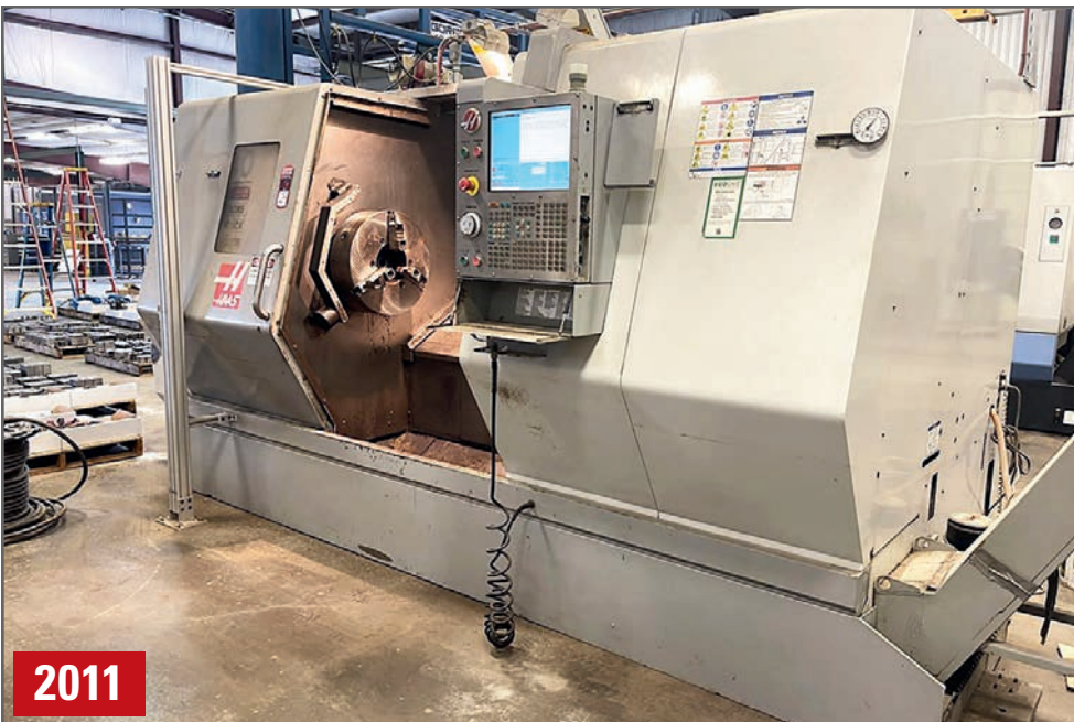
(1 OF 4) HAAS SL-40 CNC TURNING CENTERS