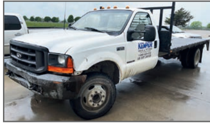
FORD F-550 SUPER DUTY DIESEL FLAT RACK TRUCK