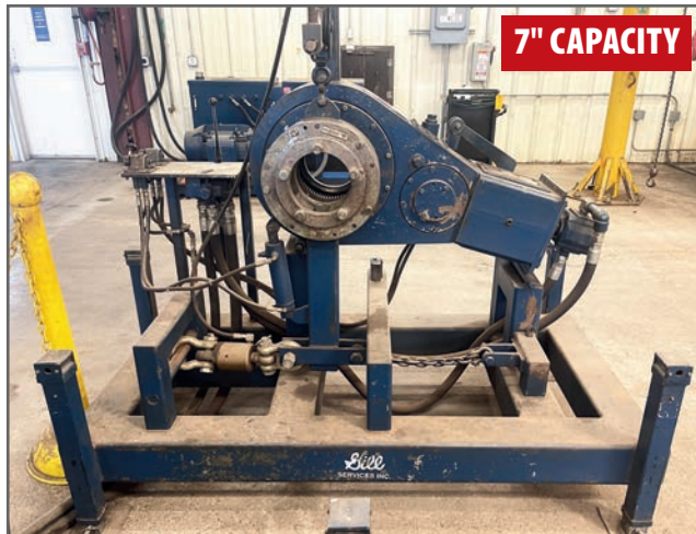
GILL 500 BUCKING MACHINE