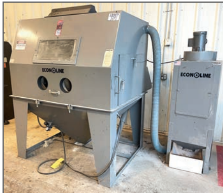
ECONOLINE BLAST CABINET