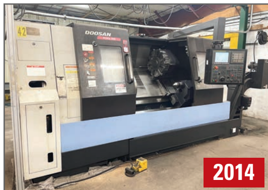
DOOSAN PUMA 400C CNC TURNING CENTER