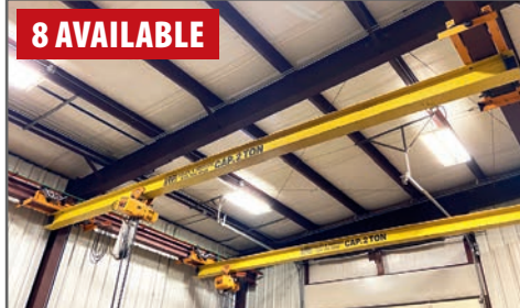
ITP 2-TON SINGLE GIRDER BRIDGE CRANES