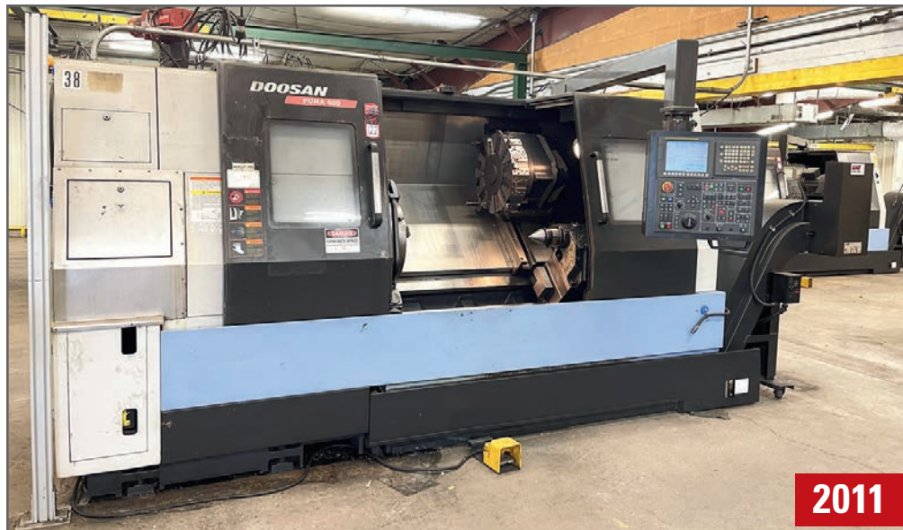
(1 OF 2) DOOSAN PUMA 400C CNC TURNING CENTERS