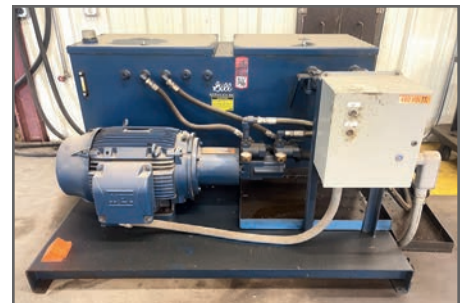
GILL 50 HP HYDRAULIC POWER UNIT

Complete Catalog & Information Available at https://perfection.global/kempersulphur