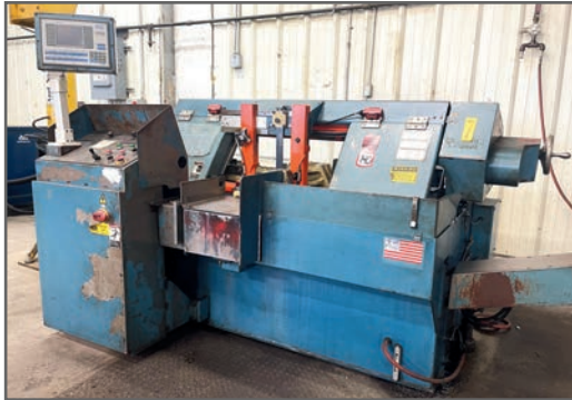
DOALL C-305 NC 10" HORIZONTAL BANDSAW