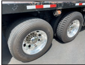
UNIT NO. 6 TIRE VIEW