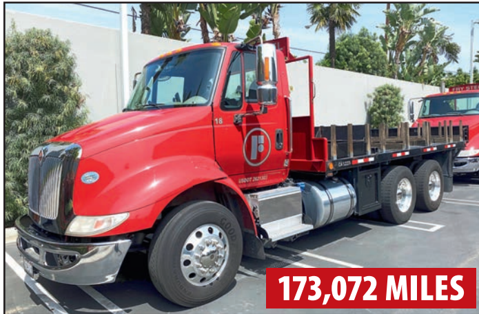
UNIT NO. 18 2016 INTERNATIONAL 8600