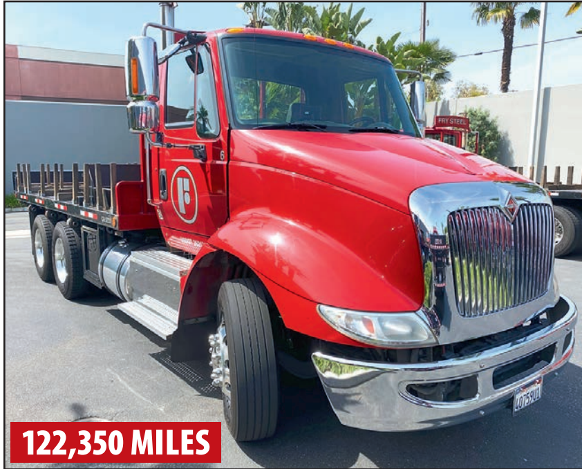
UNIT NO. 6 2016 INTERNATIONAL 8600

Very Well Maintained Truck Fleet with Low Miles, 18' Stake Beds, Chrome Upgrades, All Tires in Excellent Condition