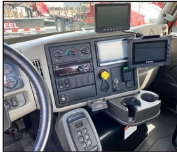
UNIT NO. 6 INTERIOR

PLEASE NOTE: THE FOLLOWING ARE NOT SOLD WITH THE TRUCKS AND WILL BE REMOVED: Smart Drive Camera Systems, PeopleNet Electronic Logging Devices (ELD) and Company Logos/Badges