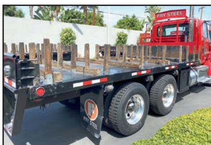
UNIT NO. 15 REAR VIEW

Unit NO. 15: 2016 INTERNATIONAL 8600 SBA 6X4 Day Cab Flat Rack Truck, VIN 1HTHXSNR4GH132503, w/NAVISTAR N13 365 HP Diesel Engine, ALLISON 3000 HS Close Ratio 6 Speed Automatic Transmission w/ Double Overdrive, Rear Tandem Axle w/ MERITOR Single Reduction Dual Track Axle w/ Tag Axle, GVWR 52,000 Lb, 18' Steel Flat Rack, Chrome Package, 129,562 Miles at Time of Printing, Lot #5