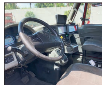
UNIT NO. 13 INTERIOR