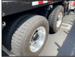
UNIT NO. 3 TIRE VIEW