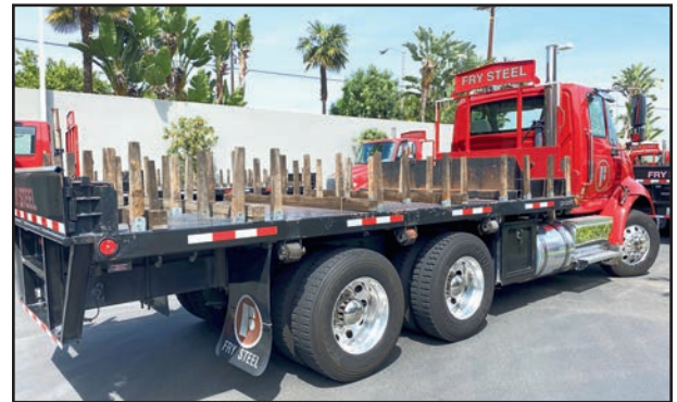
UNIT NO. 6 REAR VIEW

Wednesday, May 12, strictly by appointment only. Please schedule your inspection appointment in advance by calling +1-847-545-6374 or email: jennifer@perfectionindustrial.com.