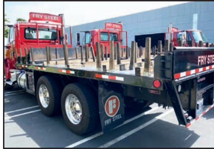
UNIT NO. 3 REAR VIEW