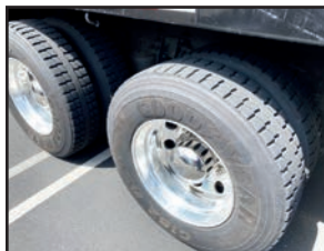
UNIT NO. 8 TIRE VIEW

Unit NO. 08: 2016 INTERNATIONAL 8600 SBA 6X4 Day Cab Flat Rack Truck, VIN 3HTHXSNR1GN003236, w/NAVISTAR N13 365 HP Diesel Engine, ALLISON 3000 HS Close Ratio 6 Speed Automatic Transmission w/ Double Overdrive, Rear Tandem Axle w/ MERITOR Single Reduction Dual Track Axle w/ Tag Axle, GVWR 52,000 Lb, 18' Steel Flat Rack, Chrome Package, 125,809 Miles at Time of Printing, Lot #4