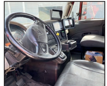
UNIT NO. 20 INTERIOR