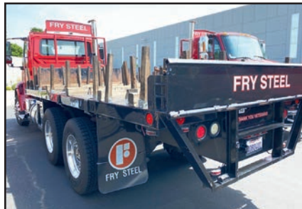
UNIT NO. 20 REAR VIEW

UNIT NO. 20: 2016 INTERNATIONAL 8600 SBA 6X4 DAY CAB FLAT RACK TRUCK , VIN 3HTHXSNR0GN003230, w/NAVISTAR N13 365 HP Diesel Engine, ALLISON 3000 HS Close Ratio 6 Speed Automatic Transmission w/Double Overdrive, Rear Tandem Axle w/MERITOR Single Reduction Dual Track Axle w/Tag Axle, GVWR 52,000 Lb, 18' Steel Flat Rack, Chrome Package, 123,361 Miles at Time of Printing, NOTE: License Expired, Lot #3