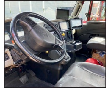
UNIT NO. 3 INTERIOR

UNIT NO. 03: 2016 INTERNATIONAL 8600 SBA 6X4 DAY CAB FLAT RACK TRUCK , VIN 3HTHXSNR6GN132508, w/NAVISTAR N13 365 HP Diesel Engine, ALLISON 3000 HS Close Ratio 6 Speed Automatic Transmission w/ Double Overdrive, Rear Tandem Axle w/ MERITOR Single Reduction Dual Track Axle w/ Tag Axle, GVWR 52,000 Lb, 18' Steel Flat Rack, Chrome Package, 107,216 Miles at Time of Printing, Lot #1