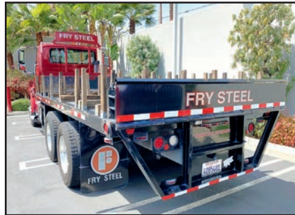
UNIT NO. 18 REAR VIEW