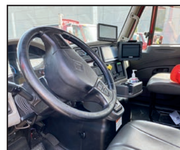
UNIT NO. 15 INTERIOR