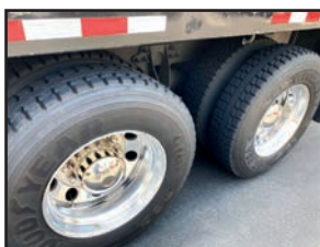
UNIT NO. 15 TIRE VIEW

Unit NO. 08: 2016 INTERNATIONAL 8600 SBA 6X4 Day Cab Flat Rack Truck, VIN 3HTHXSNR1GN003236, w/NAVISTAR N13 365 HP Diesel Engine, ALLISON 3000 HS Close Ratio 6 Speed Automatic Transmission w/ Double Overdrive, Rear Tandem Axle w/ MERITOR Single Reduction Dual Track Axle w/ Tag Axle, GVWR 52,000 Lb, 18' Steel Flat Rack, Chrome Package, 125,809 Miles at Time of Printing, Lot #4