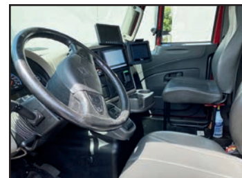
UNIT NO. 8 INTERIOR