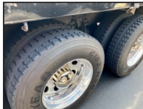
UNIT NO. 20 TIRE VIEW