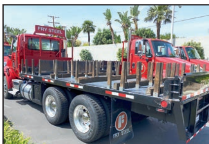
UNIT NO. 13 REAR VIEW