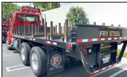
UNIT NO. 8 REAR VIEW