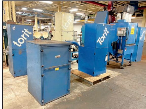
TORIT DUST COLLECTORS

PEDESTAL GRINDERS, SANDERS, ARBOR PRESSES, DRILL PRESSES, PNEUMATIC TOOLS, BENCH VISES, MACHINES VISES, GRINDING VISES, CAT 40 TOOLING, CAT 50 TOOLING, PERISHABLE TOOLING, HAIRER SHRINK-FIT MACHINE, PIPE BENDER TOOLING, STANLEY VIDMAR AND LISTA TOOL CABINETS, TORIT DUST COLLECTORS, SELF-DUMPING HOPPERS, WORK BENCHES, LOCKERS, OVER (50) BRIDGE CRANE SYSTEMS, NEW SHAW-BOX HOISTS, AIR FLOAT SYSTEMS UP TO 13,000 LB CAPACITY, HUGE SELECTION OF PALLET JACK, ELECTRIC PALLET JACKS AND WALKIE-STACKERS FROM HYSTER, CROWN, CLARK