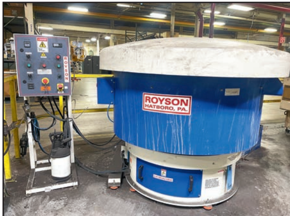
ROYSON VIBRATORY TUMBLER