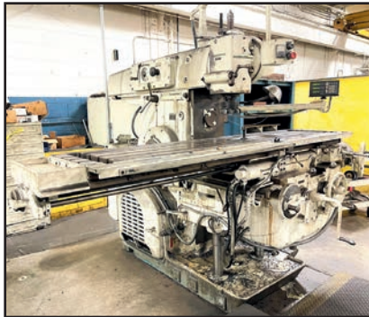
KEARNEY & TRECKER TF-17 MILL