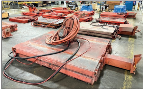
AIR FLOAT SYSTEMS