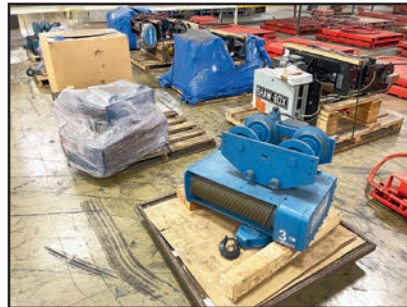
VIEW OF SHAW-BOX HOISTS