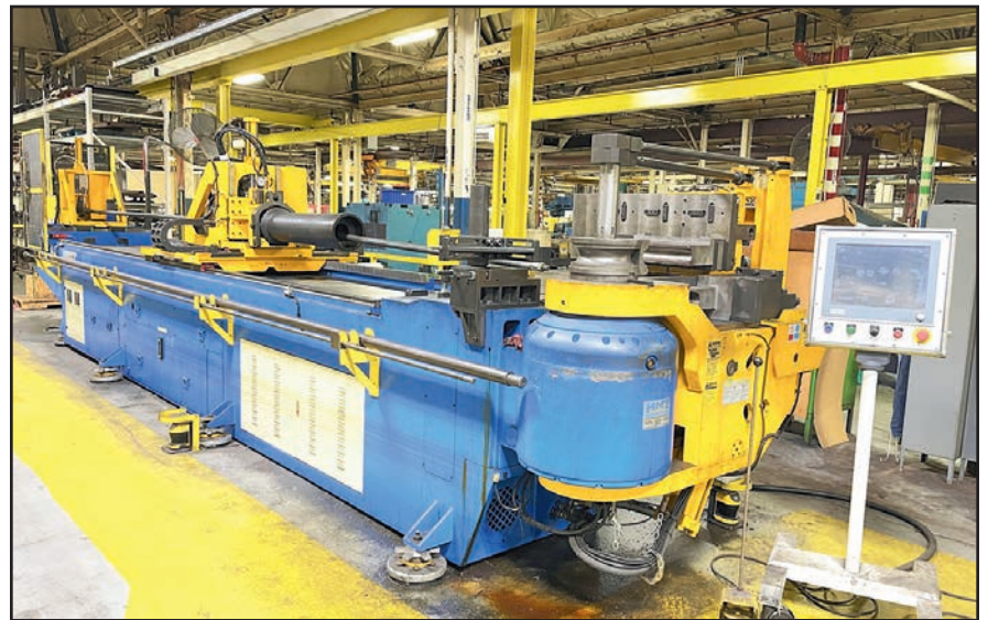
HMT CNC130TBRE-RBE TUBE BENDER

MARVEL 81A11PC VERTICAL BANDSAW, s/n E-476111PC; MARVEL 8-MARK-II VERTICAL BANDSAW, s/n 830276; SCOTCHMAN VC-20 VERTICAL BANDSAW, s/n 555-05050025; METALMIZER MS2018 VERTICAL BANDSAW, s/n MS0192226; COLONIAL HAS 15-72 HORIZONTAL BROACH, s/n M-11439; CINCINNATI BICKFORD SUPER SERVICE 4' X 11" RADIAL ARM DRILL, s/n 1800; (2) AMERICAN HOLE WIZARD 4' X 11" RADIAL ARM DRILLS, s/n 77780, NA; AMERICAN HOLE WIZARD 3' X 11" RADIAL ARM DRILL, s/n NA; (2) AMERICAN HOLE WIZARD 3' X 9" RADIAL ARM DRILLS, s/n NA; (2) NEWEN CONTOUR C6 VALVE SEAT AND GUIDE MACHINES W/AXIOMTEK CONTROLS; (3) FOOTE-BURT/HAMMOND CLEVELAND DRILL PRESSES, s/n 2547-64, 2096-49, 2380-55; ALLEN 6-SPINDLE GANG DRILL; CLAUSING 1687 3-HEAD GANG DRILL; CLAUSING 2285 2-HEAD GANG DRILL, s/n 525874/5; CLAUSING 1687 DRILL PRESS, s/n 128231; KIRA KRTG-540 DRILL PRESS, s/n 53403, w/Tapping Head; US ELECTRIC 500 PEDESTAL GRINDER, s/n 283763; US ELECTRIC 10" UTILITY GRINDER, s/n 534122; EISELE VMS 350 PV COLD SAW, s/n 02008; DAYTON 2PA29A COMBINATION 6" BELT/9" DISC SANDER, s/n 20076; OLIVER 600 HEAVY DUTY DRILL GRINDER, s/n G8076; CINCINNATI MILACRON 2MT CUTTER AND TOOL GRINDER, s/n 7703A01-90-0120; LSMW ACCU-TAPPER; CUSTOM HEATED WASH TANK, w/24" x 96" Tank, Square D Control; ROYSON VIBRATORY TUMBLER, s/n NA; SUNNEN MBB-1670EJIC HONE, s/n 70097