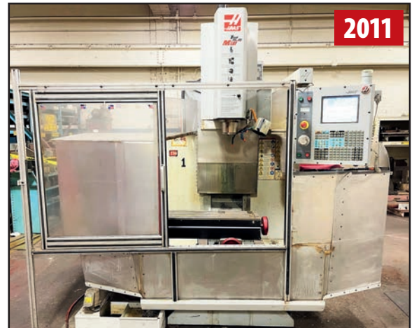
HAAS TM-1 CNC TOOL ROOM MILL

View our current auction schedule at www.perfectionindustrial.com