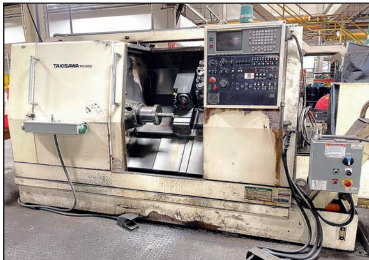
TAKISAWA TPS-4000 TURNING CENTER