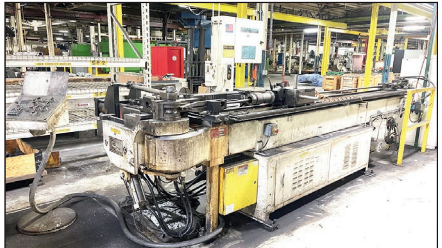
EATON LEONARD EL400HD TUBE BENDER