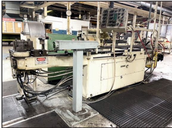
(1 OF 2) TELEDYNE PINES #1 TUBE BENDERS