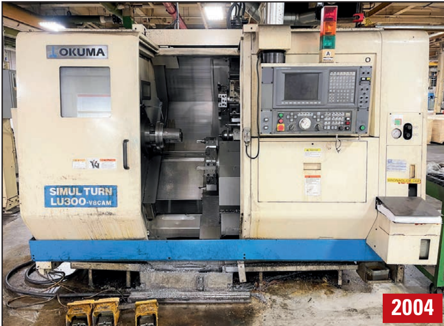
OKUMA LU300-V8CAM TURNING CENTER