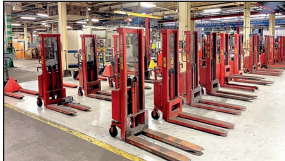
HIGHLIFT PALLET JACKS