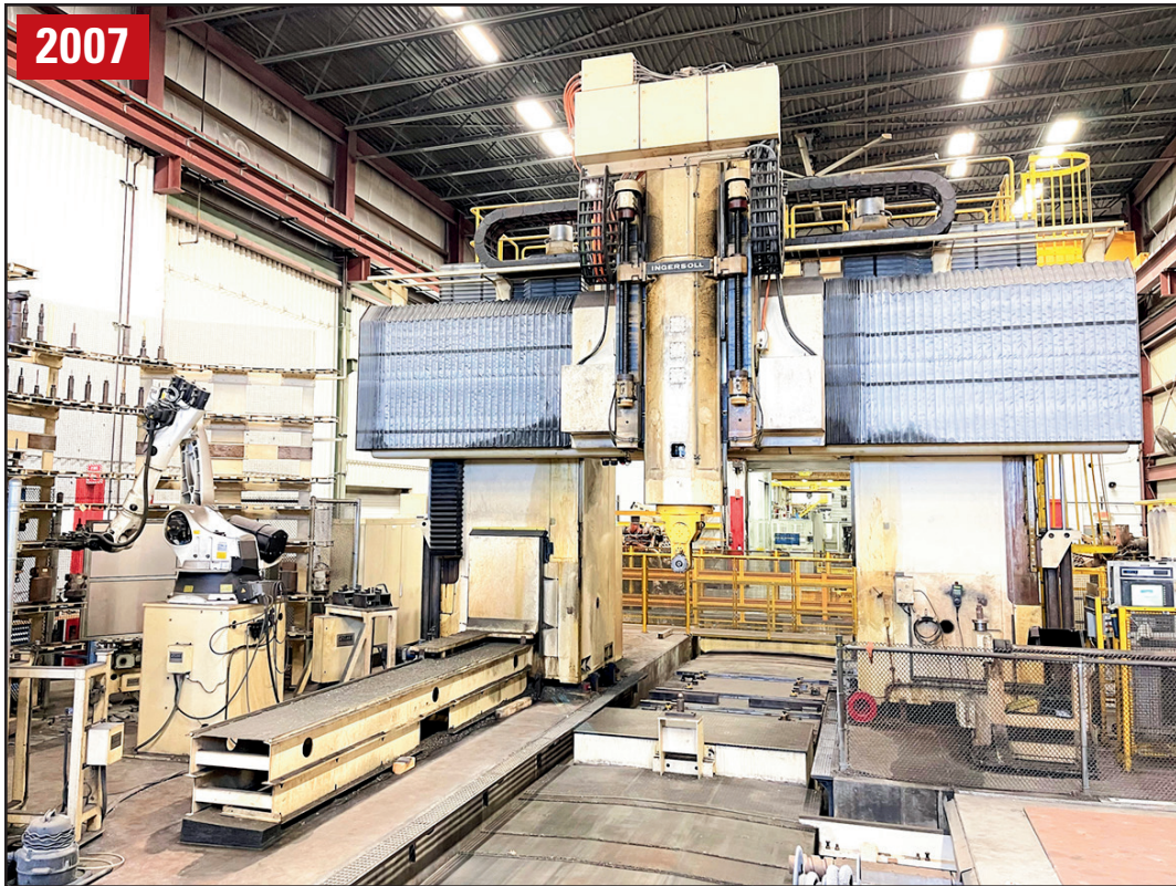
INGERSOLL RAND DOUBLE COLUMN 5-AXIS BRIDGE MILL