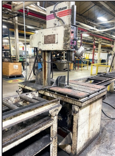
METALMIZER MS2018 VERTICAL BANDSAW

ALSO: LARGE ASSORTMENT OF GRANITE SURFACE PLATES, CALIPERS, HEIGHT GAGES, HARDNESS TESTER, MICROMETERS, SNAP GAGES, RING GAGES, THREAD GAGES, AND MORE