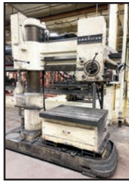
4' AMERICAN RADIAL ARM DRILL