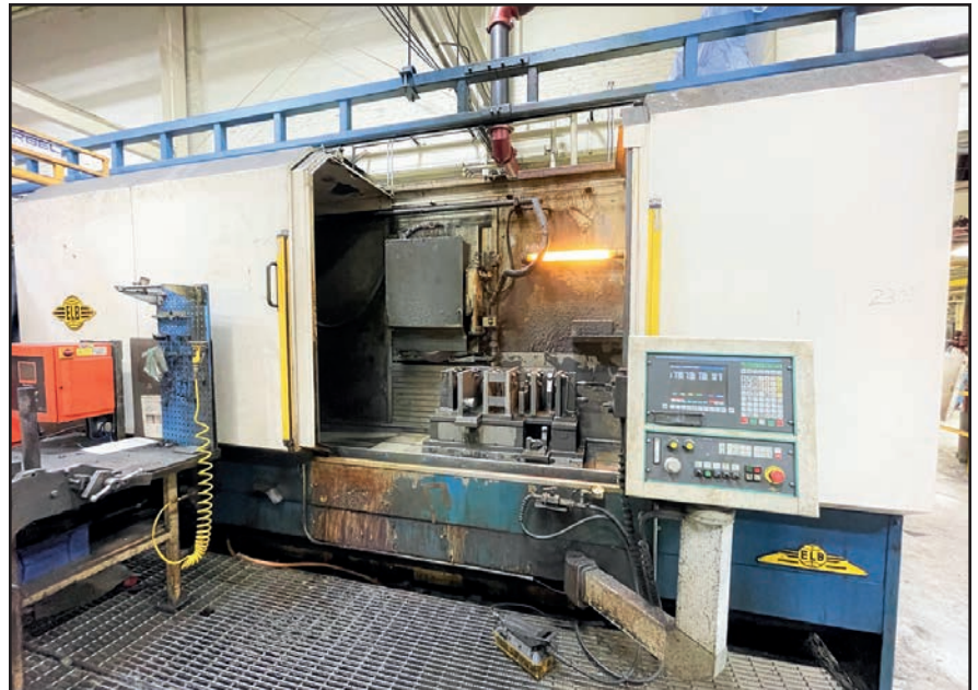
ELB MICRO CUT B12 CNC SURFACE GRINDER