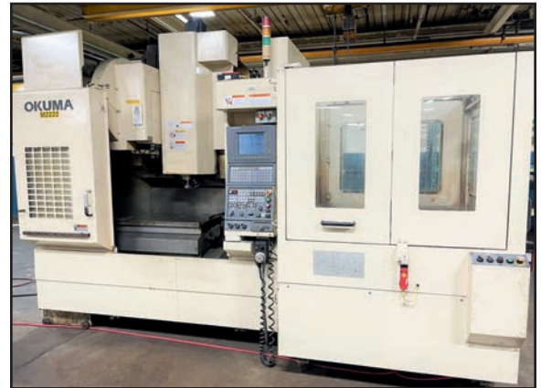
OKUMA MX-45VAE TWIN PALLET VERTICAL MACHINING CENTER