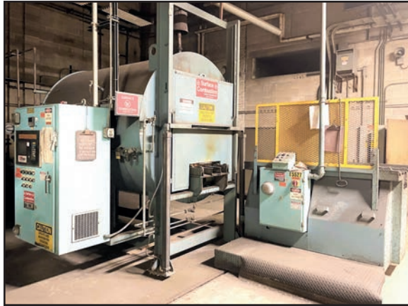
SURFACE COMBUSTION UNI-DRAW FURNACE