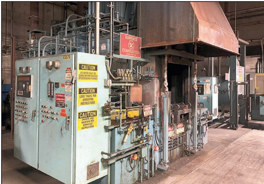
SURFACE COMBUSTION ALL-CASE FURNACE