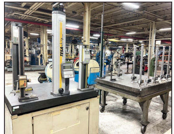
VIEW OF INSPECTION EQUIPMENT

View our current auction schedule at www.perfectionindustrial.com