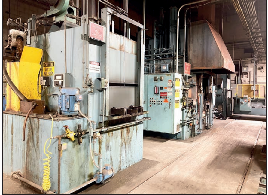
SURFACE COMBUSTION GAS FIRED HEATED DUNK WASHER