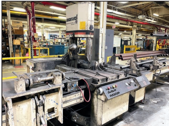
MARVEL 81A11PC VERTICAL BANDSAW