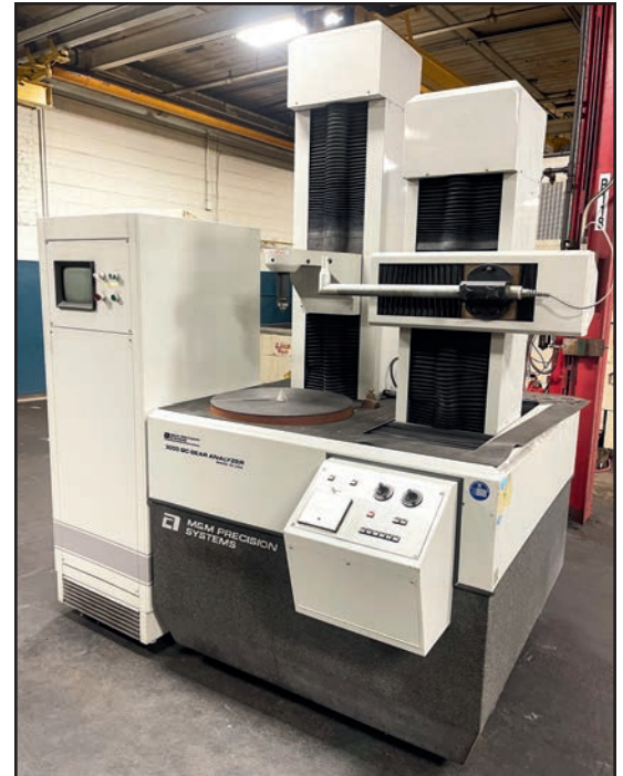
M & M PRECISION SYSTEMS 3000 QC GEAR ANALYZER