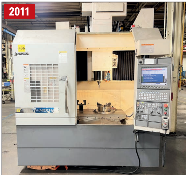
OKUMA GENOS M460-VE VERTICAL MACHINING CENTER