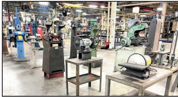
VIEW OF PEDESTAL GRINDERS