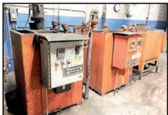
CAN-ENG QUENCH LINE