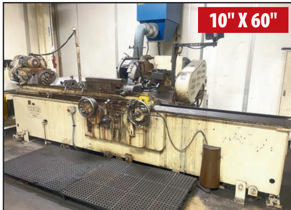
NORTON CYLINDRICAL GRINDER