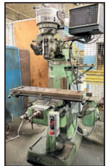
BRIDGEPORT MILLING MACHINE