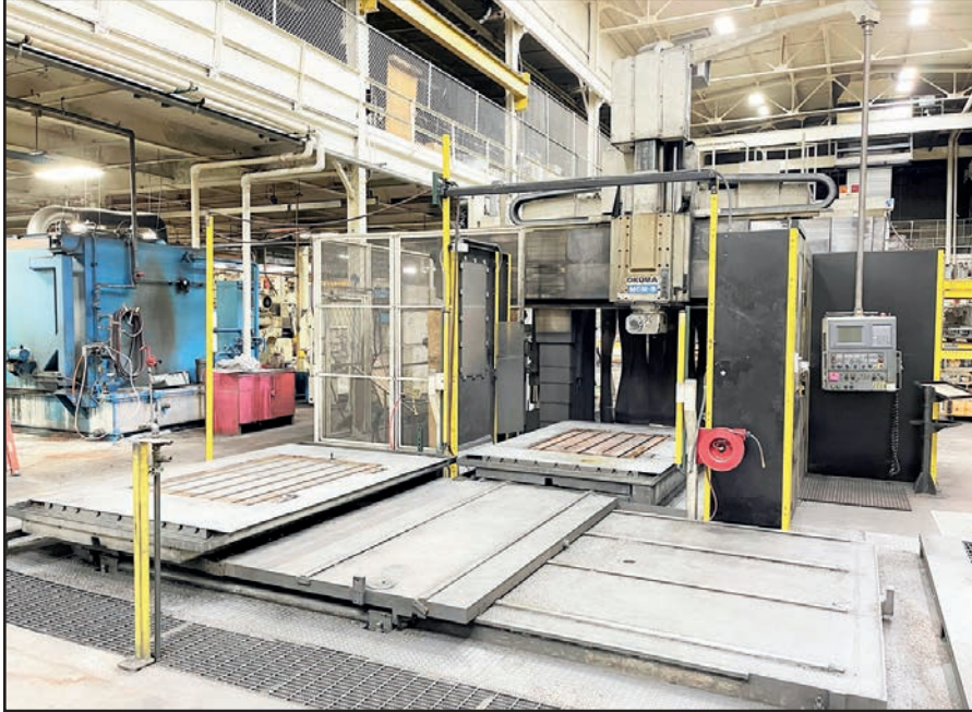
OKUMA MCM-20B BRIDGE MILL

6" GIDDINGS & LEWIS HORIZONTAL BORING MILL , s/n 455-53-80, w/NUMERIPATH 800N Control, 20' x 5' Main Table w/Rotary Positioner, 6' x 5' Table w/4' x 6' Rotary Table