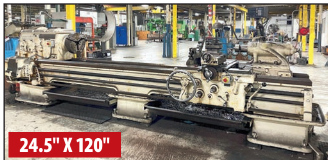
MONARCH 22CM ENGINE LATHE