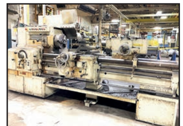
AMERICAN STYLE C 16" X 54" ENGINE LATHE