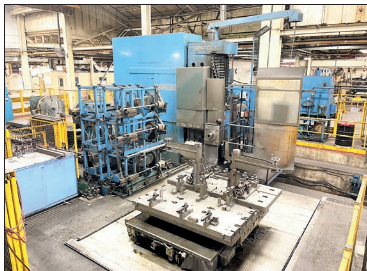
6" GIDDINGS & LEWIS HORIZONTAL BORING MILL