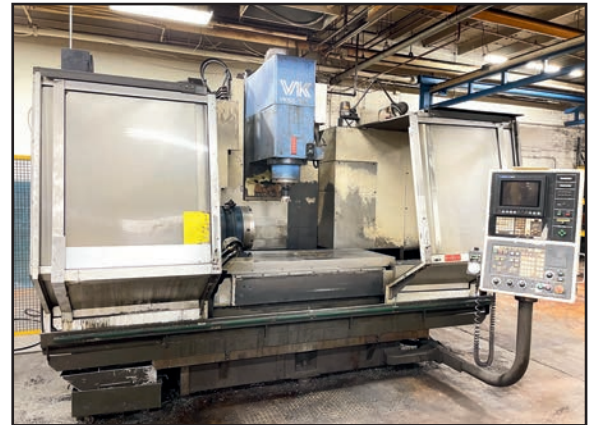
HITACHI SEIKI VK65 VERTICAL MACHINING CENTER