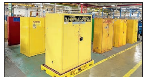
FLAMMABLE LIQUID STORAGE CABINETS