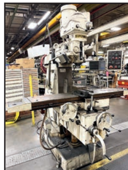
SUPERMAX YCM-2VASK 5 HP MILLING MACHINE