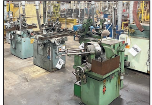
VIEW OF TOOL AND CUTTER GRINDERS