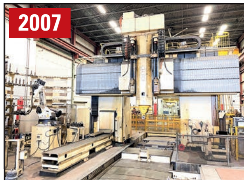
2007 INGERSOLL RAND DOUBLE COLUMN 5-AXIS BRIDGE MILL