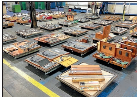
VIEW OF INSPECTION EQUIPMENT