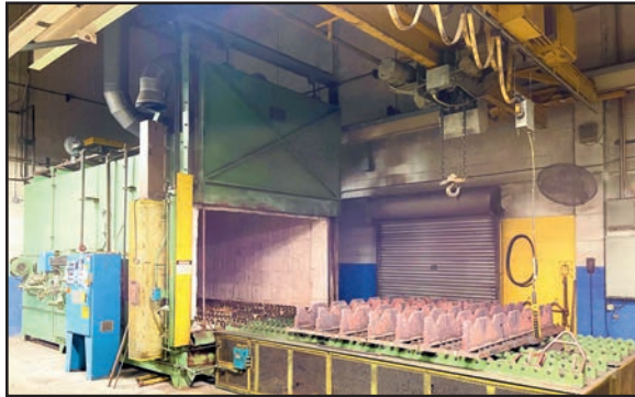
J.L. BECKER BOX FURNACE