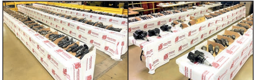
VIEW OF TOOL HOLDERS

Pre-Auction Offers Invited on Major Assets