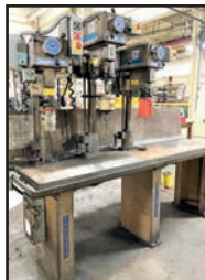
CLAUSING 1687 3-HEAD GANG DRILL