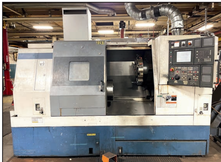
MORI SEIKI SL-300B/700 TURNING CENTER