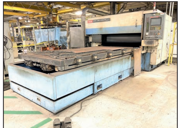
MAZAK SUPER TURBO X510 LASER

MAZAK SUPER TURBO X510 HI-PRO SUPERCHARGED , 2,000 Watt Laser, s/n 125467, w/MAZAK L PLUS Control, 120" x 60" x .75" Max. Workpiece, YB-L200B 7M Co2 Laser