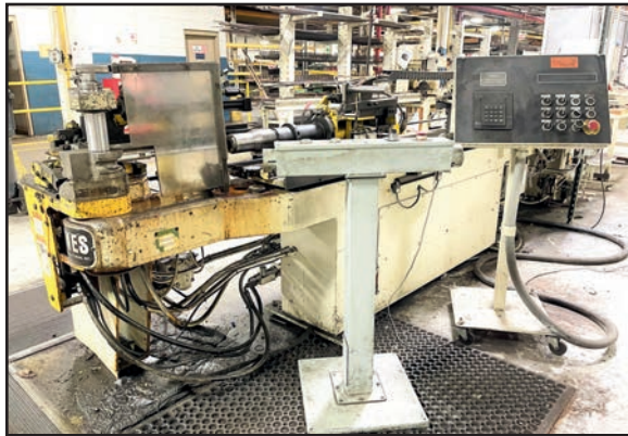
(1 OF 2) TELEDYNE PINES #1 TUBE BENDERS