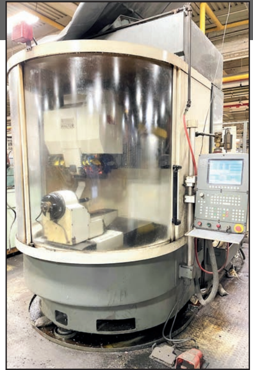
WALTER HELITRONIC POWER CNC TOOL AND CUTTER GRINDER

KEARNEY & TRECKER 415 S-15 HORIZONTAL MILL , s/n 53-1005-35, w/ 15" x 76" Table