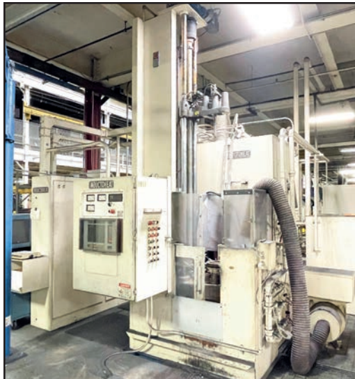
INDUCTOHEAT BSP5-300-3/10 300 KW INDUCTION HEATER

CAN-ENG QUENCH LINE , s/n 100212, w/1218-A Toolmaster Furnace and 200 Gallon Quench Tank