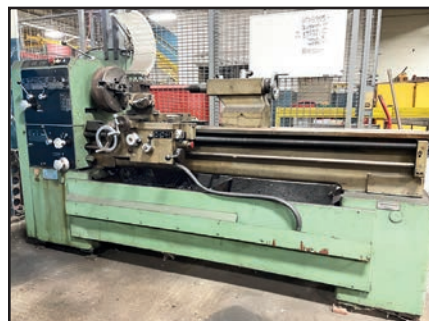
VOEST DA 250 20" X 60" ENGINE LATHE