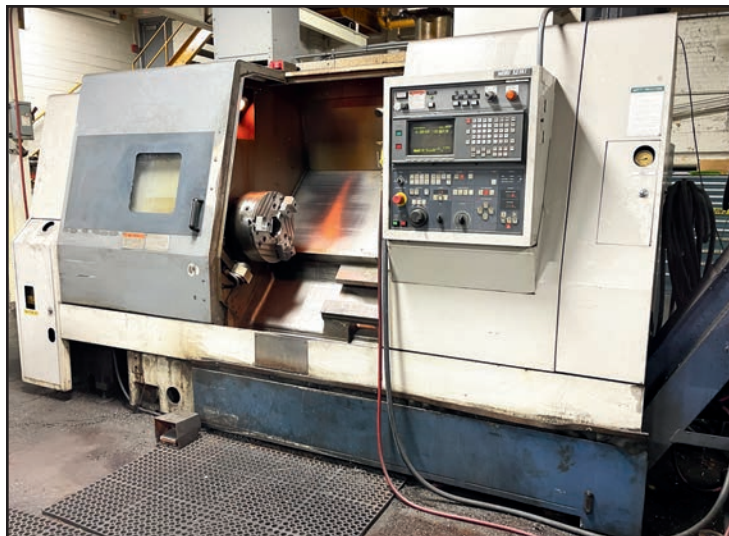
MORI SEIKI SL-35B TURNING CENTER

2007 HAAS TM-1 CNC TOOL ROOM MILL , s/n 1061042, HAAS Control, 10.5" x 47.75" Table, Travels: X-30", Y-12", Z-16", CAT 40