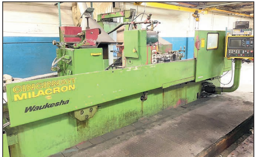
CINCINNATI MILACRON 480 AH CNC STEP GRINDER

Complete Catalog & Information Available at https://perfection.global/inniowaukesha