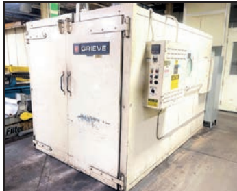
GRIEVE B3-650 60 KW ELECTRIC OVEN