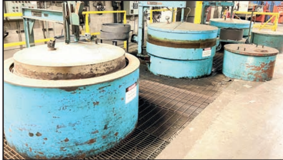
LEEDS & NORTHRUP HOMO NITRIDING FURNACE LINE