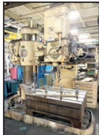
4' CINCINNATI BICKFORD RADIAL ARM DRILL