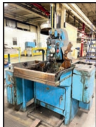
SUNNEN MBB-1670EJ HONE