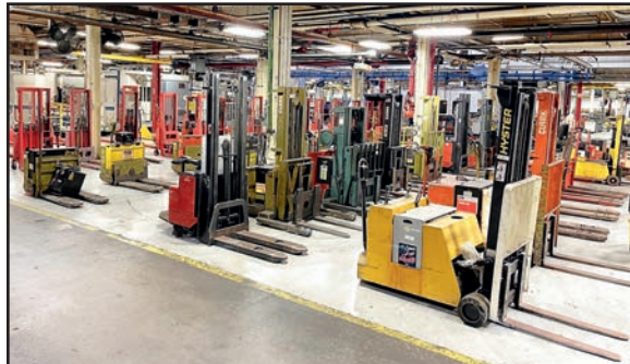
WALKIE TYPE FORKLIFTS