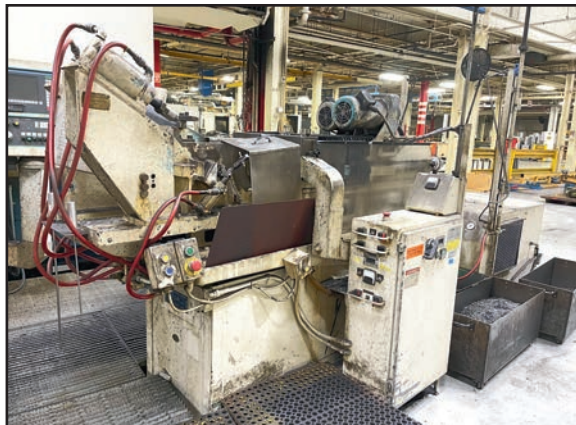
ELDORADO MEGA M75-1013 GUN DRILL