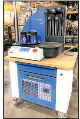
HAIRER SHRINK-FIT MACHINE