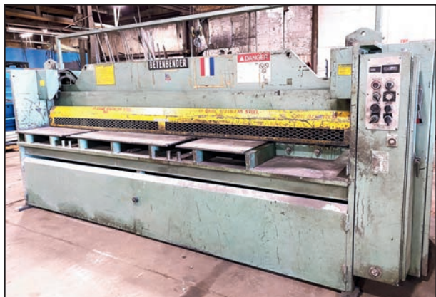
BETENBENDER 1/4" X 10' HYDRAULIC SHEAR

UNIVERSAL LION C13B UNIVERSAL LATHE , s/n 2473, 12" 3-Jaw Chuck, 32" Swing, 42" in Gap, 96" Center Distance, 8-1,000 RPM, 4-Way Tool Post, Steady Rest, w/30" Face Plate