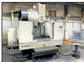
MITSUBISHI M-V60C PLUS CNC VERTICAL MACHINING CENTER