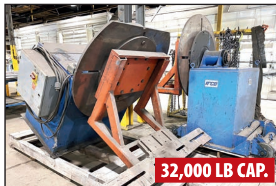
IRCO 16K HEADSTOCK AND TAILSTOCK WELDING POSITIONER