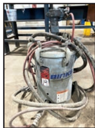
BINKS 5-GALLON PRESSURE POT W/MDL. 7 SPRAY GUN