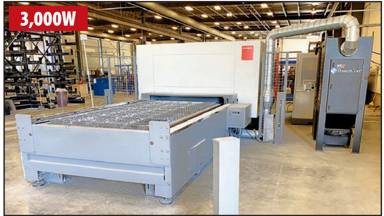
BYSTRONIC BYSMART FIBER 3015 (REAR VIEW)