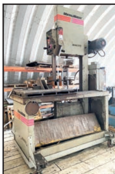
METAL MIZER MS2018 VERTICAL BANDSAW