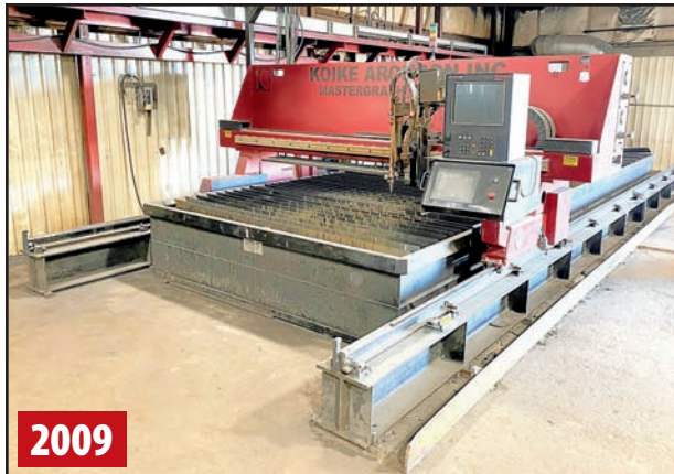
KOIKE ARONSON MGM1500 PLASMA CUTTING SYSTEM

2015 BYSTRONIC BYSMART FIBER 3015 CNC FIBER LASER CUTTING SYSTEM , s/n K30025434, ByVision Control, Dual 60" x 120" Tables, Fiber 3,000 Watt Source, 4,484 Cutting Hours, Donaldson Torit PowerCore TG 4 Collection System *See Video of Laser Running on Website*