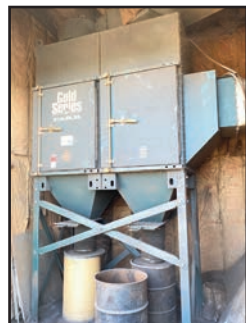
FARR GOLD SERIES GS8 DUST COLLECTION SYSTEM