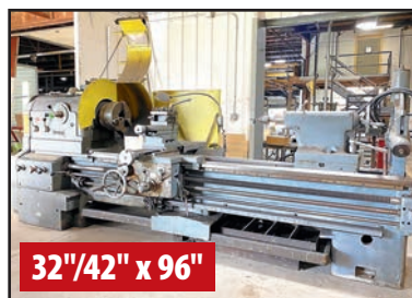
UNIVERSAL LION C13B UNIVERSAL LATHE