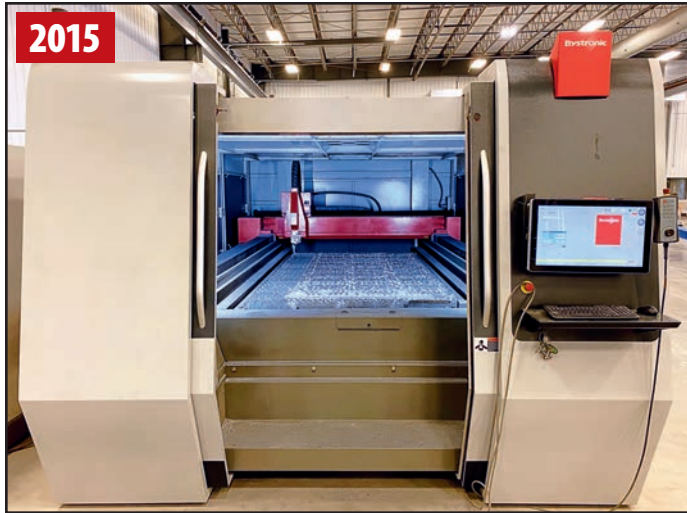
BYSTRONIC BYSMART FIBER 3015 (FRONT VIEW)