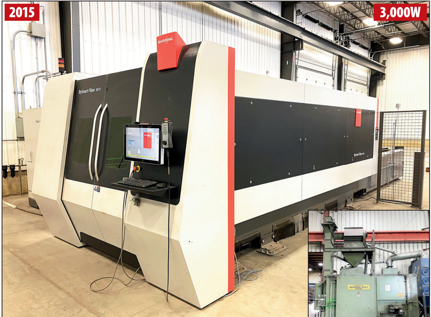
BYSTRONIC BYSMART FIBER 3015 CNC FIBER LASER CUTTING SYSTEM

LATE MODEL FIBER LASER, FABRICATION & MACHINING EQUIPMENT