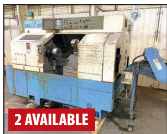
AMERA-SEIKI TC-2SL CNC LATHE