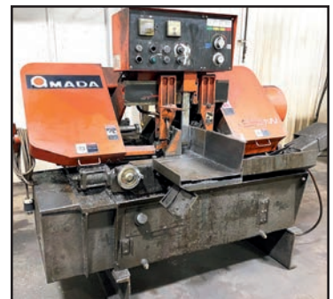
AMADA HA250W HORIZONTAL BANDSAW