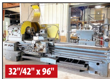
UNIVERSAL LION C13B UNIVERSAL LATHE