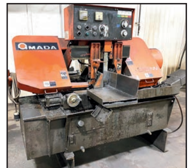
AMADA HA250W HORIZONTAL BANDSAW