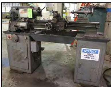
LOGAN 2557VH TOOL ROOM LATHE