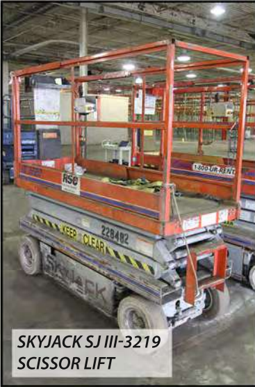
SKYJACK SJ III-3219 SCISSOR LIFT

ALSO: VIDMAR Ball Bearing Tool Cabinets, Spools of PRESTOLITE Wire, Welding Tables, Large Quantity of MRO Supplies, Free Standing Fume Extractor, Battery Chargers, Floor Scales, Shop Racks, Safety Ladders, Motors, Flammable Liquid Cabinets, Power and Hand Tools, Welding Supplies, Pallet Jacks, Shop Carts, Heavy Duty, Stackable Steel Crates, Shop Fans & Much More