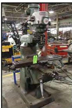
BRIDGEPORT 1.5 HP VERTICAL MILL