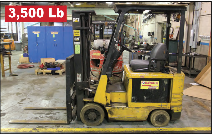
CATERPILLAR 2EC18 ELECTRIC FORKLIFT