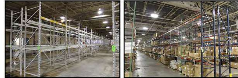
SECTIONS OF PALLET RACKING

View our current auction schedule at www.perfectionindustrial.com