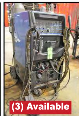
MILLER 250A WELDING POWER SOURCES