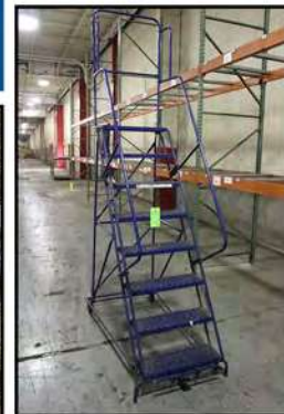
BALLYMORE 6-STEP SAFETY LADDER