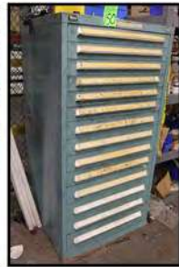
VIDMAR BALL BEARING TOOL CABINETS