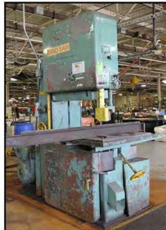
TANNEWITZ VERTICAL BANDSAW