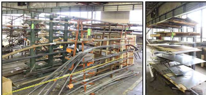
RACKS W/ ASSORTED STEEL STOCK