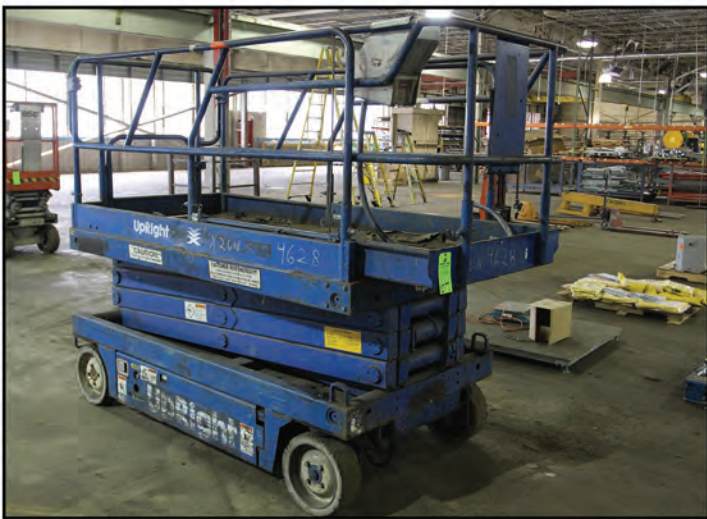
UPRIGHT 66100-00 SCISSOR LIFT

Sale Closing From: Tuesday, May 1, 10:00 AM CT Sale Location: 704 Highway 25 S. Aberdeen, MS 39730 Inspection: Monday, April 30 from 9:00 AM to 4:00 PM CT