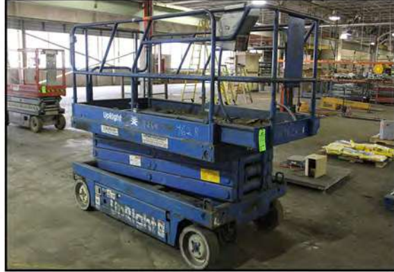
UPRIGHT 66100-00 SCISSOR LIFT