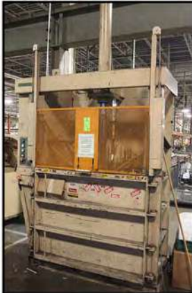
CHALLENGER CARDBOARD BALER