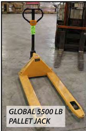
GLOBAL 5500 LB PALLET JACK

To discuss your requirements for an auction, please call Perfection Industrial 847-545-6374