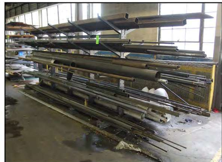
RACKS W/ ASSORTED STEEL STOCK