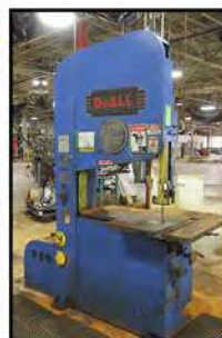
DOALL HP-36 VERTICAL BANDSAW