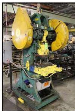
DIAMOND 31 PRESS