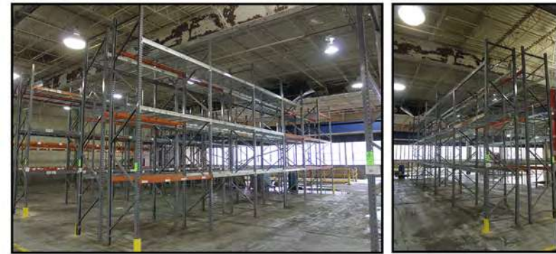
SECTIONS OF PALLET RACKING

OVER (1,400) SECTIONS OF PALLET RACKING , Offered in Assorted Lots, with Uprights from 10' to 17' High, Cross Beams from 8' to 12' Wide and Racking Depth of 42"