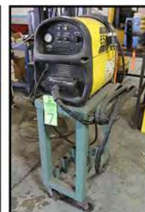
ESAB POWERCUT 650 PORTABLE PLASMA CUTTING SYSTEM