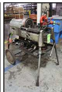
RIDGID 535 PIPE THREADER