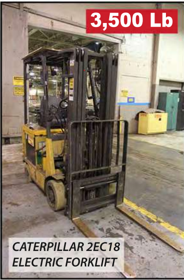
CATERPILLAR 2EC18 ELECTRIC FORKLIFT