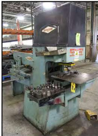
CENTER ENGINEERING METAL MUNCHER MM-31E IRONWORKER

(5) MILLER & LINCOLN 250A WELDING POWER SOURCES