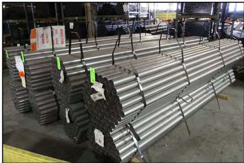
LOT OF (11) BUNDLES OF STEEL TUBING