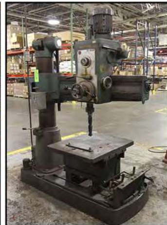
BERGONZI FS1000 6" X 4' RADIAL ARM DRILL