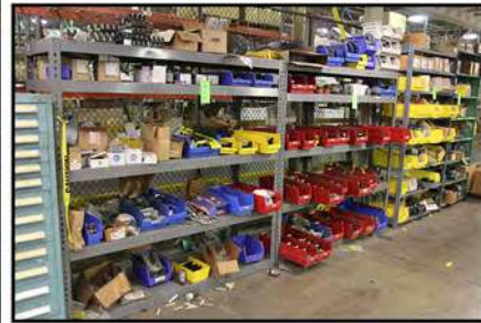
LARGE QUANTITY OF MRO SUPPLIES