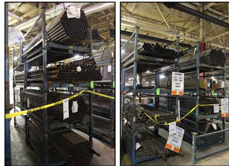
LOT OF STEEL TUBING

(6) RACKS W/ ASSORTED STEEL STOCK , Bar, Flat, Round, etc.