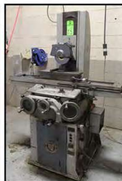
REID 618 P SURFACE GRINDER