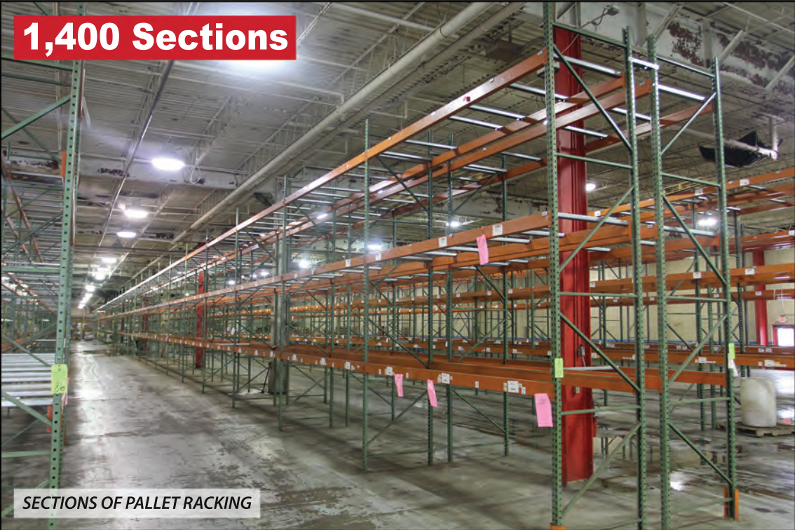
SECTIONS OF PALLET RACKING