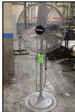
MAXXESS 30" PEDESTAL SHOP FAN