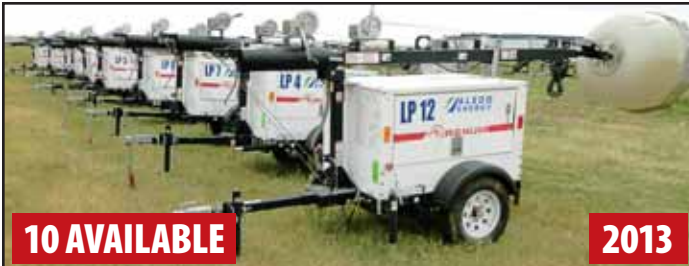
MAGNUM MOBILE LIGHT TOWERS

View our current auction schedule at www.perfectionindustrial.com