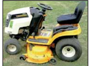
CUB CADET LAWN MOWER