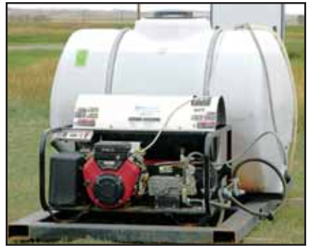
MFR RK40 PRESSURE WASHER