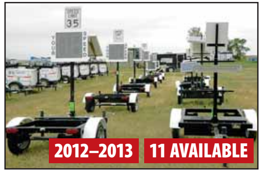
SPEED MONITOR SYSTEMS