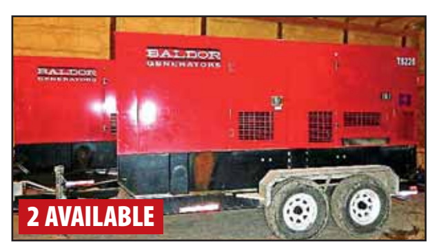
(2) 225 KW BALDOR MOBILE GENERATORS