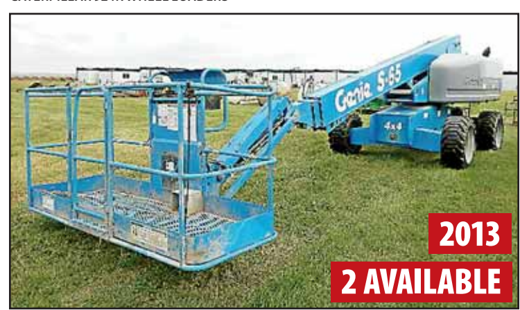
GENIE S65 BOOM LIFT