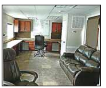
ATCO BUILDING INTERIORS