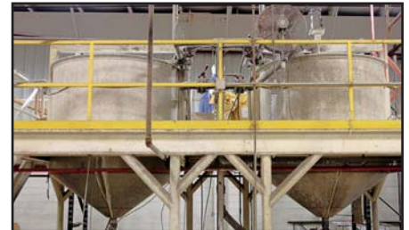
DUAL HOPPER COMPOUND MIXING SYSTEM

GLOBAL FINISHING SOLUTIONS GFS-BDB-4-S SPRAY BOOTH , s/n 48029, 48"W x 80"H x 60"D