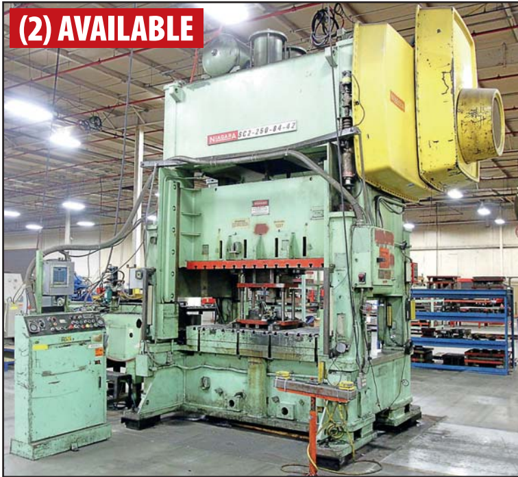
NIAGARA SC2-250-84-42 250-TON STRAIGHT-SIDE DOUBLE-CRANK PRESS

Facility Closure – Stamping, Fabrication, Finishing, Tool Room & Plant Support