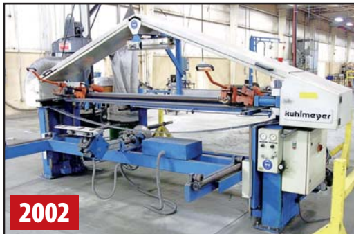
KUHLMAYER ZBS2 TWIN-BELT GRINDING MACHINE