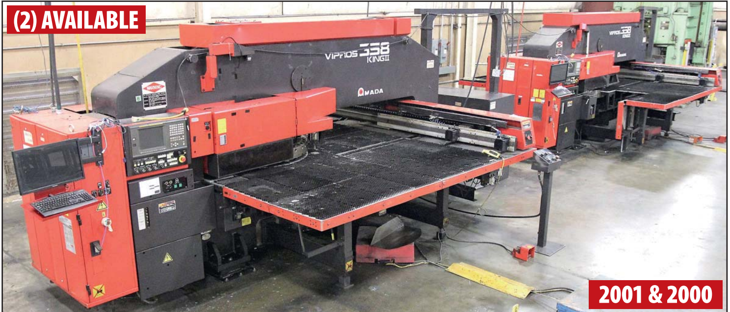
AMADA VIPROS 358 KING II CNC TURRET PUNCHES

Sale Date: Thursday, February 16, 2017 at 10:00 AM EST Inspection: Wednesday, February 15 from 8:00 AM – 4:00 PM EST Sale Location: 149 Cleveland Drive, Paris, Kentucky 40361