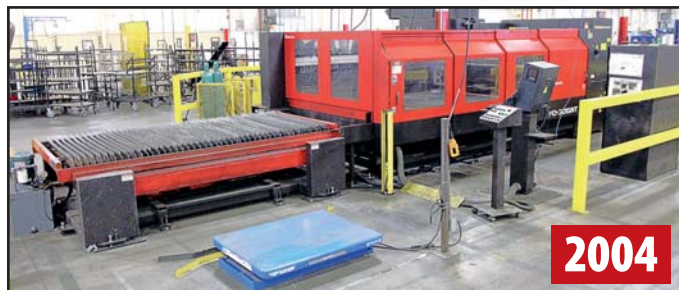
AMADA FO3015NT CNC LASER

STAMPING, CNC TURRET PUNCHES W/LARGE SELECTION OF TOOLING, PRESS BRAKES, SHEAR, SEAM & SPOT WELDERS, PAINT LINE & BOOTH, BATCH OVENS, INFRARED OVENS, TOOL ROOM & MUCH MORE