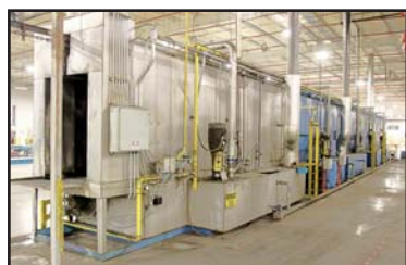
5-STAGE IRON PHOSPHATE PRETREATMENT SYSTEM