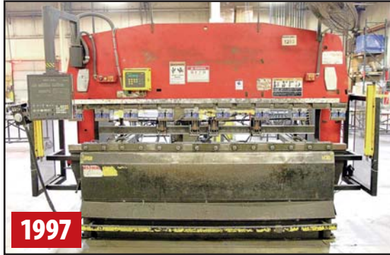
AMADA RG-100 110-TON X 10' CNC PRESS BRAKE