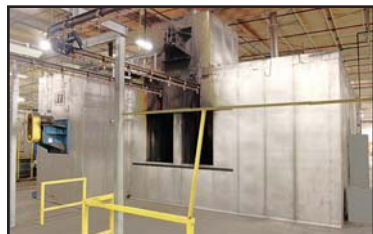
POWDER CURE OVEN