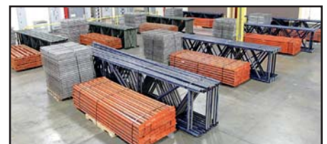
LARGE SELECTION OF PALLET RACKING