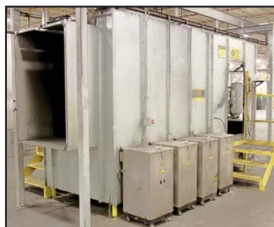
WAGNER PRIMA FLOW PAINT BOOTH SYSTEM