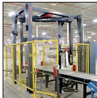
WULFTEC WCRT-200 AUTOMATIC ROTARY ARM STRETCH WRAPPER