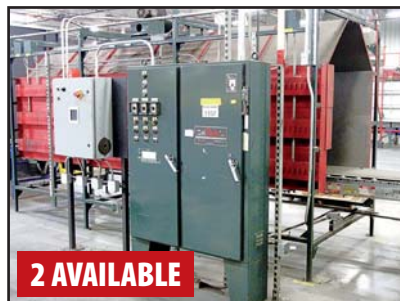
DRI-QUIK 9-60-1500 PASS-THRU INFRARED OVEN