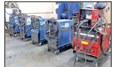
VIEW OF WELDERS