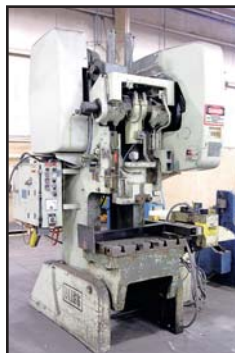
BLISS C60 60-TON OBI PRESS