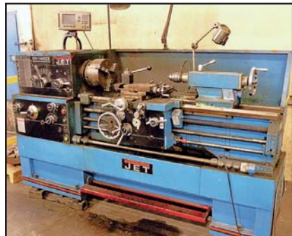
JET GH-1440ZX 14" X 40" GEARED-HEAD PRECISION LATHE

ALSO: 2002 KUHLMAYER ZBS2 TWIN-BELT GRINDING MACHINE , s/n 0203131, w/Dayton Dust Collector, CENTRAL MACHINERY T-583 16-SPEED DRILL PRESS , (2) CLAUSING 1642 DRILL PRESSES , s/n's 178149, 128145, CENTRAL MACHINERY HORIZONTAL BANDSAW , BLACK & DECKER 8" HEAVY-DUTY BENCH GRINDER , 2" HEAVY-DUTY BELT SANDER , CORNER NOTCHER , WORLD MACHINE MC350NFA COLD SAW , s/n 93MSA3500131, (2) MAPLEWOOD 36" ROLL FORMERS , (2) KURT 6" D688 ANGLOCK PRECISION MACHINE VISES , (3) KURT 6" ANGLOCK PRECISION MACHINE VISES , WILTON 8" BENCH VISE , ROCK RIVER 6" BENCH VISE , MILFORD 305 RIVET MACHINE , s/n 2724, HAEGER HP6-C-2 3-TON INSERTION PRESS , s/n 2938, FASTI 431-63-1.25 COLD FLANGING MACHINE , s/n 97 431 007, w/63mm x 1.25mm Capacity