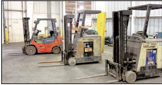
VIEW OF FORKLIFTS