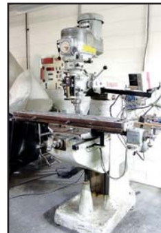
BRIDGEPORT 2 HP VERTICAL MILL