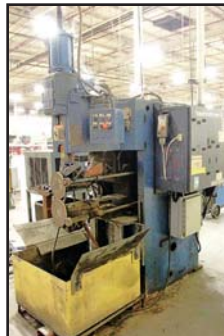
TECHNITRON T2050/V1 192 KVA SEAM WELDER

ALSO: LARGE ASSORTMENT OF WELDING TABLES AND WELDING SUPPLIES