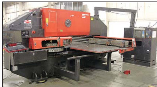
AMADA PEGA 357 CNC TURRET PUNCH