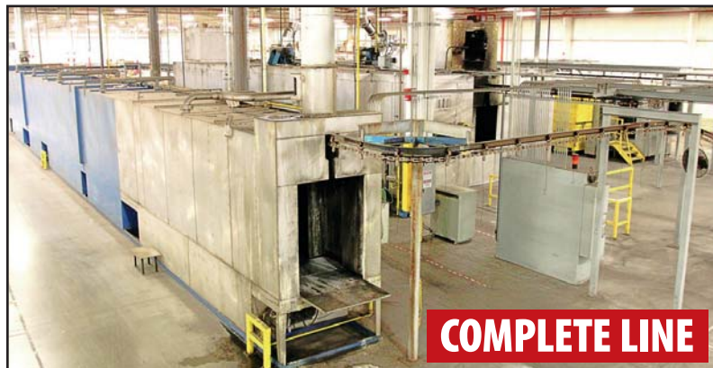
CINCINNATI INDUSTRIAL MACHINERY S0545 POWDER COATING SYSTEM