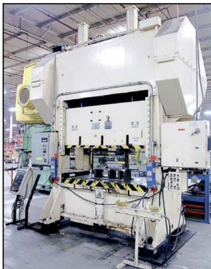
FEDERAL S2-150 150-TON STRAIGHT-SIDE PRESS