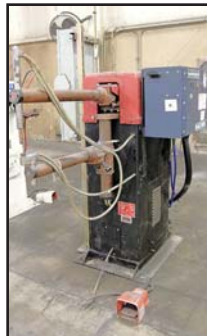
JANDA 3-75-24 75 KVA SPOT WELDER