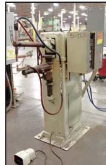
ACMA 3-3-75 75 KVA SPOT WELDER