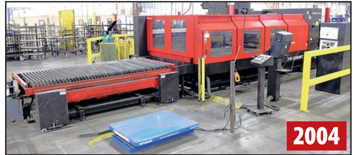
AMADA FO3015NT CNC LASER

FEATURING: STAMPING, CNC TURRET PUNCHES W/LARGE SELECTION OF TOOLING, PRESS BRAKES, SHEAR, SEAM & SPOT WELDERS, PAINT LINE & BOOTHS, BATCH OVENS, INFRARED OVENS, TOOL ROOM & MUCH MORE