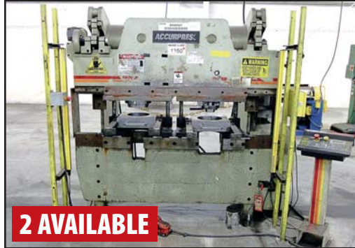
ACCURPRESS 7606 60-TON X 6' CNC PRESS BRAKE