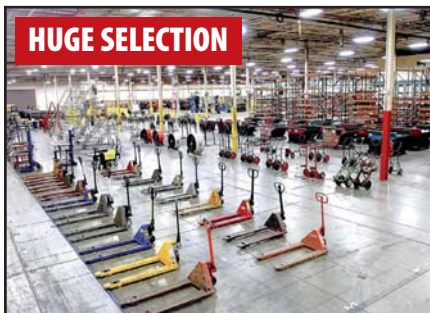
VIEW OF FACTORY SUPPORT EQUIPMENT

ALSO: 2015 POLYCHEM PC1000S AUTOMATIC STRAPPING MACHINE, s/n 21887, (2) JUSTRITE 25760 2-DRUM COMBUSTIBLE LIQUIDS CABINET, (2) JUSTRITE SURE GRIP EX 899100 2-DRUM FLAMMABLE LIQUIDS CABINET, 110-GALLON EAGLE HAZ1955 FLAMMABLE LIQUIDS CABINET, 45-GALLON EAGLE 1947 FLAMMABLE LIQUIDS CABINET, (2) 40-GALLON JUSTRITE SURE GRIP EX 894500 FLAMMABLE LIQUIDS CABINETS, 30-GALLON EAGLE 3010 FLAMMABLE LIQUIDS CABINET, JUSTRITE SURE GRIP EX PAINT AND INK STORAGE CABINET, HUGE SELECTION OF DAYTON, TPI, AIR KING, MAXXAIR, AND PROFITTER SHOP FANS, PALLET JACKS, HAND TOOLS, POWER TOOLS, PNEUMATIC TOOLS, RIDGID PIPE THREADER, MAG DRILL, CANTILEVER RACKING, LADDERS, SAFETY LADDERS, HAND TRUCKS, DIE LIFT CARTS, WORK BENCHES, WORK TABLES, OFFICE FURNITURE AND MUCH MORE