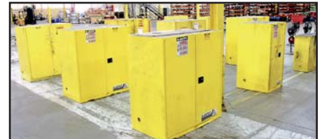
VIEW OF FLAMMABLE LIQUIDS CABINETS