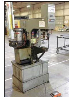
HAEGER HP6-C-2 3-TON INSERTION PRESS