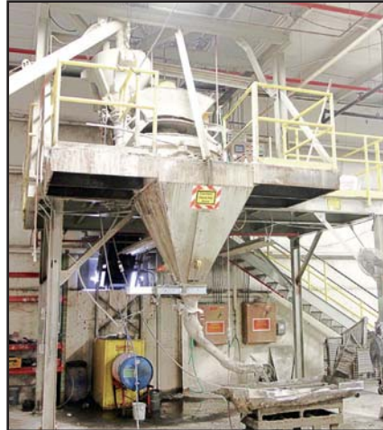
RAPID INTERNATIONAL 58" DIAMETER REFRACTORY MIXER SYSTEM

FILTER1 BENCHTRON BFS4-2-3 DOWNDRAFT TABLE , s/n 04-18-365, 2,000 CFM, 24" x 48" Table