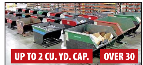
VIEW OF SELF DUMPING HOPPERS