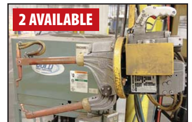
ARO S4321 39 KVA SPOT WELDER

To discuss your requirements for an auction, please call Perfection Industrial 847.545.6374