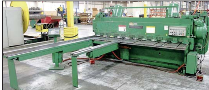
CINCINNATI 1810G POWER SHEAR

CINCINNATI 1810G POWER SHEAR , s/n 52039, w/1/4" Mild Steel, 122-1/4" Max. Cut Length, (11) Hold Downs, 60 SPM, 4-Probe Power Backgauge, 11' Square Arm, Front Material Supports, Electric Foot Pedals