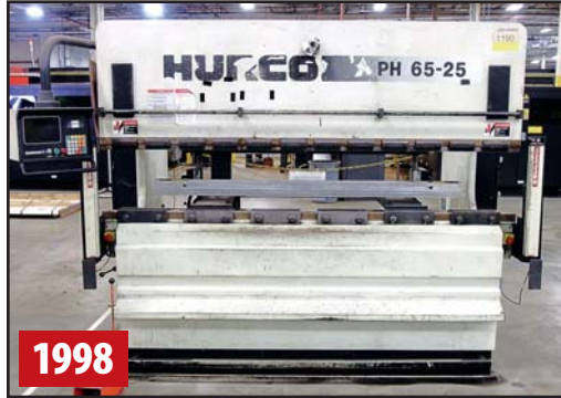
HURCO PH 65/25 77-TON PRESS BRAKE