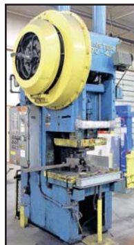
MINSTER 70-4-1/2 70-TON GAP-FRAME PRESS