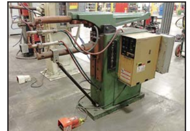
WELD-O-MATIC AF2B 50 KVS SPOT WELDER