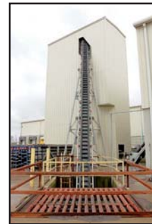
DUAL SILO STORAGE UNIT W/ELEVATOR LOADING SYSTEM