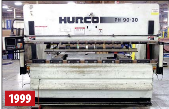
HURCO PH 90/30 90-TON X 10' PRESS BRAKE