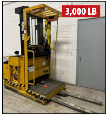
YALE 0S030EAN24TE095 ORDER PICKER