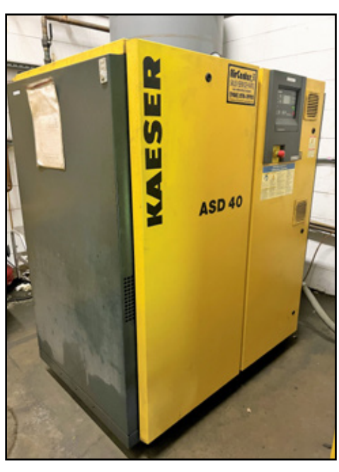
1 OF 2 KAESER ASD 40 ROTARY SCREW AIR COMPRESSORS