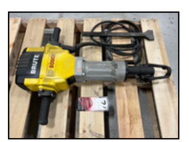
BOSCH BREAKER HAMMER