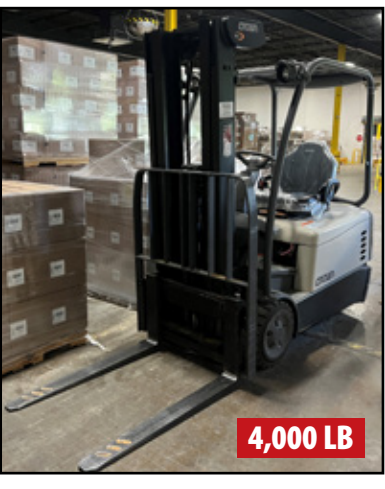
CROWN SC 5200 SERIES 3-WHEEL FORKLIFT