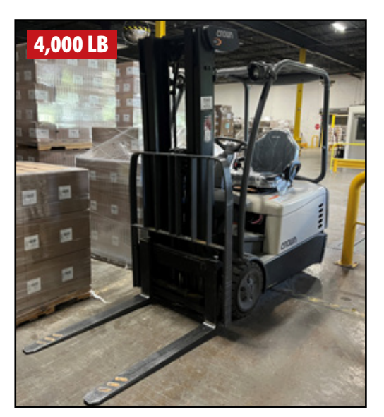
CROWN SC 5200 SERIES 3-WHEEL FORKLIFT