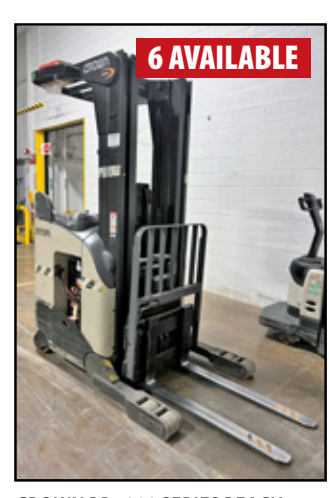
CROWN RR 5200 SERIES REACH TRUCK