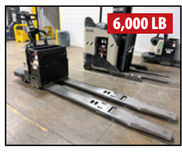
CROWN PE4000 SERIES RIDER PALLET