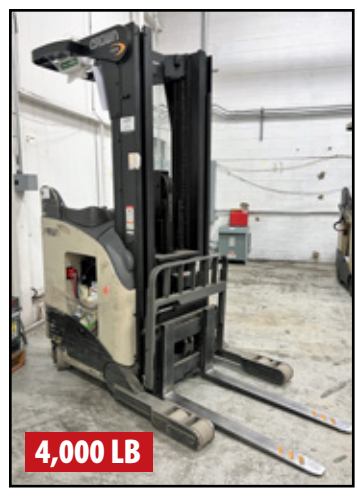
1 OF 6 CROWN RR 5200 SERIES REACH TRUCK