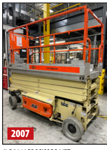
JLG 2646 ES SCISSOR LIFT