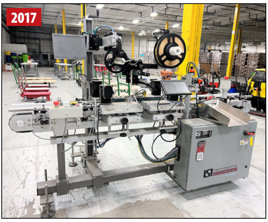
ID TECHNOLOGY LSI 1300 TOP PANEL LABEL SYSTEM

complete catalog & Information: https://perfection.global/6054