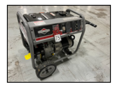
BRIGGS & STRATTON GENERATOR

GLOBAL Wood Top Work Benches, ULINE Packaging Tables, Heavy Duty Steel Tables, Shop Carts, Lift Tables, Pallet Jacks, Shop Carts, BOSCH Breaker Hammer, Generator, KARCHER 80/120W Floor Scrubber, Flammable Liquids Storage Cabinets, Wire Baskets, Packaging Materials, Break Room Appliances, and More