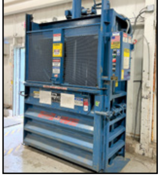
MARATHON RU-225-VL ROLL-OFF COMPACTOR