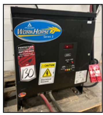
APPLIED ENERGY 24V BATTERY CHARGER