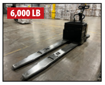
CROWN PE4000 SERIES RIDER PALLET