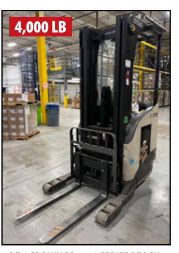
1 OF 6 CROWN RR 5200 SERIES REACH TRUCK