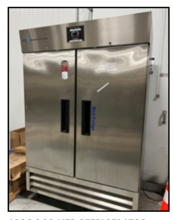
ABS DOOR MED REFRIGERATOR