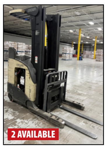
CROWN RD 5000 SERIES DOUBLE REACH TRUCK