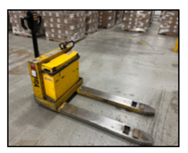
YALE MPB040ACN24C2748 4,000 LB. PALLET JACK