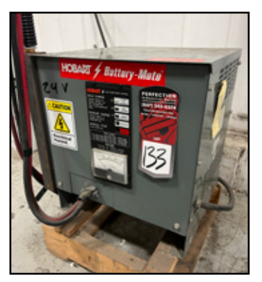
HOBART 24V BATTERY CHARGER