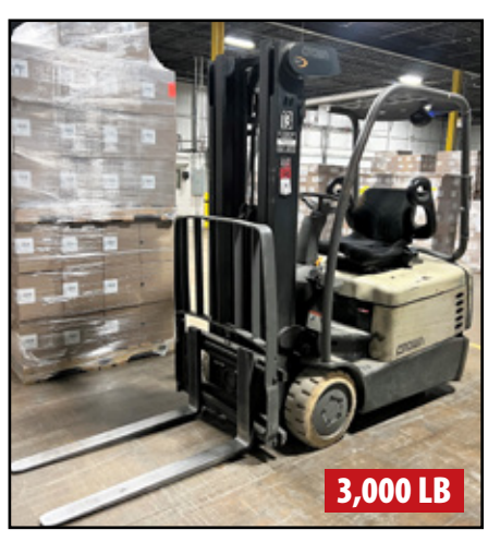
CROWN SC 4000 SERIES 3-WHEEL FORKLIFT