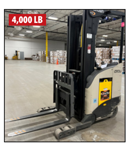
1 OF 6 CROWN RR 5200 SERIES REACH TRUCK