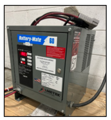
BATTERY MATE 36V BATTERY CHARGER