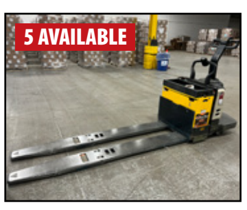
CROWN PE4000 SERIES RIDER PALLET