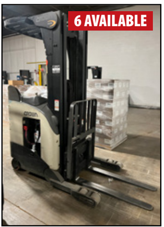
CROWN RR 5200 SERIES REACH TRUCK