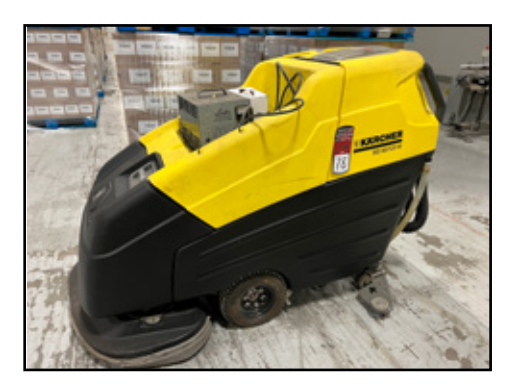
KARCHER 80/120W ELECTRIC POWER SCRUBBER

KAESER AQUAMAT 4 OIL/WATER SEPARATOR 400 GALLON AIR TANK