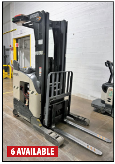
CROWN RR 5200 SERIES REACH TRUCK

FEATURING: (10) CROWN Order Picker and Sit Down Forklifts, (5) CROWN Ride on Pallet Jacks, JLG 2646 Scissor Lift, (2) 2017 ID TECHNOLOGY LSI 1300 Top Panel Label System, (2) KAESER ASD 40 Air Compressors, Air Dryers, INTERTEK & MARATHON Cardboard Balers & Compactor, Large Selection of Plant Support Including HD Tables, Pallet Jacks, Shop Carts and More