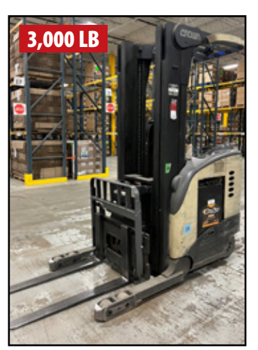
1 OF 2 CROWN RD 5000 SERIES DOUBLE REACH TRUCK