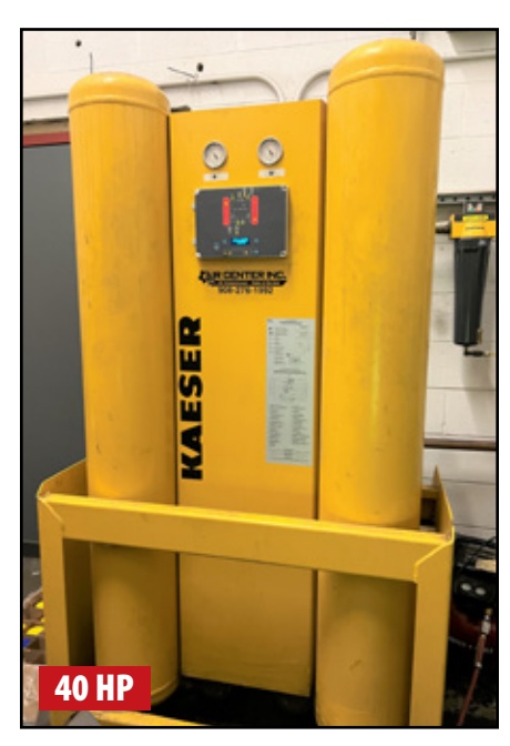
KAESER KAD-260 COMPRESSED AIR DRYER