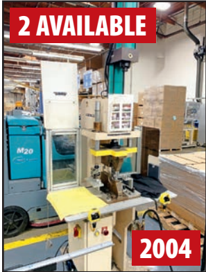
TOX PRESSOTECHNIK PC-8 PNEUMATIC CRIMPING PRESS