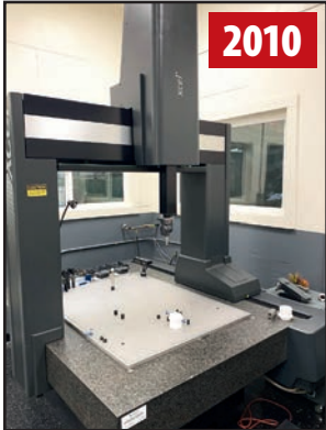
BROWN & SHARPE EXCEL 9-12-9 UA CMM