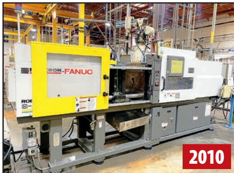
CINCINNATI MILACRON FANUC ROBOSHOT S-2000i 110B ELECTRIC INJECTION MOLDER