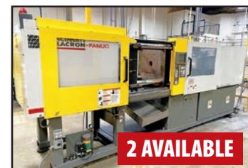
CINCINNATI MILACRON FANUC ROBOSHOT 165R-178 ELECTRIC INJECTION MOLDER