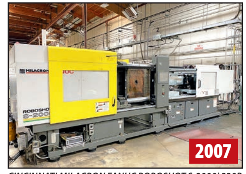
CINCINNATI MILACRON FANUC ROBOSHOT S-2000i 330B ELECTRIC INJECTION MOLDER