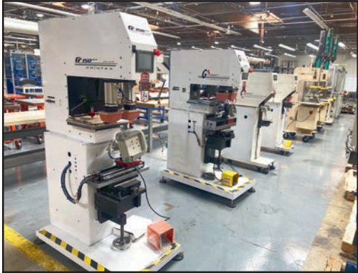
VIEW OF PRINTEX PAD PRINTERS