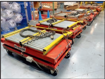
ASSORTED PRESTO SCISSOR LIFT TABLES

All items must be removed no later than Friday, July 17. All removal is strictly on an appointment only basis. Anyone removing purchased items with a lift truck or another powered vehicle must have a certificate of insurance with a $2M General Liability policy, and that certificate must be provided to the auctioneer for review and approval prior to the auction.