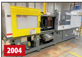
CINCINNATI MILACRON FANUC ROBOSHOT S-2000i 165SiB ELECTRIC INJECTION MOLDER