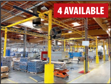
4 AVAILABLE CV TRANSTATION 1-TON SINGLE BRIDGE FREE STANDING CRANE SYSTEM