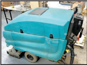
TENNANT 5700 XP ELECTRIC WALKIE-TYPE POWER SCRUBBER