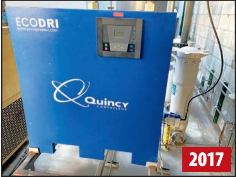
2017 QUINCY ECODRI CYCLING AIR DRYER

To avoid any public gatherings, there will be no onsite participation in this Webcast-Only Auction. All bidders will be able to place live, real-time bids using a desktop or mobile device (the exact same way Webcast bidders have participated in previous sales) and can listen live in real-time to the auctioneer's audio stream.