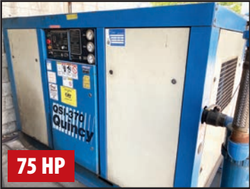
75 HP QUINCY QSI-370 AIR COMPRESSOR INGERSOLL RAND IRN75H-CC AIR COMPRESSOR

View our current auction schedule at www.perfectionindustrial.com To discuss your requirements for an auction, please call Perfection Industrial +1-847-545-6374