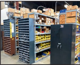
HUGE ASSORTMENT OF MAINTENANCE CRIB CONTENTS

ALL PURCHASES MUST BE PAID WITHIN 48 HOURS OF THE CLOSE OF SALE. Contact our Accounting team for wire instructions. Only wire transfer or certified check, payable to Perfection Industrial Sales will be accepted. Company checks payable to Perfection Industrial Sales will be accepted only if accompanied by a bank letter of guarantee. All sales are subject to sales tax. Purchasers claiming Sales Tax exemptions must provide proof satisfactory to the Perfection Accounting team to claim such exemptions.