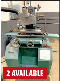
HARIG 618W HANDFEED SURFACE GRINDER