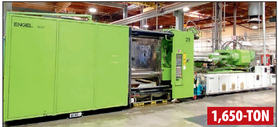
ENGEL 16050/1650 DU HYDRAULIC INJECTION MOLDER

Sale Date: Tuesday, June 30 at 10:00 AM PDT Sale Location: 875 Pomona Blvd., Pomona, California 91768 Inspection: Monday, June 29, By Appointment Only, in Person and Via Video Call