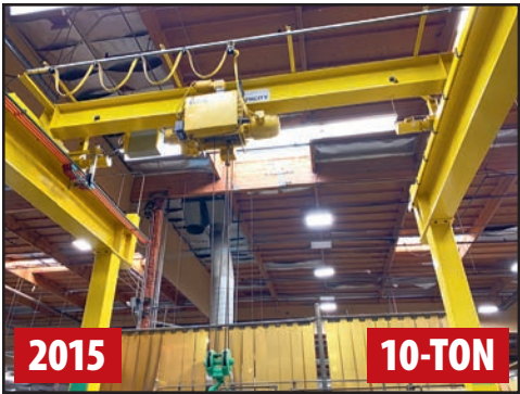
2015 TRADE-MARK HOIST FREE STANDING OVERHEAD BRIDGE CRANE SYSTEM