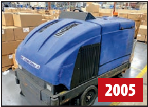
2005 AMERICAN LINCOLN 505-315 ELECTRIC POWER SCRUBBER

ALSO: JUSTRITE FLAMMABLE MATERIAL STORAGE CABINETS, LISTA CABINETS, STRONGHOLD CABINETS, WIRE SPOOLS, ELECTRICAL CABLES, COUPLINGS, CONNECTORS, ELECTRICAL PARTS, SWITCHES, STROBE LIGHTS, SEALS, RETAINING RINGS, BEARINGS, SLING HOOKS, CHAINS, PRESSURE GAUGES, BELTS, ELECTRICAL BOXES, PORTABLE COMPRESSOR, ENDCAPS, KNIVES, COLLARS, WASHERS, COPPER TUBE, ELECTRICAL SWITCHES, DIES, TAPS, CARBIDE END MILLS, CUTTERS, SCREWS, REAMERS, BUSHINGS, SET SCREWS, TABLE CLAMPS, ASSORTED TEAR DROP PALLET RACKS, CANTILEVER RACKING, DIE RACKS, STRETCH WRAPPERS, DIGITAL PLATFORM SCALES, DUMPING SCRAP HOPPERS, WORK BENCHES, TOOL CARTS, FLAMMABLE LIQUID STORAGE CABINETS, ROLLING SHOP LADDERS, RIGGING EQUIPMENT AND HARDWARE, RETRACTABLE HOSE REELS, RETRACTABLE ELECTRICAL REELS, LADDERS, ELECTRICAL/PLUMBING/MAINTENANCE HARDWARE, ELECTRIC HOISTS, ETC.