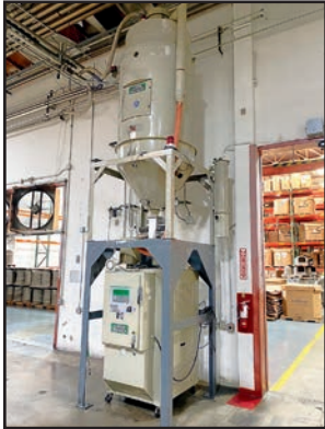
CONAIR FRANKLIN HOPPER/DRYER