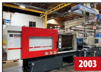
CINCINNATI MILACRON POWERLINE NT330 ELECTRIC INJECTION MOLDER