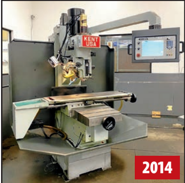
KENT TW-32-QI VERTICAL MILL W/ACU-RITE CONTROL