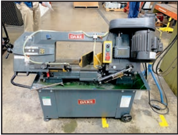
DAKE SE912 HORIZONTAL BANDSAW