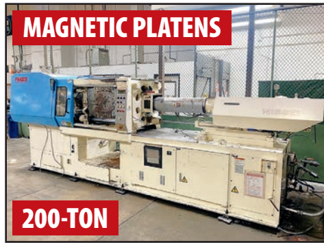
NISSEI FN4000 HYDRAULIC INJECTION MOLDER