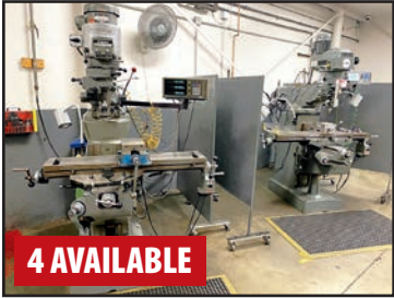
BRIDGEPORT AND LAGUN MILLS