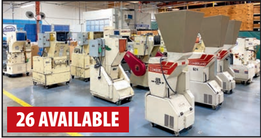
ASSORTED MATERIAL GRINDERS-NEW AS 2017, UP TO 50 HP