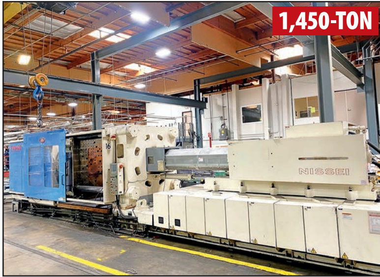
NISSEI FV9400 HYDRAULIC INJECTION MOLDER