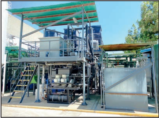
COMPLETE THERMAL CARE/ADVANTAGE/AEC CHILLING SYSTEM