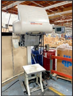
SEALED AIR SPEEDYPACKER INSIGHT SYSTEM