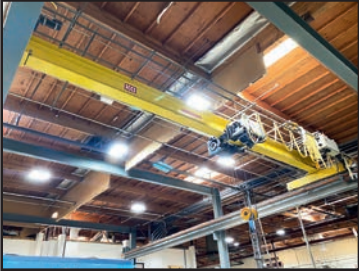
KONE 10-TON FREE STANDING OVERHEAD BRIDGE CRANE SYSTEM