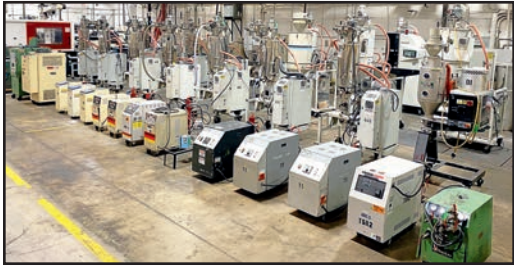
ASSORTED TEMPERATURE CONTROL UNITS

GRINDERS, (2) MILWAUKEE MAG BASE DRILLS, MEDIA BLAST AND ABRASIVES BLAST CABINET, DRILL PRESSES, BELT GRINDERS, MAG CHUCKS, MACHINIST AND BENCH VISES, ANGLE PLATES, CLAMPING SETS, AND MORE