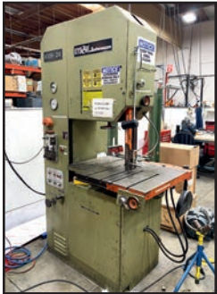
KYSER KVH-24 VERTICAL BANDSAW

Inspection of assets in the sale is STRICTLY BY APPOINTMENT . We encourage inspections held via 1-on-1 video conferencing, however in person inspections can still be accommodated if required. Anyone showing up to the site without a scheduled appointment will be denied entry. Please call Jennifer Reiner at +1-847-545-6374 as soon as possible to schedule your inspection.