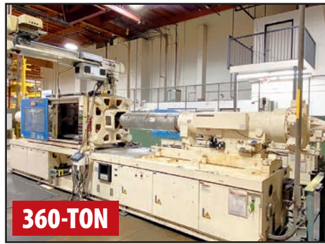
NISSEI FS360 HYDRAULIC INJECTION MOLDER