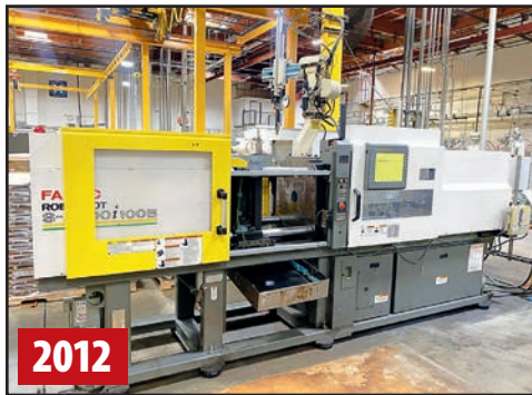
CINCINNATI MILACRON FANUC ROBOSHOT S-2000i 110B ELECTRIC INJECTION MOLDER

(2) CINCINNATI MILACRON FANUC ROBOSHOT 165R-178 165-TON ELECTRIC INJECTION MOLDERS, s/n 4067A04/98-67, 98-65, w/Fanuc Series 16i Control, 8.9 Oz. Shot Size, GP Screw