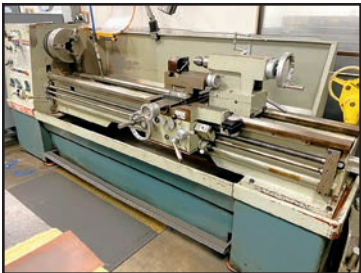
AMERICAN MACHINE TOOL TURNMASTER 21X80 GAP BED ENGINE LATHE