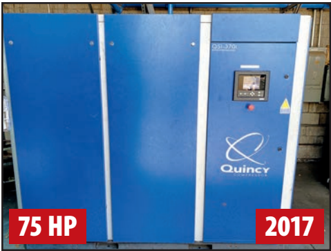
75 HP 2017 QUINCY QSI-370I AIR COMPRESSOR