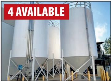
12' X 26' TALL CONE BOTTOM MATERIAL SILOS