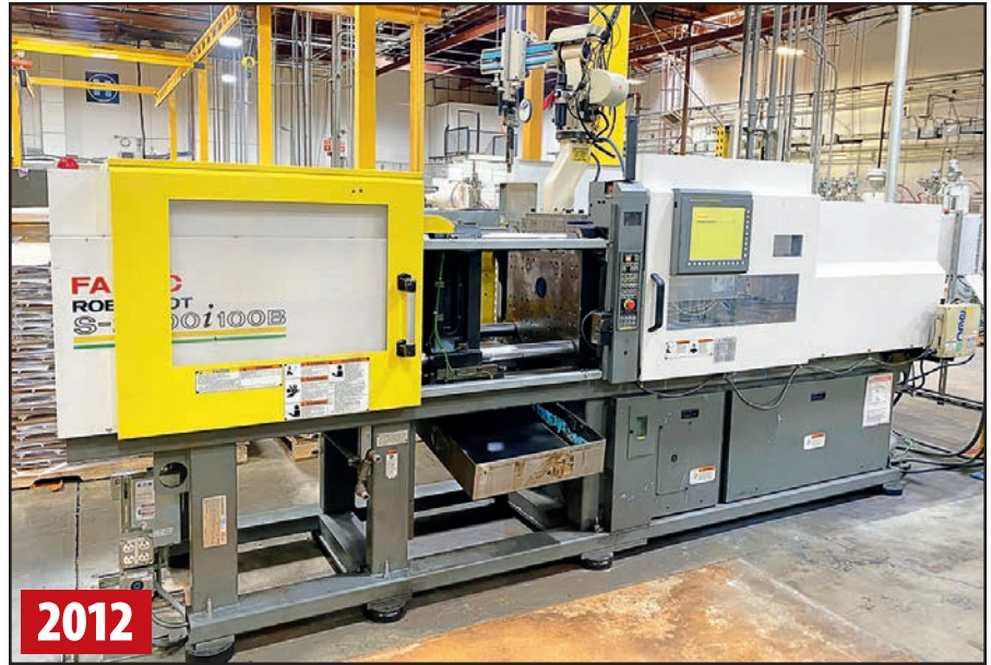
CINCINNATI MILACRON FANUC ROBOSHOT S-2000i 110B ELECTRIC INJECTION MOLDER

Pre-Auction Offers Invited on Major Assets