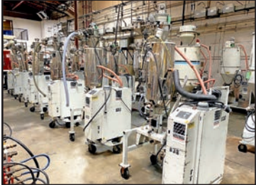
CINCINNATI MILACRON HOPPER/DRYERS