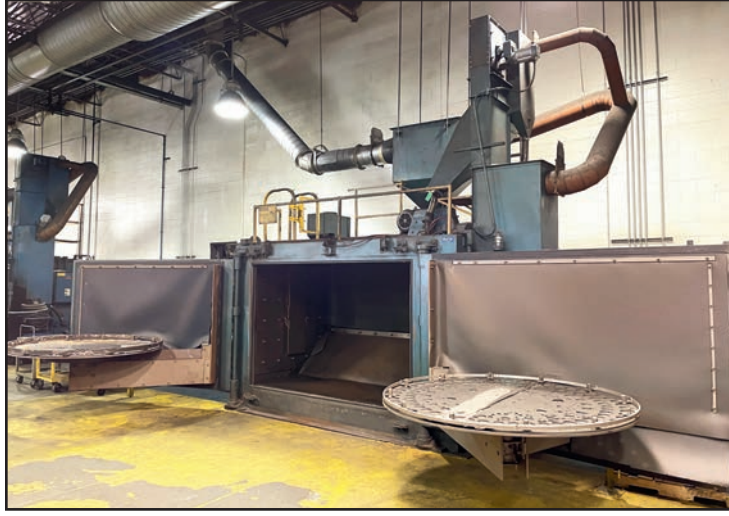
(1 OF 2) WHEELABRATOR ROTARY TWIN TABLE SHOTBLASTS