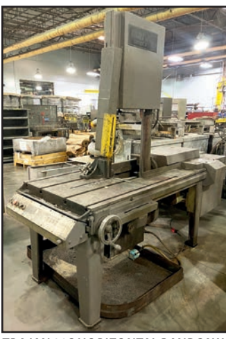
TRAJAN 20S HORIZONTAL BANDSAW