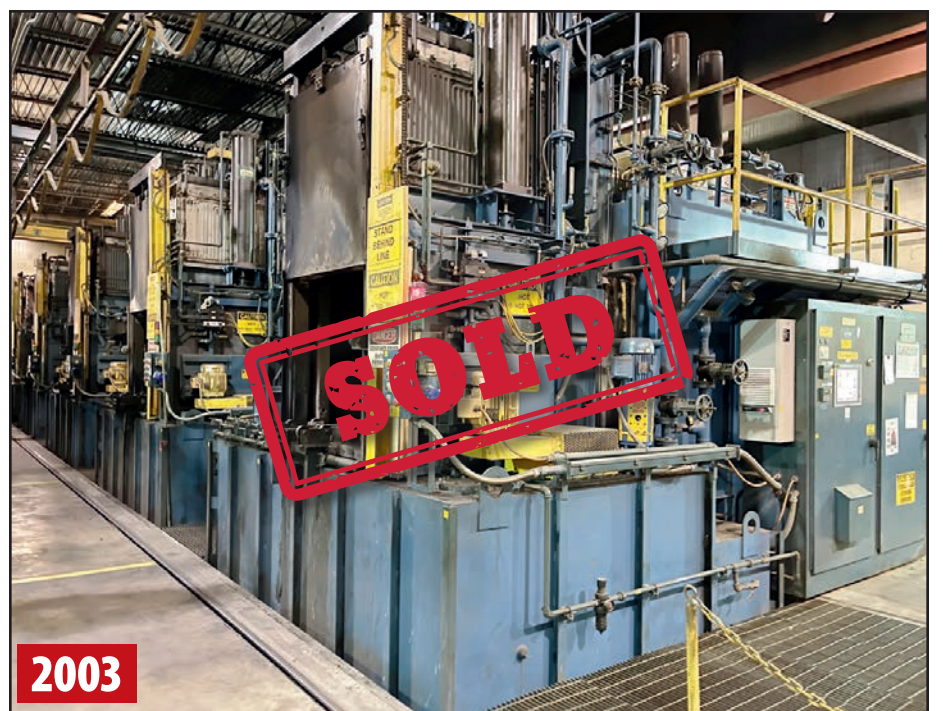
AFC HOLCROFT INTEGRAL QUENCHING FURNACE HEAT TREAT SYSTEM *SOLD PRIOR TO AUCTION*

PHASE 2 – SURPLUS TO THE CONTINUING OPERATIONS OF HALLIBURTON DBS CONROE, TEXAS – CNC MACHINING, FINISHING, WELDING & PLANT SUPPORT