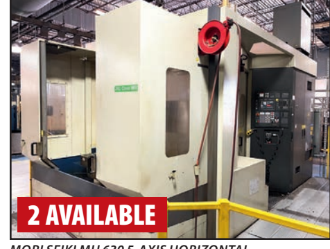
MORI SEIKI MH 630 5-AXIS HORIZONTAL