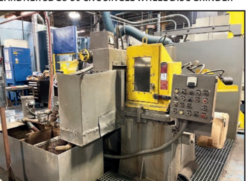
BESLY SH6 23" SINGLE END DISC GRINDER