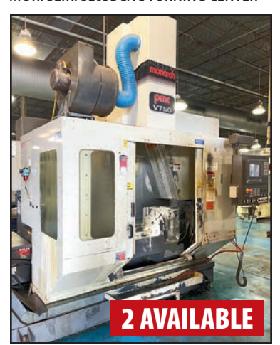
MONARCH PMC V750 4-AXIS VERTICAL MACHINING CENTER