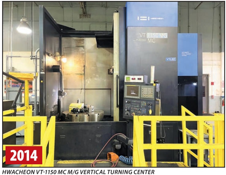
MORI SEIKI SL400BMC/800 TURNING CENTER