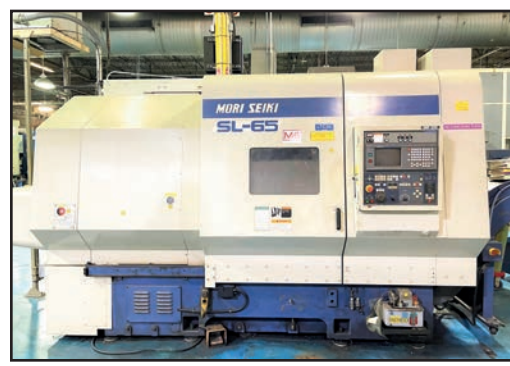
MORI SEIKI SL65A TURNING CENTER

(2) WARNER & SWASEY 3SC CNC CHUCKERS, s/n R-1318, R-1321, w/FANUC 18i-T Control, 24" 3-Jaw Chuck, 12-Position Turret, NOTE: Rebuilt by BARDONS & OLIVER