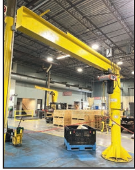
FREE STANDING JIB CRANE