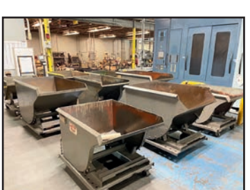
VIEW OF DUMPING HOPPERS