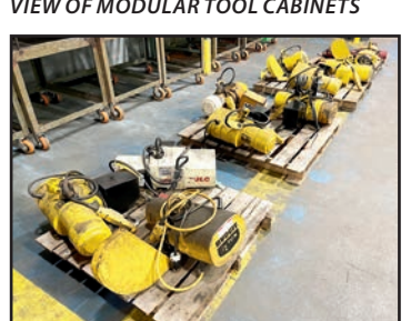
VIEW OF ELECTRIC HOISTS

Pre-Auction Offers Invited on Major Assets