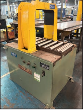
MAGNAFLUX SB-1619 PARTICLE