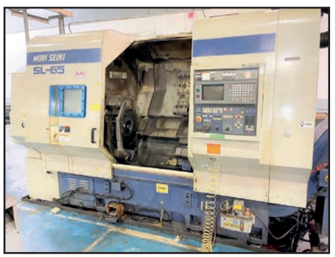
MORI SEIKI SL65BCNC TURNING CENTER