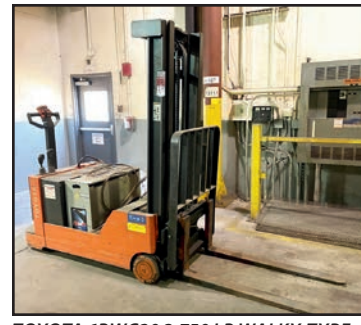
TOYOTA 6BWC20 3,750 LB WALKY-TYPE ELECTRIC STACKERS