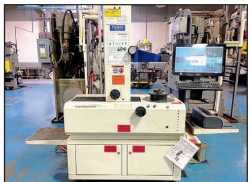
ZOLLER VENTURION 600 TOOL PRE-SETTER