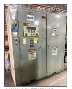
AJAX MAGNETHERMIC PACER T INDUCTION

Monday, November 8, from 9:00 AM to 4:00 PM by Appointment Only