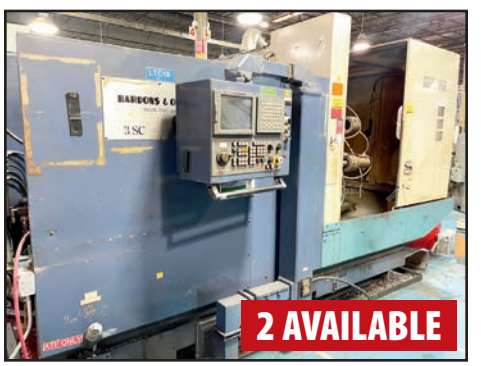
WARNER SWASEY 3SC CNC CHUCKER