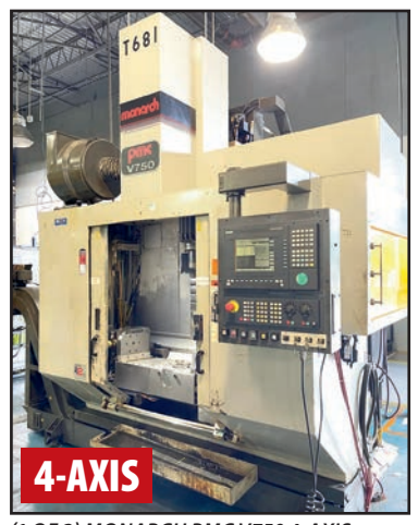
(1 OF 2) MONARCH PMC V750 4-AXIS VERTICAL MACHINING CENTERS