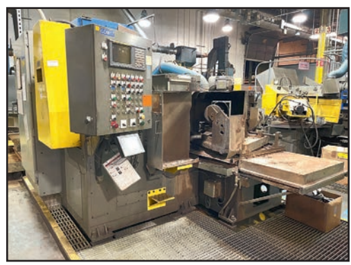
GARDNER SDG8-30 CNC SINGLE WHEEL DISC GRINDER