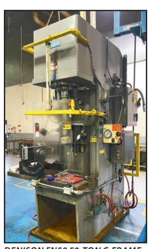
DENISON FN50 50-TON C-FRAME HYDRAULIC PRESS