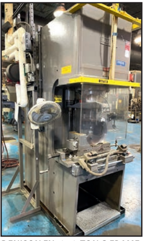
DENISON FN50 50-TON C-FRAME HYDRAULIC PRESS