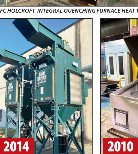
(2) CAMFILL FARR GOLD SERIES GS6 DUST COLLECTORS