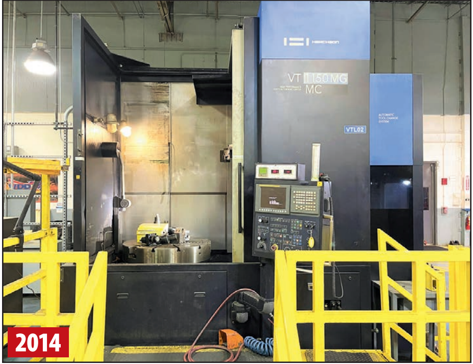
HWACHEON VT-1150 MC M/G VERTICAL TURNING CENTER