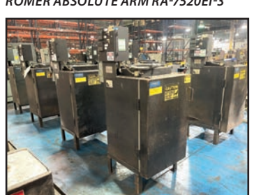
VIEW OF O-TRAN OVENS