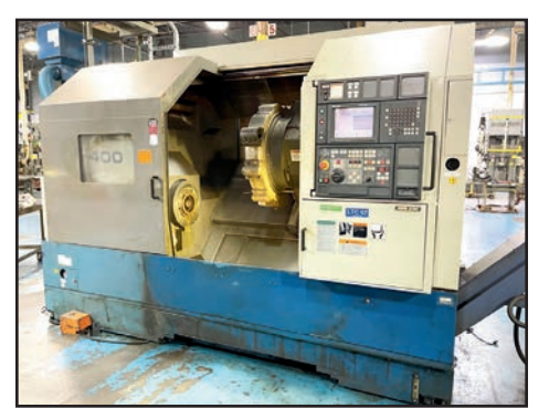
(1 OF 2) MORI SEIKI SL400B CNC TURNING CENTERS

2014 HWACHEON VT-1150 MC M/G VERTICAL TURNING CENTER, s/n M096362H3GB, w/ FANUC 0iTD Control, 39.25" 3-Jaw Chuck, 45.270" Max. Turning Dia., 37.4" Max. Turning Length, 16 ATC, 630 RPM, Mist Collector, Chip Conveyor