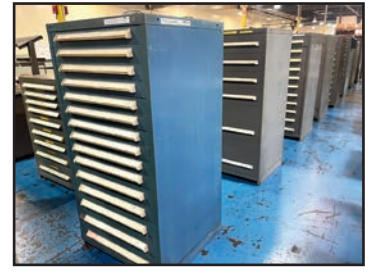
VIEW OF MODULAR TOOL CABINETS