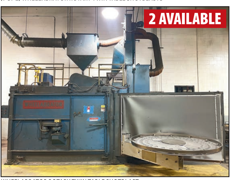
WHEELABRATOR ROTARY TWIN TABLE SHOTBLAST