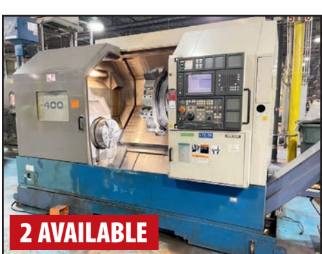
MORI SEIKI SL400B CNC TURNING CENTER