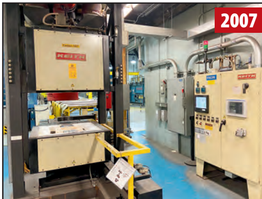
KEITH KIPR 1424142200 ELECTRIC FURNACE SYSTEM

2012 CLAUSING CSG-2A618 SURFACE GRINDER, s/n E1TAB0083, 6" x 18" Table, Wired Magnetic Chuck, Variable Speed, Downfeed, Coolant, Dust Collector