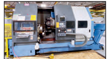
2000 MAZAK ST50N CNC LATHE