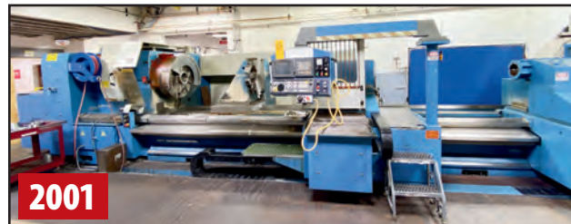
2001 GURUTZPE B1400/3 5000 CNC LATHE