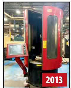
2013 RITEWAY CNC VERTICAL GRINDER