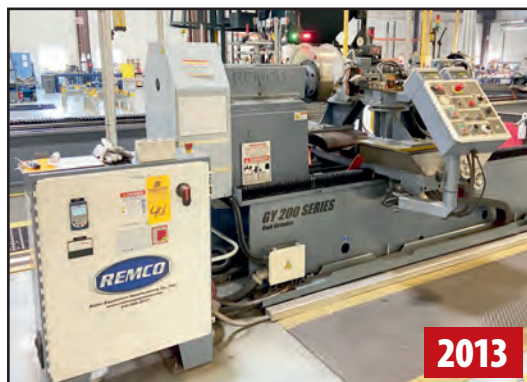
2013 REMCO GY200 RUBBER ROLL GRINDER/LATHE