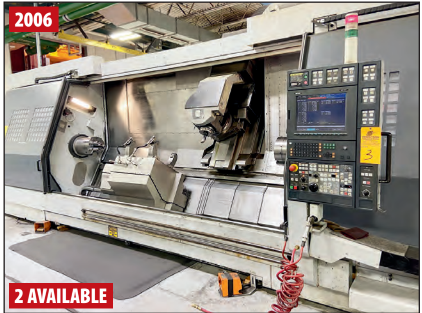
MORI SEIKI MT3500S/3500 CNC TURNING CENTER

Pre-Auction Offers Invited on Major Assets