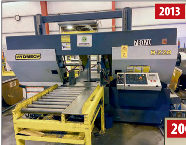
HYDMECH H-22A HORIZONTAL BANDSAW

FEATURING: Turning Centers, Breakout Machine, Grinders, Horizontal Bandsaw, Press Brake, Miscellaneous Machine Tools, Induction Scanner System, Heat Treat, Finishing, Welding, Plant Support & More