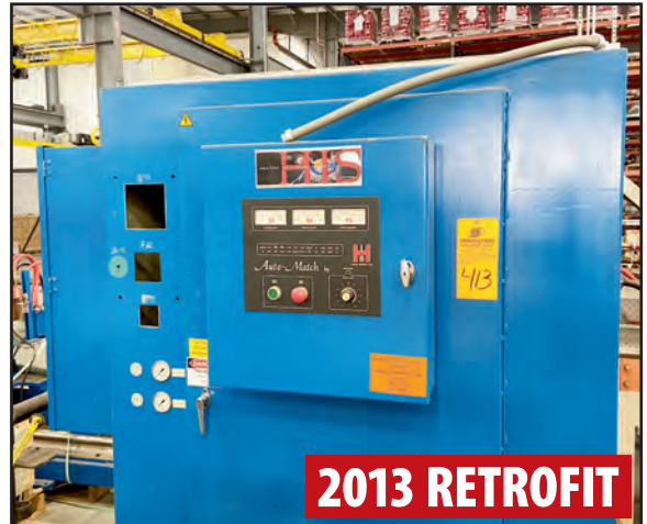
HIS HEATING INDUCTION SERVICES 100 KW INDUCTION SCANNER SYSTEM

1996 BRIDGEPORT SERIES 1 EZ TRAK II VERTICAL MILL, s/n 7424, Equipped w/4 HP, EZ Trak Control, Power Feeds