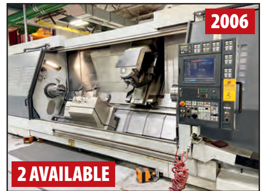
2 AVAILABLE MORI SEIKI MT3500S/3500 CNC TURNING CENTER

1997 MORI SEIKI ZL-45 CNC LATHE , s/n 167, 19" 3-Jaw Chuck, 60" Center Distance, MSD-516 CNC Control, (2) Turret w/12-Position and 10-Position, 50 HP, 3.6" Hole