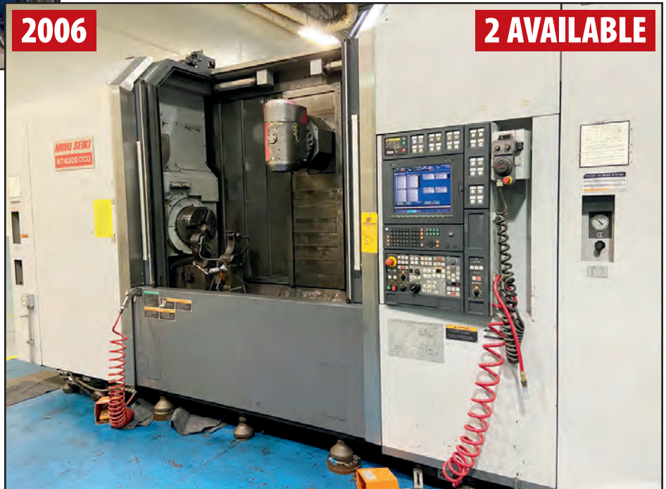
MORI SEIKI NT4300 DCG CNC TURNING CENTER

Sale Closing Date: Wednesday, September 2 at 12:00 PM CT