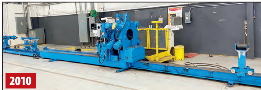
2010 NOV TORQUEMASTER BREAKOUT MACHINE