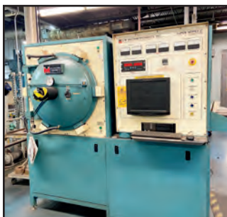
TM VACUUM FURNACE SYSTEM