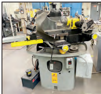
WARD #6 TOOL AND CUTTER GRINDER