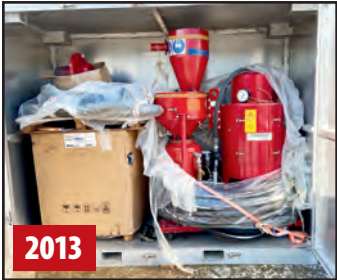
2013 WHEELABRATOR PBA08-2 PORTABLE SHOTBLASTER SYSTEM