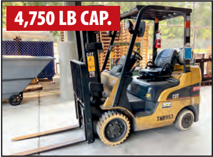
CATERPILLAR C5000 FORKLIFT