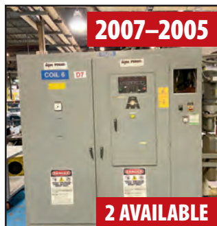
2 AVAILABLE AJAX TOCCO 250 KW POWER SUPPLY