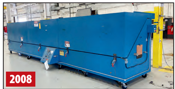
TPS THERMAL PRODUCT SOLUTIONS TLL45H234.0 OVEN

HIS HEATING INDUCTION SERVICES 100 KW INDUCTION SCANNING SYSTEM, s/n B6557, 8"-18" Rings, 20' Pipe Rack w/Trolley, Allen Bradley PLC, Retrofitted and Recontrolled in 2013 and Not Installed