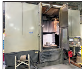
52" BULLARD VERTICAL GRINDER