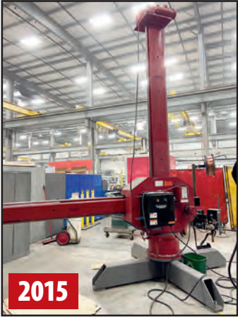
2015 PRESTON EASTIN MA99HD MANIPULATOR