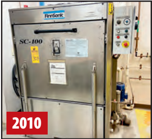
2010 FINNSONIC SC-100 ULTRASONIC CLEANER