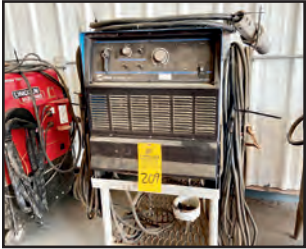
OVER (30) WELDING POWER SOURCES

2013 WHEELABRATOR PBA08-2 PORTABLE SHOTBLAST SYSTEM, s/n 001185-6, w/Reclaim, Portable Aluminum Shipping Container