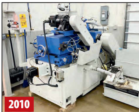
2010 SUPERTEC STC2008NC CENTERLESS GRINDER