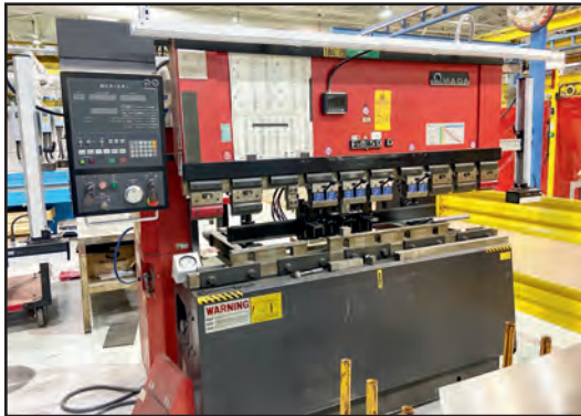
AMADA FAB 50D HYDRAULIC PRESS BRAKE