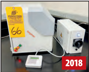
BOGIMAC IFGM FRIATESTER