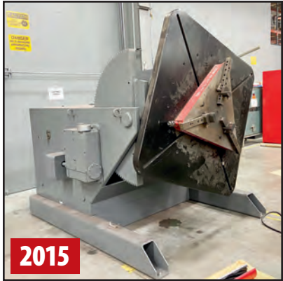
2015 PRESTON EASTIN PA 240 HD WELDING-POSITIONER