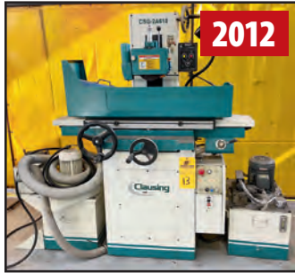
CLAUSING CSG-2A618 SURFACE GRINDER