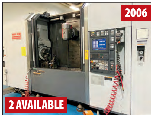
2 AVAILABLE MORI SEIKI NT4300 DCG CNC TURNING CENTER

2005 MORI SEIKI MT2500S/1500 CNC LATHE , s/n MT251EL0126, (2) 10" 3-Jaw Chucks, 60" Centers, Omni Rest, MSX-501 CNC Control, Chip/Coolant System, Cooljet Coolant System, 110 ATC