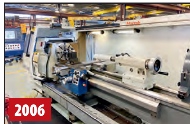
2006 WEILER E50 X 2000 CNC LATHE

All buyers must use rigging companies specified by Halliburton. A list of approved riggers per facility can be found on the Perfection Industrial Sales website and will be included w/all invoices.