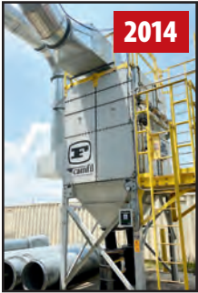
2014 CAMFIL FARR GSX8 DUST COLLECTOR

ALSO: (30+) MILLER AND LINCOLN WELDING POWER SOURCES, TORIT DOWNDRAFT TABLES, WELDING SCREENS