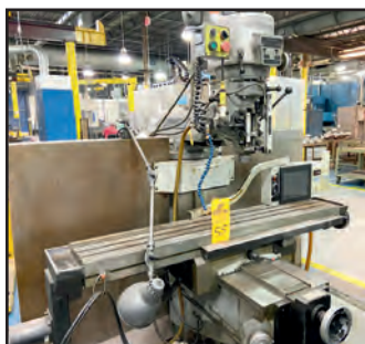
BRIDGEPORT SERIES 1 EZ TRAK II VERTICAL MILL