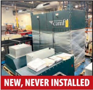
NEW, NEVER INSTALLED