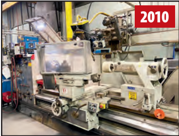
2010 EISEN PA4506020 LATHE AND SEAM WELDER