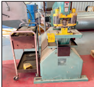
PIRANHA P90 IRONWORKER