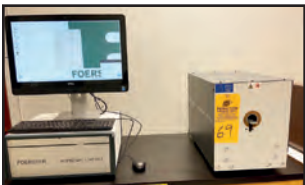
FOERSTER KOERZIMAT 1.097 HCJ MAGNETOMETER