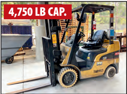
CATERPILLAR C5000 FORKLIFT