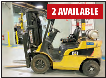
CATERPILLAR P5000 FORKLIFT