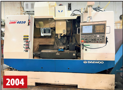
DAEWOO DMV4020 VERTICAL MACHINING CENTER