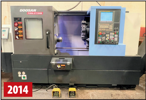
DOOSAN PUMA GT2100B TURNING CENTER

2000 DAEWOO PUMA 300 MB GL TURNING CENTER , s/n P30M0141, FANUC 18i-T Control, 10" 3-Jaw Chuck, 12-Position Turret, Tailstock, Gantry Loader, 14-Pallet Pool, 23.2" Swing, 25" Between Centers, 15.7" Max. Turning Dia., Turbo System Chip Conveyor, COOL JET High Pressure Coolant System