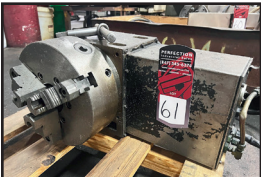
HAAS 10" 4TH AXIS TABLE

INSPECTION Wednesday, September 7, by Appointment Only