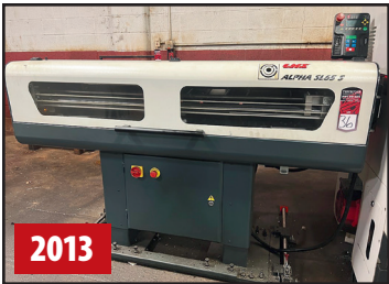
LNS ALPHA SL65S BAR FEED