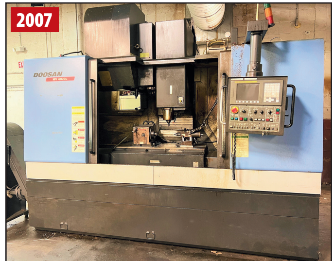
DOOSAN MV4020L VERTICAL MACHINING CENTER

Wednesday, September 7, by Appointment Only