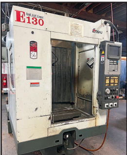
ENSHU E130 DRILL AND TAP CENTER