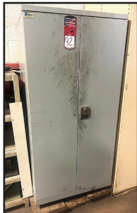
LISTA CAT 50 STORAGE CABINET

ALSO: SURFACE PLATES, BENCH CENTERS, MICROSCOPES, ROCKWELL HARDNESS TESTER, HEIGHT GAGES, CAT 50 TOOLING, CAT 40 TOOLING, BT 30 TOOLING, COLLETS, PERISHABLE TOOLING, MACHINE VISES, STORAGE TRAILER, AND MORE