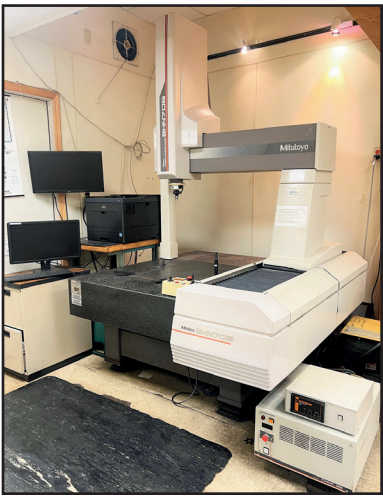
MITUTOYO BHN706 CMM