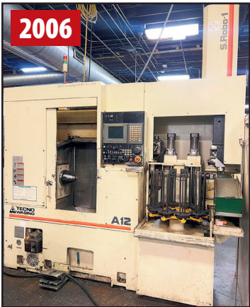
TECNO WASINO A12 TURNING CENTER

NAKAMURA TOME SC-300L TURNING CENTER , s/n NA, FANUC 21-T Control, 12-Position Turret, Collet Chuck, Tailstock, 13.78" Turning Dia., 47.776" Machining Length, Turbo Chip Conveyor