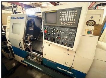
DOOSAN PUMA 200MSA TURNING CENTER