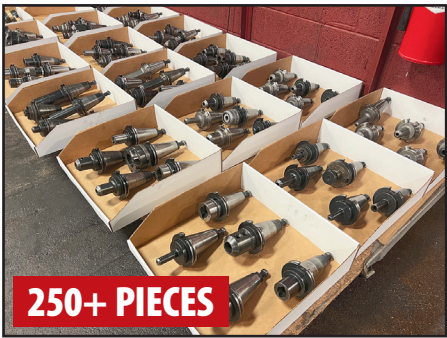
CAT 50/CAT 40 TOOL HOLDERS

SALE CLOSING FROM Thursday, September 8, from 10:00 AM CT