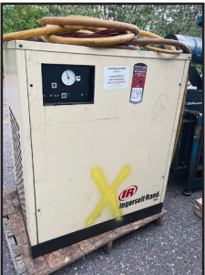
INGERSOLL RAND TMS 0280 AIR DRYER