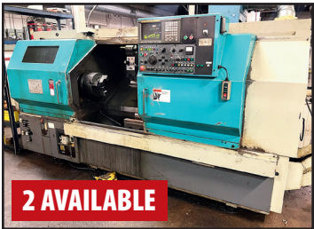
TAKISAWA TC-4 TURNING CENTER