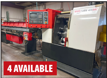
EMCO TURN 425MC TURNING CENTER