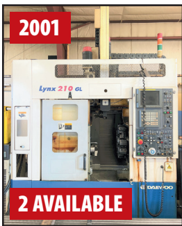
DAEWOO LYNX 210GL TURNING CENTER

Pre-Auction Offers Invited on Major Assets