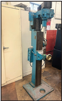
TECHNICA ZSM 150 CENTER HOLE GRINDER