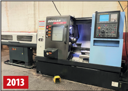
DOOSAN LYNX 220L TURNING CENTER