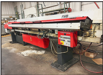
FMB DOPPEL TURBO 3800 BAR FEED