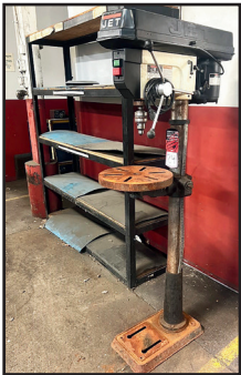
ASSORTED DRILL PRESSES