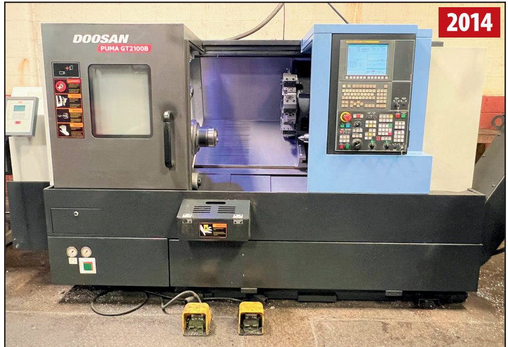
DOOSAN PUMA GT2100B TURNING CENTER

FEATURING: 2014 DOOSAN Puma GT2100B Turning Center, 2013 DOOSAN Lynx 220LC Turning Center, NAKAMURA-TOME SC-300L Slant Bed Lathe, DOOSAN, DAEWOO, TECNO WASINO, KIA & TAKISAWA Turning Centers, 2007 DOOSAN MV-4020 VMC, DAEWOO DMV-4020 VMC, ENSHU & MATSUURA VMC's, LNS Bar Feeds, ROTO-FLO Spline Roller, Machine Tooling, Conventional Machine Tools, Tool Room Equipment, Plant Support Equipment & More