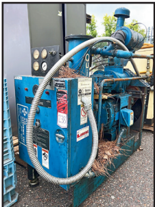
QUINCY 25 HP AIR COMPRESSOR