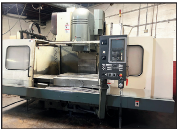
ENSHU EV650 VERTICAL MACHINING CENTER