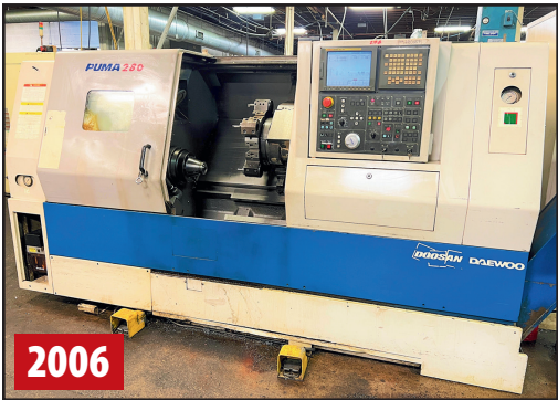
DOOSAN DAEWOO PUMA 280 TURNING CENTER