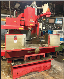
MATSUURA MC-500V VERTICAL MACHINING CENTER