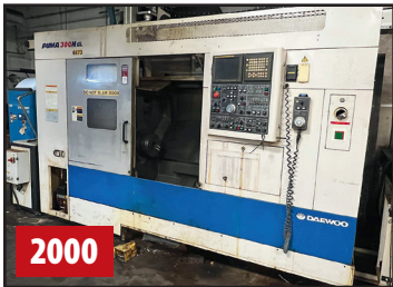
DAEWOO PUMA 300 MB GL TURNING CENTER