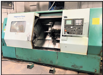
NAKAMURA TOME SC-300L TURNING CENTER