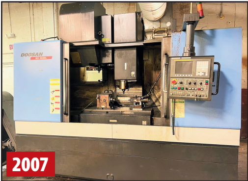
DOOSAN MV4020L VERTICAL MACHINING CENTER