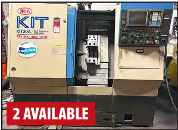
KIA KIT30A TURNING CENTER