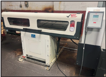
LNS QUICK LOAD SERVO 80 S2 BAR FEED