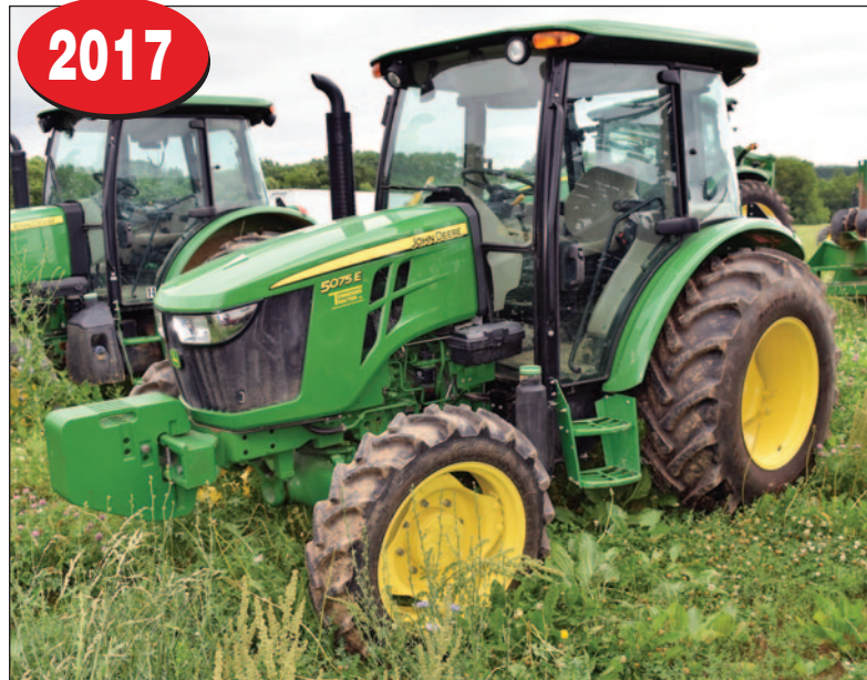
JOHN DEERE 5075E TRACTOR