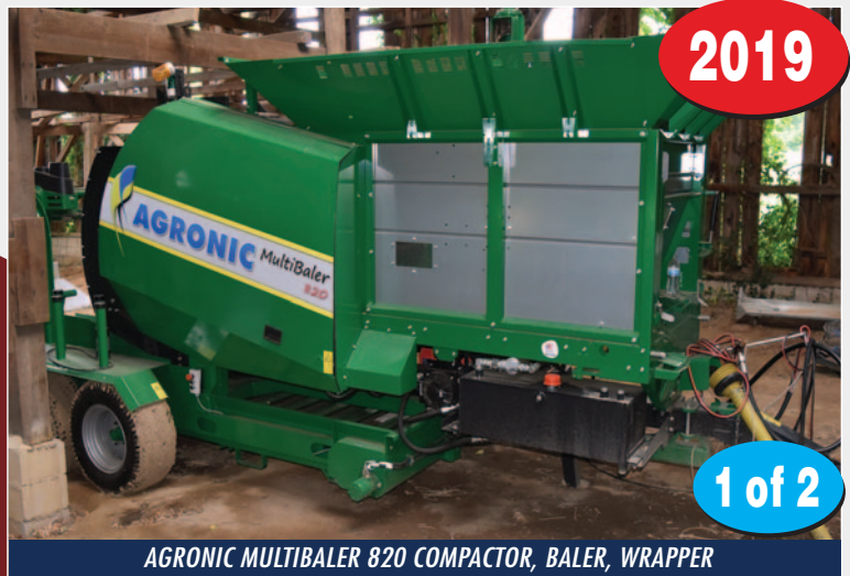
AGRONIC MULTIBALER 820 COMPACTOR, BALER, WRAPPER