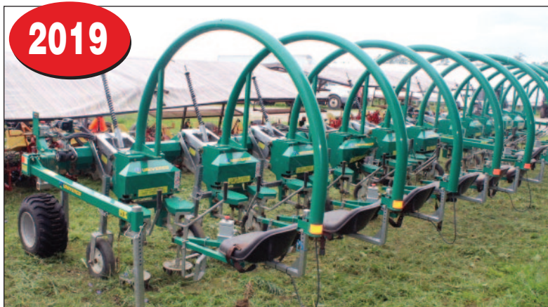
UNIVERCO ECO SARLM92640260 6-ROW WEEDER