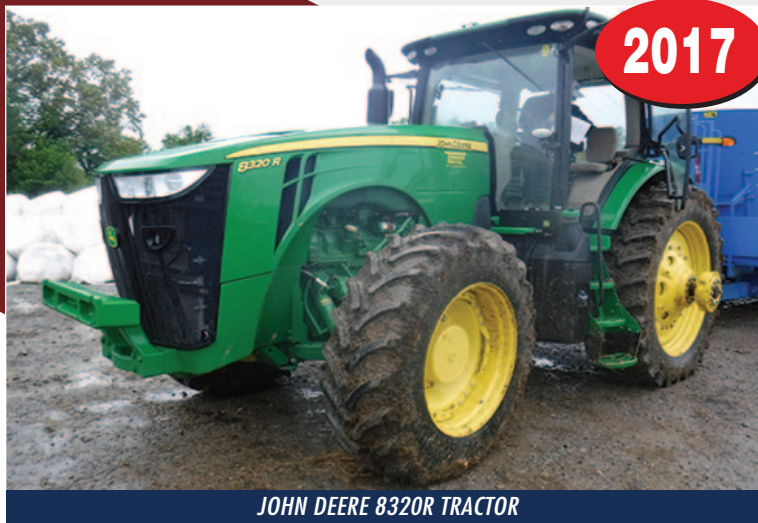
JOHN DEERE 8320R TRACTOR

LOCATION: 267 North Cleveland Road, Lexington, KY 40509