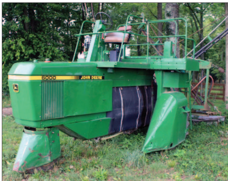
JOHN DEERE 60FT. 6000 HIGH CYCLE SPRAYER