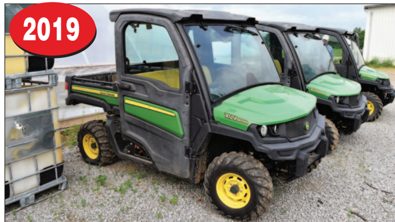
LINE VIEW OF JOHN DEERE UTILITY VEHICLES