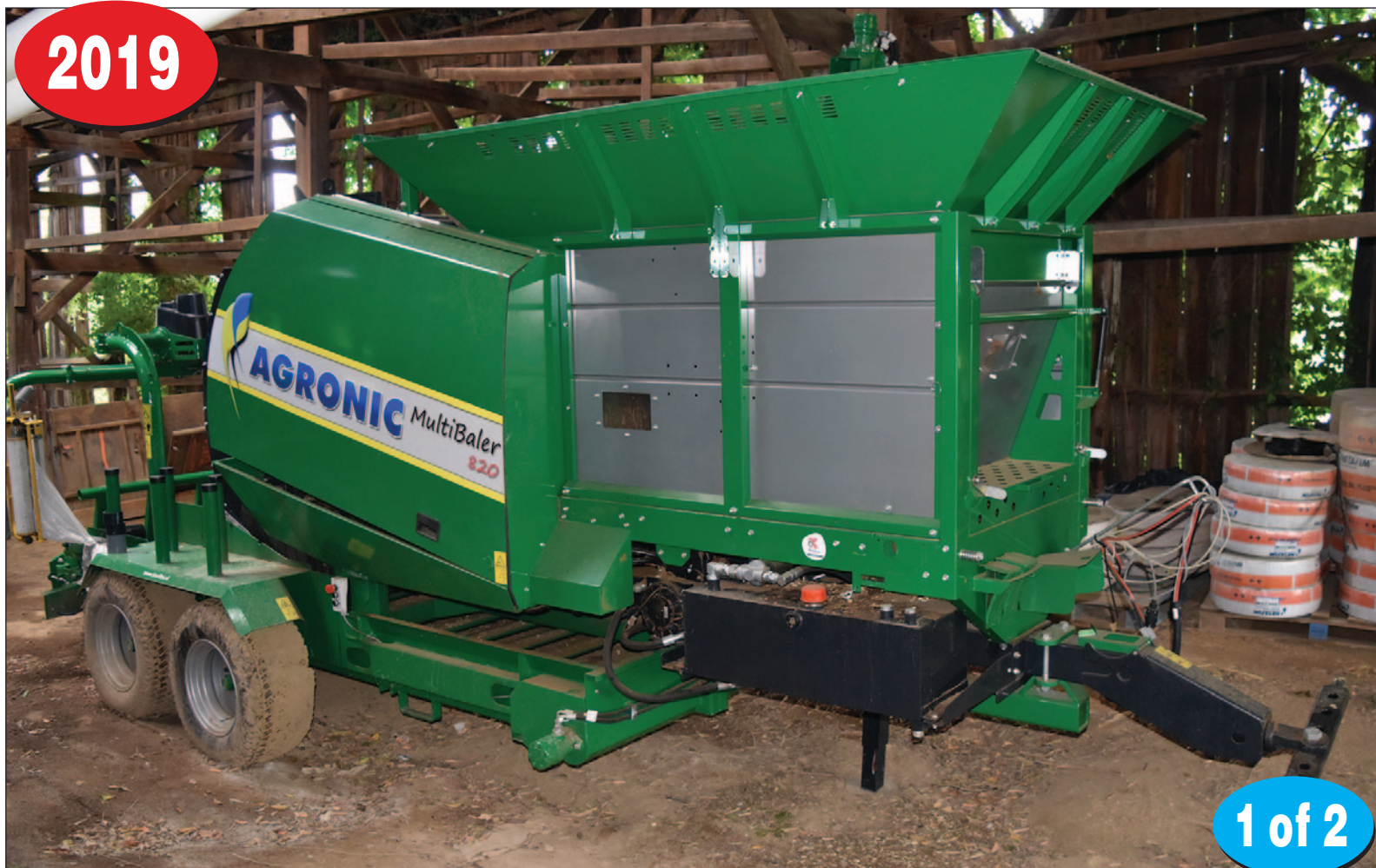
AGRONIC MULTIBALER 820 COMPACTOR, BALER, WRAPPER