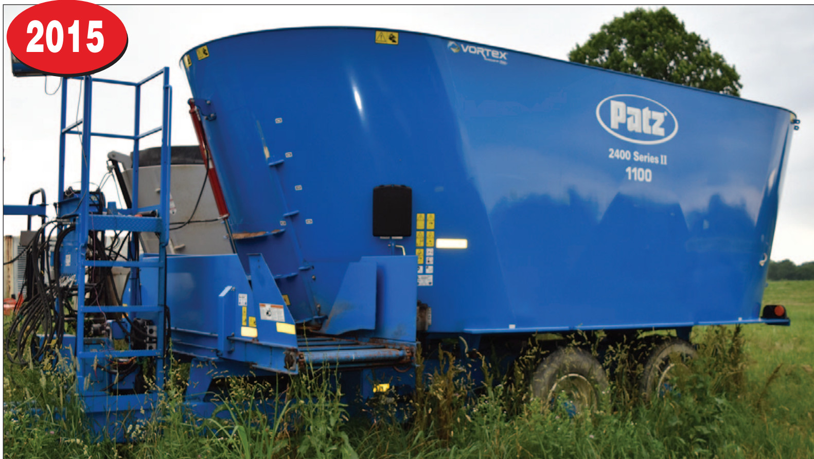
PATZ VORTEX 2400 SERIES II VERTICAL COMPOST MIXER