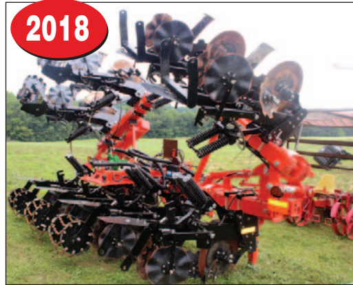
KUHN KRAUSE LADIATOR 8-ROW STRIP TILLAGE SYSTEM