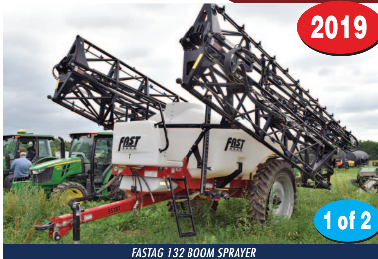
FASTAG 132 BOOM SPRAYER