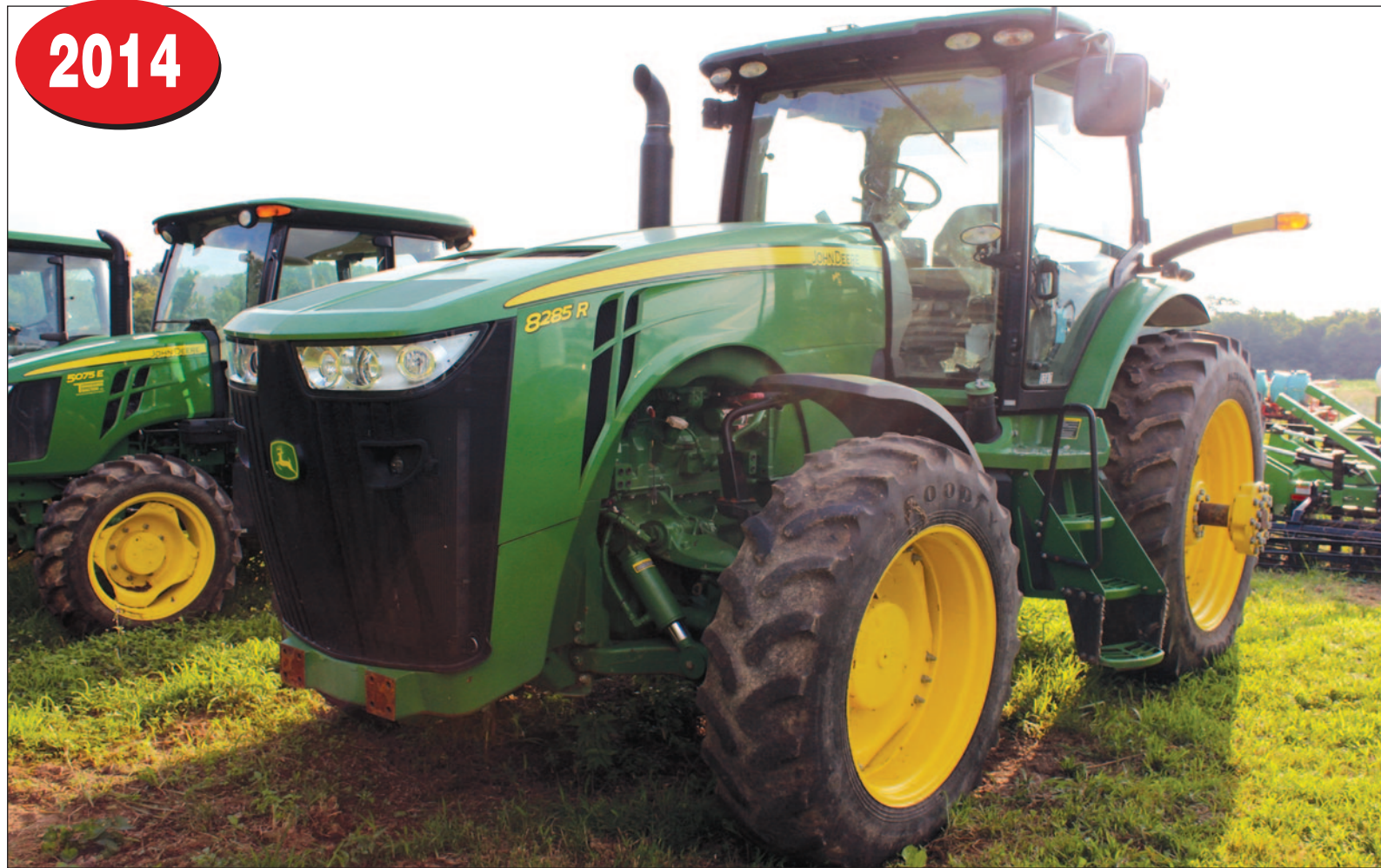
JOHN DEERE 8285R TRACTOR