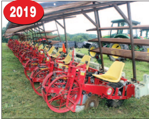
MECHANICAL 8-ROW TRANSPLANTER