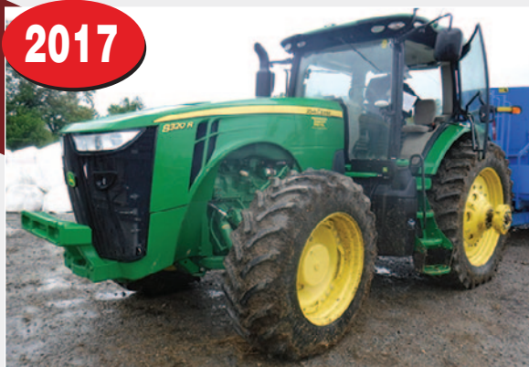
JOHN DEERE 8320R TRACTOR