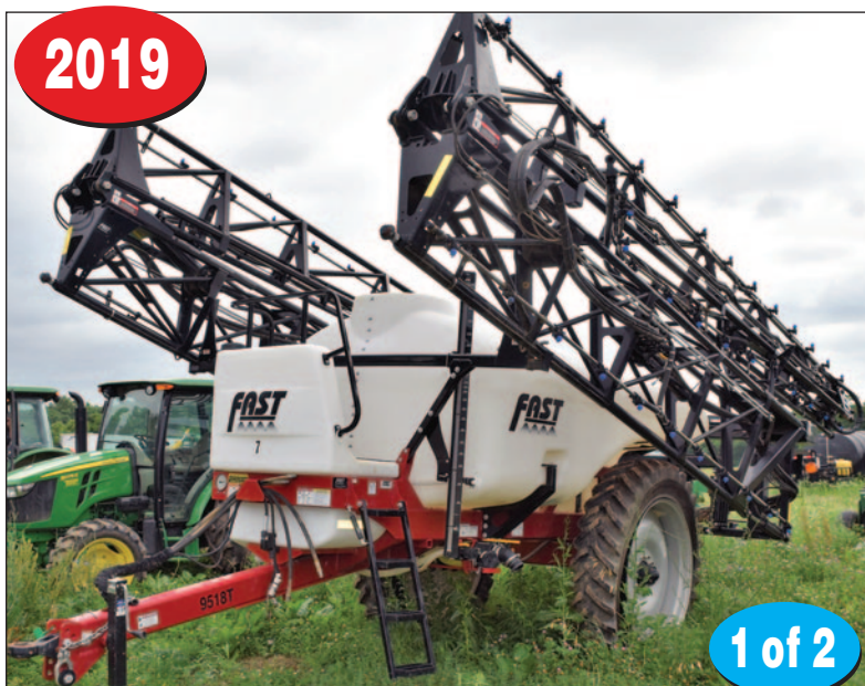
FASTAG 132 BOOM SPRAYER