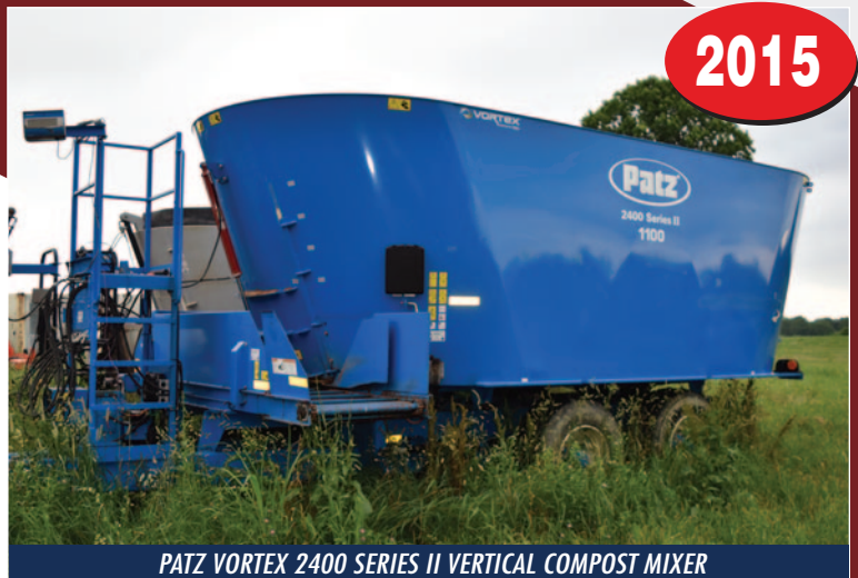
PATZ VORTEX 2400 SERIES II VERTICAL COMPOST MIXER

QUESTIONS: Contact Jake Josko at (847) 499-7030 or jjosko@hyperams.com