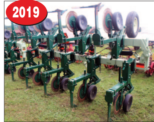
KMC 4-ROW BIG SWEEP CULTIVATOR