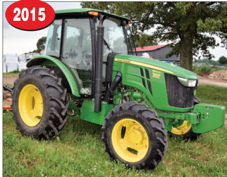
JOHN DEERE 5100E TRACTOR