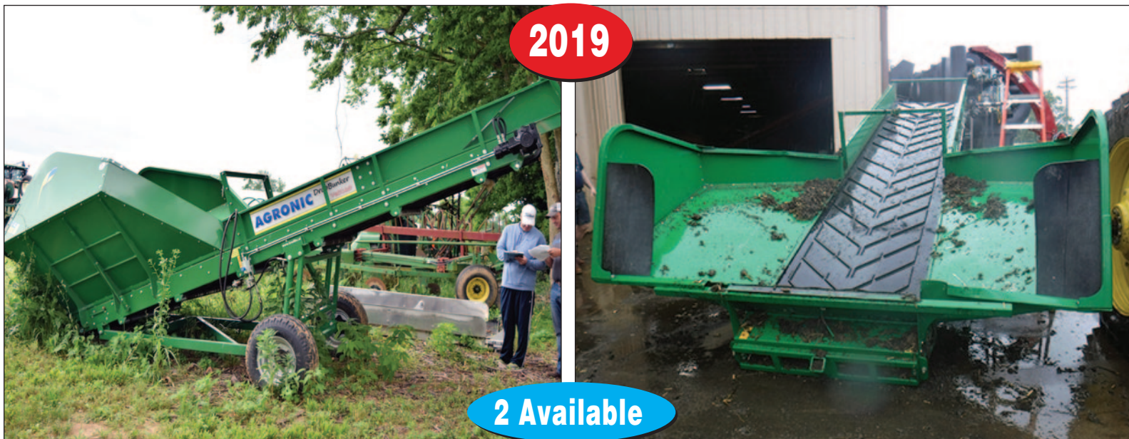
AGRONIC DROPBUNKER V60120 CONVEYOR SYSTEMS