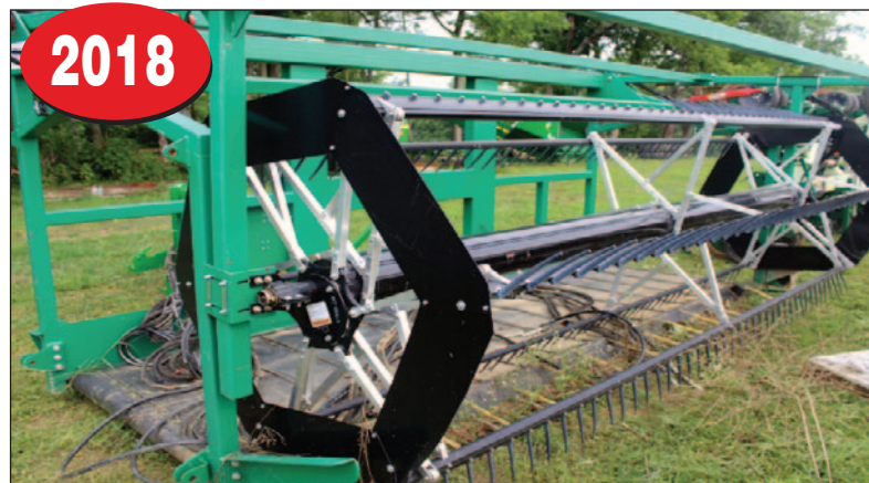
POWER ZONE POWERFEEDER HYD. DRAPER STYLE SICKLE BAR CBD HARVESTING