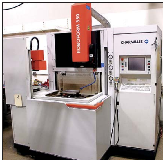
CHARMILLES ROBOFORM 350 CNC SINKER EDM