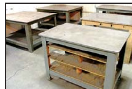
BRUTE BASE WORK TABLES