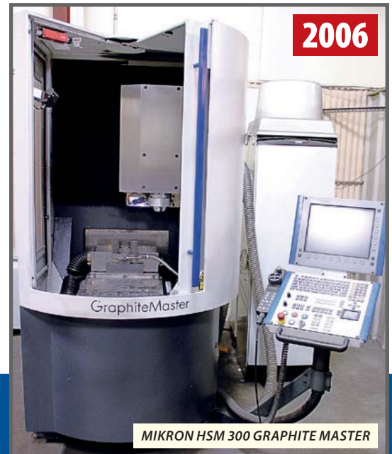
MIKRON HSM 300 GRAPHITE MASTER

CNC MACHINE TOOLS, HIGH-SPEED GRAPHITE MILL, (9) EDM'S, (10) SURFACE GRINDERS, TOOL ROOM, INSPECTION, MATERIAL HANDLING & PLANT SUPPORT