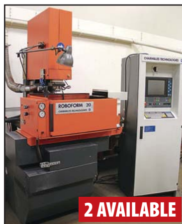
CHARMILLES ROBOFORM 20 CNC SINKER EDM