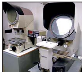
VIEW OF COMPARATORS