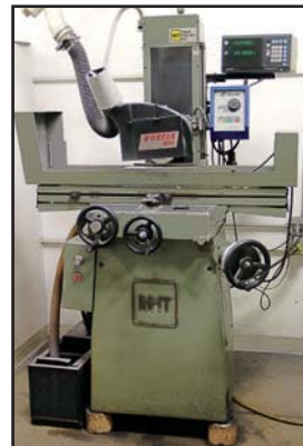
MITSUI MSG-200 MH PRECISION SURFACE GRINDER