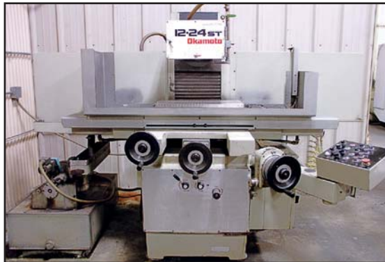
OKAMOTO ACC-12.24ST PRECISION SURFACE GRINDER