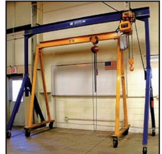
VIEW OF ROLLING GANTRIES

MITUTOYO TOOLMAKERS MICROSCOPE, S/N 90069