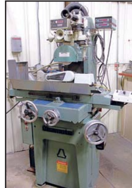
OKAMOTO PFG-612 PRECISION SURFACE GRINDER