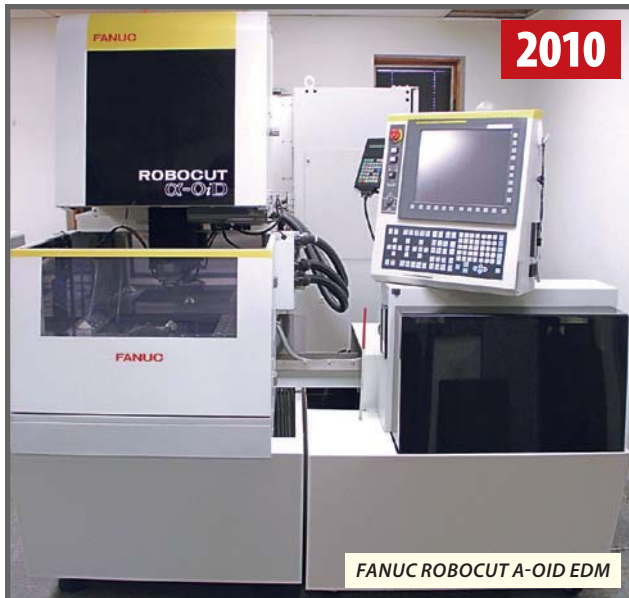
FANUC ROBOCUT A-OID EDM

CNC MACHINE TOOLS, HIGH-SPEED GRAPHITE MILL, (9) EDM'S, (10) SURFACE GRINDERS, TOOL ROOM, INSPECTION, MATERIAL HANDLING & PLANT SUPPORT