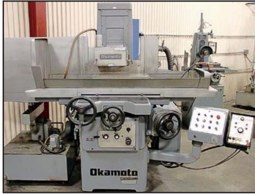
OKAMOTO 820AA SURFACE GRINDER