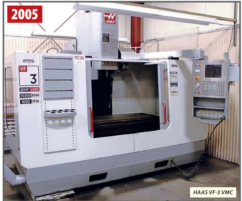
HAAS VF-3 VMC