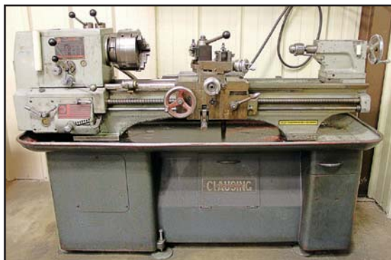
CLAUSING COLCHESTER TOOL ROOM LATHE

HARIG SUPER 612 PRECISION SURFACE GRINDER, S/N 7558, 12" x 6" Chuck