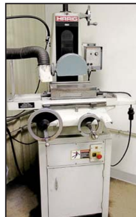
HARIG 612 PRECISION SURFACE GRINDERS