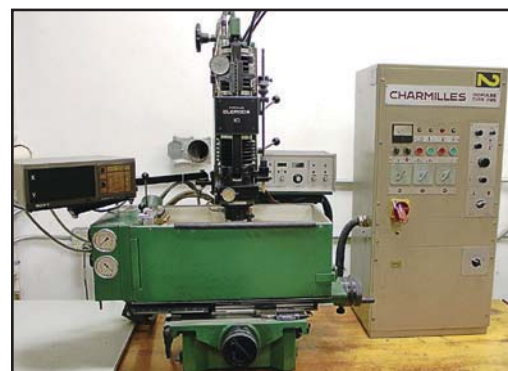
CHARMILLES ELERODA 10 SINKER EDM

Sale Date: Thursday, March 26, 2015 at 10:00 AM CT Location: 1030 Lutter Drive, Crystal Lake, IL 60014 Inspection: Wednesday, March 25 from 9:00 AM to 4:00 PM CT