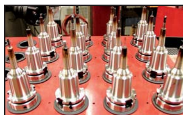
LARGE QTY. OF VMC TOOLING