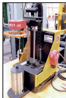
MST 1200S TOOLING HEATER