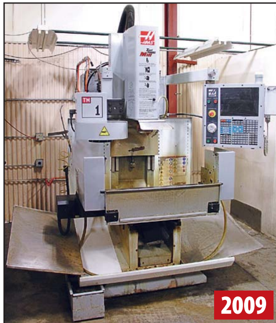
HAAS TM-1 CNC TOOL ROOM MILL