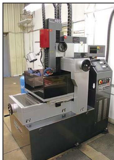
METHODS HM400 HOLE MASTER DRILLING EDM

MIKRON HSM300 CNC GRAPHITE MASTER HIGH-SPEED MILLING MACHINE , S/N 107.07.0.033, (2006), w/ITNC530 Heidenhain CNC Control