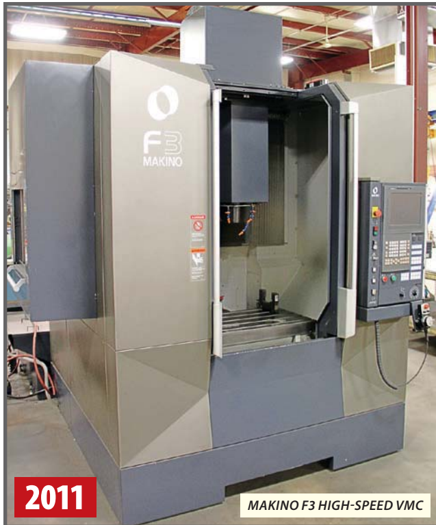
MAKINO F3 HIGH-SPEED VMC