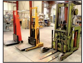
VIEW OF ROLLING STOCK