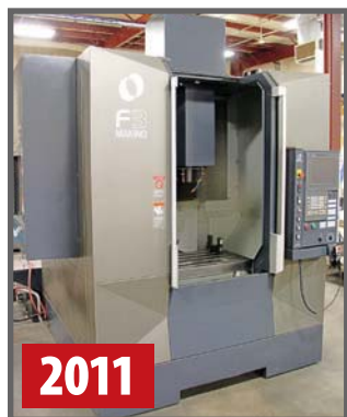
MAKINO F3 HIGH-SPEED VMC