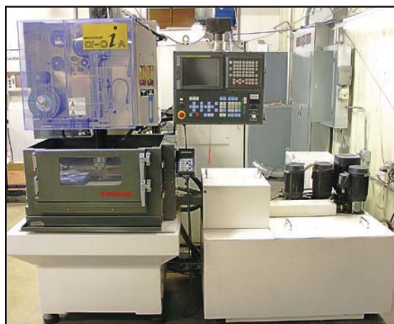
FANUC ROBODUT A-OIA EDM