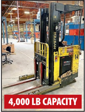
4,000 LB CAPACITY