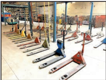
VIEW OF PALLET JACKS