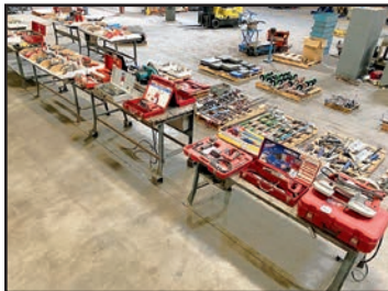
SELECTION OF POWER, PNEUMATIC AND HAND TOOLS