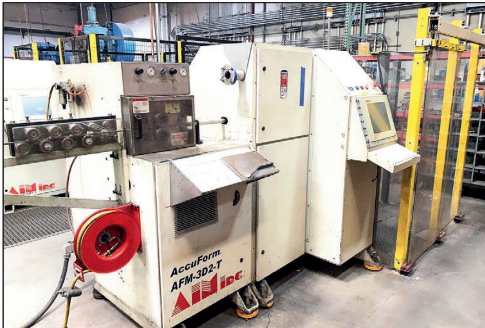
AIM ACCUFORM AFM-3D2-T CNC WIRE BENDER