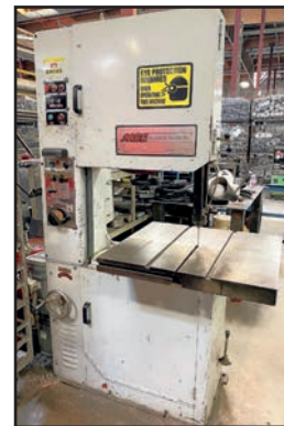
MSC 0951-1654 VERTICAL BANDSAW