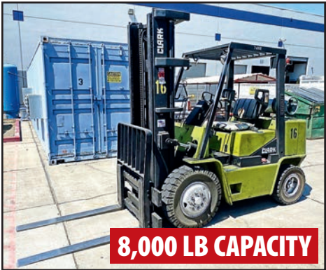
8,000 LB CAPACITY