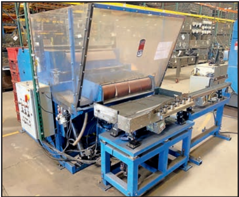
VIBRATORY CHUTE FEEDER SYSTEM