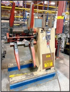
CWP 5000-18M UNCOILER

ALSO AVAILABLE: CWP FEEDER/STRAIGHTENERS AND ASSORTED UNCOILERS