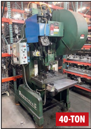
ROUSSELLE NO. 4 OBI PRESS