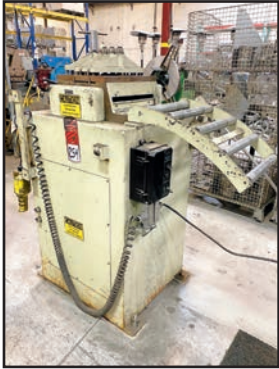
CWP 12A FEEDER/STRAIGHTENER