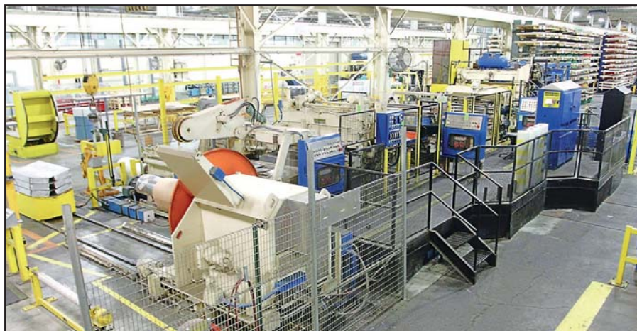
SESCO CUT-TO-LENGTH LINE