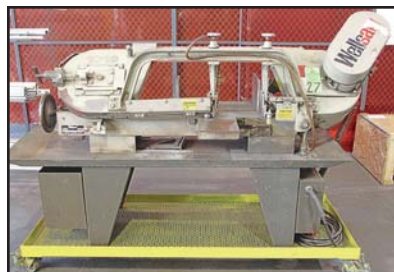
WELLSAW 1016 HORIZONTAL BANDSAW