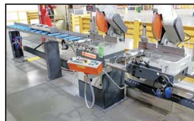
ELUMATEC DG 79/32 DUAL MITER SAW LINE