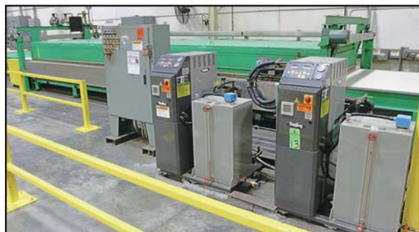
STERLCO 25' X 78" THERMAL PRESS