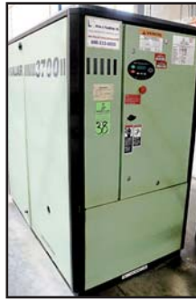
50 HP SULLAIR 3709/A SCREW TYPE AIR COMPRESSOR