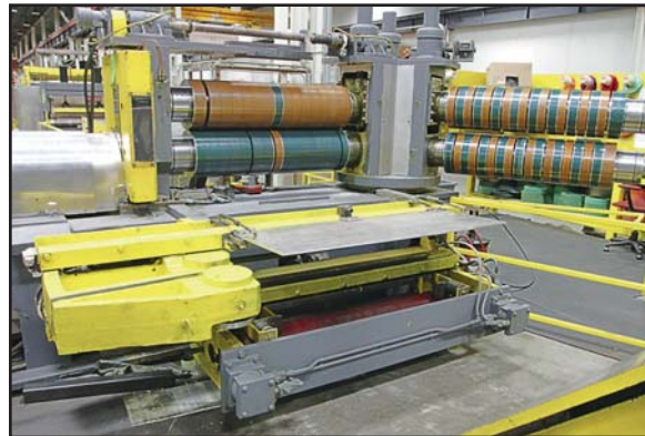
BRANER TRIPLE HEAD TURRET SLITTER