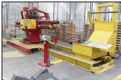
SAMCO D150BTJ48 2695N37 DUAL UNCOILER AND COIL CAR

(2) 20,000 LB GARY 136610 COIL TIPPERS, s/n 51506 and 082007