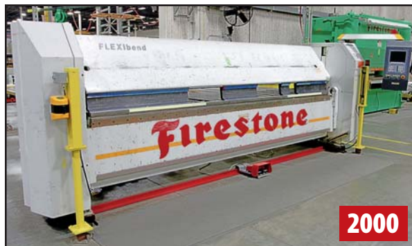
RAS FLEXIBEND 73.40 CNC FOLDER

ROPER WHITNEY AB1014 AUTOBRAKE 2000 FOLDER , s/n 123-12-91, 14 Ga x 10' Capacity, Roper Whitney Alltronic Control