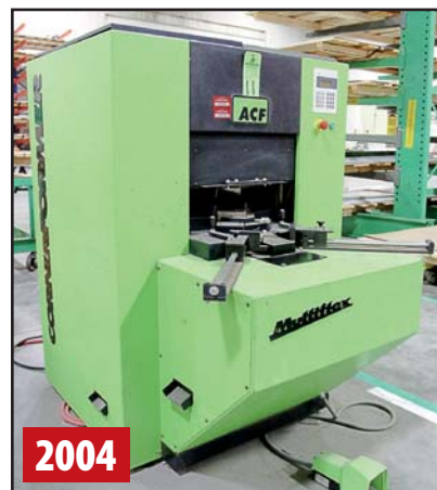
ACF MULTIFLEX CORNER FORMING MACHINE