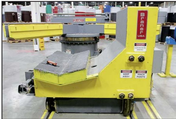
30,000-LB. BRANER COIL CAR