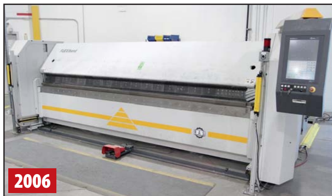
RAS FLEXIBEND 73.40 CNC FOLDER