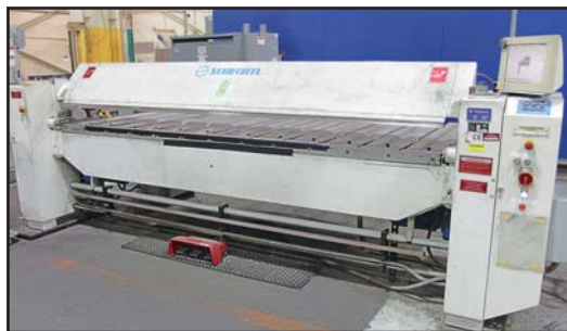
SCHECHTL MAB310 CNC FOLDER