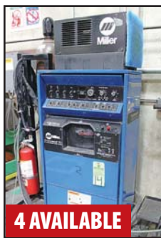
MILLER SYNCROWAVE 351 TIG WELDER