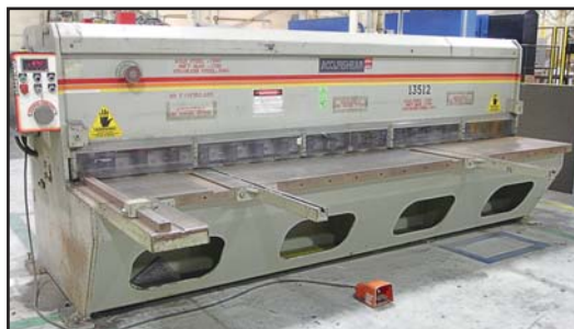
ACCURSHEAR 613512 POWER SQUARING SHEAR