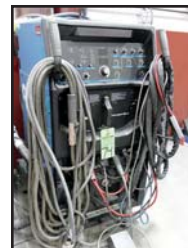
MILLER SYNCROWAVE 350LX TIG WELDER