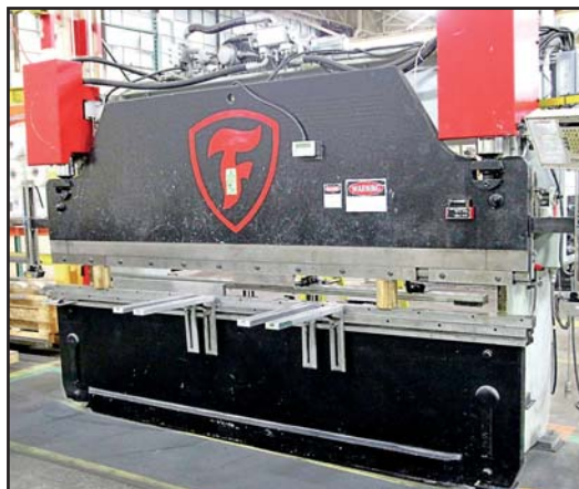
110-TON PACIFIC J110-12 HYDRAULIC PRESS BRAKE