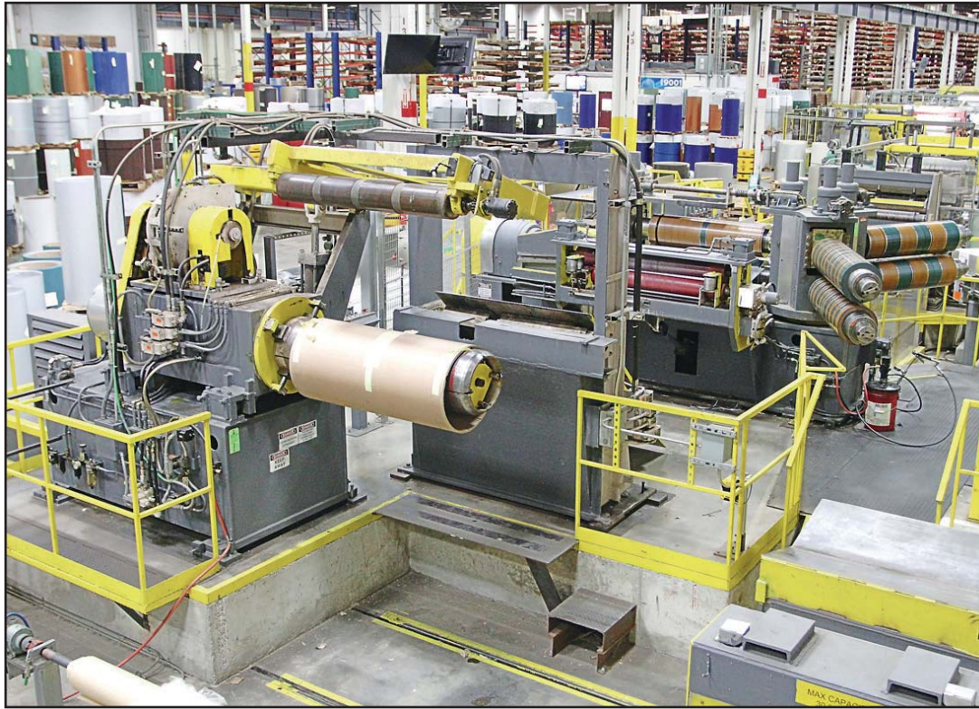
BRANER CUT-TO-LENGTH LINE