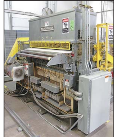
BRADBURY 17-ROLL LEVELER