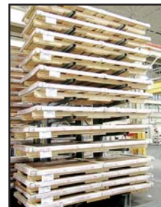
OVER (50) SECTIONS OF RACKING

Sale Closing From: Tuesday, April 12, 2016 at 11:00 AM