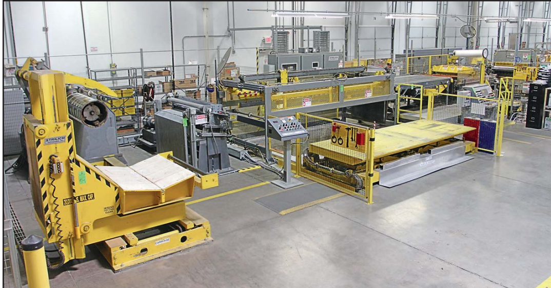
STRILICH/BRADBURY/SAMCO 48" X 18 GA. SLEAR LINE