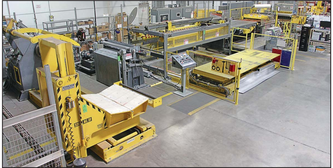
STRILICH/BRADBURY/SAMCO 48" X 18 GA. SLEAR LINE

Cut-to-Length & Slitting Lines, Punching & Shearing System, CNC Routers, CNC Folders, Press Brakes, Shears, Laminate Line, Large Assortment of Welding, Overhead Bridge Cranes & Full Complement of Plant Support