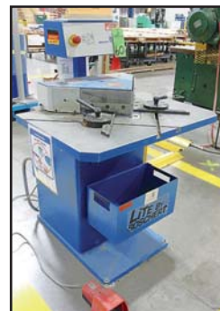
BOSCHERT LITE HYDRAULIC POWER NOTCHER