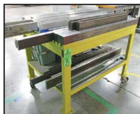
PRESS BRAKE TOOLING