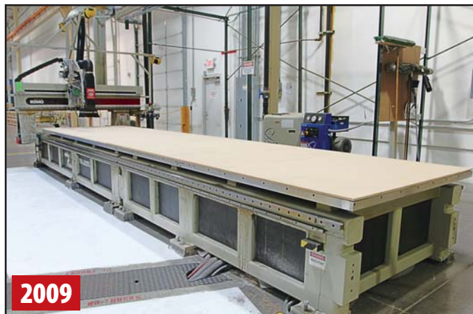
KOMO VR 522 CNC ROUTER