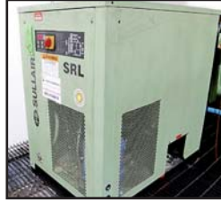
SULLAIR SRL-250 REFRIGERATED AIR DRYER