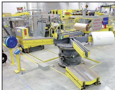
BRANER 4-ARM TURNSTILE