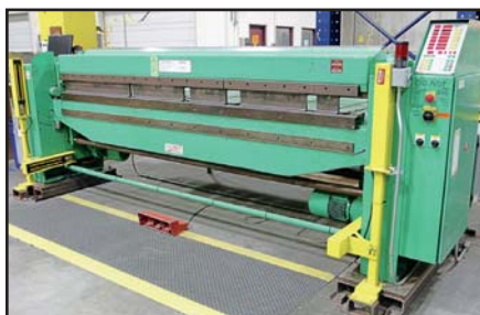
ROPER WHITNEY AB1014 AUTOBRAKE 2000 FOLDER