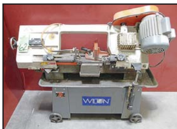
WILTON 3410 7" X 12" BANDSAW