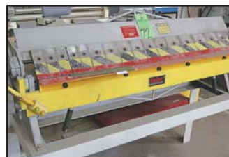
MHC 4876 48" SHEET METAL PAN AND BOX BRAKE