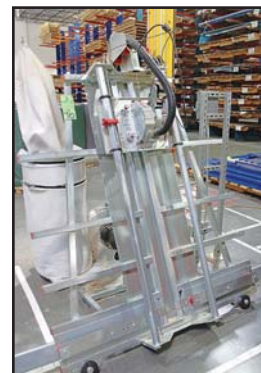
MILWAUKEE PANEL SAW

MILWAUKEE PANEL SAW W/MILWAUKEE 3 1/4 HP 6486-20 POWER UNIT