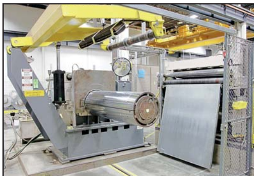
BRANER 30,000-LB. COIL REEL