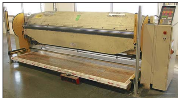
ROPER WHITNEY AB1016C AUTOBRAKE 2000 FOLDER