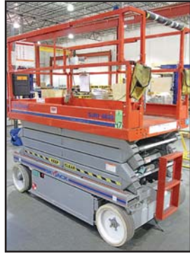
SKYJACK SJ4626 SCISSOR LIFT

SAF-T-CART PORTABLE TORCH CART W/HOSE AND GAGES