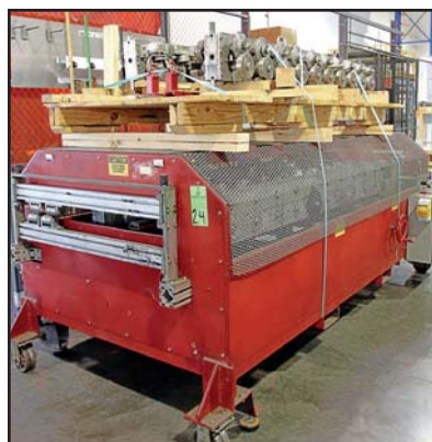
SCHLEIBACH QUADRO MILL

2007 METFORM CUT-TO-LENGTH LINE , Metform 40,000 Lb Coil Car, 72" Max. Coil Diameter, 20" Lift, Metform 40,000 Lb Uncoiler, 60" Max. Coil Width, 20" Min. ID, 72" Max. OD, .12-.024" Material Thickness Capacity, Metform Shear, 15-60" Material Width Capacity, .012-.024" Material Thickness, 4" Stroke, Bradbury (17) Roll Auto-Select Leveler, Metform Vinyl Applicator, 60" Max. Material Width, 225 FPM Line Speed, 300 Lb Max. Roll Capacity, Metform Side Guide, 60" Strip Width Capacity, 63.5" Max. Opening, Metform Pull Feeder, 8" Roll Diameter, Metform Shear, 15-60" Material Width Capacity, .012-.024" Material Thickness, 3" Stroke, 120CC and 60 Cut Per Minute, Metform Air and Mechanical Material Stacker