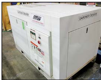
40 HP GARDNER DENVER ROTARY SCREW AIR COMPRESSOR