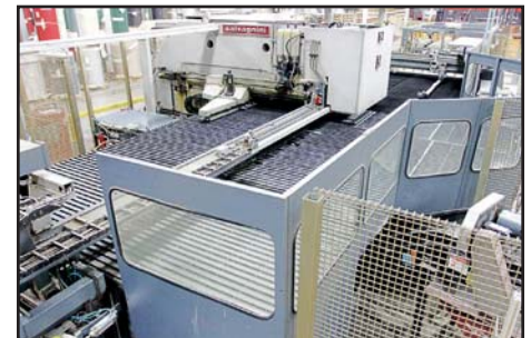
SALVAGNINI S4.40 PUNCHING AND SHEARING SYSTEM