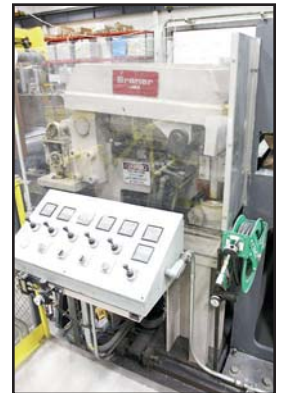
BRANER 54" LEVELER