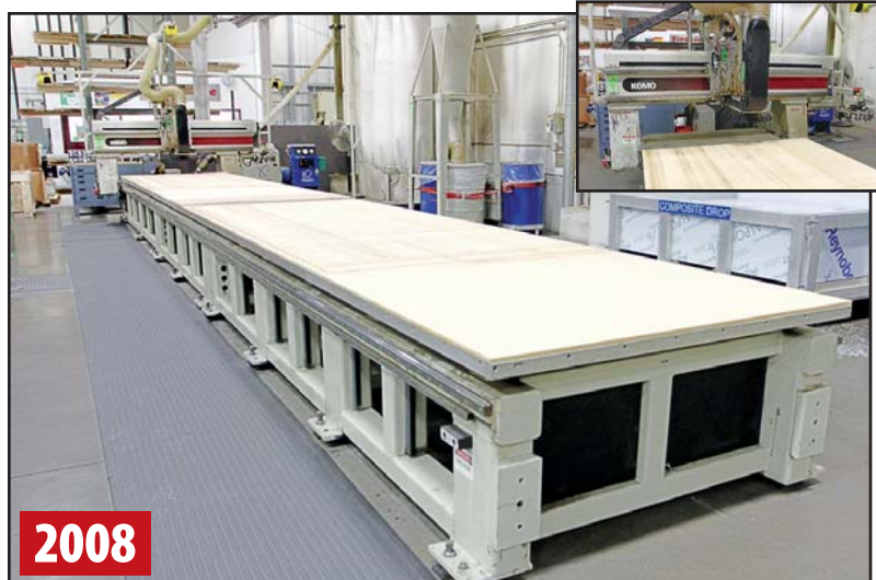
KOMO VR 536 CNC ROUTER