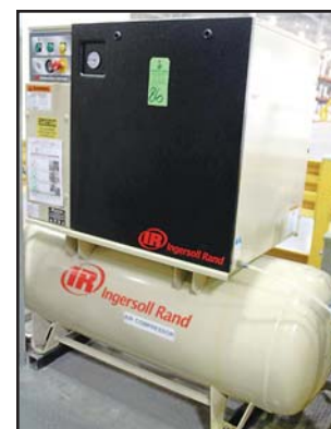
15 HP INGERSOLL RAND UP6-15C-125 ROTARY SCREW AIR COMPRESSOR

FLAMMABLE LIQUIDS CABINETS, SELF DUMPING HOPPERS, CANTILEVER AND PALLET RACKING, LARGE ASSORTMENT OF IRWIN QUICK CLAMPS, SHOP FANS, LADDERS, WORK BENCHES, PALLET JACKS, JIB CRANES, COIL HOOK, FORKLIFT BOOM ATTACHMENTS AND MORE