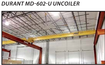
3-TON FLORIDA BRIDGE CRANE

OVERLAY LAMINATORS, NATIONAL PARTITIONS MEZZANINE, COMBINATION DISK/BELT SANDERS, AND MORE