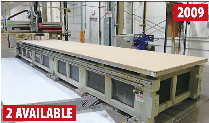
KOMO VR 522 CNC ROUTER