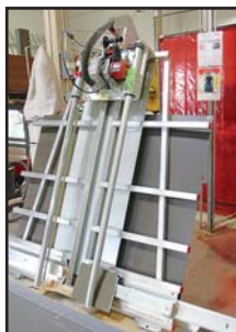
MILWAUKEE PANEL SAW