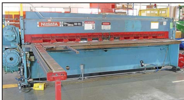
NIAGARA SABRELINE SS 12-1/4 POWER SQUARING SHEAR