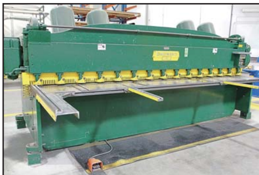
CINCINNATI 1414 POWER SQUARING SHEAR