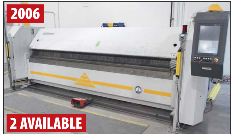
RAS FLEXIBEND 73.40 CNC FOLDER

Sale Closing From: Tuesday, April 12, 2016 at 11:00 AM