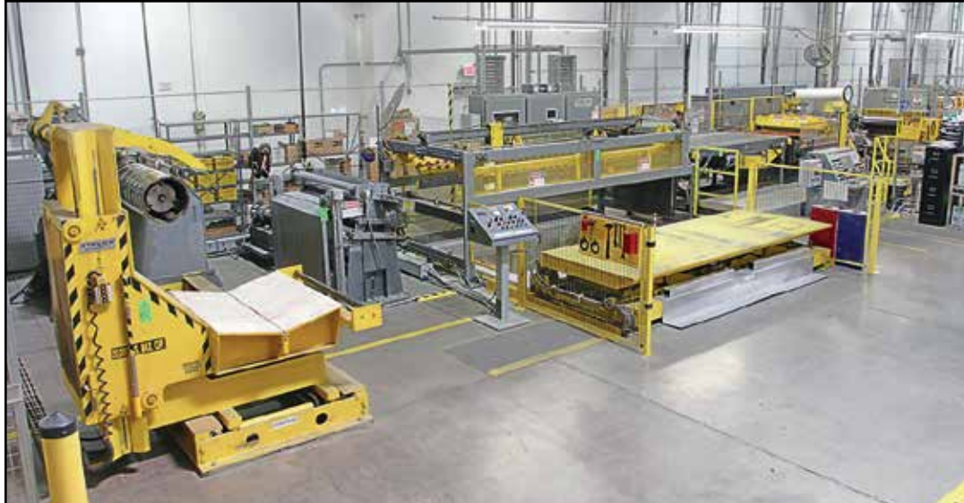
STRILICH/BRADBURY/SAMCO 48" X 18 GA. SLEAR LINE