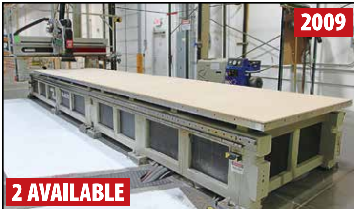
KOMO VR 522 CNC ROUTER