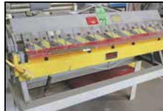
MHC 4876 48" SHEET METAL PAN AND BOX BRAKE