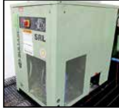
SULLAIR SRL-250 REFRIGERATED AIR DRYER