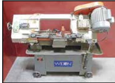
WILTON 3410 7" X 12" BANDSAW