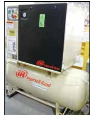
15 HP INGERSOLL RAND UP6-15C-125 ROTARY SCREW AIR COMPRESSOR

FLAMMABLE LIQUIDS CABINETS, SELF DUMPING HOPPERS, CANTILEVER AND PALLET RACKING, LARGE ASSORTMENT OF IRWIN QUICK CLAMPS, SHOP FANS, LADDERS, WORK BENCHES, PALLET JACKS, JIB CRANES, COIL HOOK, FORKLIFT BOOM ATTACHMENTS AND MORE