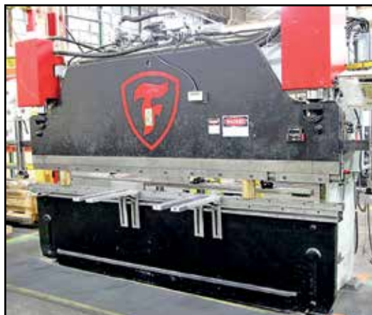
110-TON PACIFIC J110-12 HYDRAULIC PRESS BRAKE