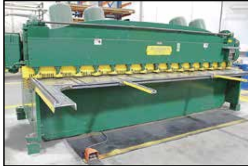
CINCINNATI 1414 POWER SQUARING SHEAR