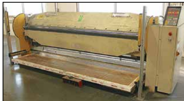
ROPER WHITNEY AB1016C AUTOBRAKE 2000 FOLDER