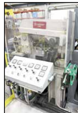
BRANER 54" LEVELER