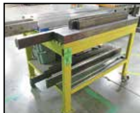
PRESS BRAKE TOOLING