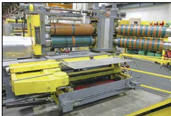
BRANER TRIPLE HEAD TURRET SLITTER