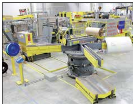
BRANER 4-ARM TURNSTILE