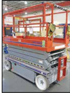
SKYJACK SJ4626 SCISSOR LIFT

SAF-T-CART PORTABLE TORCH CART W/HOSE AND GAGES