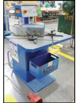
BOSCHERT LITE HYDRAULIC POWER NOTCHER