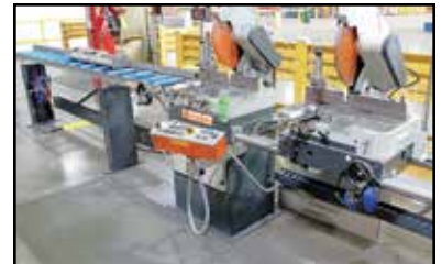
ELUMATEC DG 79/32 DUAL MITER SAW LINE