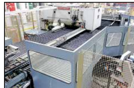
SALVAGNINI S4.40 PUNCHING AND SHEARING SYSTEM