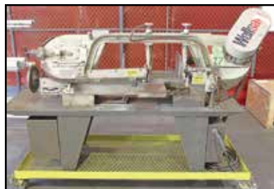
WELLSAW 1016 HORIZONTAL BANDSAW