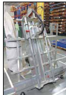
MILWAUKEE PANEL SAW

MILWAUKEE PANEL SAW W/MILWAUKEE 3 1/4 HP 6486-20 POWER UNIT