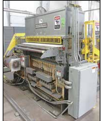
BRADBURY 17-ROLL LEVELER