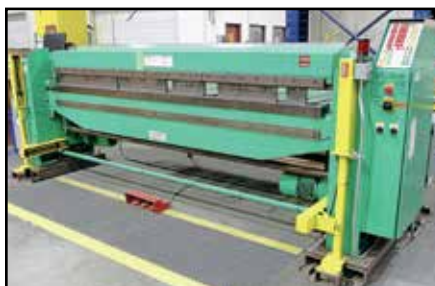
ROPER WHITNEY AB1014 AUTOBRAKE 2000 FOLDER