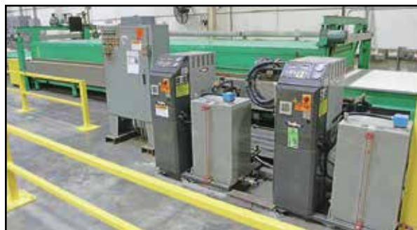
STERLCO 25' X 78" THERMAL PRESS