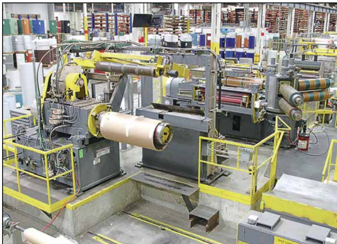
BRANER CUT-TO-LENGTH LINE