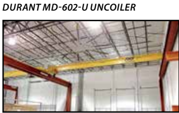
3-TON FLORIDA BRIDGE CRANE

OVERLAY LAMINATORS, NATIONAL PARTITIONS MEZZANINE, COMBINATION DISK/BELT SANDERS, AND MORE