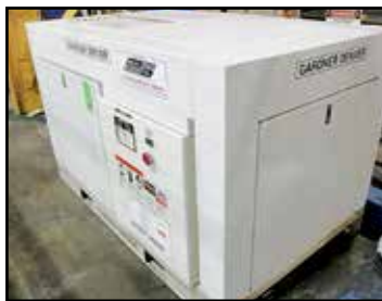
40 HP GARDNER DENVER ROTARY SCREW AIR COMPRESSOR