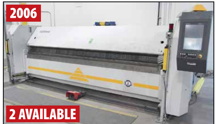
RAS FLEXIBEND 73.40 CNC FOLDER

Sale Closing From: Tuesday, April 12, 2016 at 11:00 AM