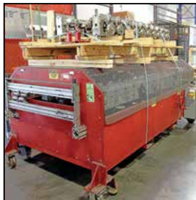
SCHLEIBACH QUADRO MILL

2007 METFORM CUT-TO-LENGTH LINE , Metform 40,000 Lb Coil Car, 72" Max. Coil Diameter, 20" Lift, Metform 40,000 Lb Uncoiler, 60" Max. Coil Width, 20" Min. ID, 72" Max. OD, .12-.024" Material Thickness Capacity, Metform Shear, 15-60" Material Width Capacity, .012-.024" Material Thickness, 4" Stroke, Bradbury (17) Roll Auto-Select Leveler, Metform Vinyl Applicator, 60" Max. Material Width, 225 FPM Line Speed, 300 Lb Max. Roll Capacity, Metform Side Guide, 60" Strip Width Capacity, 63.5" Max. Opening, Metform Pull Feeder, 8" Roll Diameter, Metform Shear, 15-60" Material Width Capacity, .012-.024" Material Thickness, 3" Stroke, 120CC and 60 Cut Per Minute, Metform Air and Mechanical Material Stacker