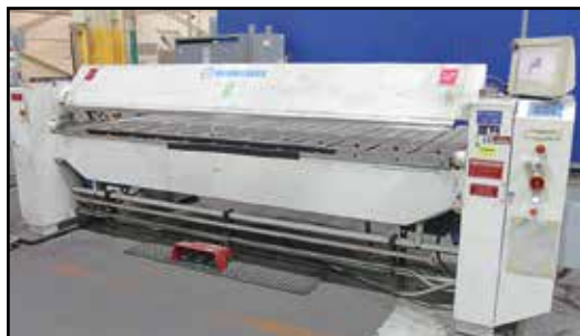
SCHECHTL MAB310 CNC FOLDER