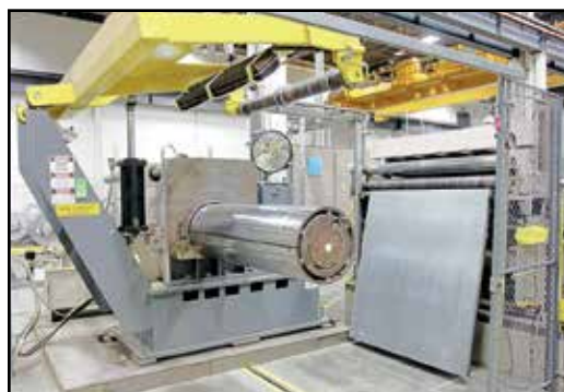
BRANER 30,000-LB. COIL REEL