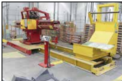
SAMCO D150BTJ48 2695N37 DUAL UNCOILER AND COIL CAR

(2) 20,000 LB GARY 136610 COIL TIPPERS, s/n 51506 and 082007