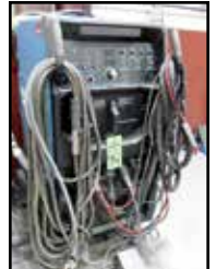
MILLER SYNCROWAVE 350LX TIG WELDER