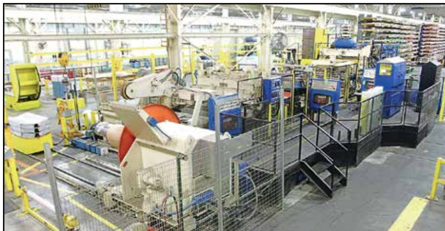
SESCO CUT-TO-LENGTH LINE