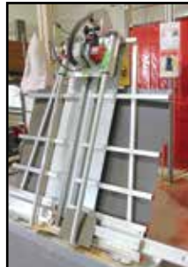
MILWAUKEE PANEL SAW