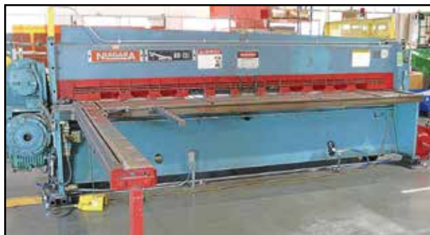
NIAGARA SABRELINE SS 12-1/4 POWER SQUARING SHEAR