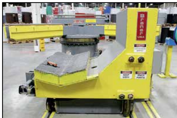
30,000-LB. BRANER COIL CAR