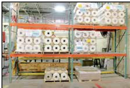
OVER (50) SECTIONS OF RACKING

(OVER 50) SECTIONS OF CANTILEVER AND PALLET RACKING