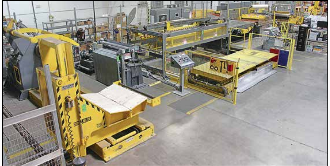
STRILICH/BRADBURY/SAMCO 48" X 18 GA. SLEAR LINE

Cut-to-Length & Slitting Lines, Punching & Shearing System, CNC Routers, CNC Folders, Press Brakes, Shears, Laminate Line, Large Assortment of Welding, Overhead Bridge Cranes & Full Complement of Plant Support