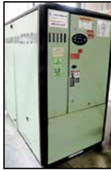
50 HP SULLAIR 3709/A SCREW TYPE AIR COMPRESSOR