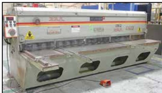
ACCURSHEAR 613512 POWER SQUARING SHEAR