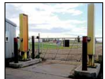
TRANSPORT X-RAY UNIT

Auction is conducted in Canadian Funds. US Buyers enjoy approximately 25% savings against the Canadian dollar.