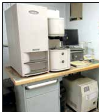
LECO NITROGEN/OXYGEN DETERMINATOR