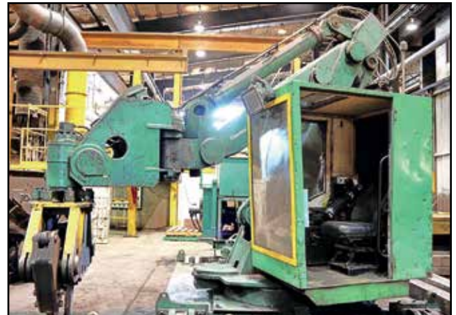
CLANSMAN DYNAMICS HYD. MANIPULATOR

Sale Date: Tuesday, December 1, 2015 at 9:00 AM MT Inspection: Monday, November 30, 2015 from 9:00 AM–4:30 PM MT Sale Location: 2323 4th Street, Nisku, AB 79E 7W7 Canada