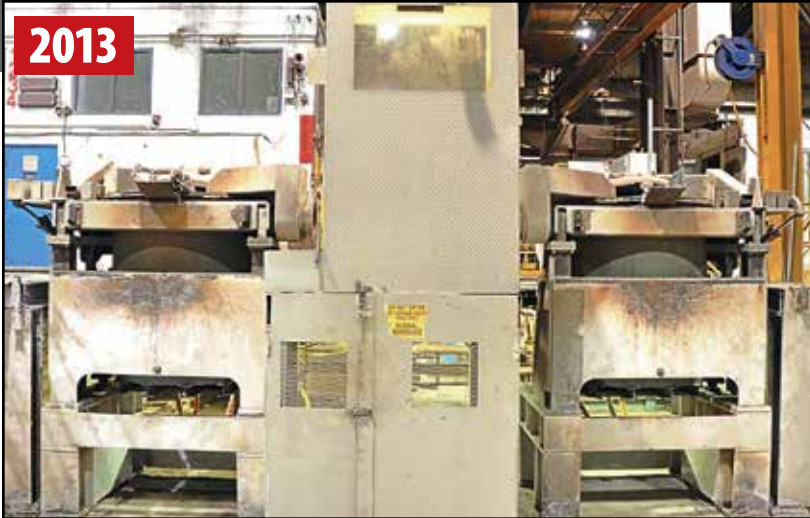
AJAX TOCCO PACER II PS MELT SYSTEM