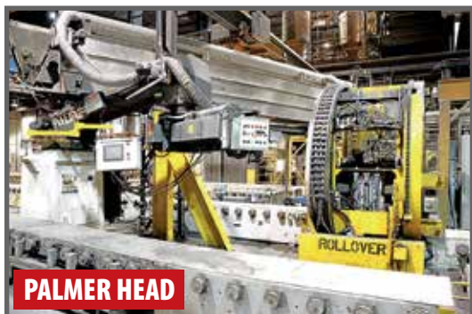
PALMER HEAD KLOSTER TYPE II 1,200 LB/HR CORE MIXER