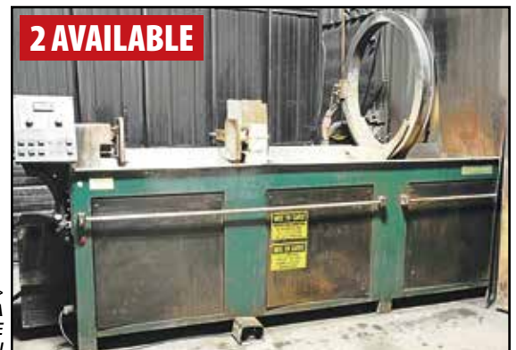
NO. 3 HEAT TREAT OVEN