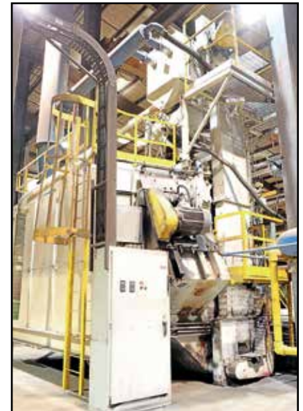
WHEELABRATOR RECLAIM AND DUST COLLECTOR