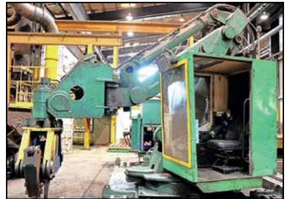
CLANSMAN DYNAMICS HYD. MANIPULATOR