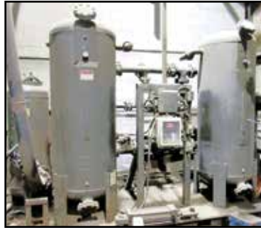
AIRTEK TW-2000 DESICCANT AIR DRYER

Auction is conducted in Canadian Funds. US Buyers enjoy approximately 25% savings against the Canadian dollar.