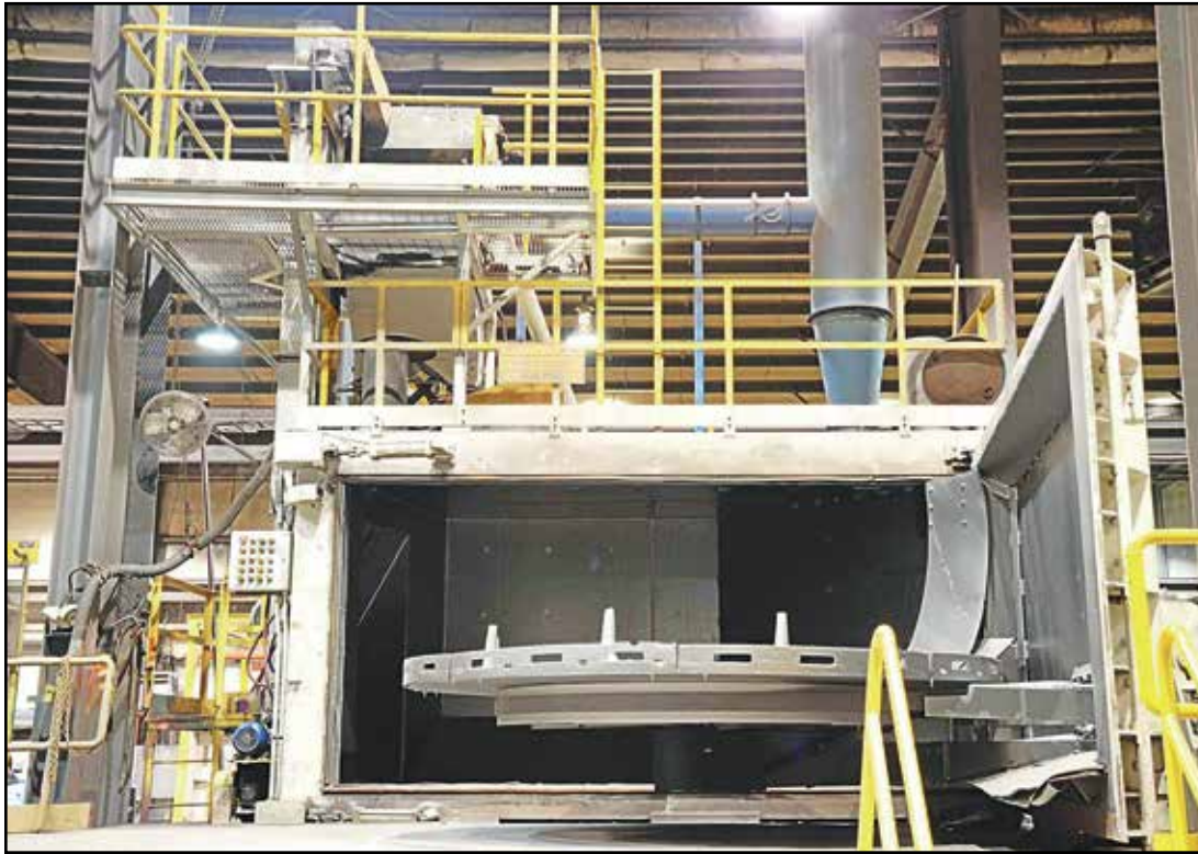
WHEELABRATOR 120" TABLE BLAST MACHINE

Assets No Longer Required In the Ongoing Operations of