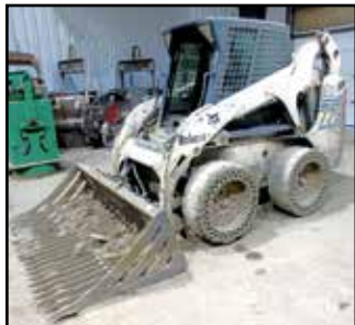
BOBCAT 773 SKID STEER LOADER