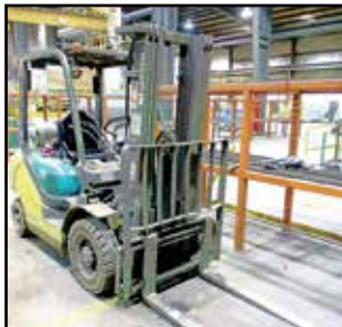
KOMATSU 5,400 LB LPG FORKLIFT