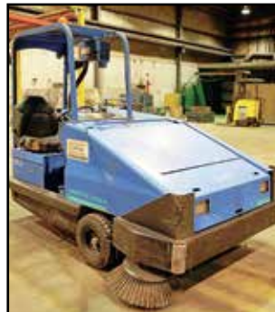
AMERICAN-LINCOLN MPV 60 LPG POWER SWEEPER