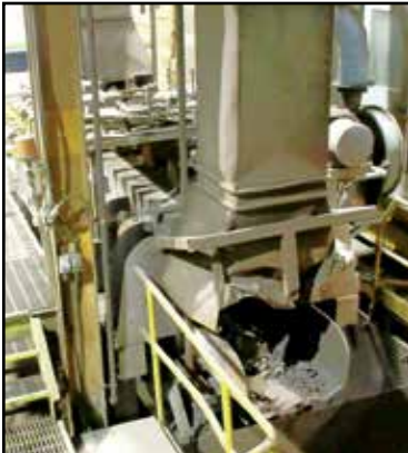
VENATTA SCRAP PRE-HEATER