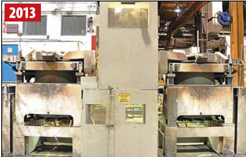
AJAX TOCCO PACER II PS MELT SYSTEM