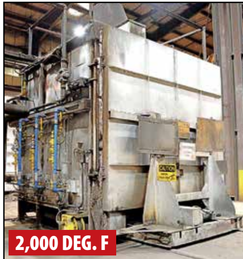
NO. 2 HEAT TREAT OVEN