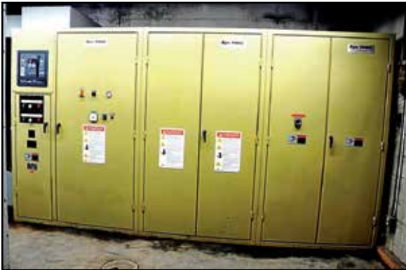
AJAX TOCCO 1,500 KW CONTROL