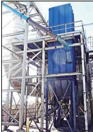
MURPHY 25,000 CFM DUST COLLECTOR