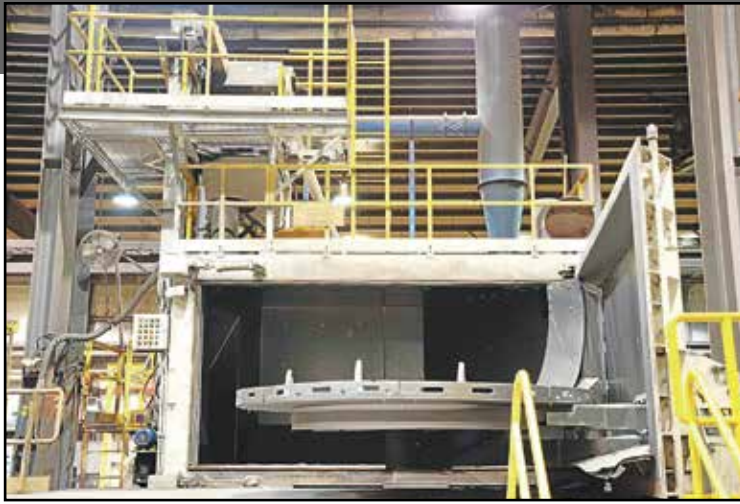
WHEELABRATOR 120" TABLE BLAST MACHINE