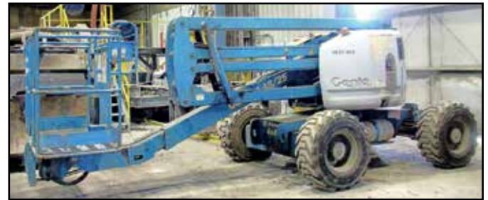
GENIE Z-45/25 DUAL FUEL SNORKEL BOOM