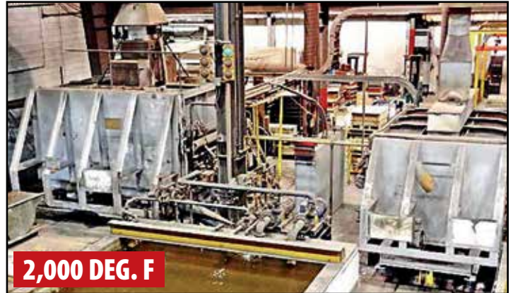
NO. 1 AND NO. 3 HEAT TREAT OVENS