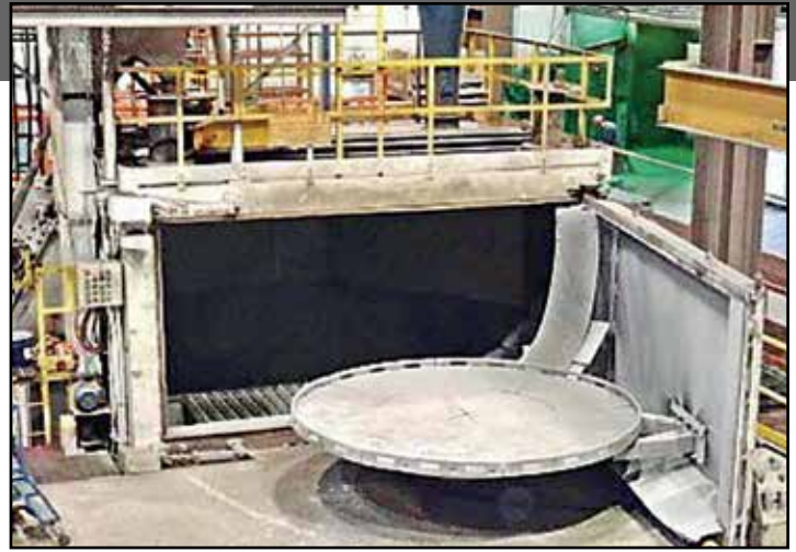
WHEELABRATOR 120" TABLE BLAST MACHINE

ALSO: 36" Swing Grinder, Double End Grinders, Fox Single Wheel Snag Grinders, Mini Grinders, Hardness Testers, Etc.