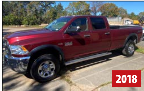
RAM 2500HD 4X4 PICKUP TRUCK