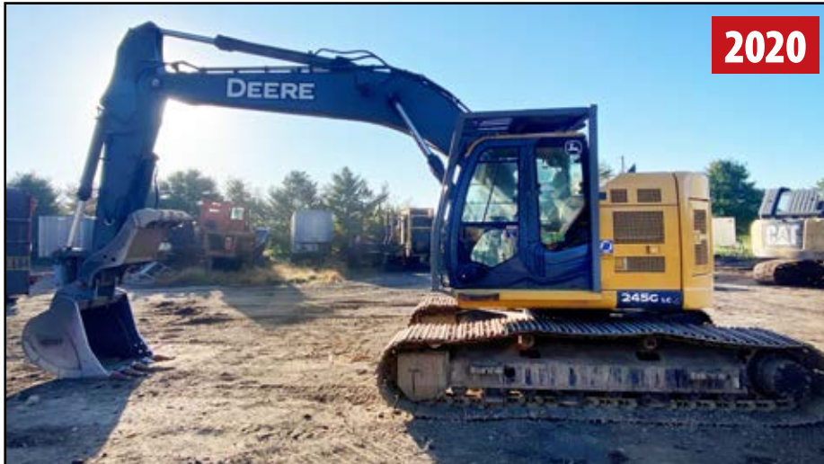
JOHN DEERE 245G LC EXCAVATOR