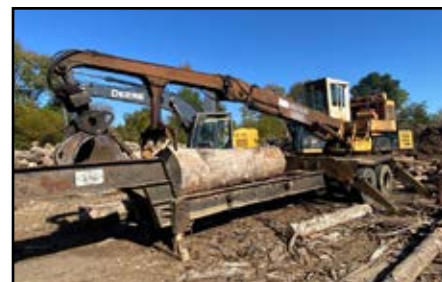
BARKO 160A T/A TRAILER MOUNT LOG LOADER

2005 WILDCAT 626 COUGAR TROMMEL SCREEN , 1W9SS53275F351345