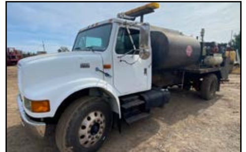
INTERNATIONAL 4900 FUEL/LUBE TRUCK