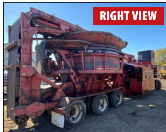
2004 MORBARK 1300A TUB GRINDER