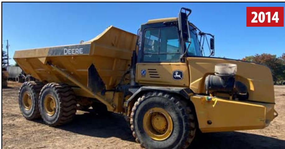
JOHN DEERE 300D ARTICULATED DUMP TRUCK