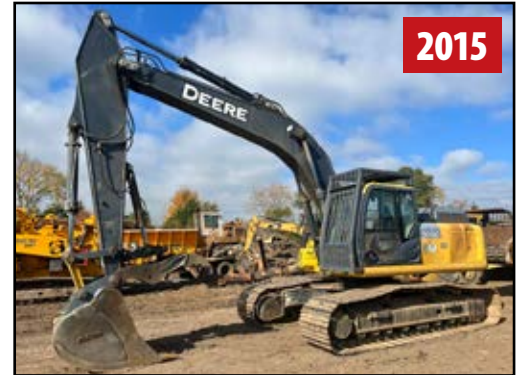
JOHN DEERE 300G LC EXCAVATOR