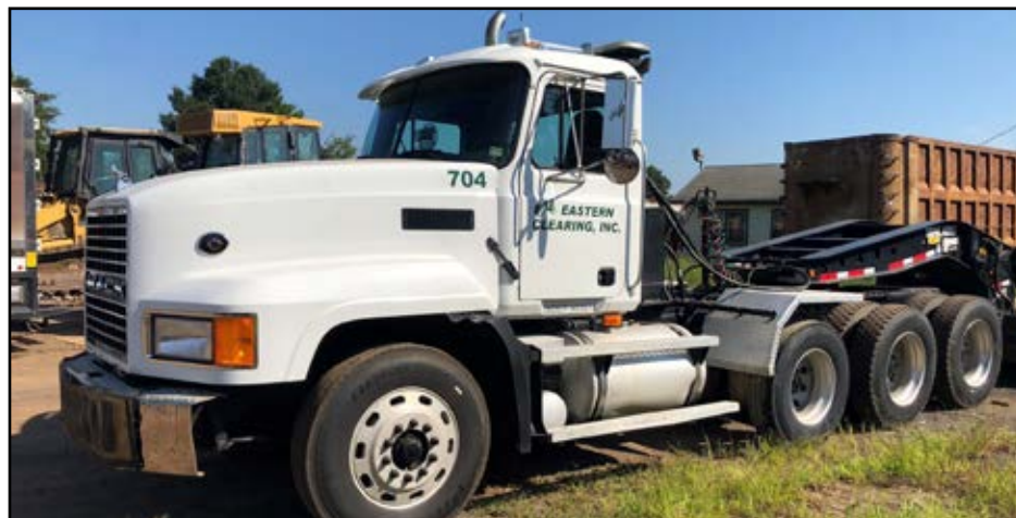
MACK CL713 TRI-AXLE TRUCK TRACTOR

2003 MACK CV713 T/A TRUCK TRACTOR , VIN 1M2AG10Y63M005224, Requires Repair