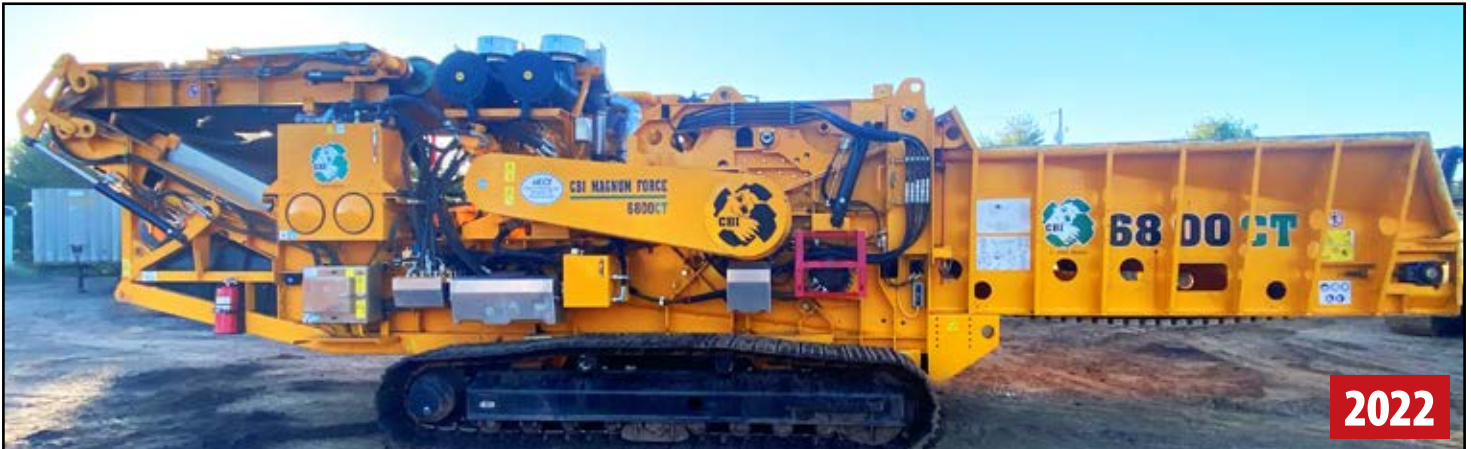
TEREX CBI MAGNUM FORCE 6800CT HORIZ. GRINDER