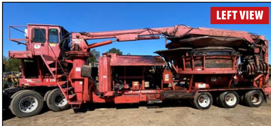
2004 MORBARK 1300A TUB GRINDER