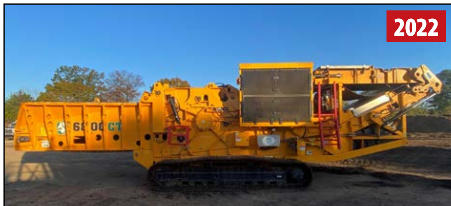
TEREX CBI MAGNUM FORCE 6800CT HORIZ. GRINDER

2012 MORBARK 23WCL CHIPARVESTOR WHOLE TREE CHIPPER , s/n 194, w/ CAT 800 hp Engine, Compressor, MORLIFT Hydraulic Boom & Grapple, Cab, 6532 hours