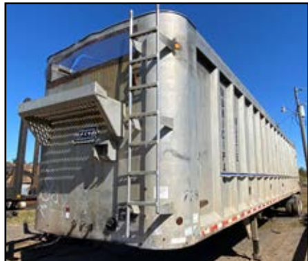
2003 EAST T/A WALKING FLOOR SEMI TRAILER