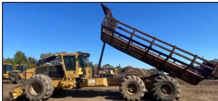
2002 TIGERCAT 640 LOG HAULER