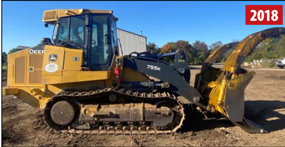
JOHN DEERE 755K TRACK LOADER

2015 JOHN DEERE 624K WHEEL LOADER, s/n 1DW624KZCFF669384, 6300 Hours, w/ Grapple Fork Attachment, New Rubber