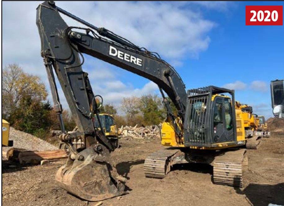
JOHN DEERE 245G LC EXCAVATOR

2012 CATERPILLAR 329EL EXCAVATOR, s/n CAT0329ELPLW00322, 12580 Hours, w/ Hydraulic Thumb, Bolt-On Guarding