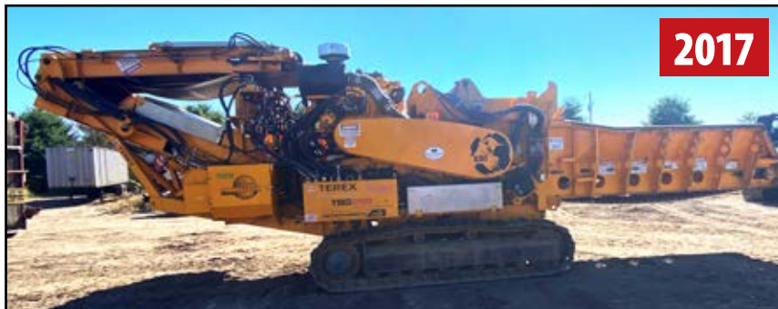
TEREX CBI MAGNUM FORCE TBG650 HORIZ. GRINDER

PRE-AUCTION OFFERS INVITED ON MAJOR ASSETS