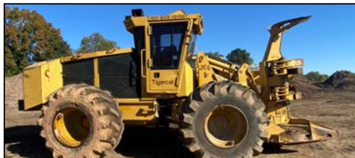
2004 TIGERCAT 724D FELLER BUNCHER