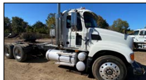
MACK CH713 T/A TRUCK TRACTOR