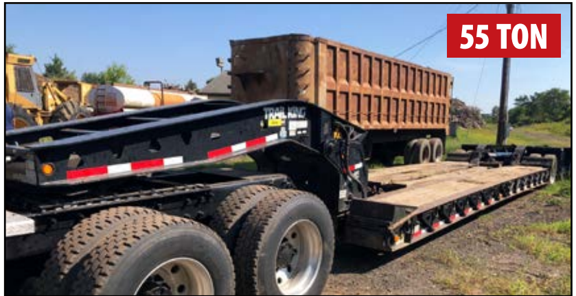
2018 TRAIL KING DETACHABLE NECK TRI-AXLE LOWBOY TRAILER

ALSO: T/A 5th Wheel Dolly, CATERPILLAR 963C Track Loader (Parts Unit) JOHN DEERE 300G Excavator (Parts Unit), Lube Service Body, Fuel & Van Trailers, Conveyor, Large Selection of Attachments Including Buckets, Grapples, Forks, Mechanic/Repair Shop Equipment, Air Compressor, Welders, Fuel Tanks, Etc.