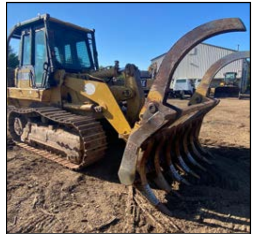
2005 CATERPILLAR 963C TRACK LOADER