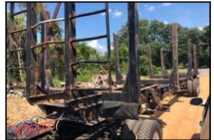
BIG JOHN T/A LOG TRAILER