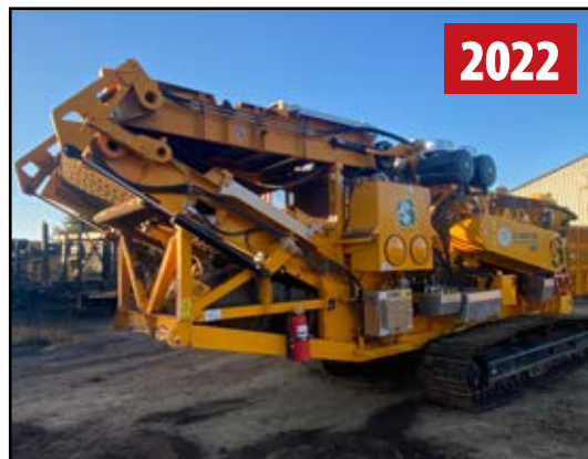
TEREX CBI MAGNUM FORCE 6800CT HORIZ. GRINDER