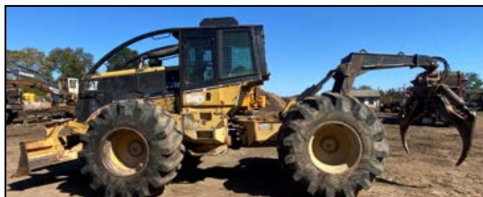
2001 CATERPILLAR 525B GRAPPLE SKIDDER