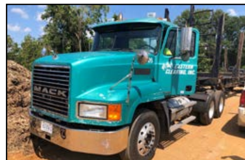
2001 MACK CH613 T/A TRUCK TRACTOR