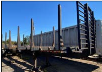
2003 PITTS T/A LOG TRAILER