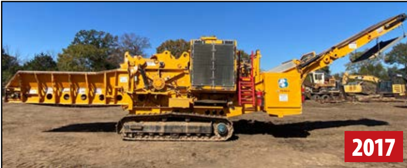
TEREX CBI MAGNUM FORCE TBG650 HORIZ. GRINDER

FEATURING: 2022 CBI 6800 CT & 2017 CBI TBG650 Horizontal Grinders, 2004 Morbark 1300A Tub Grinder, 2012 Morbark Model 23 Chip Harvester, (6) John Deere & CAT Excavators, new as 2020, (3) John Deere & CAT Track Loaders, new as 2018, 2015 John Deere 624K Wheel Loader, 2014 John Deere 300D Articulated Dump Truck, Plus Feller Buncher, Skidders, Log Loader, Highway Tractors, Detachable Neck Lowboy, Log & Walking Floor Trailers, Mechanics Trucks, Pick-Up Truck, and More