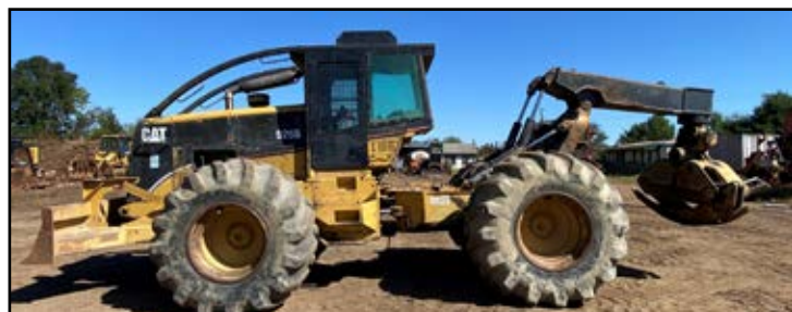
2006 CATERPILLAR 525B GRAPPLE SKIDDER