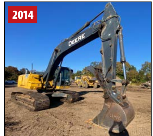
JOHN DEERE 250G LC EXCAVATOR