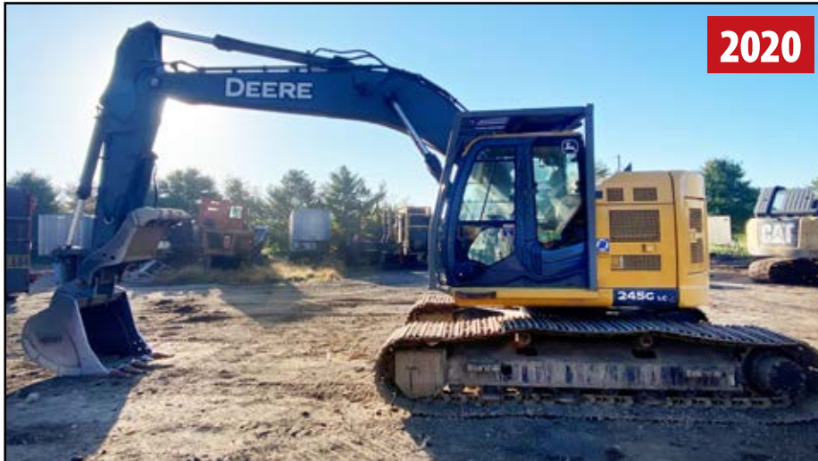
JOHN DEERE 245G LC EXCAVATOR