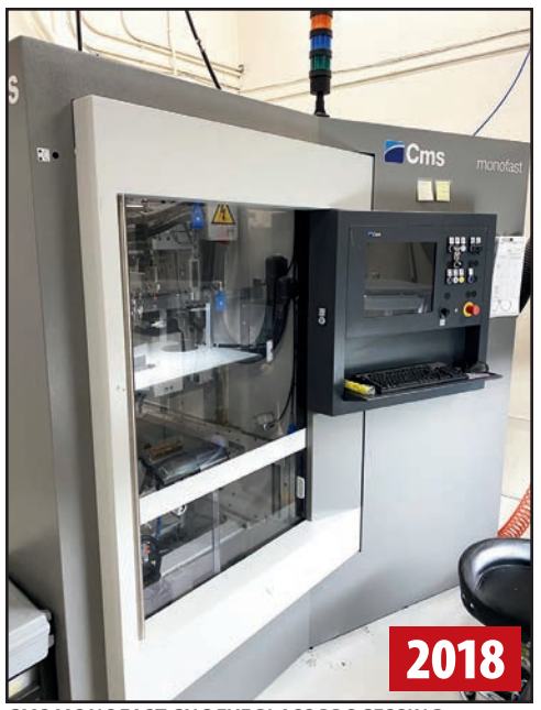
CMS MONOFAST CNC EYEGLASS PROCESSING MACHINING CENTER