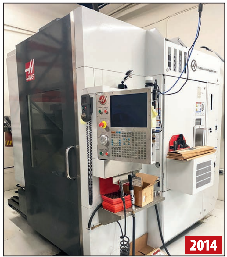
HAAS UMC-750 5-AXIS VERTICAL MACHINING CENTER