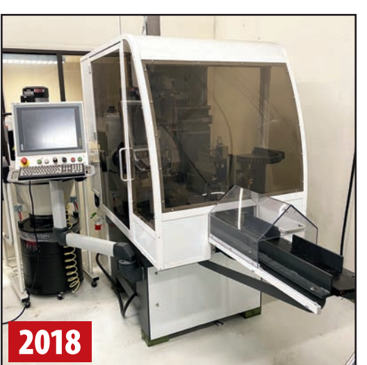
LG TECH MILTECH 3.0 EYEWEAR MILLING/ THICKNESSING MACHINE