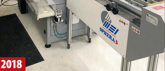
MEI SPHERA 3 CNC EYEGLASS PROCESSING MACHINING CENTER