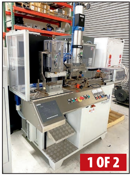
2018 TVM TENNESSEE ROBOTIC CORE SHOOTERS

Complete Catalog & Information Available at https://perfection.global/dita