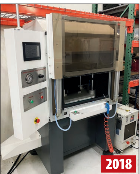
LG TECH ORBITAL BONDING CENTER