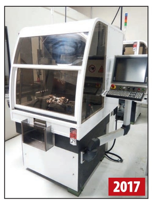
LG TECH MULTISTAR X AUTOMATIC HINGE INSERTER