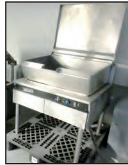
GARLAND S/S SKILLET