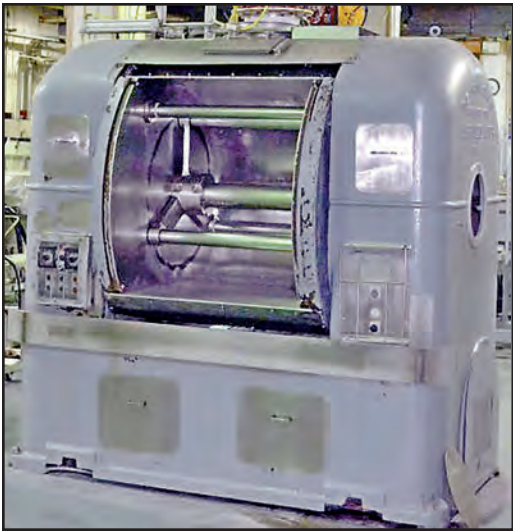
JH DAY DOUGH MIXER