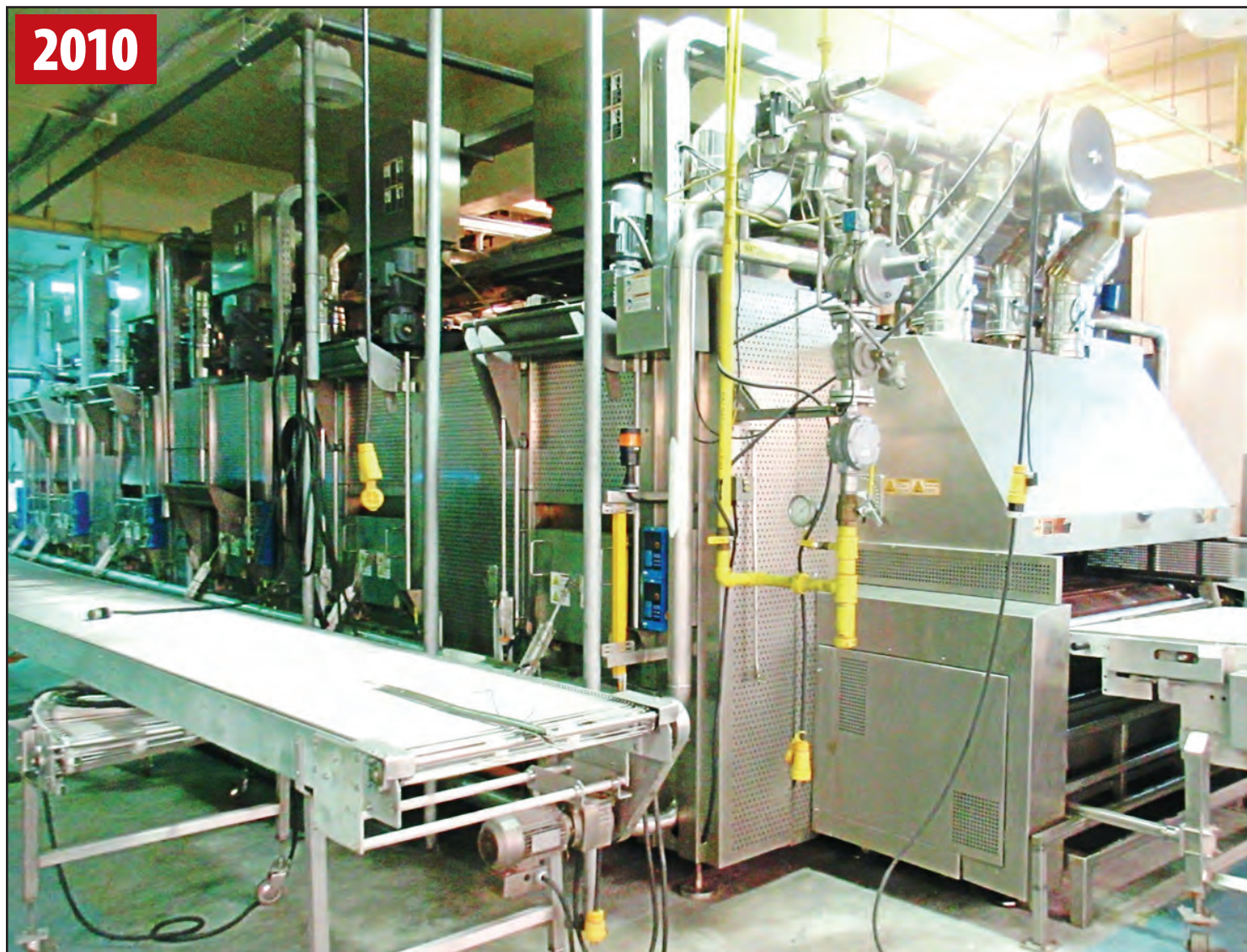
CLM DUAL SOURCE OVEN (EXIT VIEW)

Machinery & Equipment for the Production & Packaging of Fresh & Frozen Italian Food Products, Pizzas & Pasta