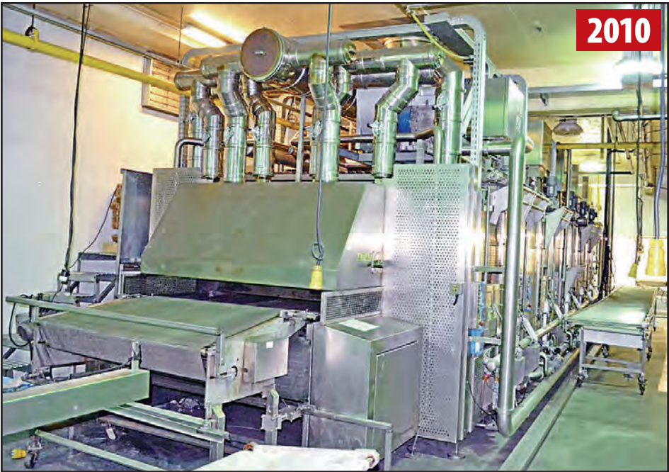
CLM DUAL SOURCE OVEN (ENTRY VIEW)