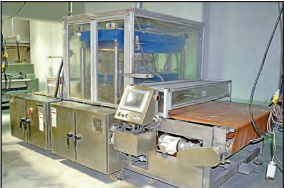
APACHE PIZZA PRESSES

PLUS: CONICAL DOUGH ROUNDER, AUTOMATIC CONTINUOUS PROOFERS, ASSORTED SHEETERS AND EXTRUDERS, S/S CONVEYORS, PEPPERONI SLICERS, CHEESE SHREDDERS, PIZZA SAUCE DOSERS, SPIRAL CONVEYORS W/ALL S/S CONSTRUCTION, COMPRESSORS, COLD ROOM AND FREEZER COMPONENTS, APACHE PIZZA PRESSES, S/S SINKS, TABLES, 6,000 ALUMINUM OVEN TRAYS, S/S COIL JACKETED TANK WITH AGITATION, TOP DOWN LABELLER, SHANKLIN AUTOMATIC "L-BAR" SEALERS, CASE SEALERS, CARTONER, INK JET PRINTERS