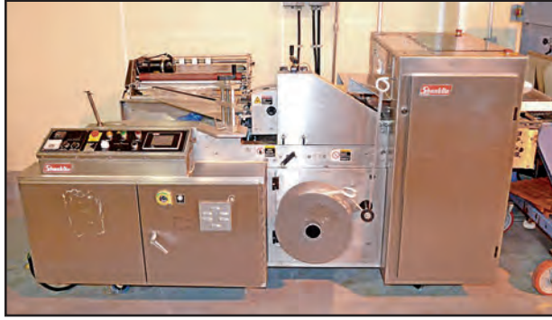
SHANKLIN FORM-FILL SEAL SHRINK WRAPPER