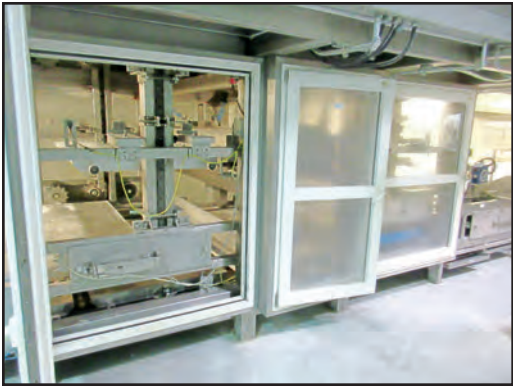
BAMAK CONTINUOUS PROOFER

2010 CLM FOOD INDUSTRY SYSTEMS VESUVIO STAINLESS STEEL HIGH TEMPERATURE DUAL SOURCE TUNNEL OVEN, s/n 176/08, w/Wood Burning or Natural Gas Capable, Stone Slat Conveyor, Automatic Wood Log Feed System, Touch Screen Control, NOTE: Offered Subject to 24-Hour Owner Confirmation