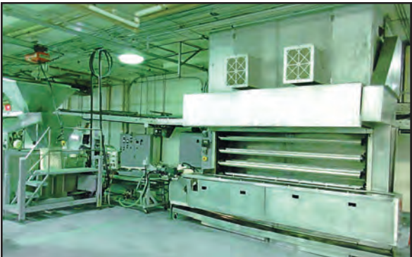
AUTO CONTINUOUS PROOFER

JH DAY TYPE F HERCULES DOUGH MIXER SIGMA DOUGH MIXER HOBART DOUGH MIXER KASON SINGLE-DECK S/S SIFTER GEMINI DOUGH ROUNDER