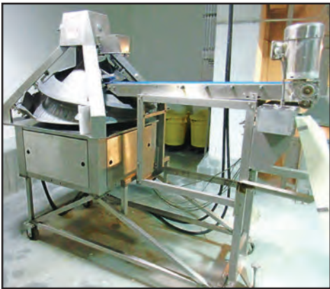
CONICAL DOUGH ROUNDER