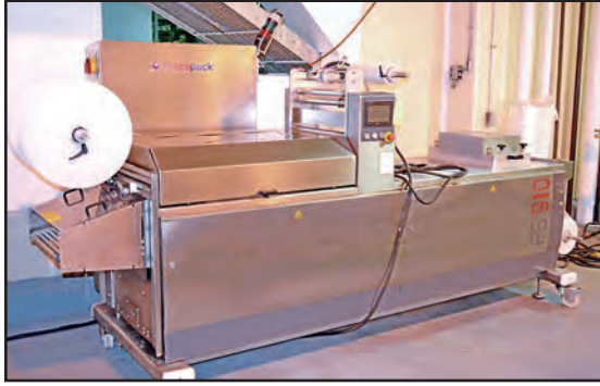
MECAPACK F5910 COMPACT THERMOFORMING LINE