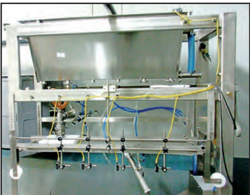
PIZZA SAUCE DOSER