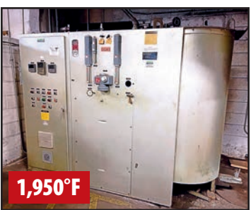
LINDBERG 16-150-A4-HYEN FNDOTHERMIC GENERATOR