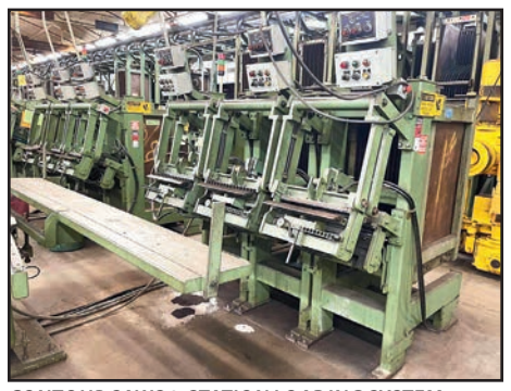
CONTOUR SAWS 3-STATION LOADING SYSTEM