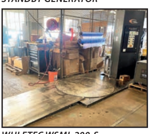
WULFTEC WSML-200-S PALLET WRAPPER