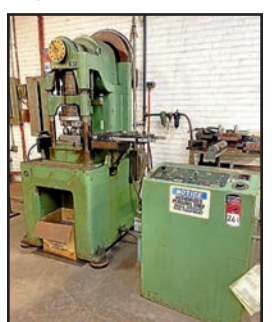
BRUDERER BSTA 30 3-POST HIGH SPEED PRESS