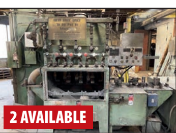
PROGRESSIVE BLASTING SHOT BLAST LINE