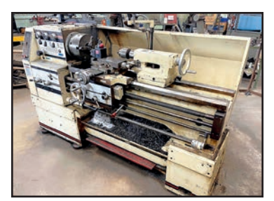
JET 1440-3PGH GEARED HEAD ENGINE LATHE