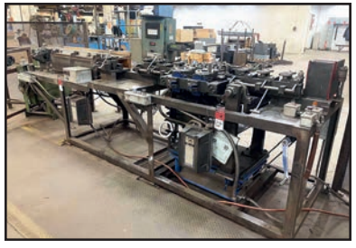
BLADE STRAIGHTENER AND LENGTH COUNTER LINE, 3" CAPACITY