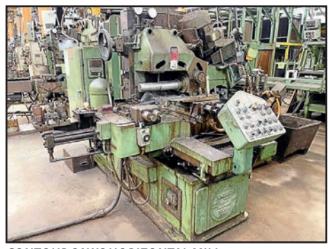
CONTOUR SAWS HORIZONTAL MILL

CONTOUR SAWS HORIZONTAL MILL LINE #7, 3-Station Loading System w/Dancer Loading Table, CONTOUR SAWS 380 Horizontal Mill, Polypac Hydraulic System, Clamping, 10-Speed, w/48-Disk Coiler Bank