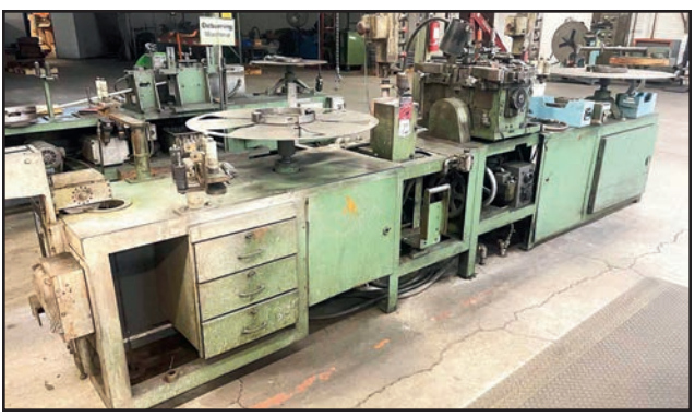
TEETH SETTER LINE #10