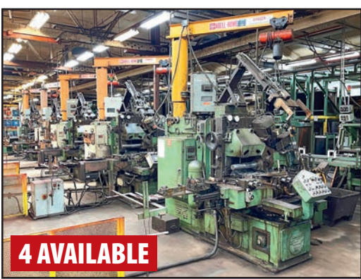
CONTOUR SAWS HORIZONTAL MILL LINES

Pre-Auction Offers Invited on Major Assets