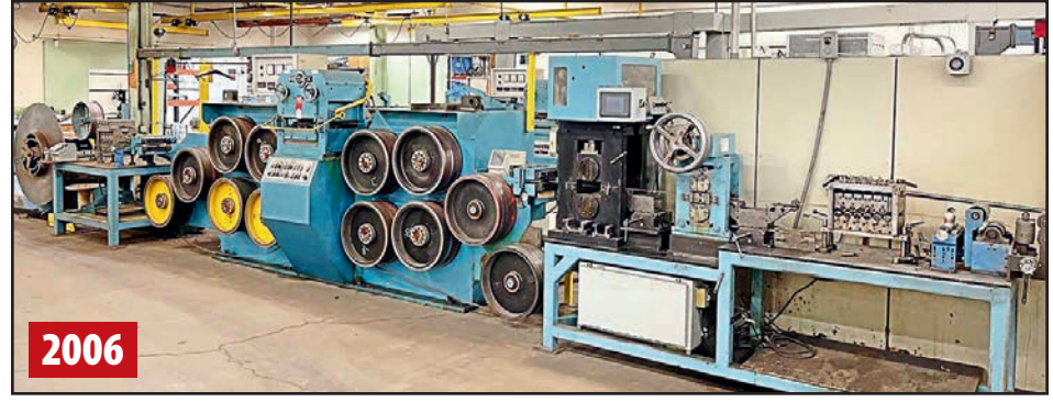
REDEX C010 CONTINUOUS STRETCHING AND LEVELING LINE #1