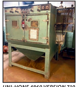
UNI-HONE 4860 VERSION 710 SHOT BLAST SYSTEM