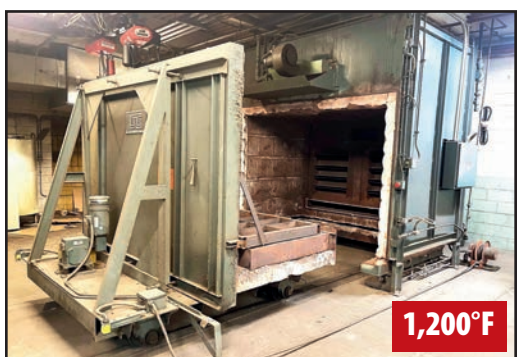
OVEN SYSTEMS NATURAL GAS FURNACE