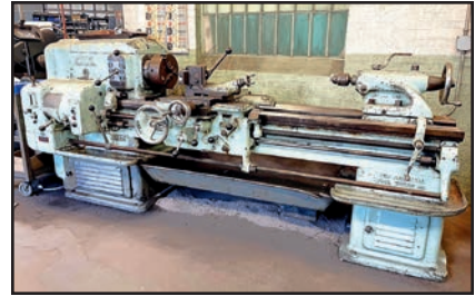
AMERICAN PACEMAKER 14" X 54" LATHE