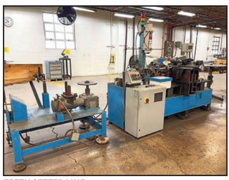
TEETH SETTER LINE #11