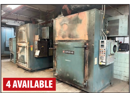
GRIEVE HB-1250 NATURAL GAS & ELECTRIC FURNACES