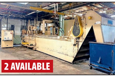
HRB CENTRAL COOLANT SYSTEM