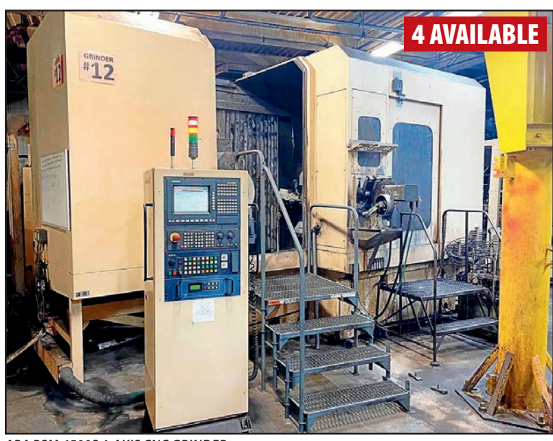
ABA PSM-1500S 4-AXIS CNC GRINDER