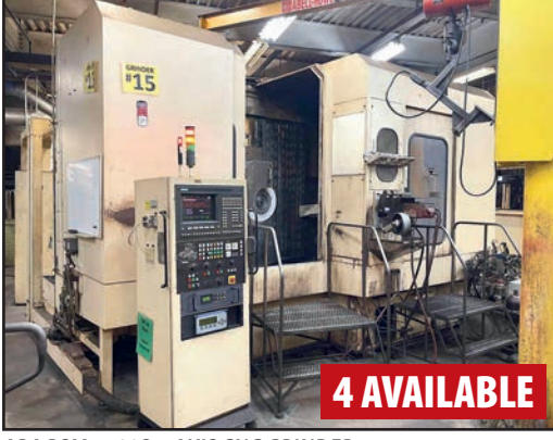
ABA PSM-1500S 4-AXIS CNC GRINDER