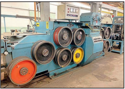
REDEX C010 CONTINUOUS STRETCHING AND LEVELING LINE #2