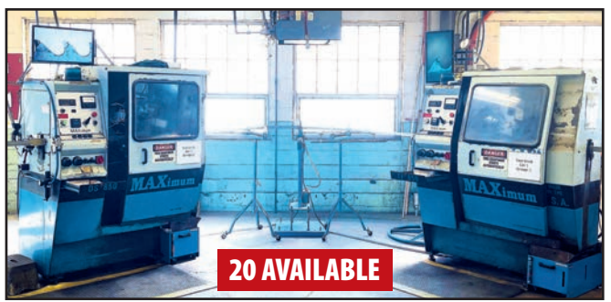
WRIGHT SAW GRINDING MACHINES

FEATURING: Over (800) Lots Incl. Rolling Mills, Stress Reliever Mills, Horizontal Mills, Coil Equipment, Grinders, Assorted Saw Blade Mfg. Equipment, Butt Welding Lines, Heat Treat, Shot Blast Systems, Tool Room, Maintenance, Plant Support, Rolling Stock & More