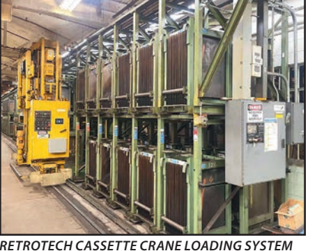
RETROTECH CASSETTE CRANE LOADING SYSTEM