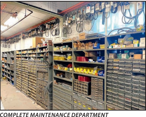
COMPLETE MAINTENANCE DEPARTMENT W/SHELVING AND CONTENTS

To discuss your requirements for an auction. please call Perfection Industrial +1-847-545-6374