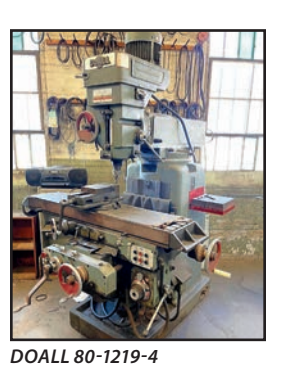
VERTICAL MILL BARBER COLMAN