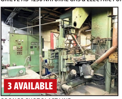
BRONCO SHOT BLAST LINE