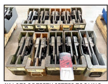
(9) LOTS OF TEETH SETTER TOOLING