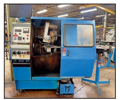
WRIGHT MAXIMUM TF-850SP TOP AND FACE GRINDER