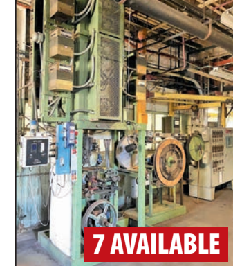
CUSTOM VERTICAL HIGH SPEED HEAT TREAT LINE