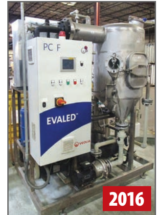
EVALED WASTEWATER EVAPORATOR SYSTEM