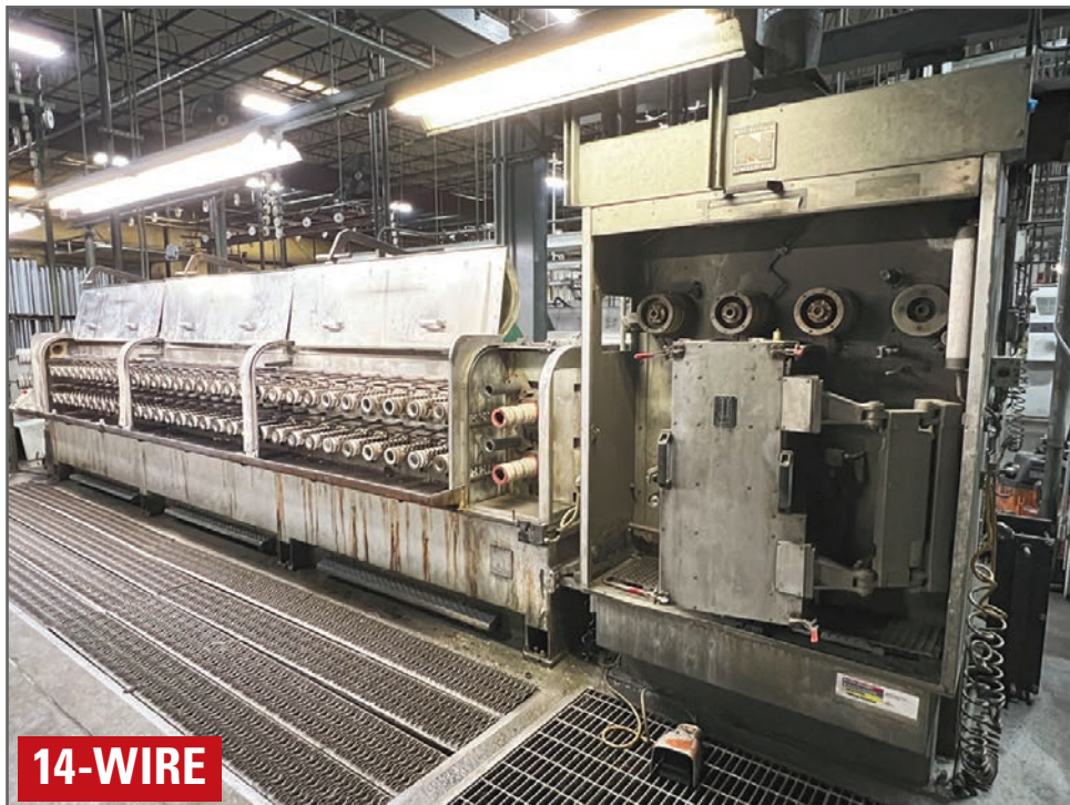
(1 OF 2) NIEHOFF MMH101 MULTIWIRE DRAWING LINES