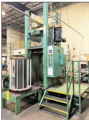
BEKAERT ECC18/22 DOWN COILER