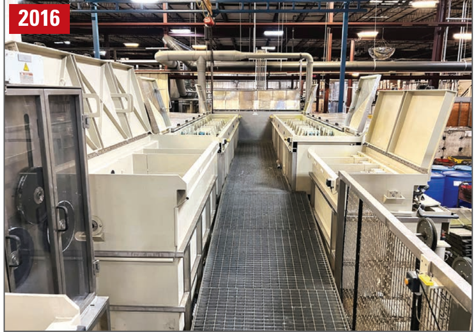
CANDOR 400 METERS/MIN. NICKEL PLATING LINE