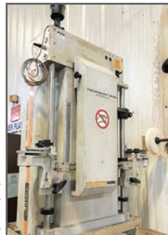
FISCHERSCOPE INLINE THICKNESS GAUGE