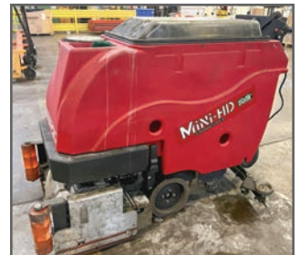
FACTORY CAT MINI-HD POWER SCRUBBER