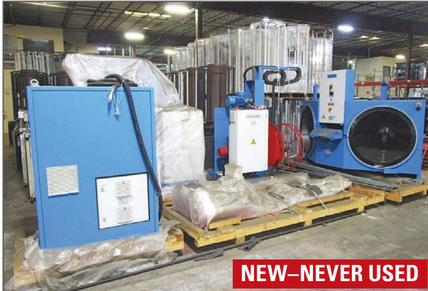
2016 HAGEN & FUNKE FLYER CONE PAYOFF