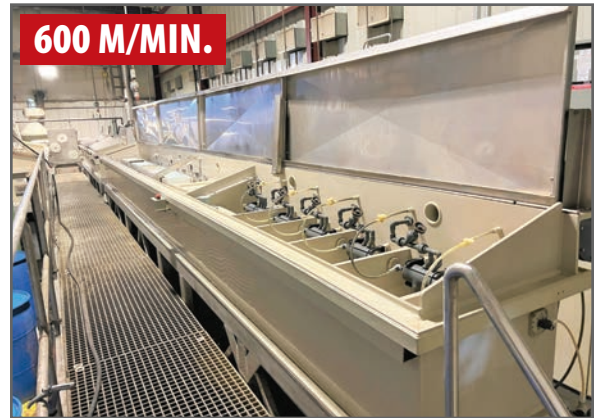
STEULER SILVER PLATING LINE