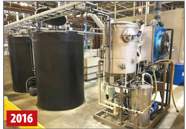
CANDOR CHEMICAL PROCESSING SYSTEM

STEULER B400 DUAL WIRE TIN PLATING LINE , s/n NA, w/Max. Line Speed: 400 Meters/Min., 30" Dual Flyer Cone Payoff and Reel Trucks, Tension Stand, BONGARD STN-600 Down Coiler (TP1/2)