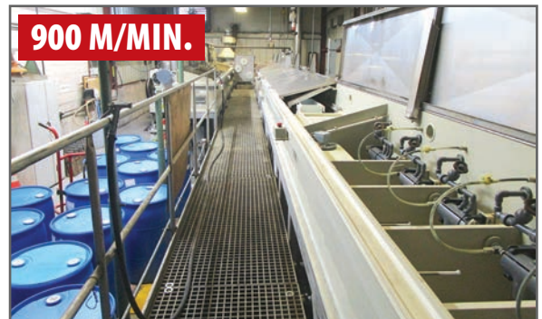
STEULER NICKEL PLATING LINE