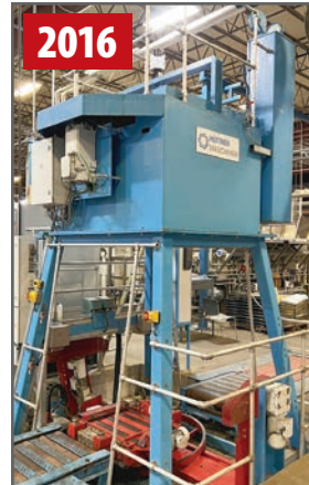
HUTTNER VD-650-SN-TT HIGH SPEED STATIC COILER