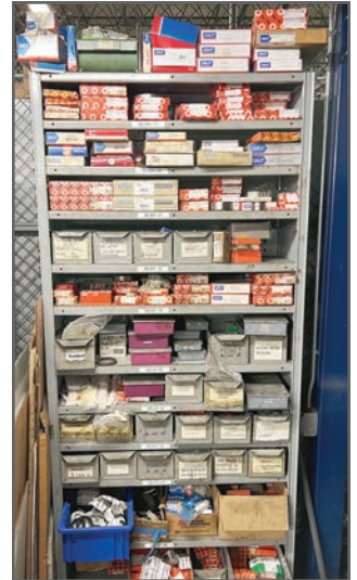
VIEW OF BEARINGS