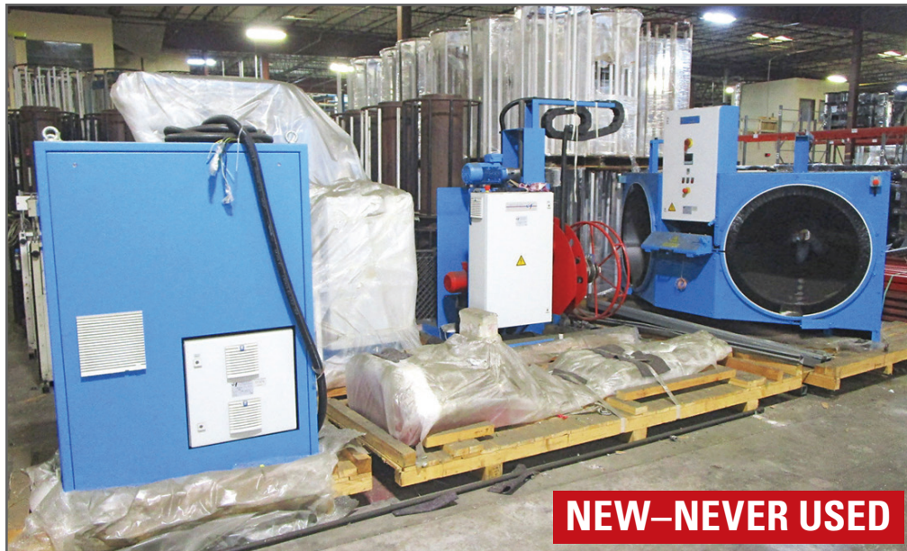
2016 HAGEN & FUNKE DUKA 800B HIGH-SPEED DUAL FLYER CONE PAYOFF

Complete Catalog & Information Available at https://perfection.global/barewire