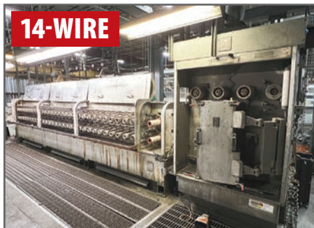
(1 OF 2) NIEHOFF MMH101 MULTIWIREDRAWING LINES

COMPLETE BARE WIRE MANUFACTURING & PLATING FACILITY