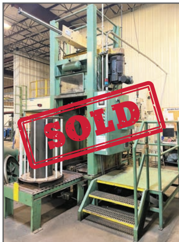
BEKAERT ECC18/22 DOWN COILER