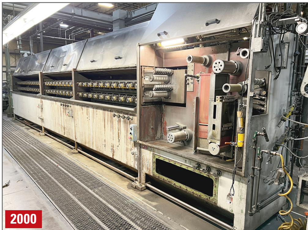
SAMP MT6 16-WIRE MULTIWIRE DRAWING LINE

ph +1-847-545-6374 • fax +1-847-427-8884 www.perfectionindustrial.com