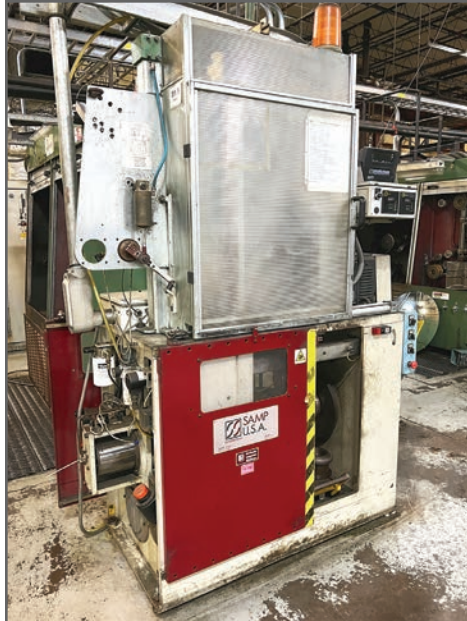
SAMP TE/63-N SPOOLER