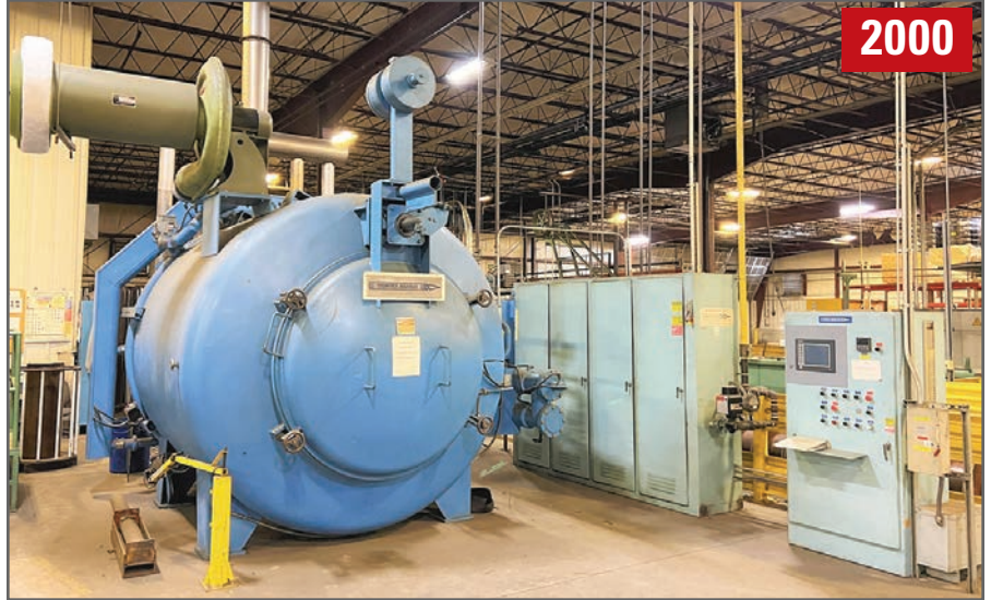
THERMOTECH VACUUM ANNEALING FURNACE