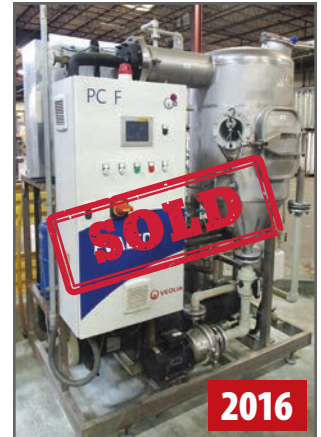
EVALD WASTEWATER EVAPORATOR SYSTEM