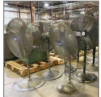
VIEW OF FANS

To discuss your requirements for an auction, please call Perfection Industrial +1-847-545-6374