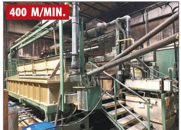
STEULER DUAL WIRE TIN PLATING LINE