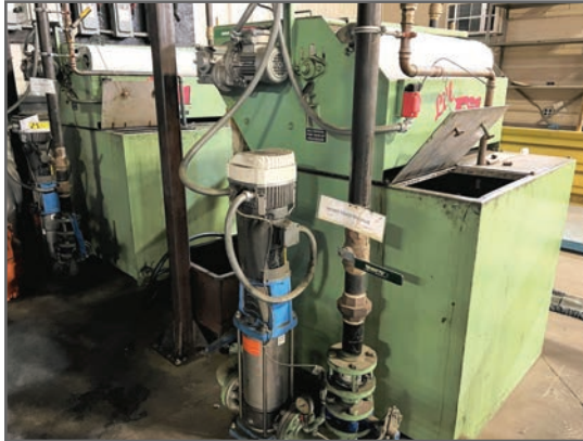
(2) FILTER TECH LF3-108 FILTRATION SYSTEMS