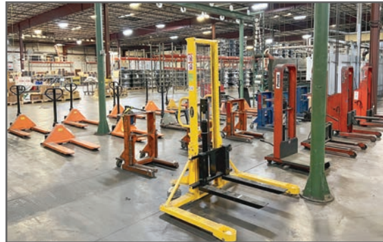
VIEW OF ASSORTED LIFTS