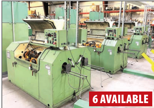
DIGEP 250MM DOUBLE TWIST BUNCHERS