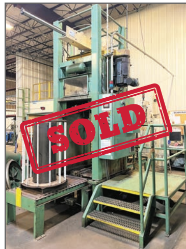
BEKAERT ECC18/22 DOWN COILER