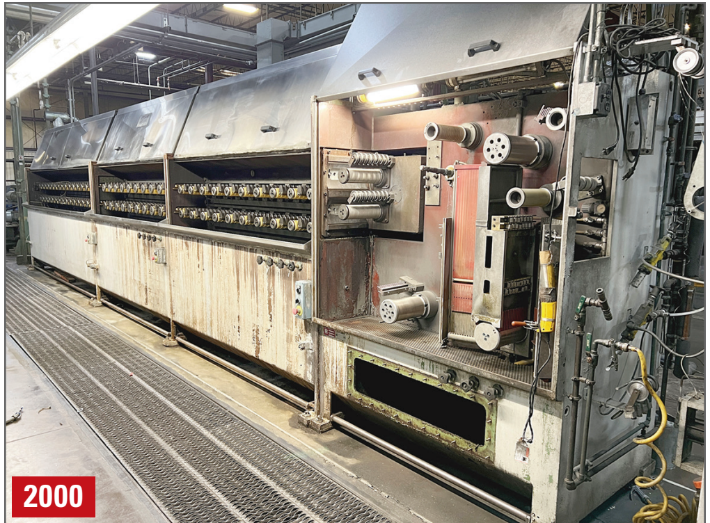
SAMP MT6 16-WIRE MULTIWIRE DRAWING LINE

ph +1-847-545-6374 • fax +1-847-427-8884 www.perfectionindustrial.com