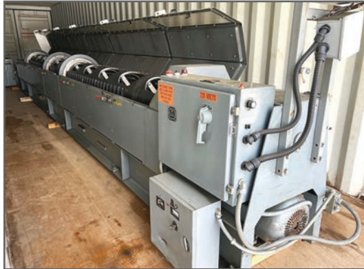
BARTELL B64 12-BAY TUBULAR STRANDER

2018 REELPOWER TUAF-10-10 POWER SPOOLER, s/n 015773-000-01, w/4,000 Lb Tension Winch, OD: 60", ID: 20", AOW: 32", Arbor 4", 15 HP, Vector Drive, Electric Level-Wind, Braking Snubber