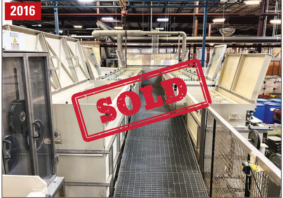
CANDOR 400 METERS/MIN. NICKEL PLATING LINE