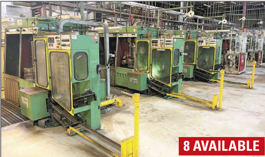
VIEW OF SAMP SINGLE END DRAWING LINES