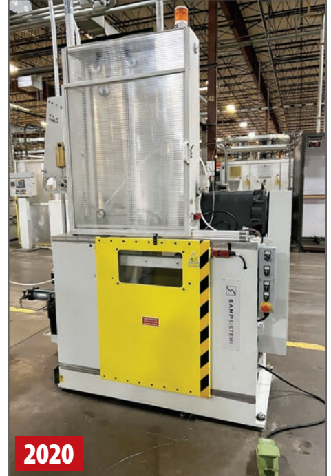
2020 SAMP BD630 SPOOLER