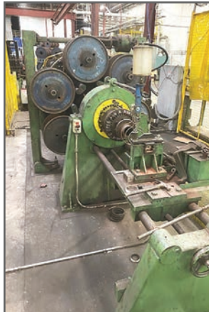
NEW ENGLAND BUTT 18-HEAD 22" RIGID STRANDER