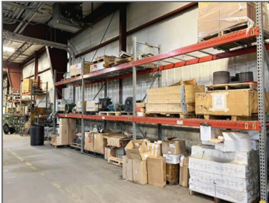
VIEW OF SPARES AND PARTS