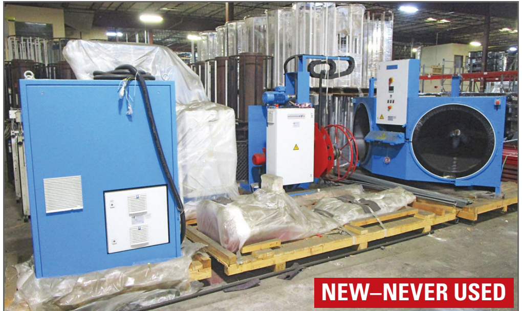
2016 HAGEN & FUNKE DUKA 800B HIGH-SPEED DUAL FLYER CONE PAYOFF

Complete Catalog & Information Available at https://perfection.global/barewire