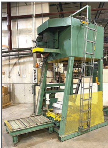
BONGARD STN-600 DOWN COILER