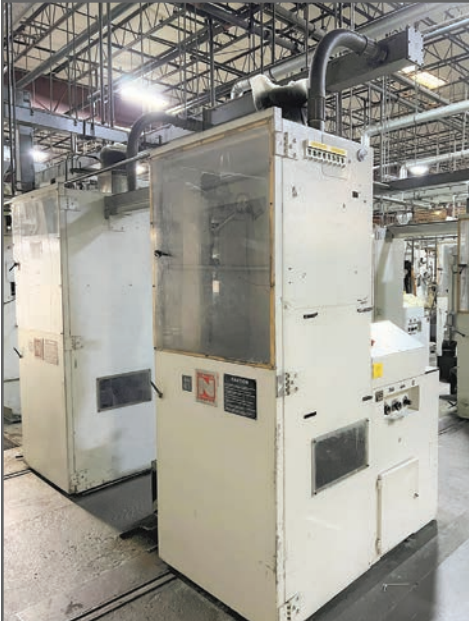
(2) NIEHOFF S500.2.F.3.E SPOOLERS