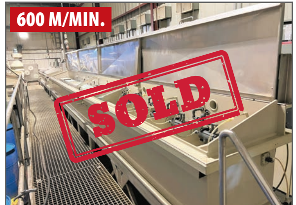
STEULER SILVER PLATING LINE