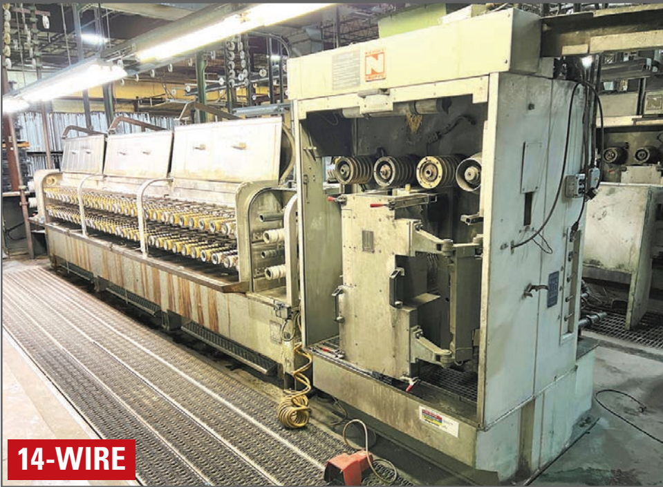
(1 OF 2) NIEHOFF MMH101 MULTIWIREDRAWING LINES