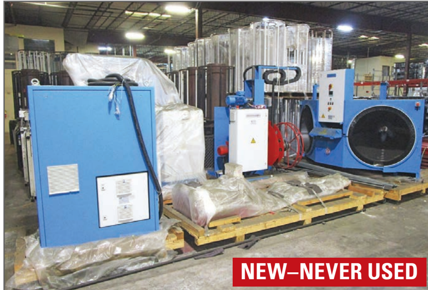
2016 HAGEN & FUNKE FLYER CONE PAYOFF

STEULER B400 DUAL WIRE TIN PLATING LINE , s/n NA, w/Max. Line Speed: 400 Meters/Min., 30" Dual Flyer Cone Payoff and Reel Trucks, Tension Stand, BONGARD STN-600 Down Coiler (TP1/2)