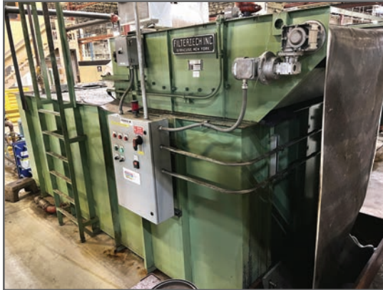
FILTER TECH PGF4-780 FILTRATION SYSTEM