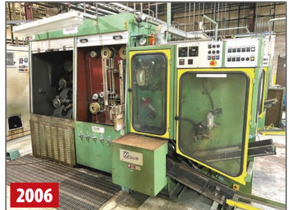
SAMP TR/3-SV SINGLE END DRAWER

Monday, April 11, from 8:30 AM to 4:30 PM ET, by Appointment Only