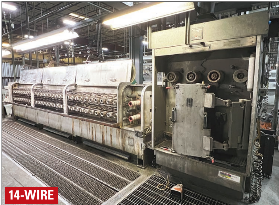
14-WIRE (1 OF 2) NIEHOFF MMH101 MULTIWIRE DRAWING LINES