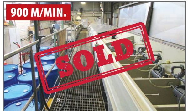
STEULER NICKEL PLATING LINE