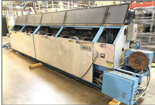
BARTELL B62 12-BAY TUBULAR STRANDER