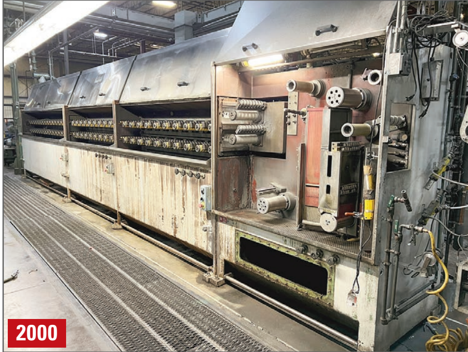
2000 SAMP MT6 MULTIWIRE DRAWING LINE

SICTRA ROD BREAKDOWN LINE , w/SICTRA 13-Die Rod Breakdown Drawer, In-Line Annealer, 22" Dual Spooler, BEKAERT ECC36 Down Coiler