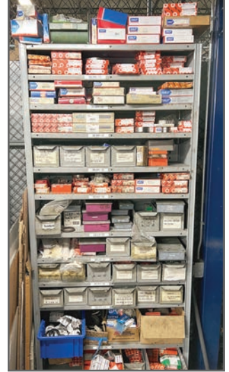
VIEW OF BEARINGS