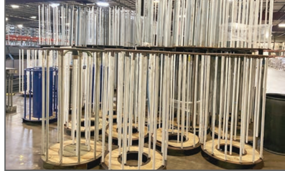
VIEW OF STEMS

(2) TRAILMOBILE 011A-1UAW DRY VAN TRAILERS, VIN 1PT011AJ5R9009537, 1PT011AJ7R9009538