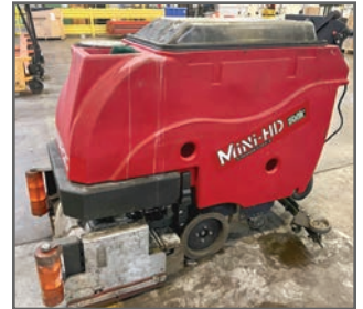
FACTORY CAT MINI-HD POWER SCRUBBER