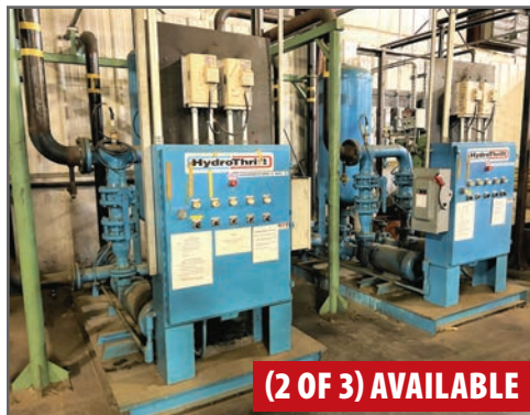
HYDROTHRIFT CE-260-65 COOLING SYSTEMS

Monday, April 11, from 8:30 AM to 4:30 PM ET, by Appointment Only