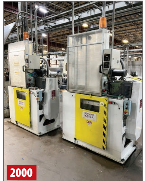
2000 (2) SAMP TE/63-N SPOOLERS

Complete Catalog & Information Available at https://perfection.global/barewire