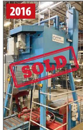
HUTTNER VD-650-SN-TT HIGH SPEED STATIC COILER