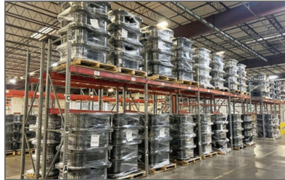
VIEW OF REELS