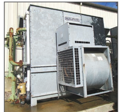
HYDROTHRIFT COOLING TOWER