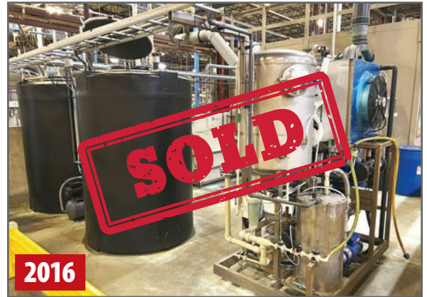
CANDOR CHEMICAL PROCESSING SYSTEM