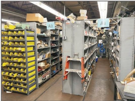
VIEW OF SPARES AND PARTS