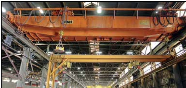
20 TON P & H BRIDGE CRANE – BAY 7 SOUTH