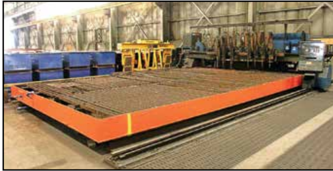
MESSER C4516 PLASMA AND FLAME CUTTING SYSTEM

A Series of Negotiated Sales & Online Auctions