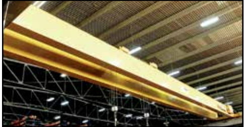
10 TON P & H - BAY 3 SOUTH