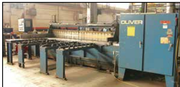
OLIVER 876 COLD SAW SYSTEM