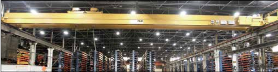
10 TON P & H - BAY 2 NORTH