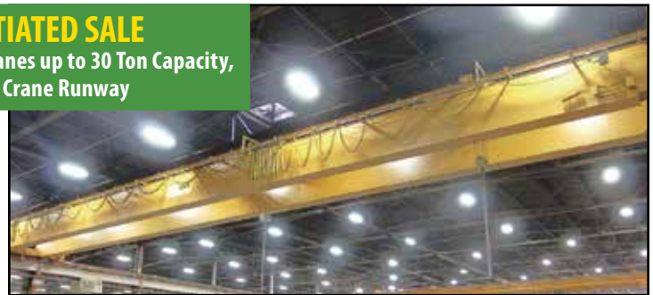
10 TON P & H – BAY 3 NORTH