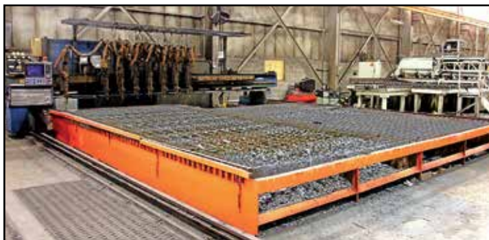
MESSER TMC4520 FLAME CUTTING SYSTEM