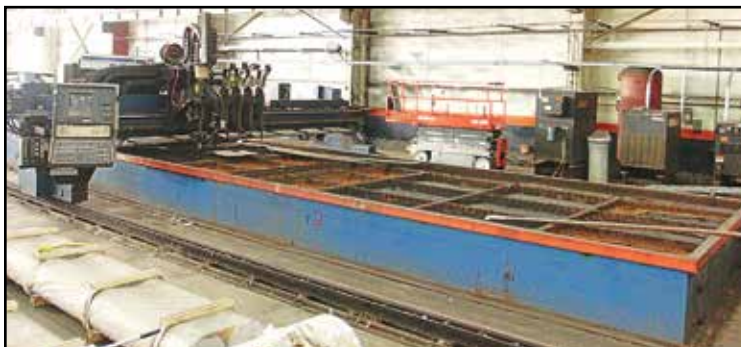
MESSER TMC4518 CNC PLASMA AND FLAME CUTTING SYSTEM