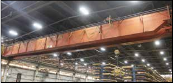
30 TON P & H - BAY 5