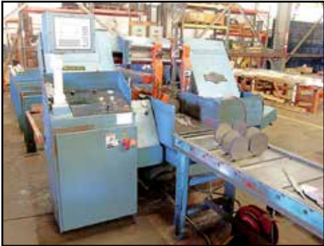
DOALL C-4100 HORIZONTAL BANDSAW