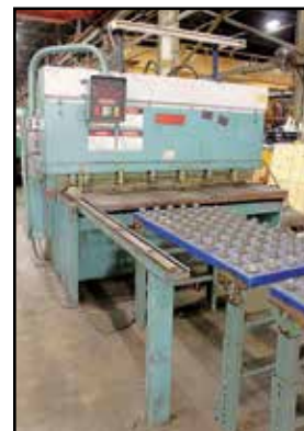
ALL STEEL SHEAR

Closing From: Wednesday, Dec. 2nd, 2015 at 1:00 PM CT