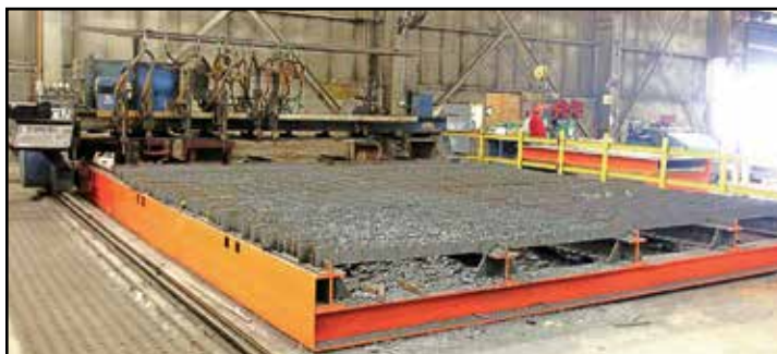
MESSER NC4520L FLAME CUTTING SYSTEM