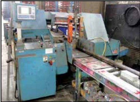
DOALL C-4100 HORIZONTAL BANDSAW