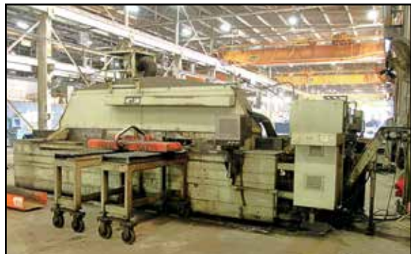
12' METLSAW COLD SAW

FEATURING: Bridge Cranes, CNC Plasma & Flame Cutting Systems, Tube Cut-Offs, Fab, Lifting Equipment & More