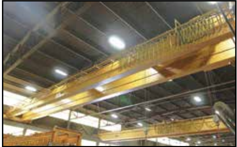
10 TON P & H - BAY 1 NORTH