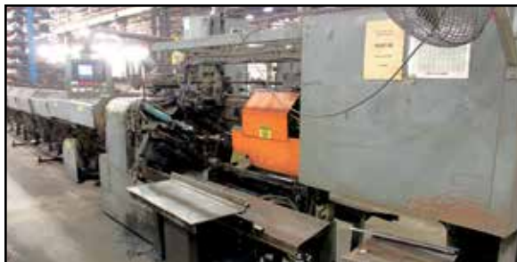
MODERN 8E TUBE CUT-OFF

OLIVER 876 Cold Saw System , s/n 207674, Oliver Quickpanel II Control