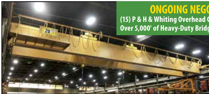
20 TON P & H – BAY 4 SOUTH

Horizontal Bandsaws, Single-Leg Gantry Cranes, Material Handling, Compressors & More