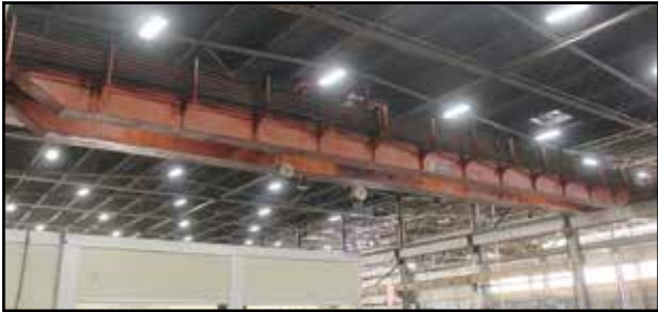
15 TON WHITING - BAY 5