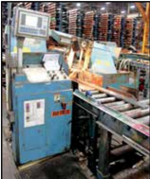
DOALL C-3300NC HORIZONTAL BANDSAW

Closing From: Wednesday, Jan. 13th, 2016 at 1:00 PM CT