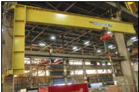
CONTRX JIB CRANE