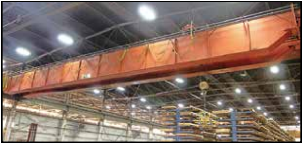
20 TON WHITING - BAY 5