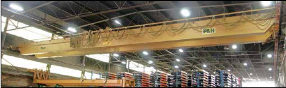
10 TON P & H - BAY 1 SOUTH