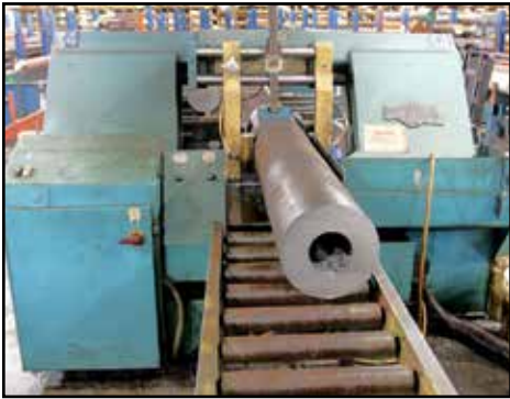
DOALL C-4100NC HORIZONTAL BANDSAW