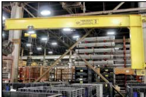
HEMPHILL CORP JIB CRANE