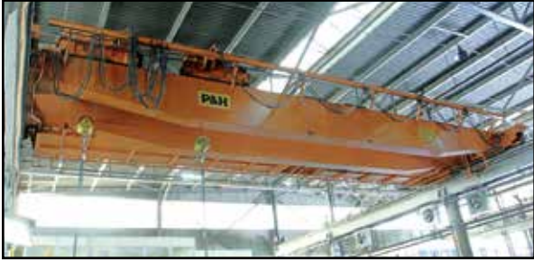
20 TON P & H - BAY 6 SOUTH