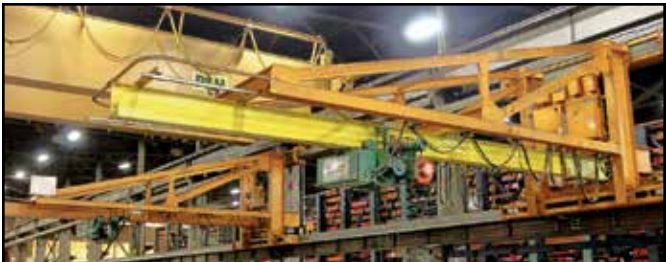
DUAL JIB CRANE SYSTEM

Closing From: Wednesday, Jan. 13th, 2016 at 1:00 PM CT