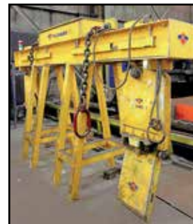
TECHNOMAGNETE TMTB2662 13,230-LB. MAGNET LIFTER