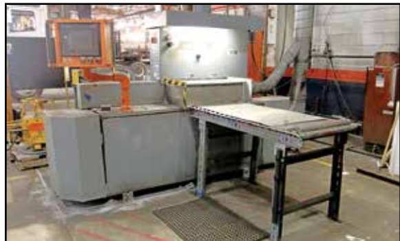
METLSAW CS2-T8 AUTO EXTRUSION SAW