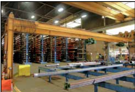
DUAL-HOIST SINGLE-LEG GANTRY CRANES