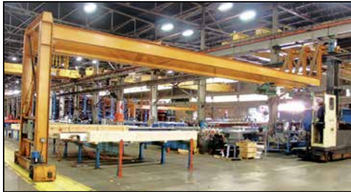
DUAL-HOIST SINGLE-LEG GANTRY CRANES