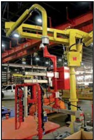
DALMAC MXC MANIPULATOR