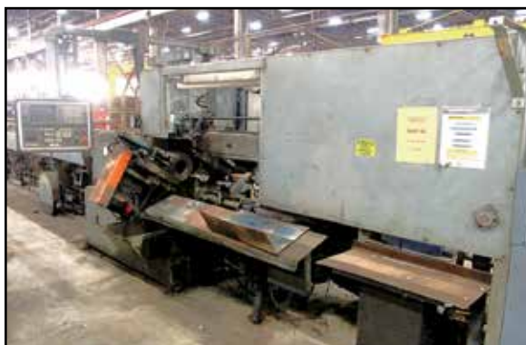
MODERN 8LNC CNC TUBE CUT-OFF