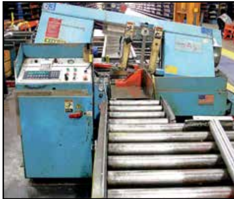
DOALL C-3300NC HORIZONTAL BANDSAW

Bridge Cranes, CNC Plasma & Flame Cutting Systems, Tube Cut-Offs, Fab, Lifting Equipment & More