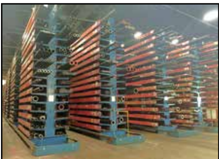
HEAVY-DUTY CANTILEVER RACKS

Heavy-Duty Cantilever Stock Racks More to be added including Side Loaders, Spotter Trucks, Lifting Equipment and Much More