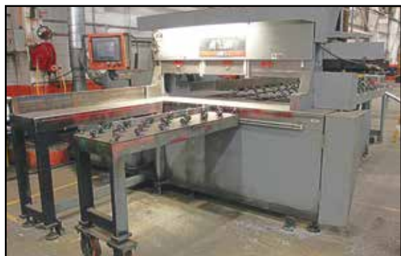
METLSAW CS2-T8 AUTO EXTRUSION SAW