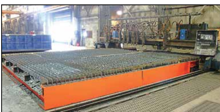
MESSER NC4520 FLAME CUTTING SYSTEM