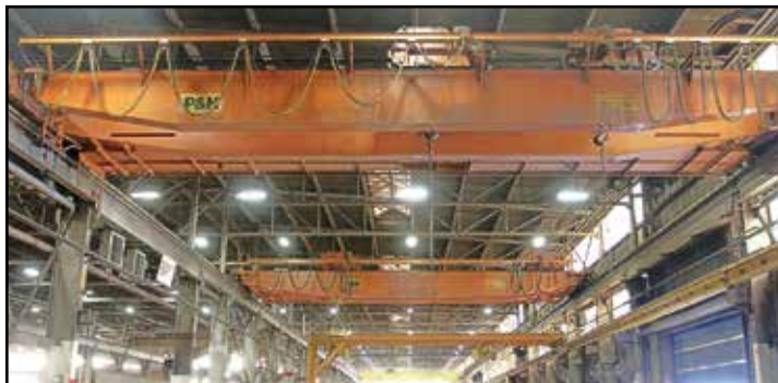
20 TON P & H BRIDGE CRANE – BAY 7 NORTH

Closing From: Wednesday, December 2nd, 2015 at 1:00 PM CT