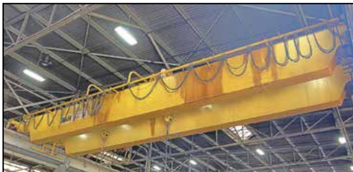
15 TON P & H BRIDGE CRANE – BAY 7