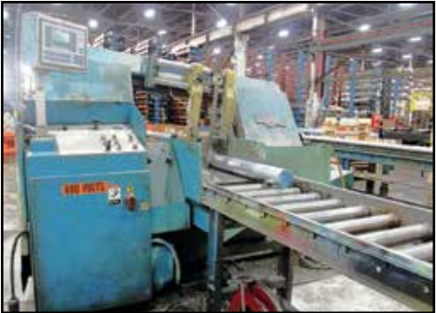
DOALL C-4100NC HORIZONTAL BANDSAW W/UPGRADED PLC