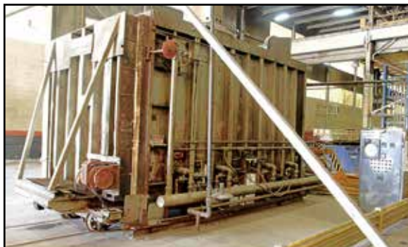
LINDBERG CAR BOTTOM FURNACE