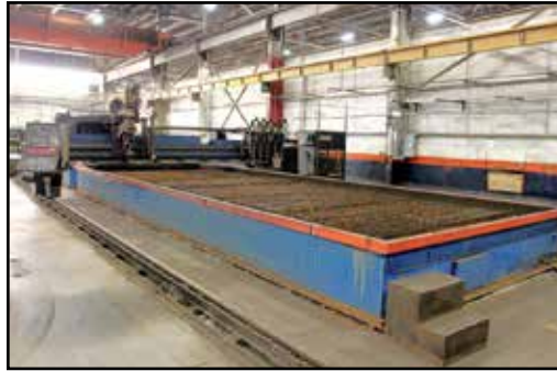
MESSER TMC4518 CNC PLASMA AND FLAME CUTTING SYSTEM