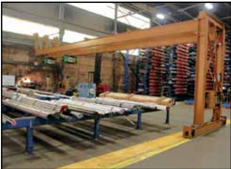
DUAL-HOIST SINGLE-LEG GANTRY CRANES

To discuss your requirements for an auction, please call Perfection Industrial 847.427.3333